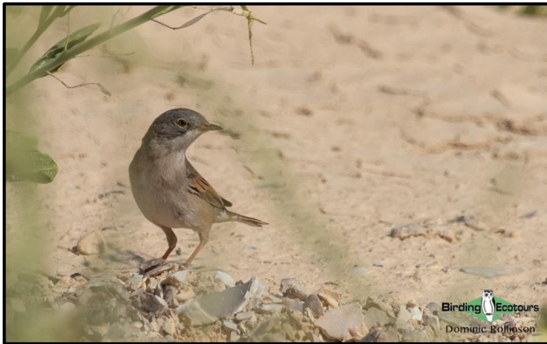
Migrants such as Common Whitethroat are present in good numbers on this tour.

Migratory passerines are also present here with Woodchat Shrike, Western Olivaceous Warbler, Melodious Warbler, Willow Warbler, Common Chiffchaff, Western Subalpine Warbler, Common Whitethroat, Common Nightingale, Western Yellow Wagtail, White Wagtail, Crested Lark, and Western Bonelli's Warbler being the most numerous species.