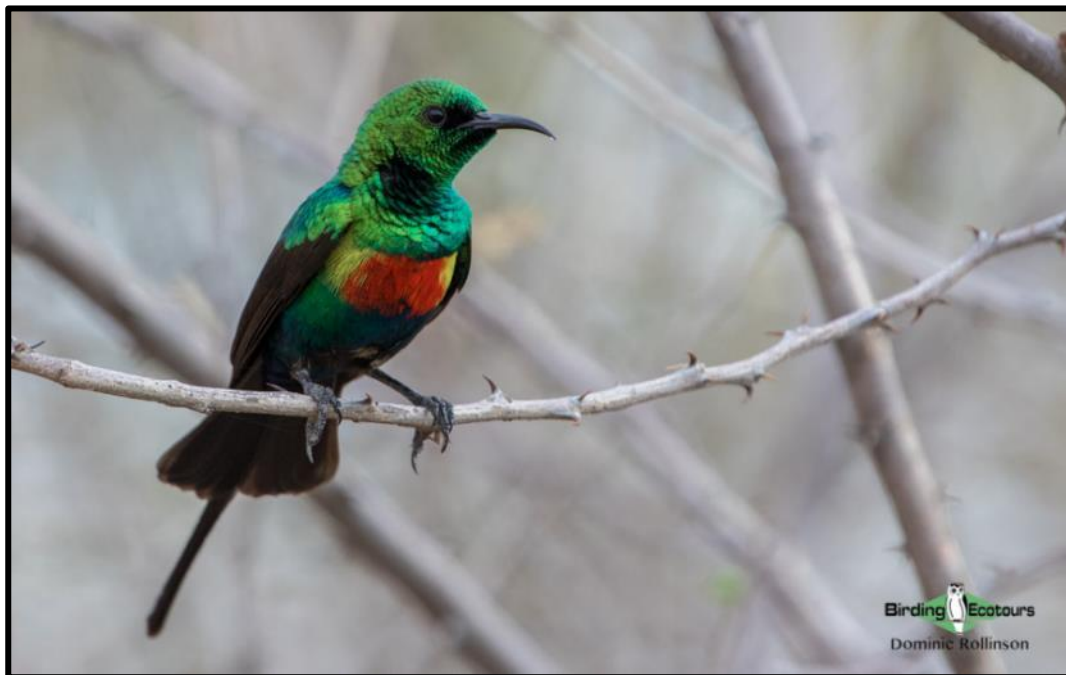
The aptly named Beautiful Sunbird occurs within the grounds of our hotel.

Welcome to The Gambia! Those of you from northern latitudes will know you are somewhere exotic and exciting as the instant heat hits when you step off the plane. You will be met at the airport by your Birding Ecotours tour leader and local Gambian birding guide. From here we will transfer you to The Gambia's most popular, and very comfortable hotel, The Senegambia Beach Hotel. After your long flight we would recommend relaxing, either by the numerous pools and bars, or in your room if you prefer to escape the heat for a while (though we know you will find it hard to resist getting started on the birding off your balcony as soon as you arrive!).