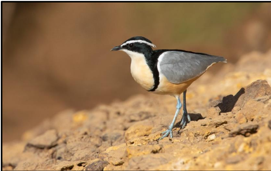
The prize of The Gambia is the beautiful Egyptian Plover . This is one of the most wanted birds on any trip to the country.

We will continue east along the Gambia River and further into the heartland of this amazing country, once again stopping en route to enjoy the birds of the interior. A small tributary near the village of Soma will be our first stop, where we should come across numerous exciting species. Once again, this is another opportunity to look for species we may have missed previously, or gain repeat views of others, with potential species including Spotted Thick-knee , Hadada Ibis , Egyptian Plover , Hamerkop , Black Heron , Rüppell's Vulture , Bateleur , Black Crowned Crane , Bronze-winged Courser , Northern Carmine Bee-eater , Black Coucal , and others. Continuing east we will explore more wetlands on the banks of the Gambia River where key species include African Pygmy Goose , Marabou Stork , Montagu's Harrier , African Fish Eagle , and Red-necked Falcon .