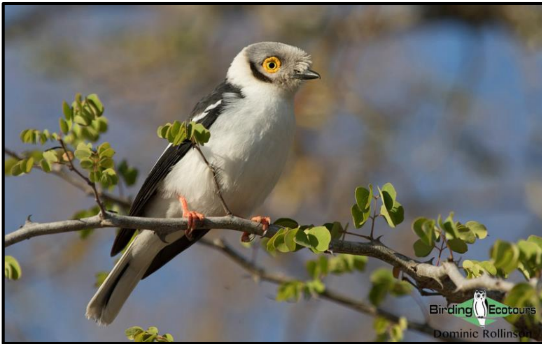
An incredibly exciting-looking bird, White-crested Helmetshrike.

Other highly desirable species seen here can include Hamerkop, Martial Eagle, Great Spotted Cuckoo, Northern White-faced Owl, Long-tailed Nightjar, African Pygmy Kingfisher, Levillant's Cuckoo, African Green Pigeon, White-throated Bee-eater, Brown-throated Wattle-eye, and White-crested Helmetshrike.