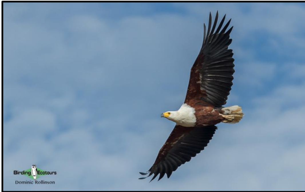
African Fish Eagle is one spectacular raptor!

Key species we will look for include Egyptian Plover , African Fish Eagle , African Finfoot , Swamp Flycatcher , Green Bee-eater , and Red-throated Bee-eater , plus numerous species of bird of prey.