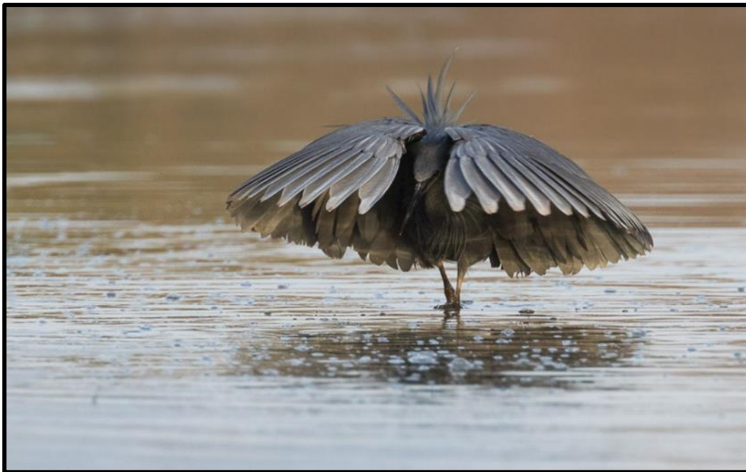
Black Heron is also known as the “Nighttime Daytime Bird”!

There are many great wetlands, and therefore fantastic wetland birding, around Marakissa, and these can hold a wide range of species associated with this habitat. Standout species here include Black Crake , Giant Kingfisher , Striated Heron , Hamerkop (a unique, monotypic family), Dwarf Bittern , and Black-headed Heron , while the neighboring open areas hold good numbers of Abyssinian Roller , Blue-bellied Roller (a stunner!), Senegal Parrot , Yellow-billed Shrike , Piapiac , numerous sunbirds and flocks of Estrildid finches.