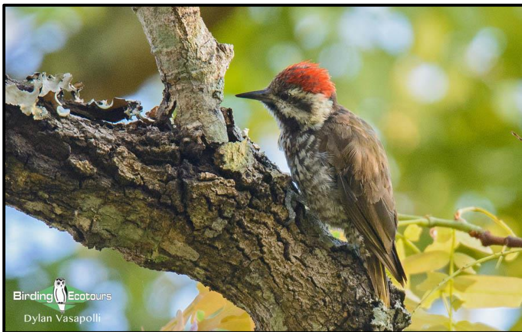
Stierling’s Woodpecker is one of our core targets at Dzalanyama.

Miombo woodland is a unique woodland dominated by brachystegia tree species, and supports a very specific suite of birds, virtually restricted to this woodland – many of which have ‘miombo’ in their name. The birding here is very exciting, with the birds often occurring in ‘feeding parties’, and after finding one, the birds come in thick and fast. Dzalanyama is one of the best places anywhere for the localized Stierling’s Woodpecker , and this will be one of our main targets. Whilst traversing the woodlands, we will be trying for many other miombo specials, such as Pale-billed Hornbill , Whyte’s and Miombo Pied Barbets , White-breasted Cuckooshrike , Souza’s Shrike , Rufous-bellied and Miombo Tits , Red-capped Crombec , Yellow-bellied and Southern Hyliotas , the prized African Spotted Creeper , Miombo Blue-eared Starling , Miombo Scrub Robin , the inconspicuous Böhm’s Flycatcher , Miombo Rock Thrush , the stunning Anchieta’s Sunbird , Wood Pipit , Reichard’s and Black-eared Seedeaters and Cabanis’s Bunting .