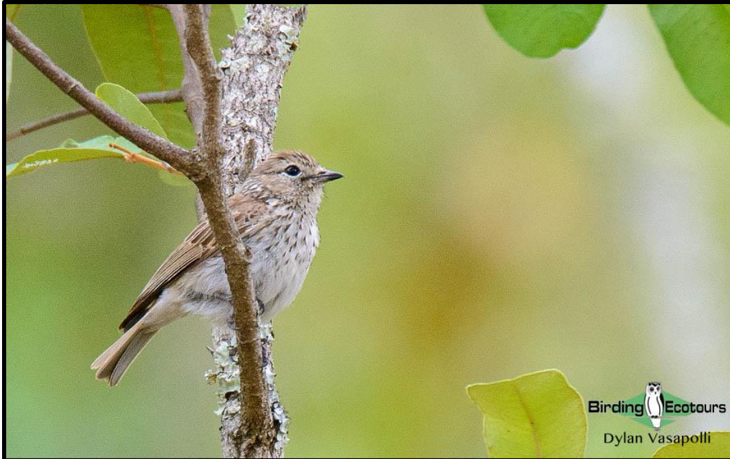
Böhm's Flycatcher is a scarce and easily missed special of the miombo woodlands.