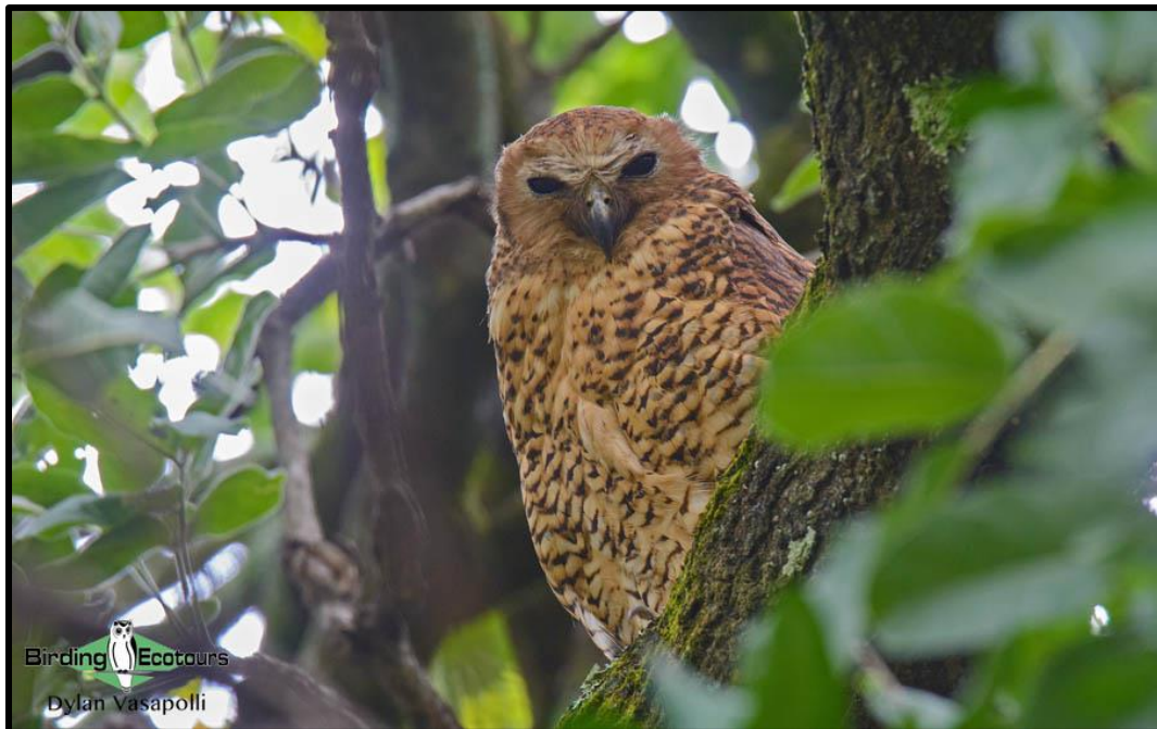
Liwonde is a great place to find the highly sought-after Pel's Fishing Owl .

We have a final morning available on Zomba Mountain to try and find any species that we may still be searching for – which might include the tricky and difficult to see Thyolo Alethe and White-winged Apalis . We will then transfer to our next destination – Liwonde National Park, which is fortunately nearby. Liwonde is a very biodiverse area, supporting a wealth of birdlife and a wide range of Africa's megafauna. Our time here will be spent exploring the park with a mix of game drives, boat cruises and bush walks. While the birds and birding will be our main focus, we'll also keep an eye out for all of Africa's megafauna and certainly won't be ignoring them. Indeed, we find that while looking for birds, we come across a wide range of mammals in the process. Although our bird list will grow handsomely here with a wide range of species possible, there are various target species we'll be specifically looking for. The riverine woodlands hold the sought-after Pel's Fishing Owl , Green Malkoha , Brown-breasted Barbet , Böhm's Bee-eater , Livingstone's Flycatcher and Collared Palm Thrush , with Lilian's Lovebird being more widely distributed throughout the wooded areas of the park. White-backed Night Heron is another important target here, occurring in the over-hanging river vegetation.