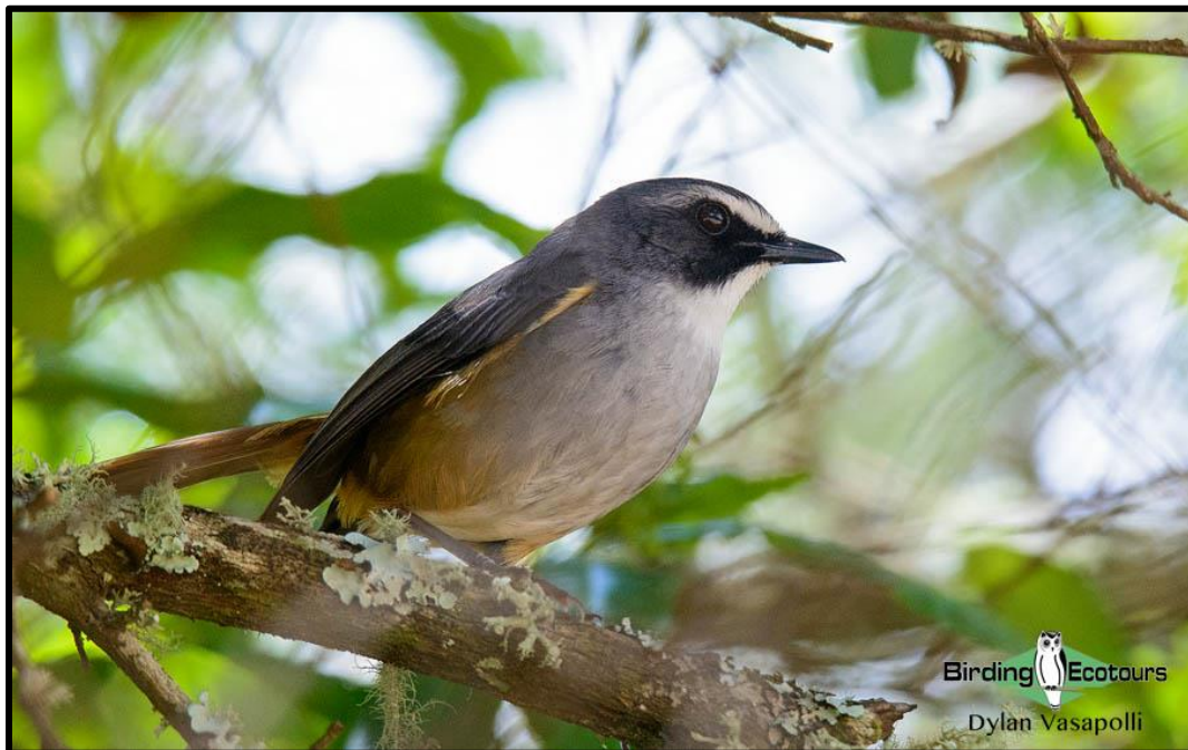
Olive-flanked Ground Robin is a skulker of the Nyika highlands.

in the grass. Localized Black-lored and Churring Cisticolas are common, as are Montane Widowbirds as they display over the grasslands. Mountain Yellow Warbler , Cinnamon Bracken Warbler , Rwenzori Double-collared Sunbird (formerly its own unique species, Whyte's Double-collared Sunbird), Baglafaecht Weaver , Yellow-crowned Canary and the scarce Yellow-browed Seedeater are specialists of areas with rank growth. All the while, good numbers of the stunning (and Endangered) Blue Swallow flit over the grasslands. Stands of proteas support small populations of the prized Scarlet-tufted Sunbird , often alongside Malachite and Bronzy Sunbirds . We'll search for Montane Nightjar in these areas after dark. While raptors are not at their most abundant here, numbers of the elegant Pallid Harrier frequent the grasslands, and we should also keep an eye out for the likes of Rufous-breasted Sparrowhawk and Augur Buzzard .