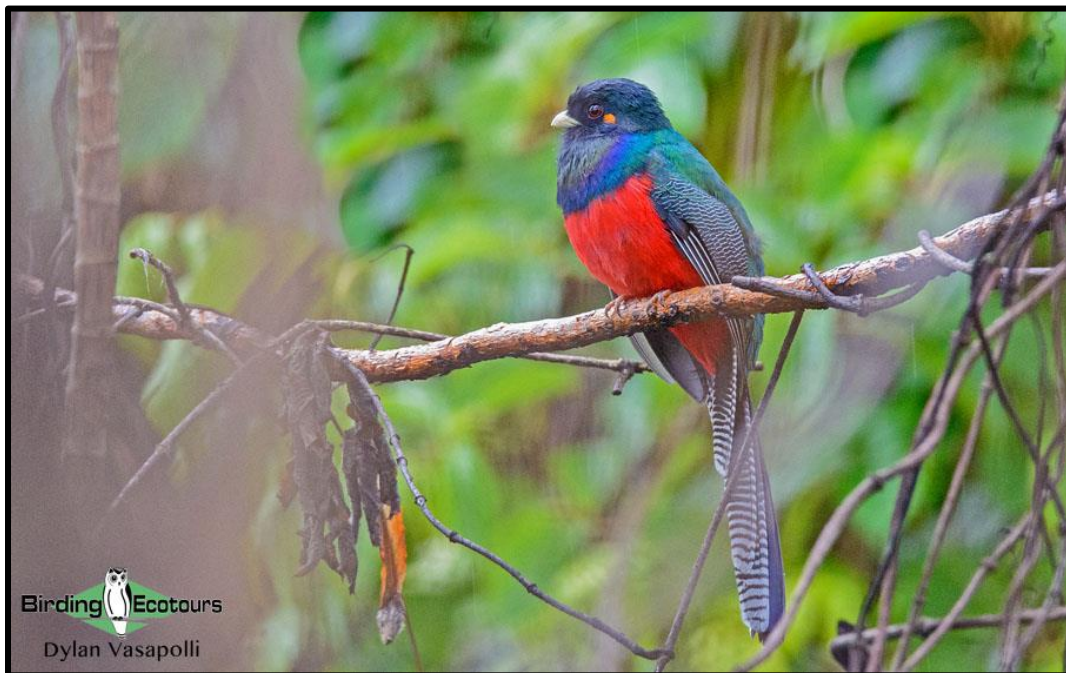
Bar-tailed Trogon can be reliably sought in the Nyika forests.

Next, we visit Dzalanyama Forest Reserve for its miombo woodland. This distinctive south-central African habitat supports a host of species largely confined to miombo woodland, including the highly localized Stierling's Woodpecker , Miombo Tit and Anchieta's Sunbird . Bypassing the capital city, our journey culminates in the breathtaking Nyika National Park in the far north of the country. We spend several days exploring its remarkable landscapes and avifauna in what is undoubtedly one of Africa's best-kept secrets and a favorite destination among our guides and guests alike. Here we search for a great many species, including localized birds such as Sharpe's Akalat and Yellow-browed Seedeater , to others like Olive-flanked Ground Robin , Bar-tailed Trogon , White-headed Saw-wing , Blue Swallow and Scarlet-tufted Sunbird , along with a host of others. A few strategic stops on the return journey allow us to look for further tough birds like Babbling Starling and East Coast Akalat , among others.