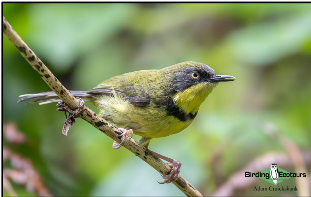
Yellow-throated Apalis is Malawi's only endemic bird, and should be seen around Zomba.

Our comprehensive tour covers the length of Malawi, taking in all the necessary and key localities needed to ensure we have a chance of finding all the country's many specials. Additionally, several of the excellent National Parks we visit also host almost all of Africa's megafauna – of which such characteristic species as African Elephant and Hippopotamus should easily be seen.