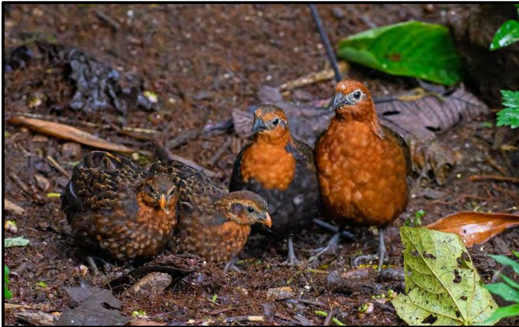
We will look for a family of Chestnut Wood Quails in Reserva La Florida.

This trip provides the opportunity to travel across Colombia along a completely different route compared to our classic itinerary above. We'll start the trip in the city of Cali, and after visiting a new private reserve, where we should get excellent views of two Colombian endemics, Chestnut Wood Quail and Multicolored Tanager as they regularly visit bird feeders here, we'll then travel south to Nariño and Putumayo states to enjoy further unique birding experiences.