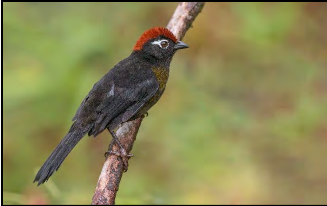
We'll look for the rare White-rimmed Brushfinch along the Trampolin Road.