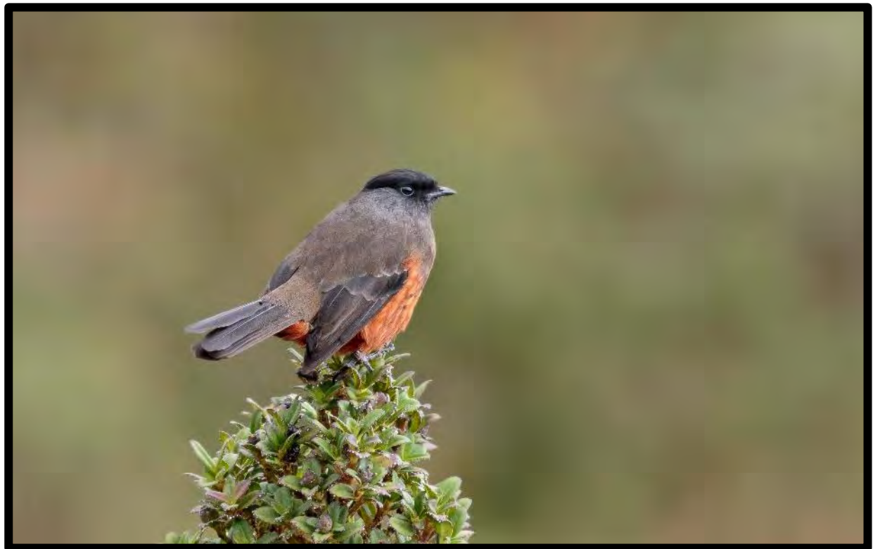
The poorly known and incredibly localized Chestnut-bellied Cotinga.