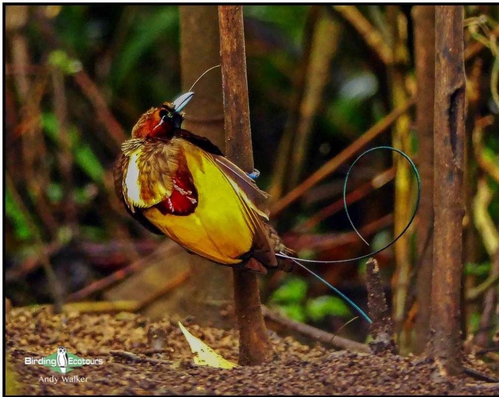
Magnificent Bird-of-paradise may be seen in the Arfak Mountains.

Around our village base in the mid-elevation zone we will look for Magnificent Bird-of-paradise which may be seen on his court, displaying, in sequence his iridescent, carmine back, dark-green breast shield, and sulfur-yellow cape before jerkily dancing up and down a vertical sapling, while quivering his cocked, sickle-shaped central tail feathers.