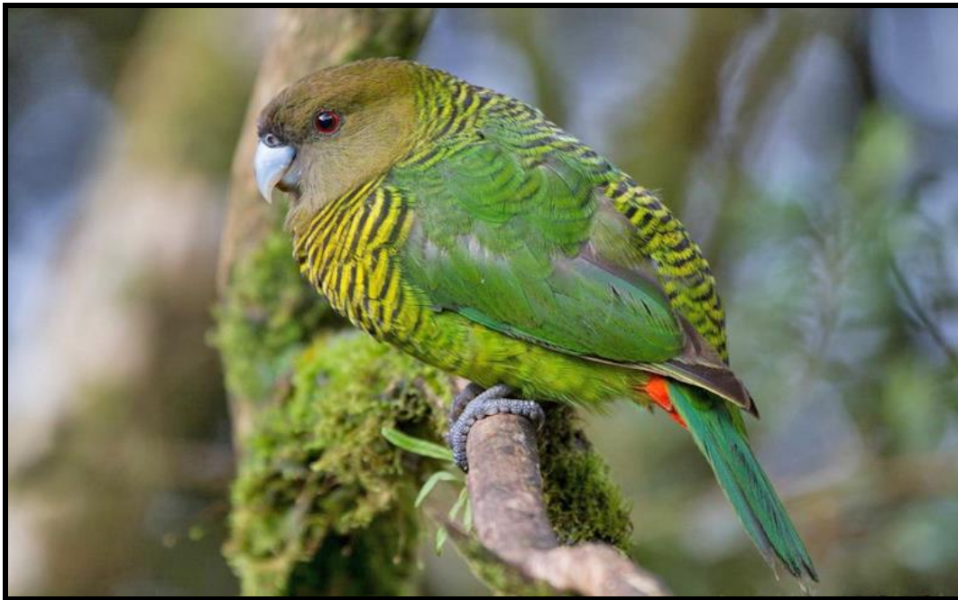
Brehm's Tiger Parrot is a possibility in the higher elevations of the Arfaks.

Overnight: Arfak Mountains (two nights mid-elevation and one night high-elevation)