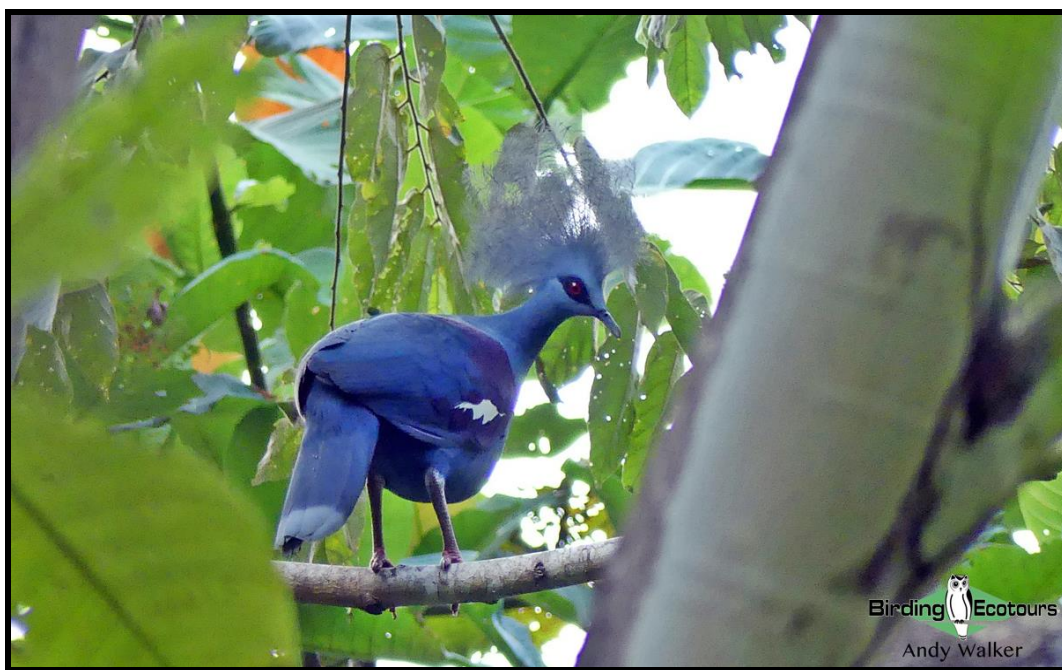
A huge bird, Western Crowned Pigeon is sure to impress on Waigeo.

The second leg of our tour takes us to Sorong, on the opposite side of the Bird's Head Peninsula where we might find King Bird-of-paradise , Magnificent Riflebird , Red-breasted Paradise Kingfisher , and Blue-black Kingfisher , and then to one of the Raja Ampat Islands, Waigeo. Here we will search for endemic Wilson's Bird-of-paradise , Red Bird-of-paradise , and Glossy-mantled Manucode . Wilson's Bird-of-paradise is often considered one of the best-looking birds on the planet, and so we will look forward to making our own judgments on this. Again, there are numerous other species high on our 'wanted' list, including Western Crowned Pigeon (a seriously impressive bird that will rival the birds-of-paradise for 'bird of the trip' if we find them), plus the likes of Hook-billed Kingfisher , Rufous-bellied Kookaburra , Yellow-billed Kingfisher , Papuan Dwarf Kingfisher , Common Paradise Kingfisher , Beach Kingfisher , Papuan Hawk-Owl , Marbled Frogmouth , Papuan Frogmouth , Palm Cockatoo , Eclectus Parrot , Great-billed Parrot , Raja Ampat Pitohui , Hooded Pitta , Papuan Pitta , and Brown-headed Crow .