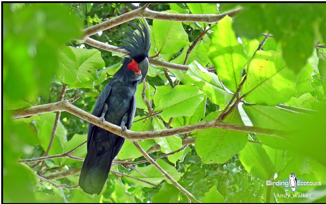
The rather large Palm Cockatoo can often be found around our accommodation.