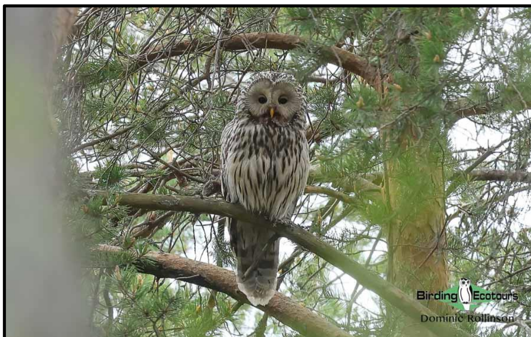
The massive Ural Owl will hopefully be another highlight of our time around Oulu.

On the opposite end of the size spectrum, we have the bulky Ural Owl and Great Grey Owl . Their large size, however, makes them no more straightforward to find, but we stand a good chance of connecting with both species, thanks to the knowledge of our expert local guides. We will dedicate many hours to finding these two iconic species. While birding here, we have an outside chance of seeing Eurasian Eagle-Owl ; however, due to their tendency to be disturbed at breeding sites, we will need to locate roosting birds – no easy task! The owls will be our primary focus, but the forests here are home to several other avian delights. We will keep an eye out for taiga forest specials such as Black Woodpecker , Eurasian Three-toed Woodpecker , Lesser Spotted Woodpecker , Grey-headed Woodpecker , and perhaps Eurasian Goshawk as we explore the forest trails.