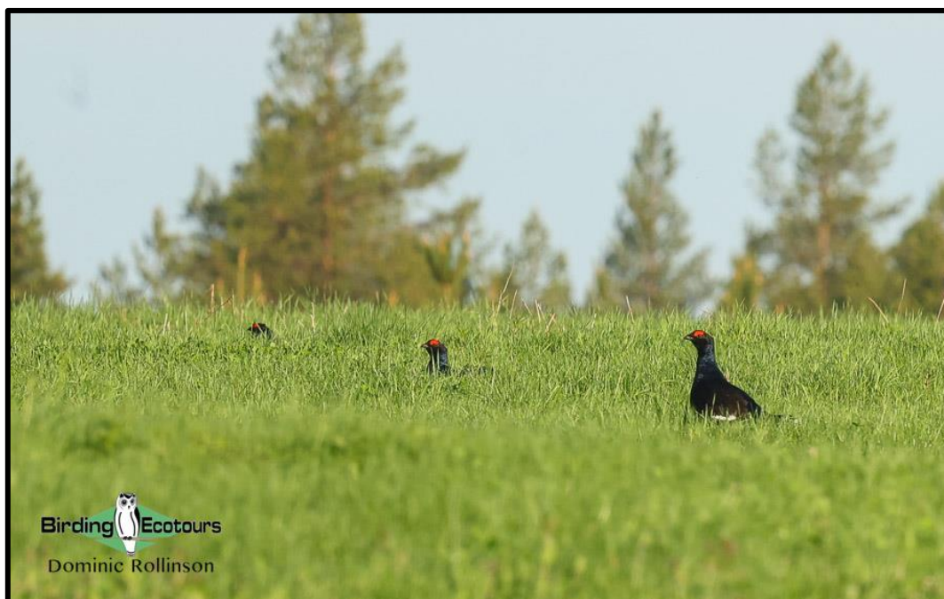
The striking Black Grouse may be seen in forest clearings near Kuusamo.

We won't forget about the owls though, and one of our other big targets around Kuusamo is the impressive Northern Hawk-Owl – a species often seen on roadside wires and fence posts as it scans for prey. Luckily, this is one of the world's few solely diurnal owl species, making it easier to find than other owl targets on this tour. Wetlands and lakes around Kuusamo should provide us with species not seen near Oulu, like Red-necked Grebe , Spotted Redshank , and perhaps Jack Snipe . The forests close to town will give us additional chances at Northern Hawk-Owl , plus Western Capercaillie , Black Grouse , and Hazel Grouse .