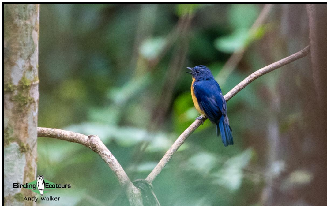
Dayak Blue Flycatcher gave us some nice views as it sang in the valley below us.

The morning continued to deliver good views of great birds, including family parties of Dusky Broadbills and Olive-backed Woodpeckers and some work inside the forest gave us excellent views (eventually) of Black-throated Wren-Babbler and male Dayak Blue Flycatcher . With that it was time to head down the mountain for lunch and a siesta during the heat of the day.