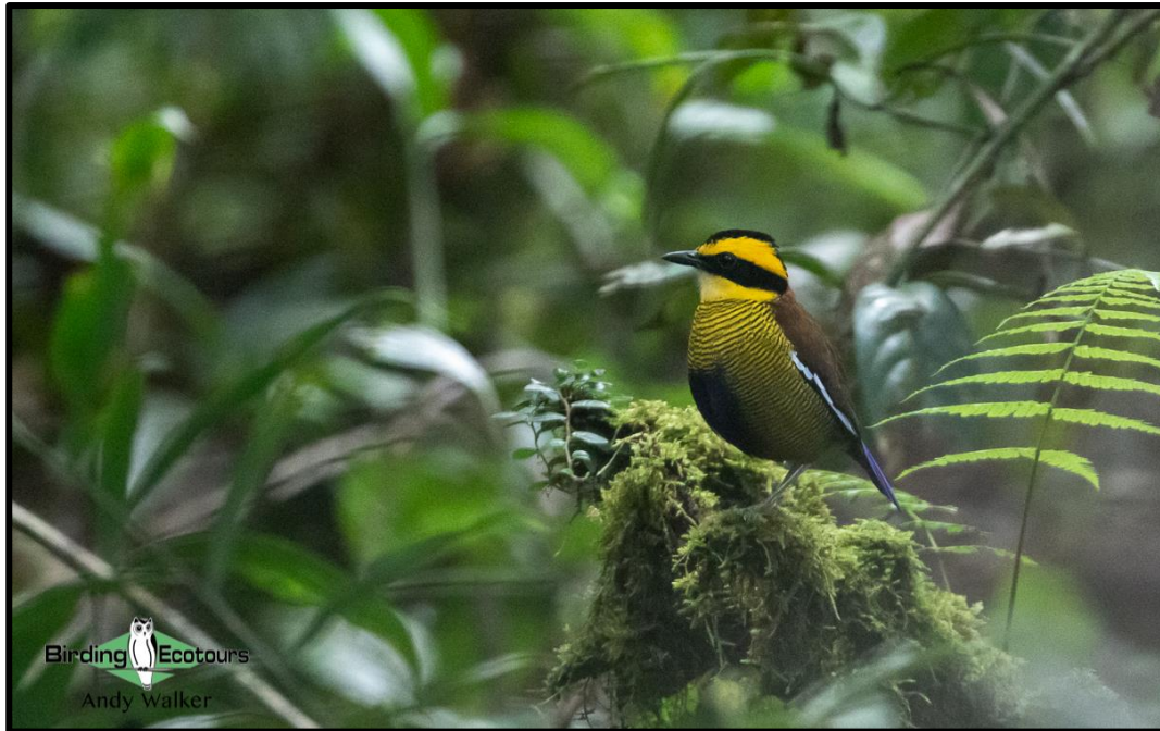
This male Bornean Banded Pitta looked glorious in its forest setting.

During the afternoon birding session, we retraced some of the morning birding spots. As we stood outside our campsite area getting ready to leave, we had a rather showy Banded Bay Cuckoo pay us a visit, and Crested Jayshrikes were vocal but remained out of sight (we'd had great views of this species already so that was no problem).