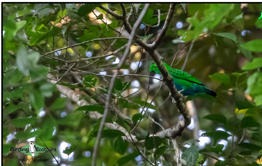
A record shot of the male Hose's Broadbill that occasionally gave some good views but was, typically, rather shy.