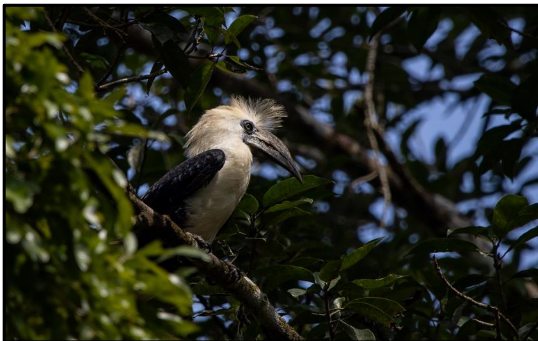
A group of four White-crowned Hornbills were feeding in a fruiting tree and we were lucky to get some good views of this Endangered ( BirdLife International ) species.