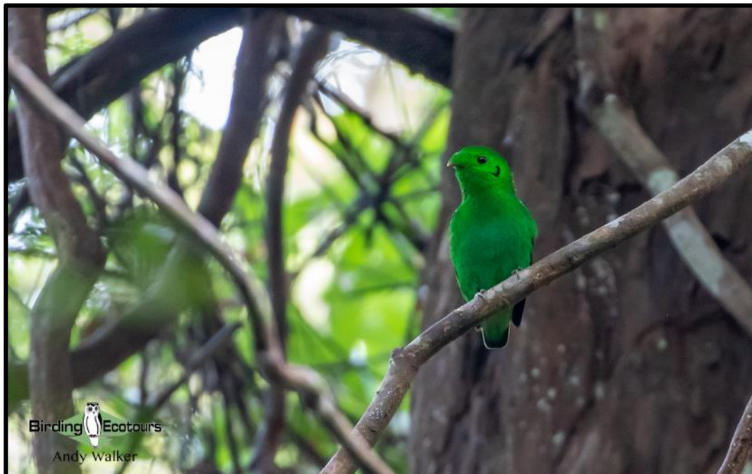
This male Green Broadbill put on quite the show for us during our early morning birding.

As we walked a forest road we found Ferruginous Babbler, Moustached Babbler, Cream-vented Bulbul, Puff-backed Bulbul, Olive-winged Bulbul, Ochraceous Bulbul, Spectacled Bulbul, Crow-billed Drongo, Vernal Hanging Parrot, Crested Goshawk, Crested Honey Buzzard, Common Hill Myna, Sooty Barbet, Blue-eared Barbet, and Black-and-yellow Broadbill. Some alarm calling attracted a range of species, including Crimson-breasted Flowerpecker, Yellow-vented Flowerpecker, Van Hasselt's Sunbird, Red-throated Sunbird, Grey-breasted Spiderhunter, Blyth's Paradise Flycatcher, Black-naped Monarch, and Chinese Blue Flycatcher.