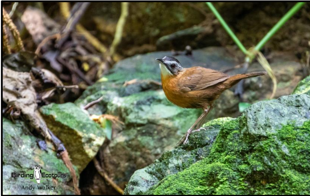
The bird blind (bird hide) we visited for an afternoon was a great spot for watching secretive species of bulbuls and babblers, including this Malayan Black-capped Babbler .

In the afternoon we had an enjoyable session in a bird blind (bird hide) at a nearby waterhole. Birds came through frequently and we got great close views of many species, including Rufous-chested Flycatcher , Blyth's Paradise Flycatcher , Black-naped Monarch , Common Emerald Dove , Olive (Baker's) Bulbul , Spectacled Bulbul , Stripe-throated Bulbul , Ochraceous Bulbul , Asian Red-eyed Bulbul , White-rumped Shama , Chestnut-winged Babbler , and Malayan Black-capped Babbler . Some of the group also saw Rufous Piculet and Rufous-tailed Tailorbird . Our time in the blind/hide rounded off a long but fun day of Thai birding.