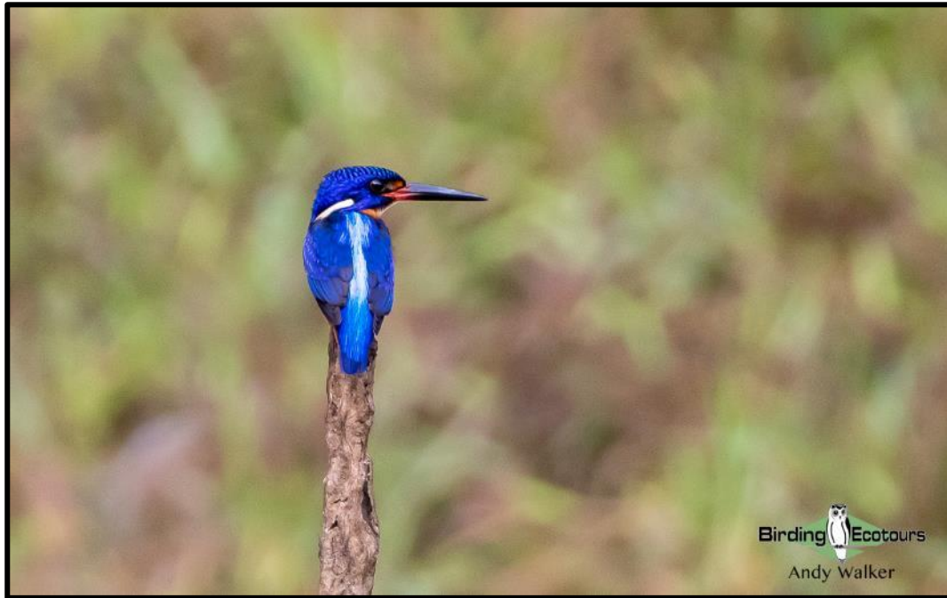
Point blank views of Blue-eared Kingfisher provided an early morning highlight.

view before perching out in the open, as did the much smaller Oriental Pied Hornbill . We had prolonged views of a stunning Blue-eared Kingfisher that allowed a close approach and similar views of the equally attractive Black-capped Kingfisher as well.