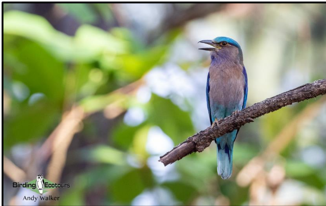
An extremely confiding Indochinese Roller provided one of the highlights of the afternoon.

Late in the afternoon we visited an interesting rice field nature reserve where we found our main target with ease and in good numbers, Knob-billed Duck . Here we also improved our views of many of the birds seen in the morning (such as close Cotton Pygmy Geese and Indochinese Roller ) and added a few new ones for everyone, such as Oriental Darter , Black-winged Stilt , Baya Weaver , and the very localized (in southern Thailand) Asian Golden Weaver . We also had a soaring pair of locally uncommon Painted Storks and several Grey Herons during our journey.