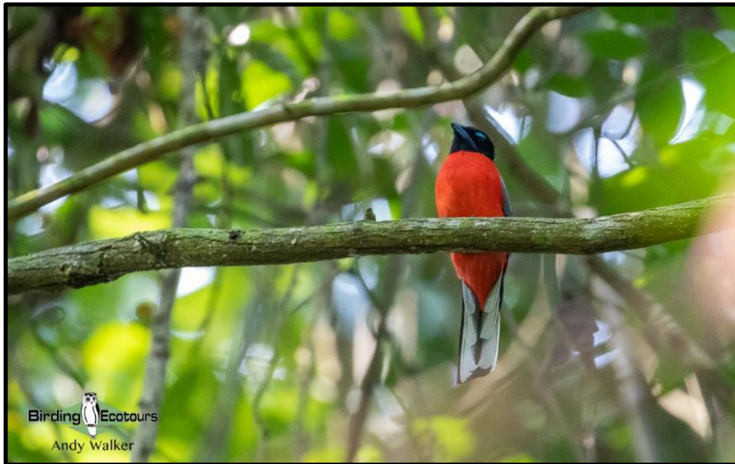
The spectacular Scarlet-rumped Trogon gave some incredible low-level views.

Black-browed Reed Warbler, Yellow-bellied Prinia, Brown Shrike, Yellow Bittern, Purple Heron, Intermediate Egret, Asian Openbill, Oriental Pratincole, and Whiskered Tern.