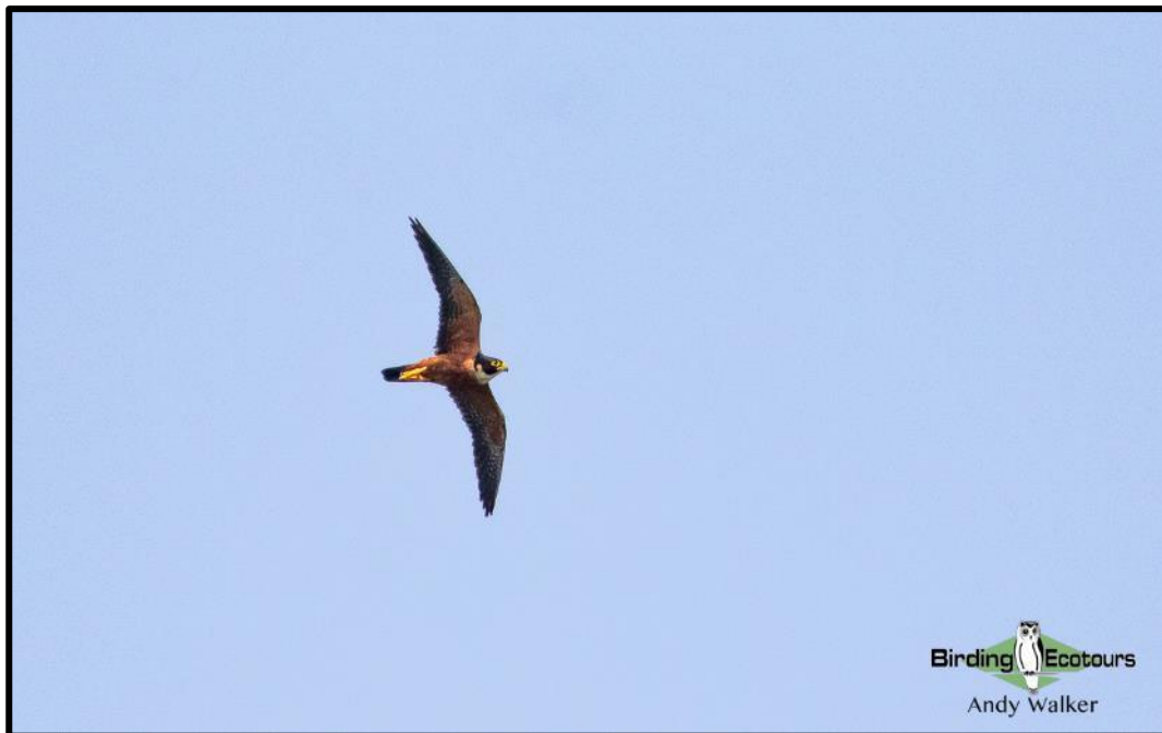
This male Oriental Hobby was displaying to a nearby female, and the pair gave excellent views.