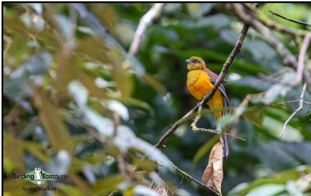
The attractive Orange-breasted Trogon showed well for us at close range.

As we walked into the forest, we picked up Blyth's Hawk-Eagle , Crested Serpent Eagle , Orange-breasted Trogon (a very showy male), Crimson Sunbird , Yellow-bellied Bulbul , Square-tailed Drongo-Cuckoo , White-bellied Erpornis , and Bar-winged Flycatcher-shrike .