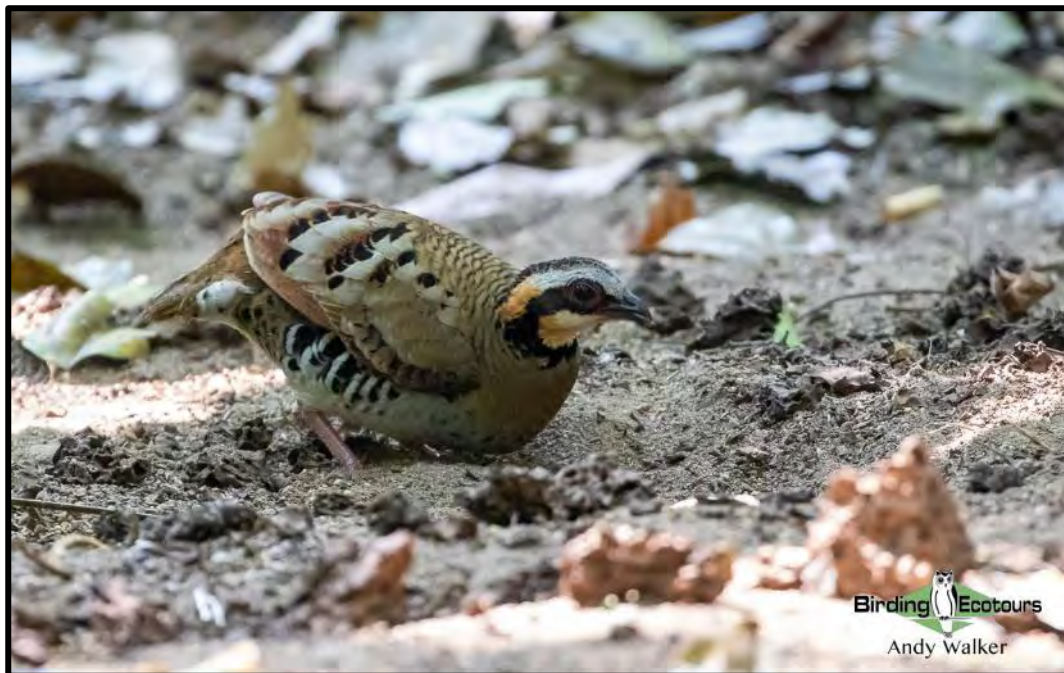
The rarely seen Orange-necked Partridge gave some fantastic views.

We recorded 277 bird species (14 heard only) during the tour, the trip list follows the report. The tour highlights included a long list of endemic, near-endemic, and special birds. Some of the non-passerine highlights included Orange-necked Partridge , Germain's Peacock-Pheasant , Green Peafowl , Siamese Fireback , Great Eared Nightjar , Collared Owlet , Blue-bearded Bee-eater , Banded Kingfisher , Red-vented Barbet , Indochinese Barbet , Necklaced Barbet , Black-and-buff Woodpecker , White-bellied Woodpecker , and Collared Falconet .