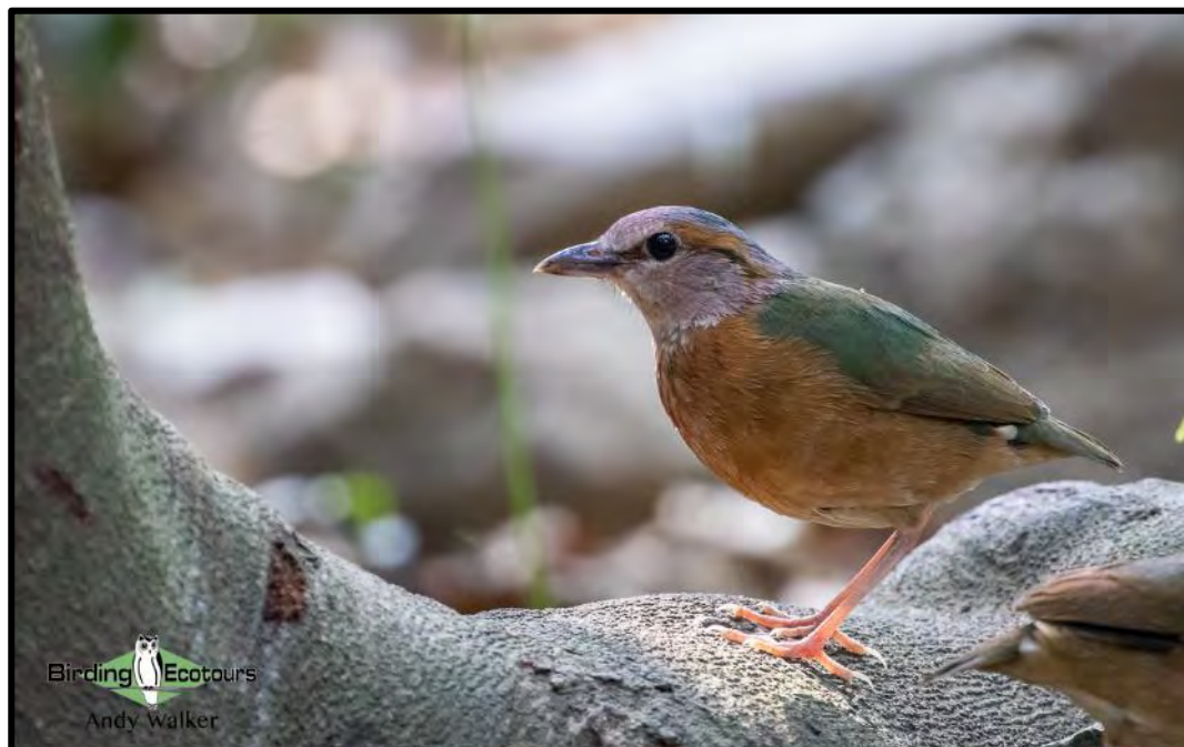
A pair of Blue-rumped Pittas gave prolonged views.

After lunch we visited another blind/hide with a different set of birds. We were again richly rewarded, with great views of the tough Orange-necked Partridge and a pair of Blue-rumped Pittas . The area was very busy, and we enjoyed prolonged views of White-throated Rock Thrush , Buff-breasted Babbler , Puff-throated Babbler , Stripe-throated Bulbul , Pale-legged Leaf Warbler , Greater Coucal , and several of the species also seen in the morning. After our afternoon birding session, we completed our journey to Cat Tien National Park. We arrived just as the sun was setting and checked into our accommodation within the national park.