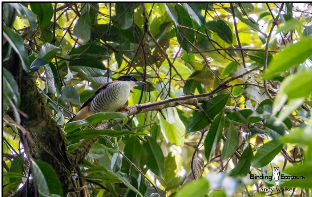
We found the rarely seen hoae subspecies of Vietnamese Cutia in Ngoc Linh Nature Reserve.