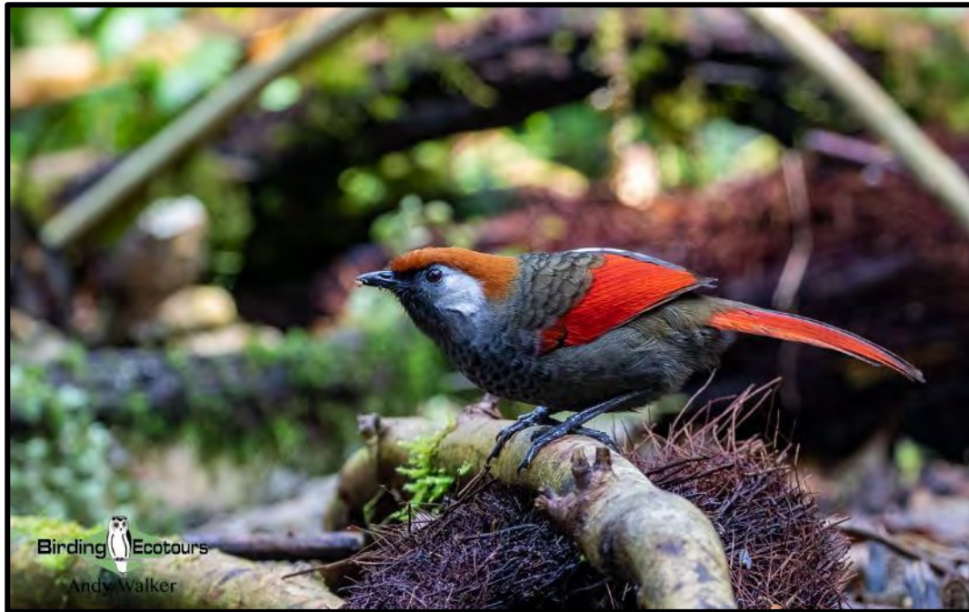
The magnificent Red-tailed Laughingthrush put on quite the show for us.

Rufous-gorgeted Flycatcher , and Snowy-browed Flycatcher . Our first major target bird came in quite quickly, and what an absolute belter – Red-tailed Laughingthrush . A single individual came in and spent quite a while on show for us, just incredible.