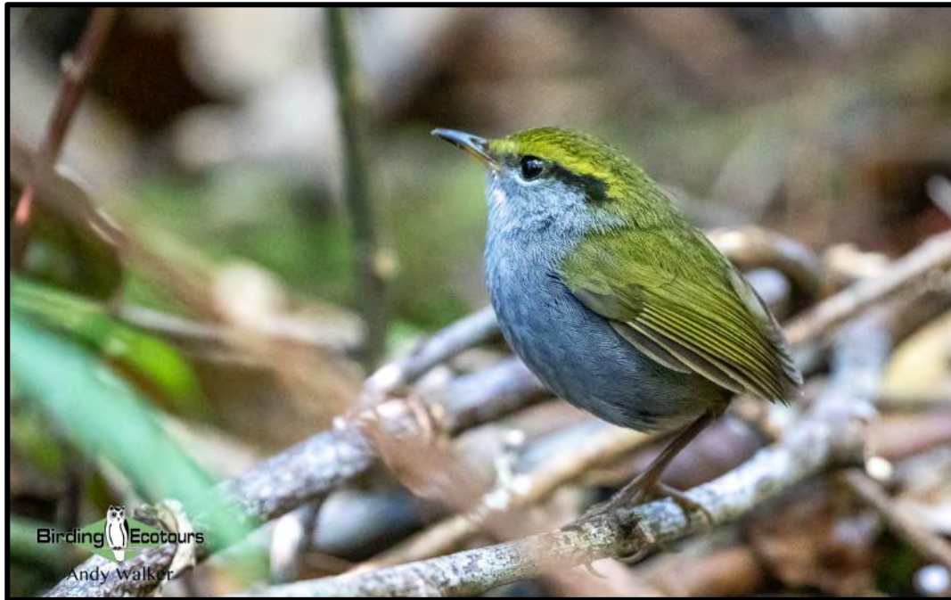
The tiny, golf-ball-sized, and secretive Grey-bellied Tesia gave astounding views out in the open.

to more great views of tough birds, such as Streaked (Annam) Wren-Babbler , Rufous-browed Flycatcher , Lesser (Langbian) Shortwing , and others. A Large Hawk-Cuckoo even put in a brief appearance, as did Grey-cheeked Warbler and Rufous-capped Babbler .