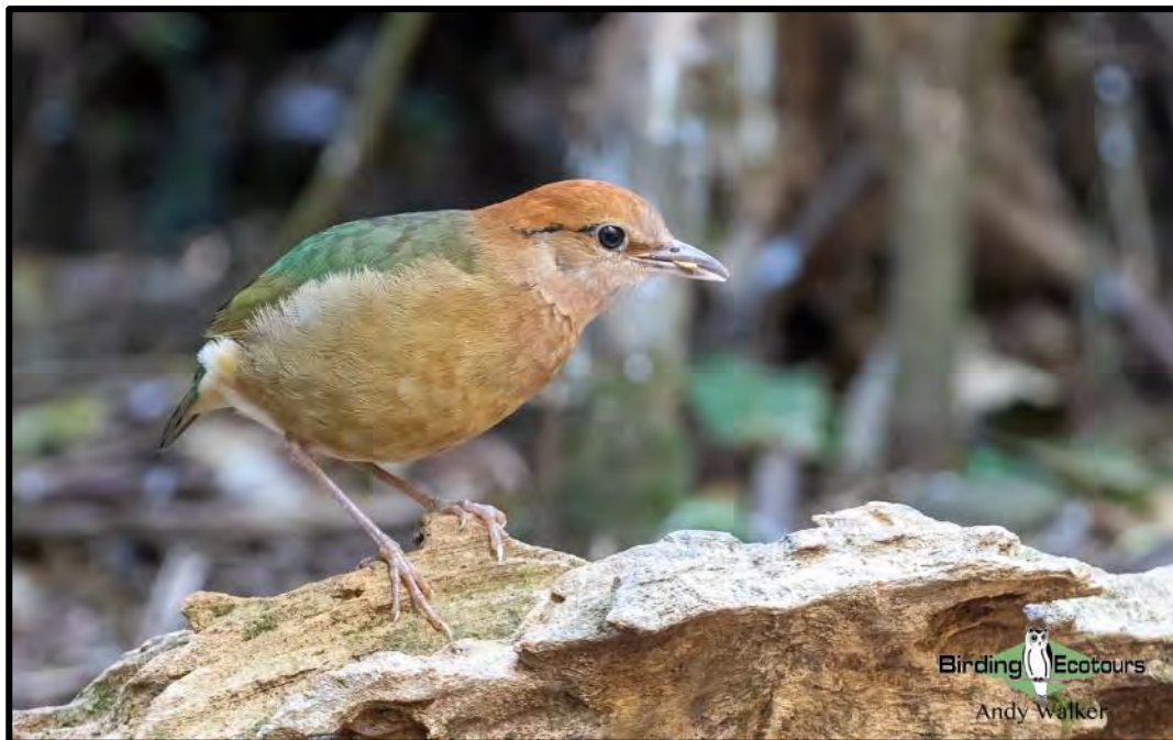
Rusty-naped Pitta came out of the dark forest and delighted us with a good view.