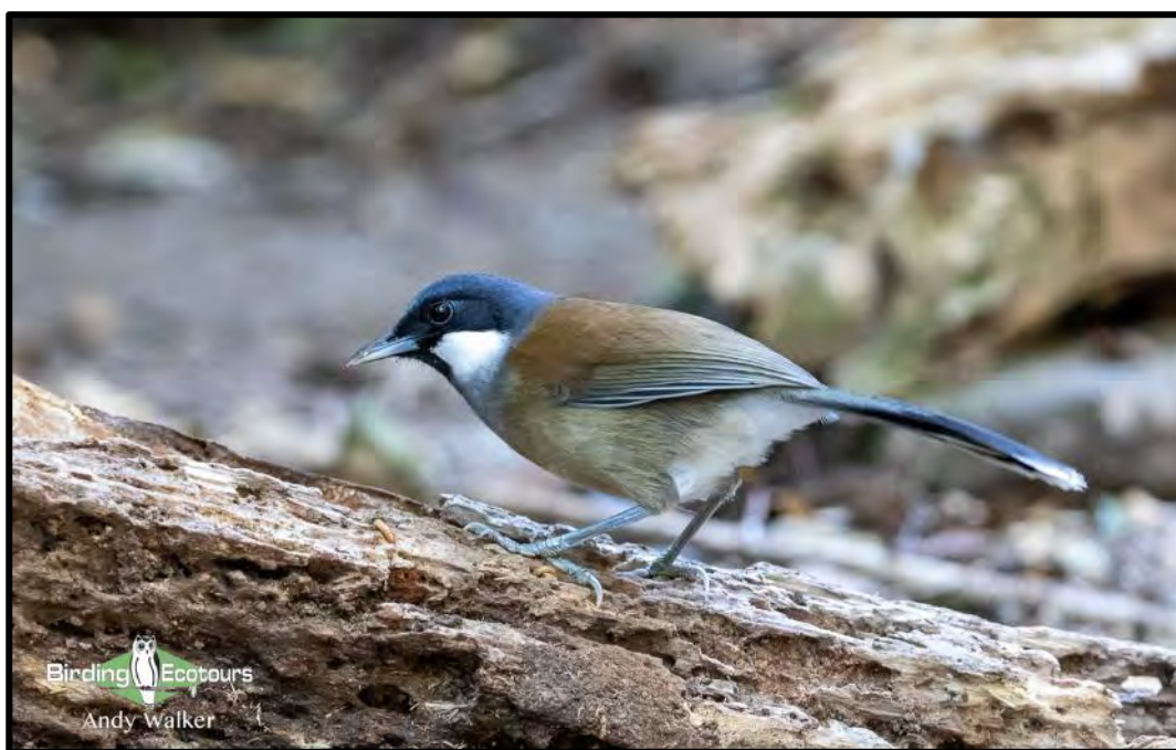
White-cheeked Laughingthrushes gave a great showing early in the morning.

We spent most of the day in two bird blinds (bird hides) and racked up a long list of high-quality birds. As soon as we entered the first blind the action got going. The near-endemic White-cheeked Laughingthrush was straight in, along with the local subspecies of Black-headed (White-spectacled) Sibia . It was difficult to know where to look first with raucous laughingthrushes bouncing all around, and with Mountain Fulvettas and Grey-throated Babblers also present in numbers. As we settled in and got familiar with these species, we started seeing other birds too, such as Large Niltava , White-tailed Robin , Siberian Blue Robin , Snowy-browed Flycatcher , Grey-bellied Tesia , and Lesser (Langbian) Shortwing . There was a bit of extra excitement when a chunky Rusty-naped Pitta came bounding in to view and fed for a while!