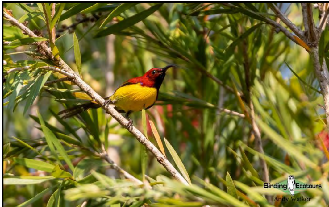
The local form of Mrs. Gould's Sunbird (known in this area of Vietnam as Annam Sunbird) is rather attractive!

During the afternoon we visited a forested area near a lake not far out of town. The birding was tough as it had clouded over with some rumbling thunder, and the light levels were very low. We walked a track and managed to find a few good species, such as Red-vented Barbet , Long-tailed Broadbill , and Indochinese Green Magpie , unfortunately the latter two species didn't stick around for everyone to see well, so we would have to hope for better views later in the tour. Vietnamese Cutia and Black-hooded Laughingthrush were heard only, again we'd have to hope for views later in the tour. Mugimaki Flycatcher , White-browed (Dalat) Shrike-babbler , Black Bulbul , Green-backed (Langbian) Tit , and Chestnut-vented Nuthatch all showed well.