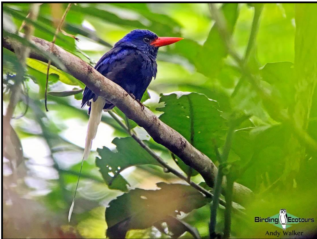
Numfor Paradise Kingfisher quietly sitting in some dense forest undergrowth. The colors on these birds are incredible.