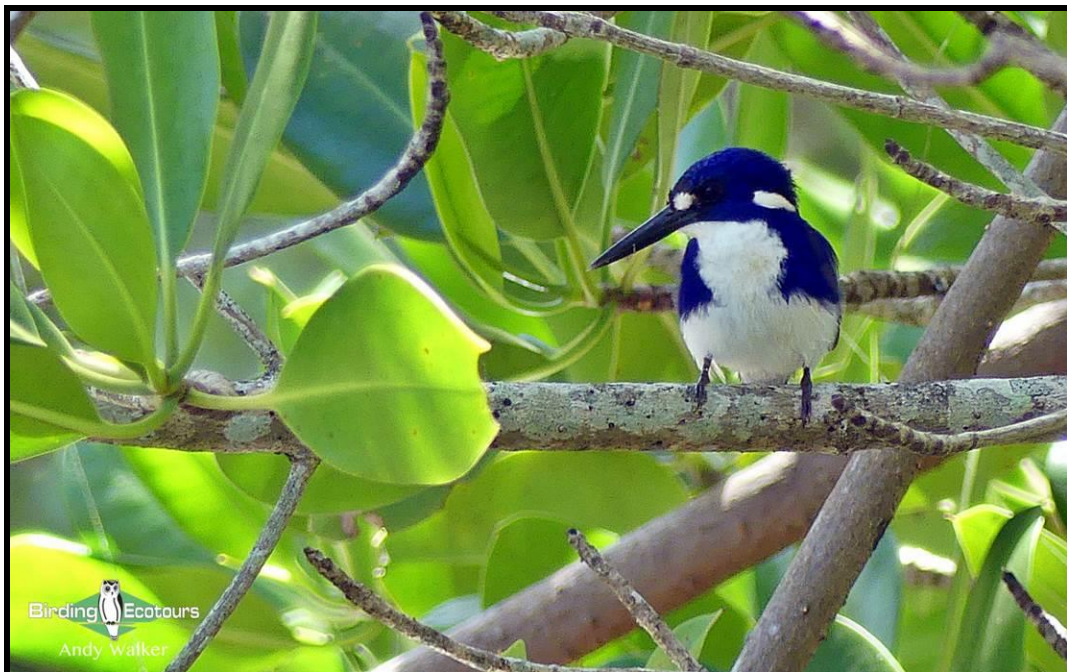
Little Kingfisher is a miniscule inhabitant of the mangroves near Sorong.