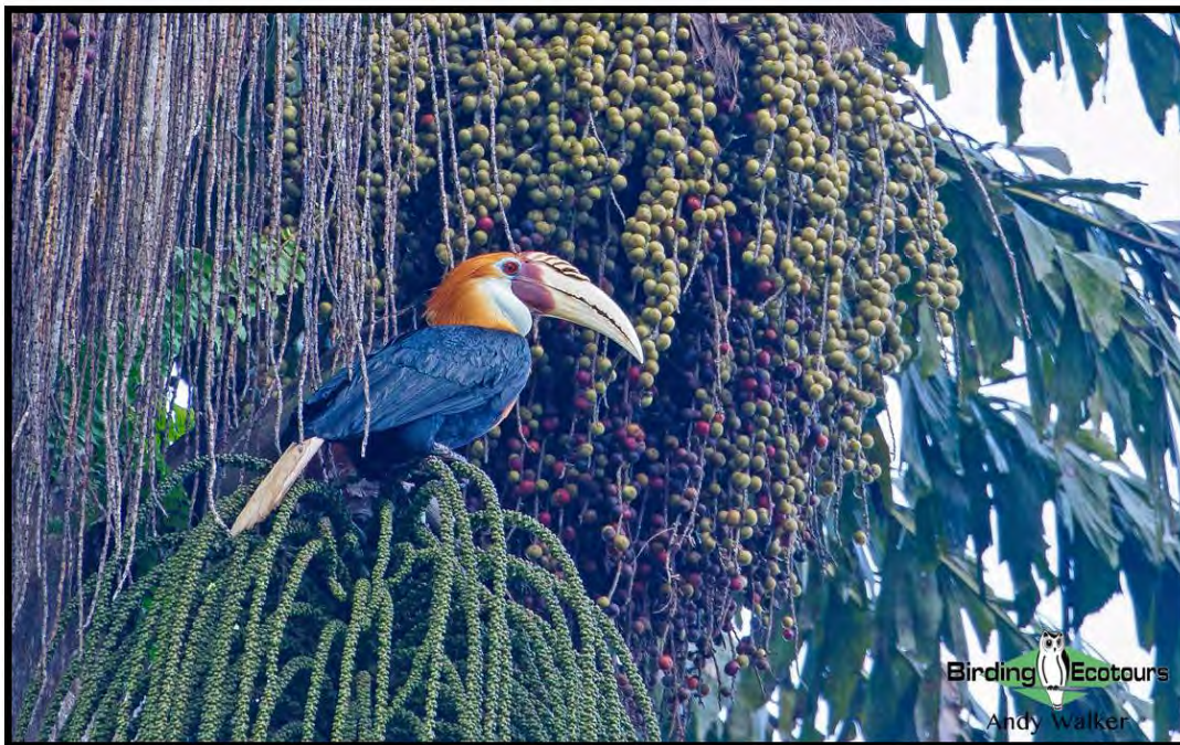
There is only one hornbill ( Blyth's Hornbill ) in New Guinea, though it is a spectacular one.