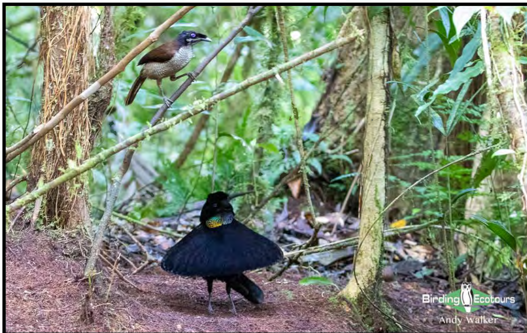
Watching Western Parotia undertaking their ballet dancing display is incredibly impressive.

This Papuan bird tour will begin in the town of Manokwari, situated on the northeastern tip of West Papua's Bird's Head (or Vogelkop) Peninsula, where we could get our tour started with the huge Blyth's Hornbill and numerous gorgeous fruit doves. We will travel to the nearby Arfak Mountains, where we will search for a fabulous suite of birds, renowned in birders' circles as the "Vogelkop Endemics", such as Western Parotia , Arfak Astrapia , Crescent-caped Lophorina (formerly part of the Superb Bird-of-paradise complex), Long-tailed Paradigalla , Arfak Catbird , Vogelkop Melidectes , and Vogelkop Bowerbird . We can also find more widespread birds-of-paradise (BoPs) here too, such as Black Sicklebill , Black-billed Sicklebill , Magnificent Bird-of-paradise , Trumpet Manucode , and Crinkle-collared Manucode .