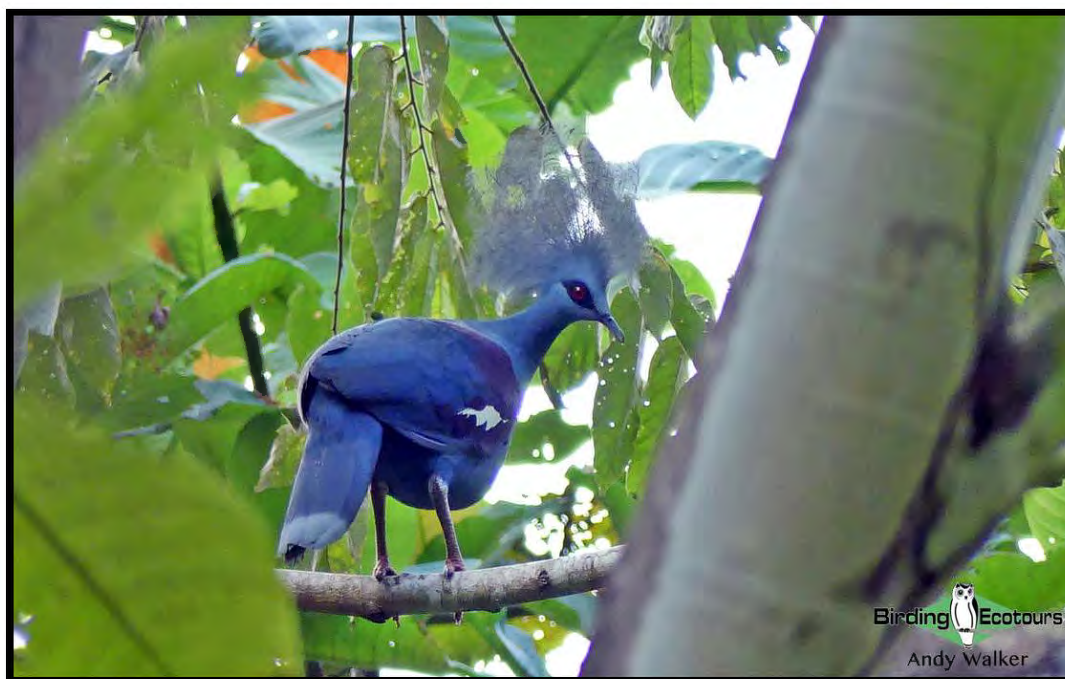
A huge bird, Western Crowned Pigeon is sure to impress on Waigeo.

The second leg of our tour takes us to the Klasow Valley and Raja Ampat Islands, and specifically Waigeo Island. During our time in this area we will search for Wilson's Bird-of-paradise , Red Bird-of-paradise , King Bird-of-paradise , Magnificent Riflebird , and Glossy-mantled Manucode . Wilson's Bird-of-paradise is often considered one of the best-looking birds on the planet, and so we will look forward to making our own judgments on this. Again, there are numerous other species high on our 'wanted' list, including Western Crowned Pigeon (a seriously impressive bird that will rival the birds-of-paradise for 'bird of the trip', if we find them), plus the likes of Blue-black Kingfisher , Hook-billed Kingfisher , Rufous-bellied Kookaburra , Yellow-billed Kingfisher , Papuan Dwarf Kingfisher , Common Paradise Kingfisher , Red-breasted Paradise Kingfisher , Beach Kingfisher , Papuan Hawk-Owl , Marbled Frogmouth , Papuan Frogmouth , Palm Cockatoo , Papuan Eclectus , Great-billed Parrot , Black Lory , Raja Ampat Pitohui , Eastern Hooded Pitta , Papuan Pitta , and Brown-headed Crow .