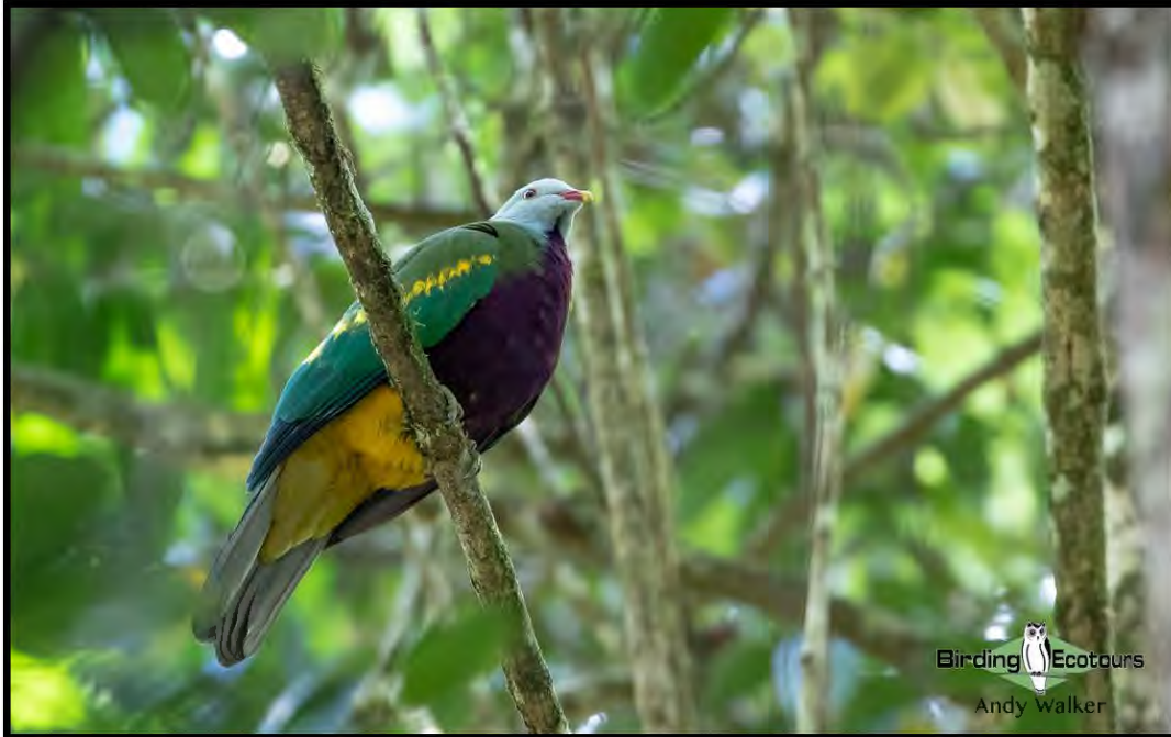
Wompoo Fruit Dove is one of many fruit doves possible on this great Papuan birding tour.