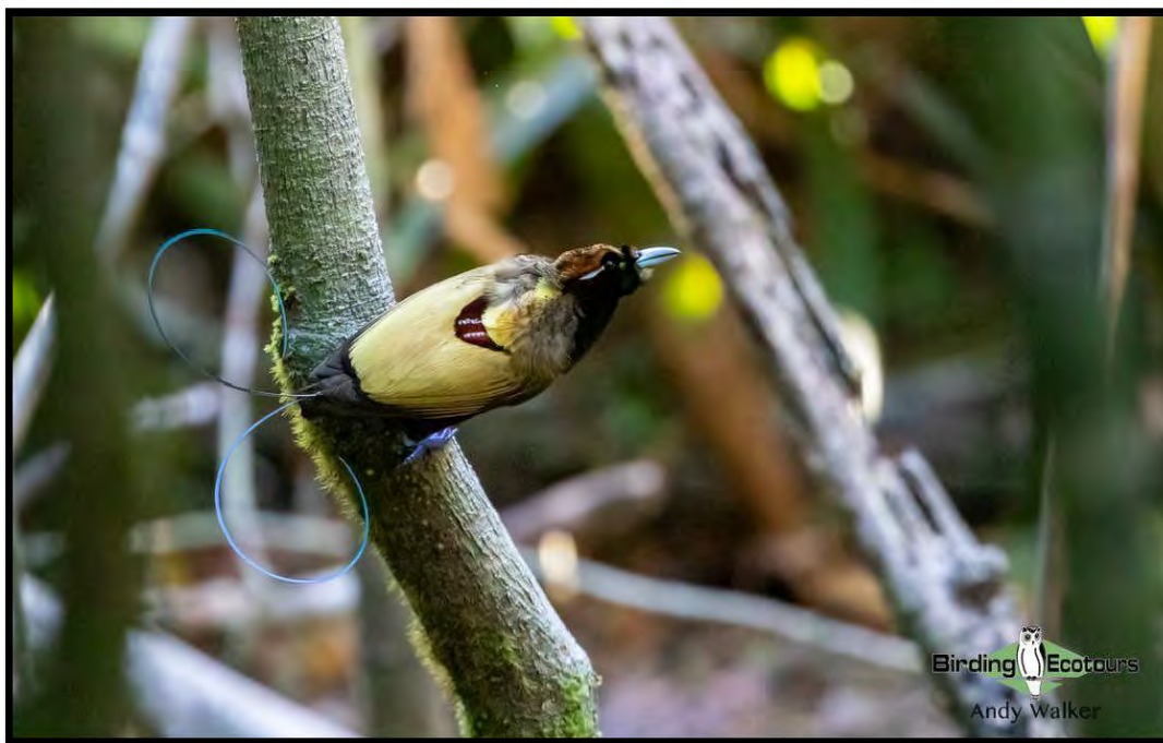
Magnificent Bird-of-paradise may be seen in the Arfak Mountains.

Around our village base in the mid-elevation zone, we will look for Magnificent Bird-of-paradise which may be seen on his court, displaying, in sequence, his iridescent carmine back, dark-green breast shield, and sulfur-yellow cape before jerkily dancing up and down a vertical sapling, while quivering his cocked, sickle-shaped central tail feathers.