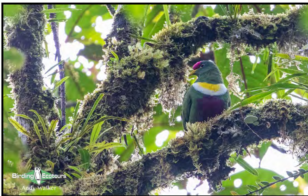
The attractive White-bibbed (Mountain) Fruit Dove will be a target while birding the Arfak Mountains.

Overnight: Arfak Mountains (two nights at mid-elevation and one night at high-elevation)