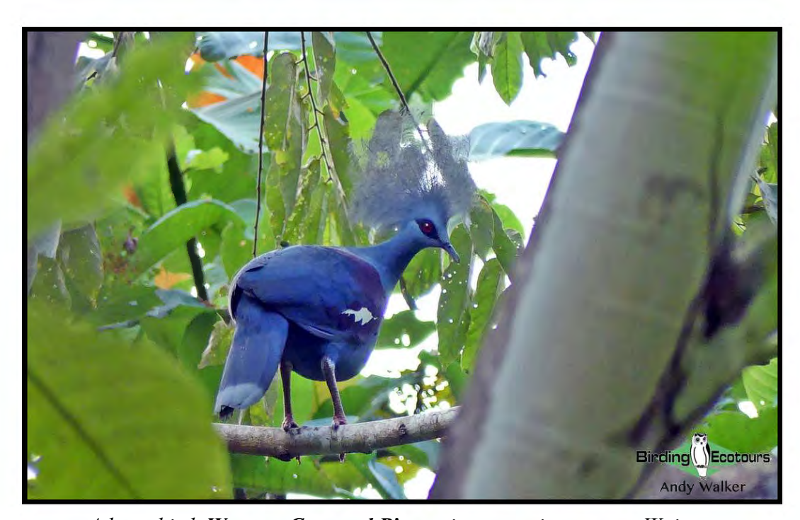
A huge bird, Western Crowned Pigeon is sure to impress on Waigeo.

The second leg of our tour takes us to the Klasow Valley and Raja Ampat Islands, and specifically Waigeo Island. During our time in this area we will search for Wilson's Bird-of-paradise, Red Bird-of-paradise, King Bird-of-paradise, Magnificent Riflebird, and Glossymantled Manucode. Wilson's Bird-of-paradise is often considered one of the best-looking birds on the planet, and so we will look forward to making our own judgments on this. Again, there are numerous other species high on our 'wanted' list, including Western Crowned Pigeon (a seriously impressive bird that will rival the birds-of-paradise for 'bird of the trip', if we find them), plus the likes of Blue-black Kingfisher, Hook-billed Kingfisher, Rufous-bellied Kookaburra, Yellow-billed Kingfisher, Papuan Dwarf Kingfisher, Common Paradise Kingfisher, Red-breasted Paradise Kingfisher, Beach Kingfisher, Papuan Hawk-Owl, Marbled Frogmouth, Papuan Frogmouth, Palm Cockatoo, Papuan Eclectus, Great-billed Parrot, Black Lory, Raja Ampat Pitohui, Eastern Hooded Pitta, Papuan Pitta, and Brownheaded Crow.