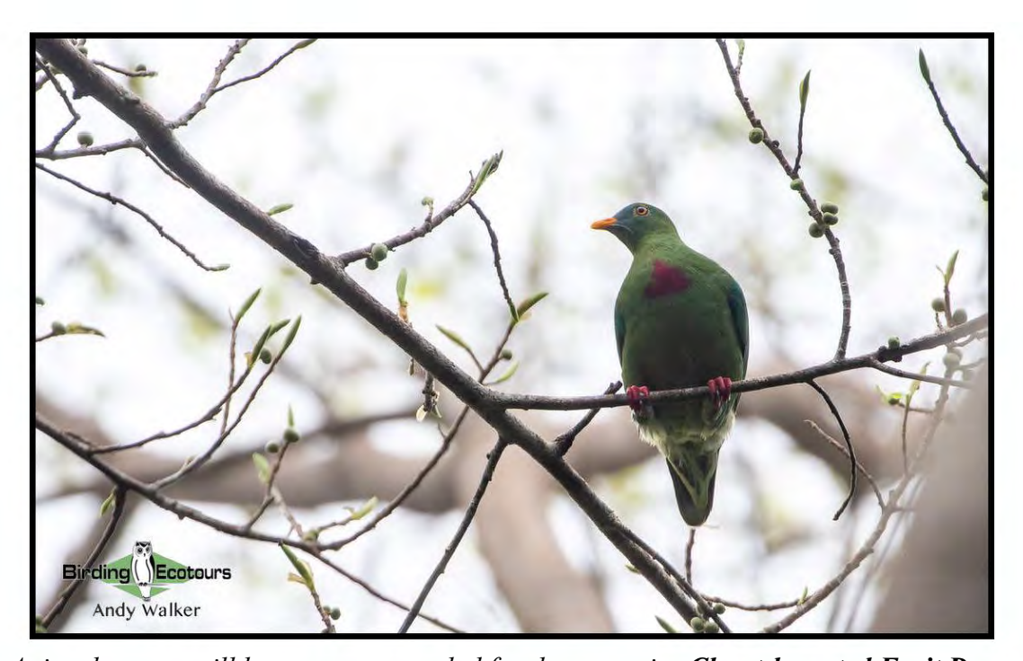
A tiny dove, we will keep our eyes peeled for the attractive Claret-breasted Fruit Dove.