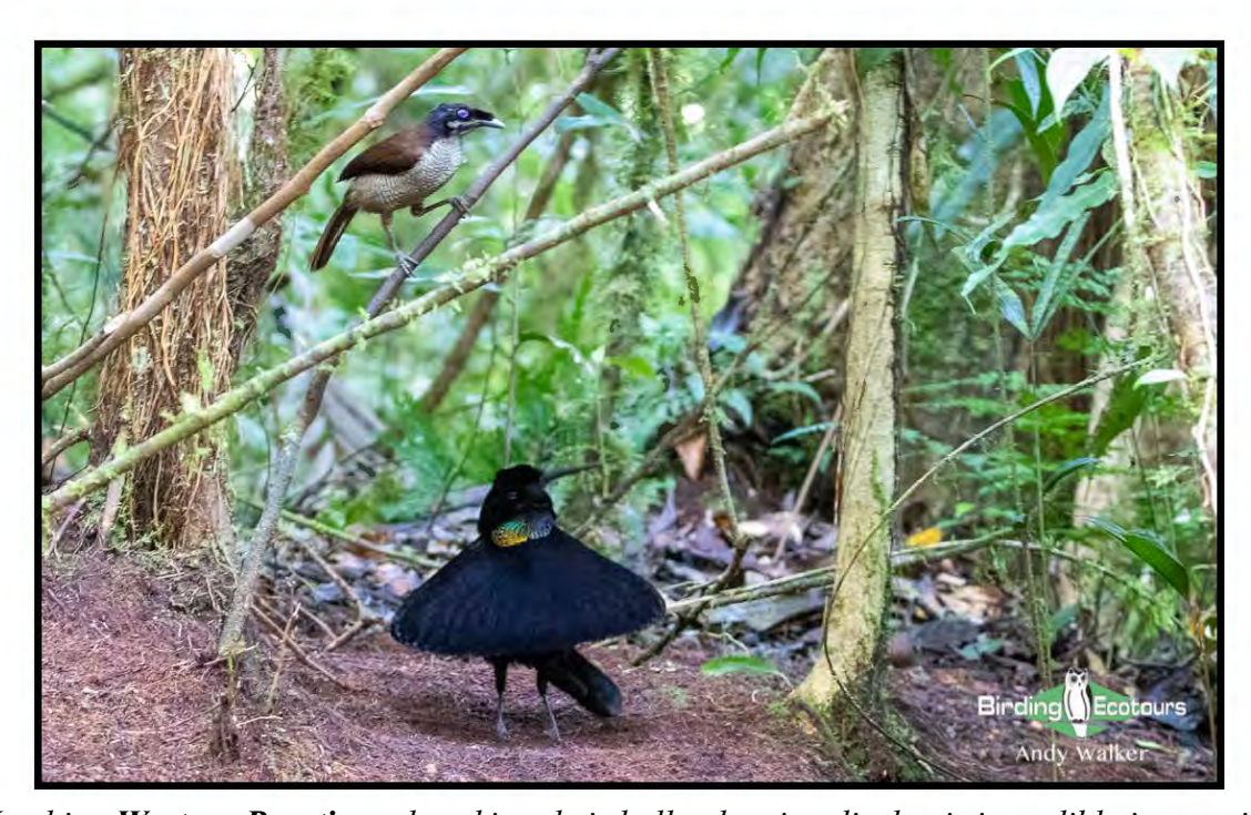
Watching Western Parotia undertaking their ballet dancing display is incredibly impressive.

This Papuan bird tour will begin in the town of Manokwari, situated on the northeastern tip of West Papua's Bird's Head (or Vogelkop) Peninsula, where we could get our tour started with the huge Blyth's Hornbill and numerous gorgeous fruit doves. We will travel to the nearby Arfak Mountains, where we will search for a fabulous suite of birds, renowned in birders' circles as the "Vogelkop Endemics", such as Western Parotia, Arfak Astrapia, Crescent-caped Lophorina (formerly part of the Superb Bird-of-paradise complex), Long-tailed Paradigalla, Arfak Catbird, Vogelkop Melidectes, and Vogelkop Bowerbird. We can also find more widespread birds-of-paradise (BoPs) here too, such as Black Sicklebill, Black-billed Sicklebill, Magnificent Bird-of-paradise, Trumpet Manucode, and Crinkle-collared Manucode.