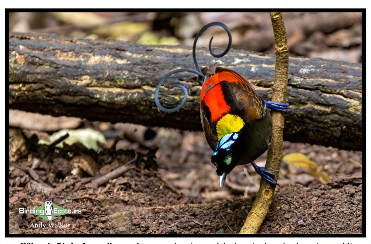
Wilson's Bird-of-paradise is often considered one of the best-looking birds in the world!