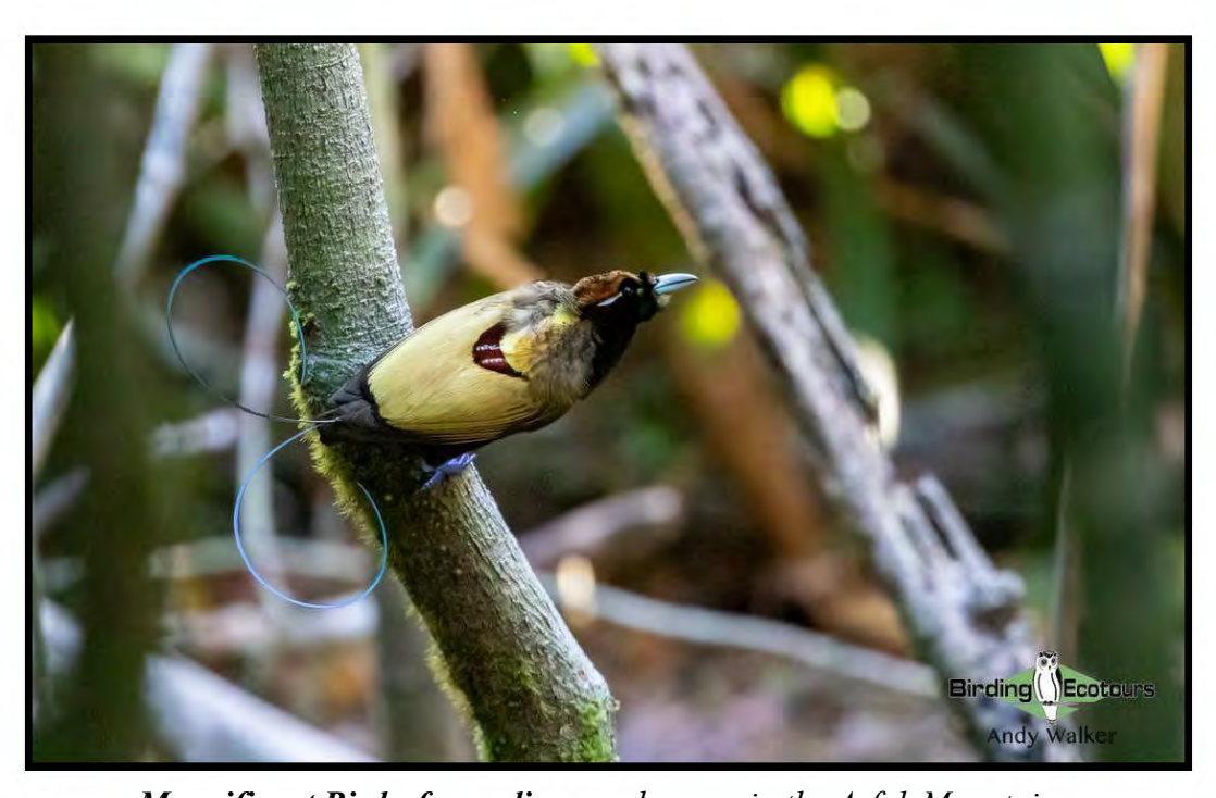
Magnificent Bird-of-paradise may be seen in the Arfak Mountains.

Around our village base in the mid-elevation zone, we will look for Magnificent Bird-ofparadise which may be seen on his court, displaying, in sequence, his iridescent carmine back, dark-green breast shield, and sulfur-yellow cape before jerkily dancing up and down a vertical sapling, while quivering his cocked, sickle-shaped central tail feathers.