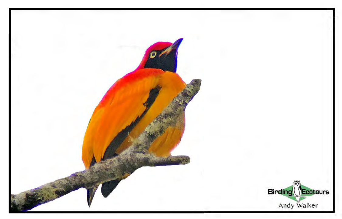
The colors on the male Masked Bowerbird really need to be seen to be believed, this is one insanely colorful bird! Its bower is nowhere near as impressive as the Vogelkop Bowerbird (above), but when it looks like this, it probably doesn't matter to the female!

Red-collared Myzomela, Papuan Black Myzomela, Rufous-sided Honeyeater, Northern Variable Pitohui, Hooded Pitohui, White-shouldered Fairywren, Papuan Parrotfinch, Wattled Brushturkey, Sclater's Whistler, Regent Whistler, Rufous-naped Bellbird (formerly called Rufous-naped Whistler but moved from that family to a new family called Australo-Papuan bellbirds, and now known to be a poisonous bird!), Goldenface, Mountain Peltops, Black-breasted Boatbill, Papuan Treecreeper, Papuan Sittella, Green-backed Robin, Black-throated Robin, Slaty Robin, Garnet Robin, Lesser Ground Robin, and, if we are lucky, Feline Owlet-nightjar or Mountain Owlet-nightjar.