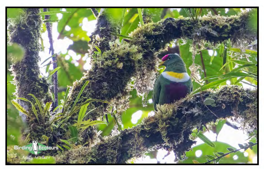
The attractive White-bibbed (Mountain) Fruit Dove will be a target while birding the Arfak Mountains.

Overnight: Arfak Mountains (two nights at mid-elevation and one night at high-elevation)