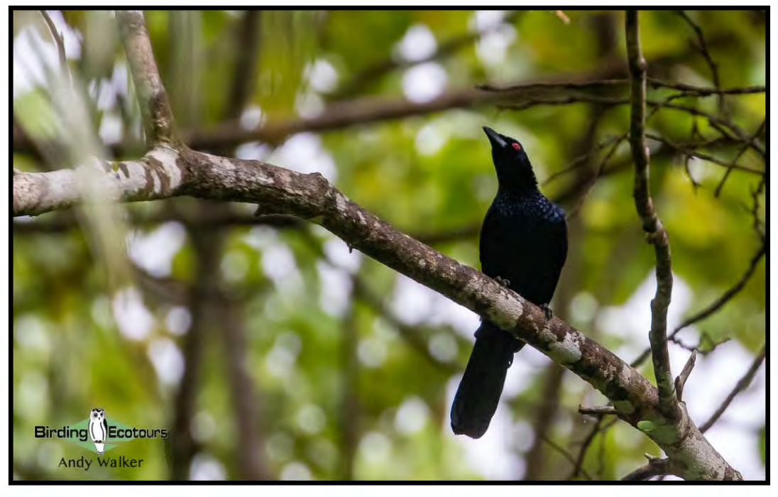
Glossy-mantled Manucode is yet another bird-of-paradise we will be looking for on the tour.