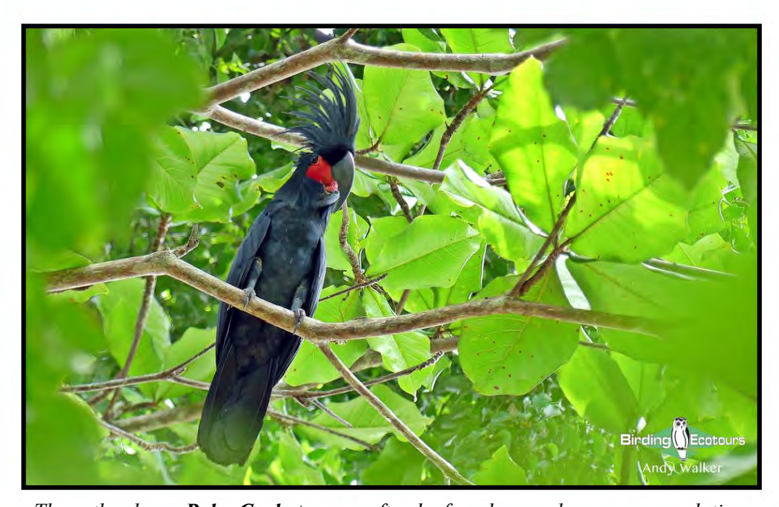
The rather large Palm Cockatoo can often be found around our accommodation.

We will have early-morning and late-afternoon birding sessions in the forest and the late-morning and early-afternoon will be at your leisure around the resort where you can sit and enjoy the view, maybe even with Palm Cockatoos feeding above your heads! Or you can take some time to snorkel in the reef right outside our rooms, the coral reef and various fish and sea-life present here is remarkable and well worth an underwater experience.