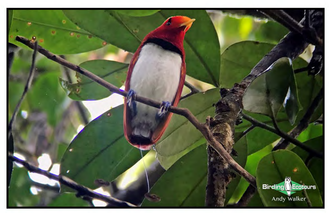
King Bird-of-paradise is a beautiful BoP and we will hope for some great views at their lek site.

A very early start today will see us birding in some forest near Sorong where we could extend our bird-of-paradise list in the form of the raucous Magnificent Riflebird and the bizarre, delightful, and rather small King Bird-of-paradise. There are many other incredible birds possible here too, and one of the most highly sought-after of these is Red-breasted Paradise Kingfisher, which we will look for today. Other quality birds we will look for include Papuan Pitta, Eastern Hooded Pitta, Blyth's Hornbill, Pesquet's (New Guinea Vulturine) Parrot, Palm Cockatoo, Sulphur-crested Cockatoo, Red-cheeked Parrot, Coconut Lorikeet, Black Lory, Moluccan King Parrot, Large Fig Parrot, Yellow-billed Kingfisher, Blue-black Kingfisher, Red-billed Brushturkey, Golden Cuckooshrike, Brown Oriole, Dwarf Fruit Dove, Pink-spotted Fruit Dove, Superb Fruit Dove, Orange-bellied Fruit Dove, Wompoo Fruit Dove, Frilled Monarch, Rusty Pitohui, Lowland Peltops, and Long-tailed Honey Buzzard.