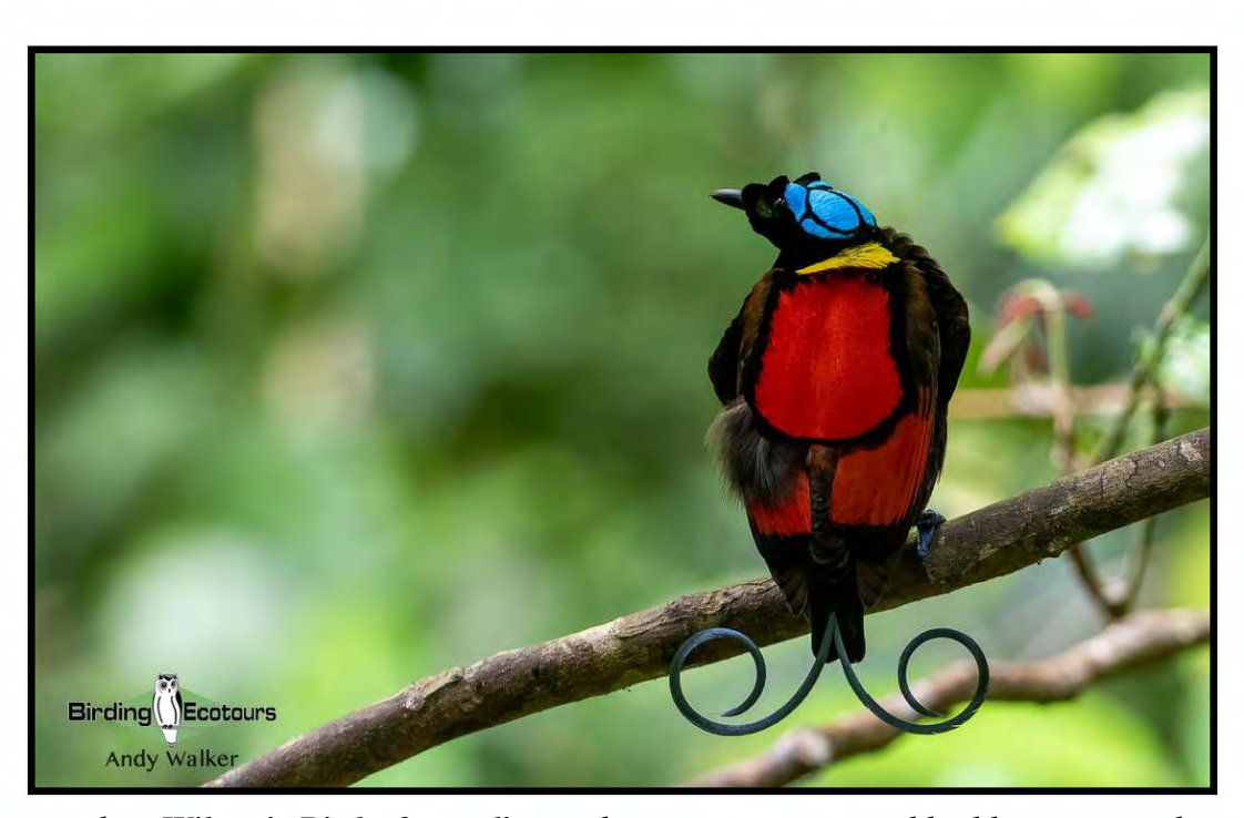
The astounding Wilson's Bird-of-paradise is always a top target and highly anticipated species.

Waigeo, where we will be based for the next two days, is the largest island in the Raja Ampat Archipelago, comprising over 1,500 small islands, cays, and shoals and located off the northwest tip of the Bird's Head Peninsula. These islands are home to two endemic birds-of-paradise, the exquisite Wilson's Bird-of-paradise with its bright, cerulean-blue, bare crown, crisscrossed by fine black lines (considered by many as the best-looking bird on the planet – see below and the front cover of this itinerary for an idea of how stunning this bird is) and the crimson-plumed rather slick-looking Red Bird-of-paradise . We will look for both species while on Waigeo.