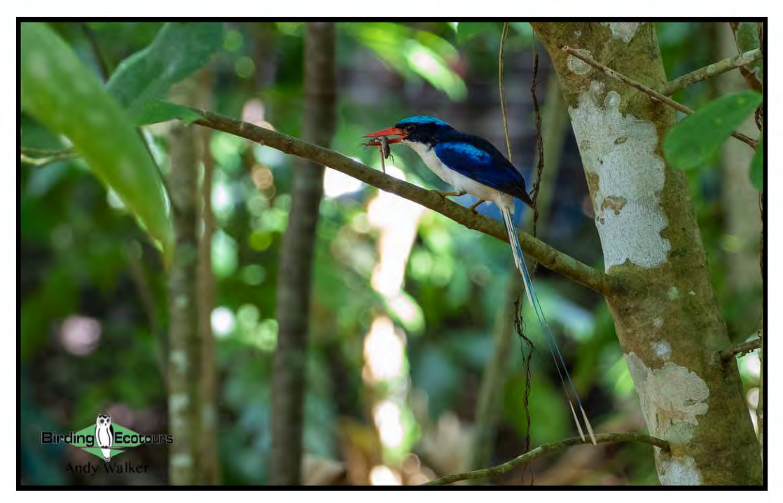
We see some amazing kingfishers on this tour, like this Common Paradise Kingfisher.