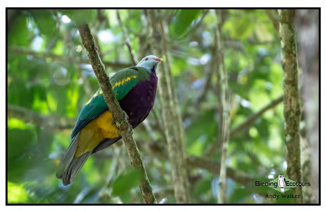
Wompoo Fruit Dove is one of many fruit doves possible on this great Papuan birding tour.