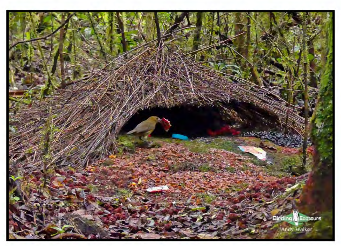
The impressive bower of the Vogelkop Bowerbird is something pretty special, even if the bird is rather drab – what it lacks in good looks, it certainly makes up for in architectural ability!

Of all the endemic birds of the region, one of the most famous ones (though not the most beautiful!) must be Vogelkop Bowerbird – the world's greatest avian architect. Males of this amazing species build a roofed house-like maypole (tented) bower, construction at the base of a tree sapling, inside and in front of which they place colorful berries, flowers, and insect parts to attract females, a true sight to behold for the female, and us!