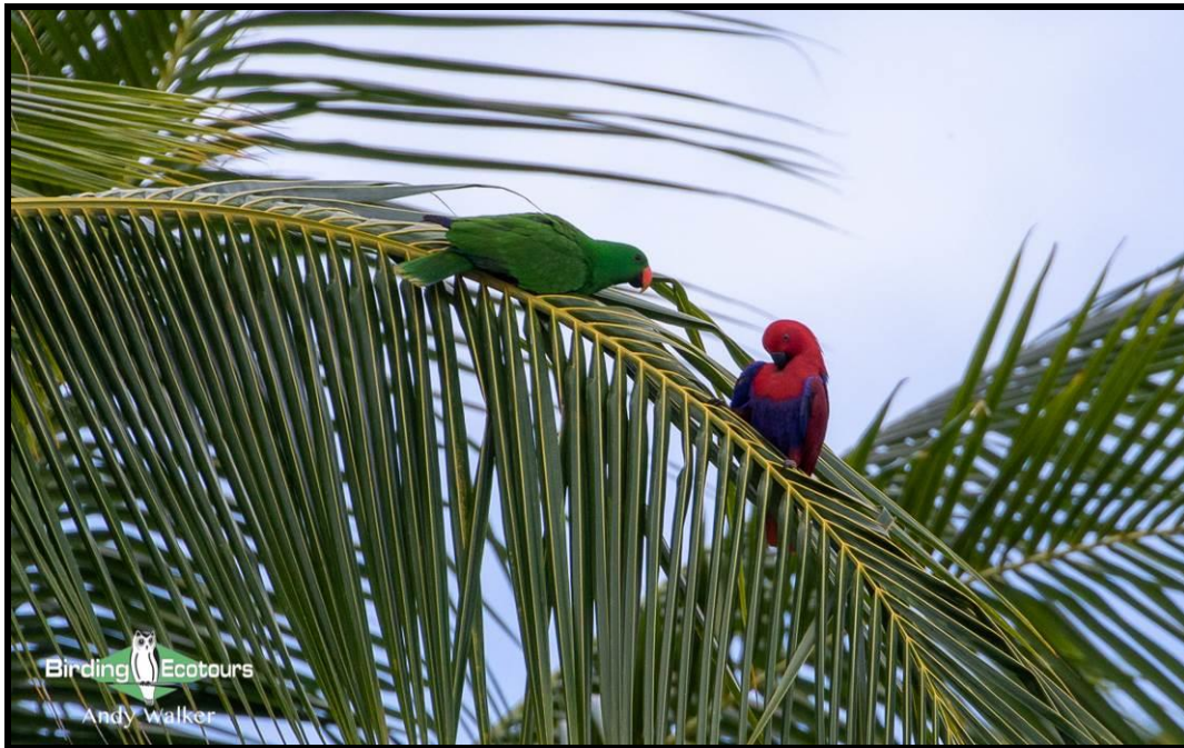
Papuan Eclectus can be found along the roadside and around our resort on Waigeo.

After breakfast and checking out of our hotel, we will transfer by fast-ferry from Sorong to Waigeo Island across the Indonesian Dampier Strait (sometimes also known as Augusta's Strait). The crossing can take two or three hours, and we will be within an air-conditioned cabin.