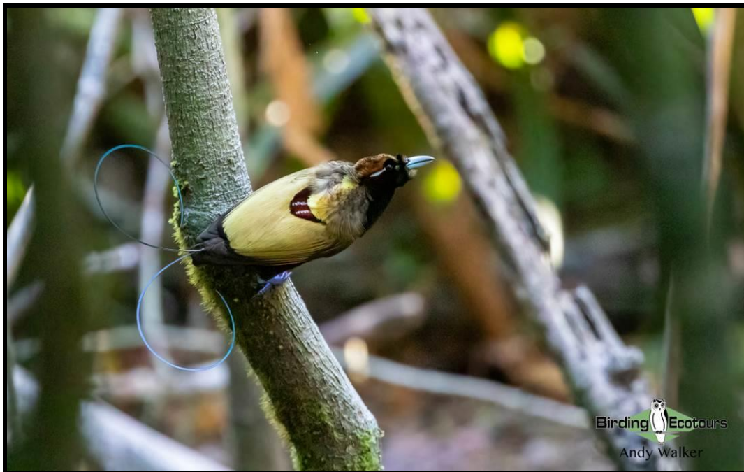
Magnificent Bird-of-paradise may be seen in the Arfak Mountains.

Around our village base in the mid-elevation zone, we will look for Magnificent Bird-of-paradise which may be seen on his court, displaying, in sequence, his iridescent carmine back, dark-green breast shield, and sulfur-yellow cape before jerkily dancing up and down a vertical sapling, while quivering his cocked, sickle-shaped central tail feathers.