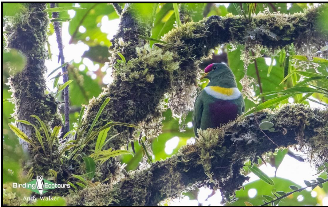
The attractive White-bibbed (Mountain) Fruit Dove will be a target while birding the Arfak Mountains.

Overnight: Arfak Mountains (two nights at mid-elevation and one night at high-elevation)