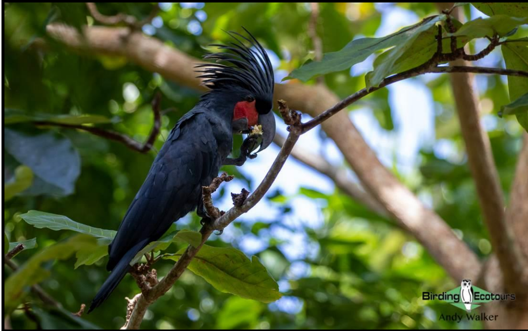
The rather large Palm Cockatoo can often be found around our accommodation.