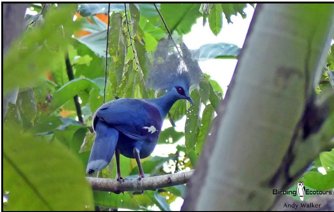
A huge bird, Western Crowned Pigeon is sure to impress on Waigeo.

The second leg of our tour takes us to the Raja Ampat Islands, and specifically Waigeo Island. Here we will search for endemic Wilson's Bird-of-paradise , Red Bird-of-paradise , and Glossy-mantled Manucode . Wilson's Bird-of-paradise is often considered one of the best-looking birds on the planet, and so we will look forward to making our own judgments on this. Again, there are numerous other species high on our 'wanted' list, including Western Crowned Pigeon (a seriously impressive bird that will rival the birds-of-paradise for 'bird of the trip', if we find them), plus the likes of Hook-billed Kingfisher , Rufous-bellied Kookaburra , Yellow-billed Kingfisher , Papuan Dwarf Kingfisher , Common Paradise Kingfisher , Beach Kingfisher , Papuan Hawk-Owl , Marbled Frogmouth , Papuan Frogmouth , Palm Cockatoo , Papuan Eclectus , Great-billed Parrot , Raja Ampat Pitohui , Hooded Pitta , Papuan Pitta , and Brown-headed Crow .