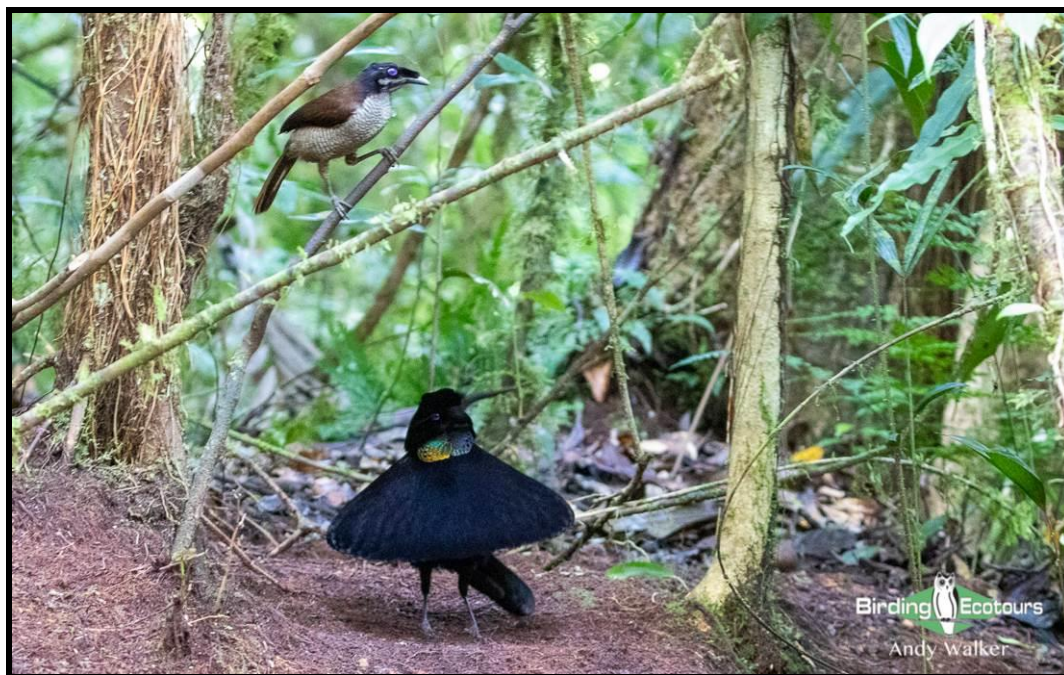
Watching Western Parotia undertaking their ballet dancing display is incredibly impressive.

This Papuan bird tour will begin in the town of Manokwari, situated on the northeastern tip of West Papua's Bird's Head (or Vogelkop) Peninsula, where we could get our tour started with the huge Blyth's Hornbill and numerous gorgeous fruit doves. We will travel to the nearby Arfak Mountains, where we will search for a fabulous suite of birds, renowned in birders' circles as the "Vogelkop Endemics", such as Western Parotia , Arfak Astrapia , Crescent-caped Lophorina (formerly part of the Superb Bird-of-paradise complex), Long-tailed Paradigalla , Arfak Catbird , Vogelkop Melidectes , and Vogelkop Bowerbird . We can also find more widespread birds-of-paradise (BoPs) here too, such as Black Sicklebill , Black-billed Sicklebill , Magnificent Bird-of-paradise , Trumpet Manucode , and Crinkle-collared Manucode .