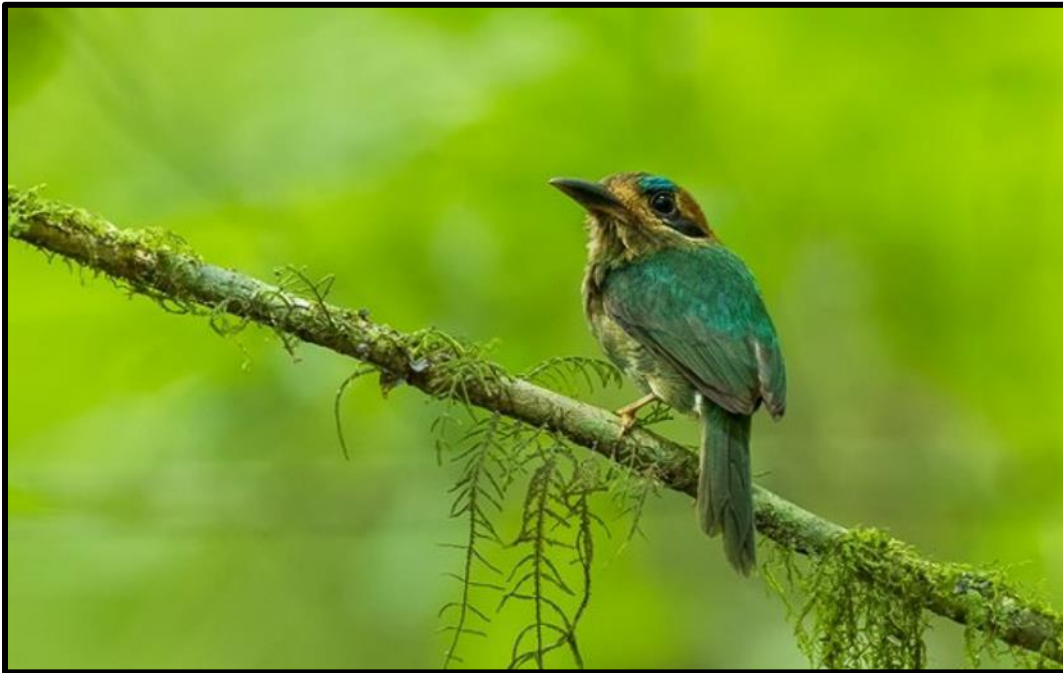
The secretive and exquisite Tody Motmot will be our primary target in the Tenorio Volcano National Park area.

Overnight: Tenorio Volcano National Park area