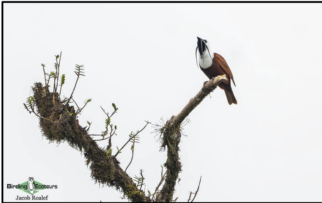
Three-wattled Bellbird is one of our top targets of the trip.

for one of the top targets of the trip, Three-wattled Bellbird . This iconic species leks in the area at this time of the year and we hope to get some good encounters with this amazing-looking bird. Other birds we expect to find here include Orange-billed Nightingale-Thrush , White-crowned Parrot , Brown Jay , Blue-throated Toucanet , Ochraceous Wren , Prong-billed Barbet , Spotted Barbtail , Chestnut-capped Brushfinch , Chestnut-capped Warbler , Tawny-capped Euphonia , and if we are lucky, Azure-hooded Jay .