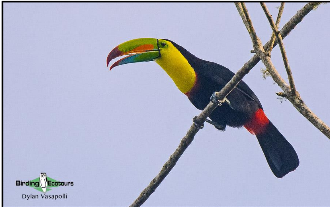
The stunning Keel-billed Toucan is always a pleasure to see.