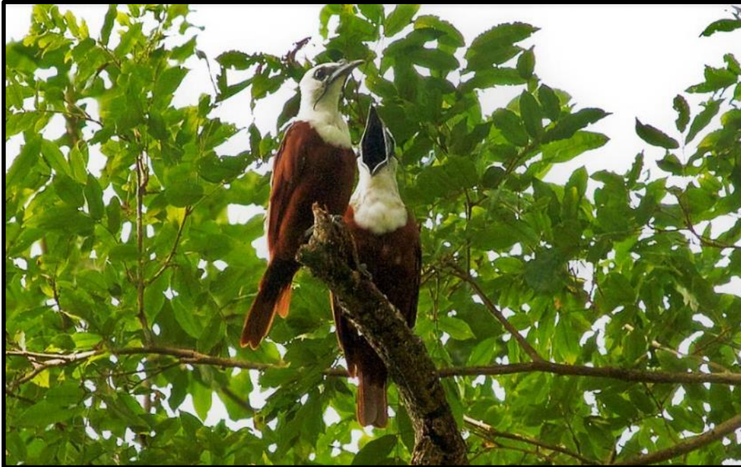
Three-wattled Bellbird is one of our top targets of the trip.

time of the year and we hope to get some good encounters with this amazing-looking bird. Other birds we expect to find here include Orange-billed Nightingale-Thrush , White-crowned Parrot , Brown Jay , Blue-throated Toucanet , Ochraceous Wren , Prong-billed Barbet , Spotted Barbtail , Chestnut-capped Brushfinch , Chestnut-capped Warbler , Tawny-capped Euphonia , and if we are lucky, Azure-hooded Jay .