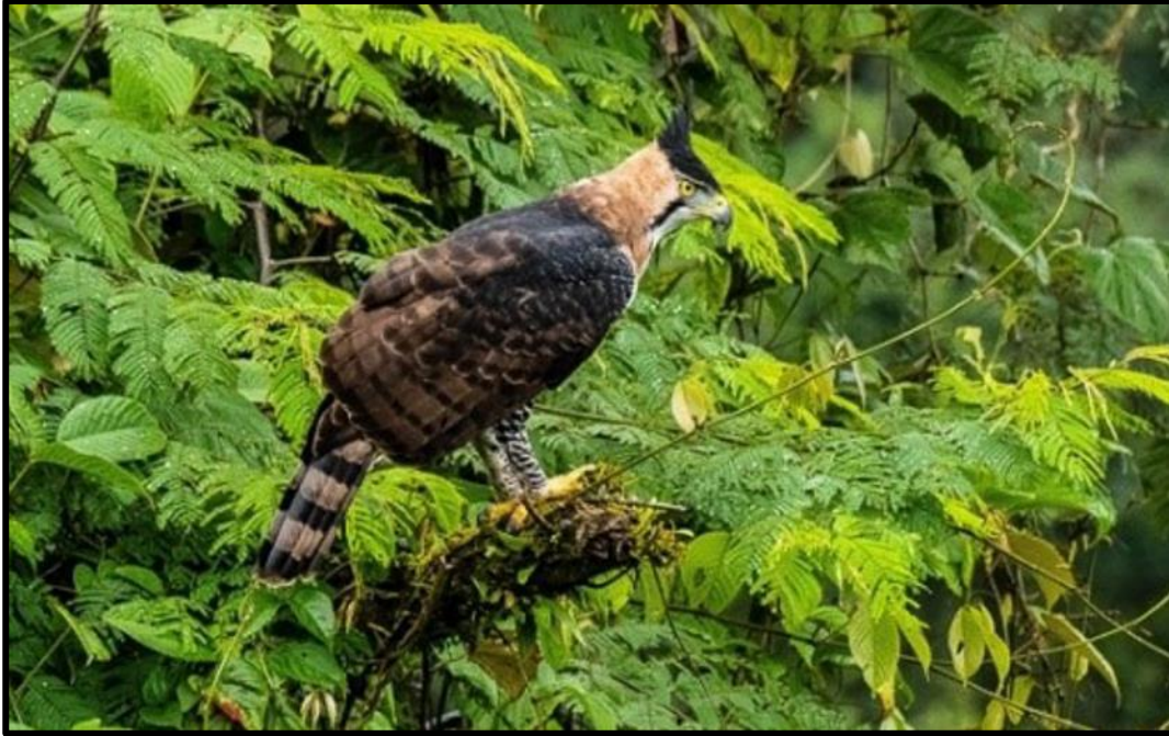
The elusive Ornate Hawk-Eagle in the Arenal area.