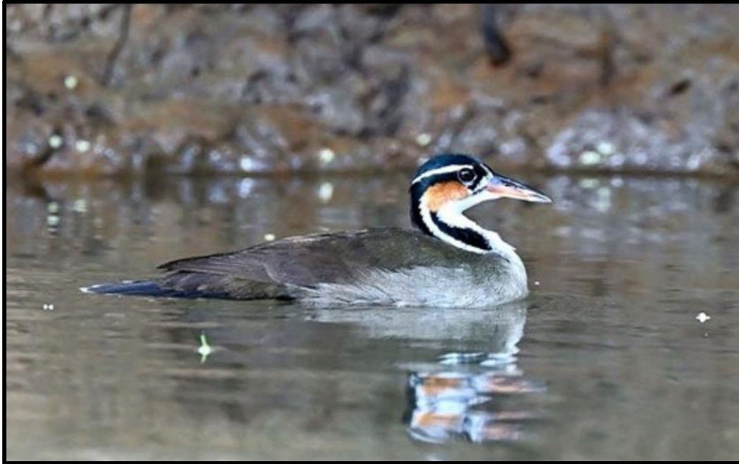
The most-wanted Sungrebe is one of the targets at Caño Negro.