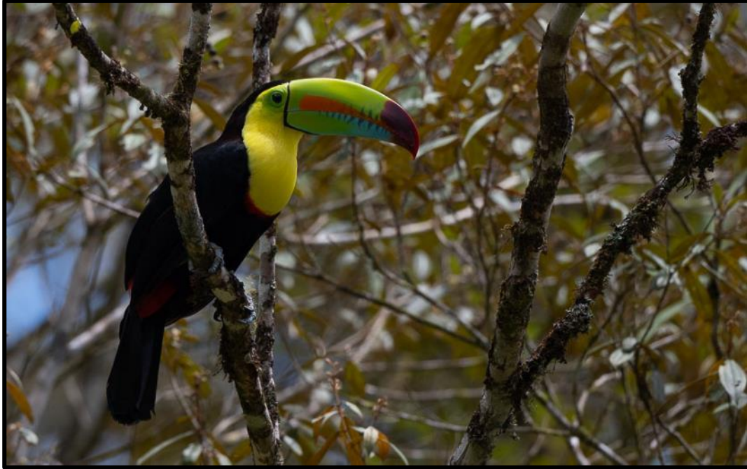
The stunning Keel-billed Toucan is always a pleasure to see.