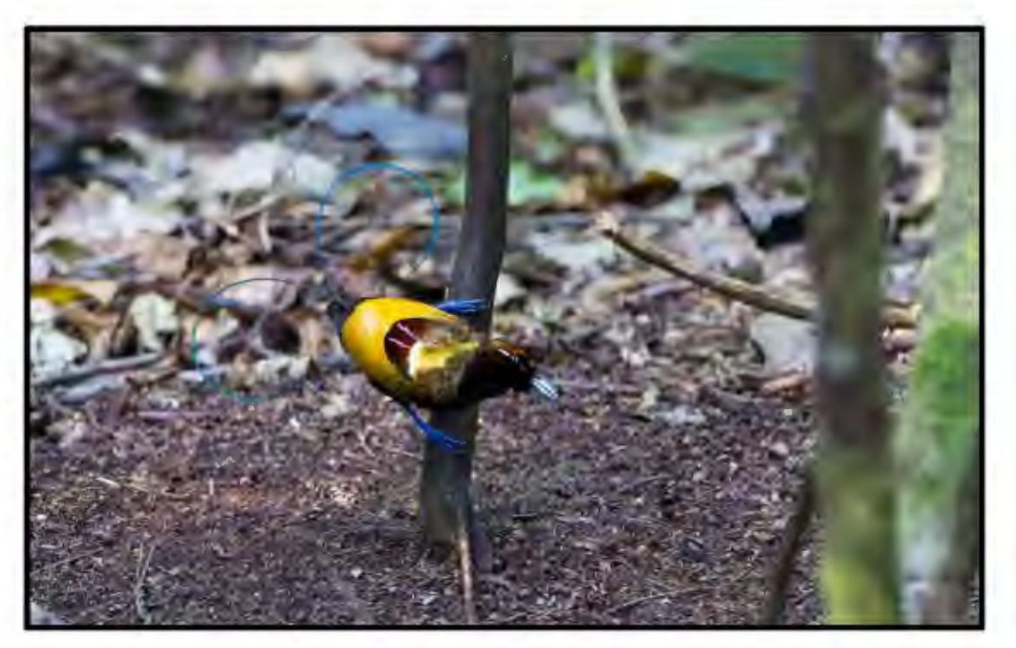
Magnificent Bird-of-paradise put on an amazing show for us and was voted one of the top birds on the tour.

Berrypecker, Papuan Grassbird, Vogelkop Melidectes, Arfak Honeyeater, Grey Crow, Brown-headed Crow, Vogelkop Scrubwren, and Grey-banded Mannikin.