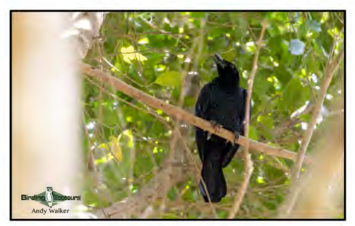
This Glossy-mantled Manucode was quietly resting in the canopy during the middle of the day.

Before a delicious lunch, several of the group went for a snorkeling session on the impressive reef and on the way back to Waigeo we found a feeding group of seabirds which included Black-naped Tern, Common Tern, Bridled Tern, Lesser Frigatebird , and Bulwer's Petrel .