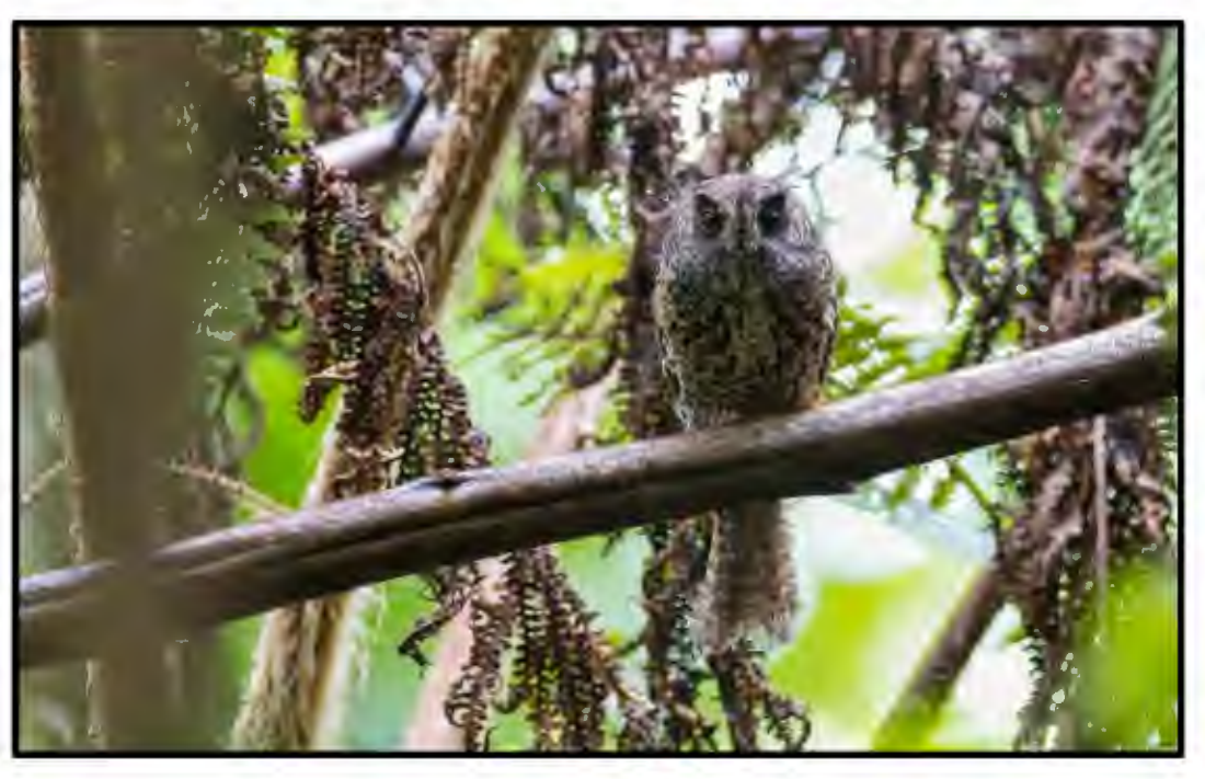
Mountain Owlet-nightjar in the Arfak Mountains.