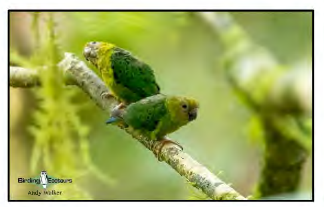
This pair of miniscule Yellow-capped Pygmy Parrots showed well.

Honeyeater, Papuan Dwarf Kingfisher, Yellow-capped Pygmy Parrot, Moluccan King Parrot, Red-flanked Lorikeet, Pacific Baza, Long-tailed Honey Buzzard, and Golden Myna.