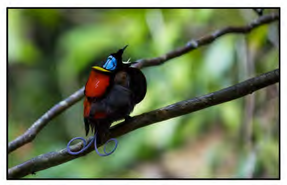
Wilson's Bird-of-paradise gave excellent close views (photo by tour participant, Chris Hill).

We had a final morning birding on Waigeo before catching the ferry back to Sorong. Some of the group went back to the bird hides to watch Wilson's Bird-of-paradise . One group saw a pair of birds mating and another group had a super close and showy male. A wonderful way to end the tour. Some of the group did some roadside birding near the dive resort, getting some great looks at Coconut Lorikeet , Papuan Eclectus , Red-cheeked Parrot , Sulphur-crested Cockatoo , Grey-headed Goshawk , Pinion's Imperial Pigeon , Claret-breasted Fruit Dove , Rufous-bellied Kookaburra , Moustached Treeswift , Spangled Drongo , Hooded Butcherbird , Brownheaded Crow , Torresian Crow , Yellow-faced Myna , Singing Starling , Oriental Dollarbird , Black Sunbird , Olive-crowned Flowerpecker , a flock of Glossy-mantled Manucodes , including several birds displaying, and a female Red Bird-of-paradise high in a tree.