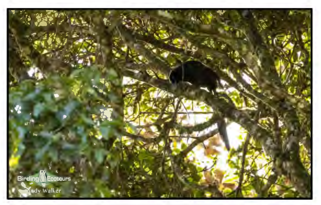
The range-restricted Arfak Astrapia was the highlight from the high elevation zone.

A short while later, as we were admiring the view over the forest, we had an incredible flyover from a male Black Sicklebill that passed low over our heads. We had been listening to the birds' impressive far-carrying calls for the previous couple of hours and so it was a great ending to our time on the higher reaches of the mountain. We then made the walk off the mountain, which was rather slippery and slow-going after all the rain over the previous night. It was a pleasure to be back up the mountain and birding in a truly beautiful forest with some of the best birds of West Papua all around us.