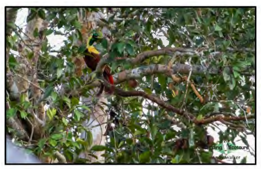
A stunning male Red Bird-of-paradise showed briefly, but mainly remained hidden.

Before a delicious lunch, several of the group went for a snorkeling session on the impressive reef and on the way back to Waigeo we found a feeding group of seabirds which included Black-naped Tern, Common Tern, Bridled Tern, Lesser Frigatebird , and Bulwer's Petrel .