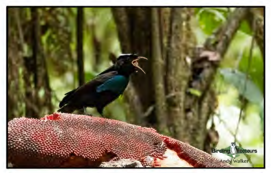
A male Crescent-caped Lophorina came down and fed on some fruit right in front of us. It was very shy, but what a spectacular bird.