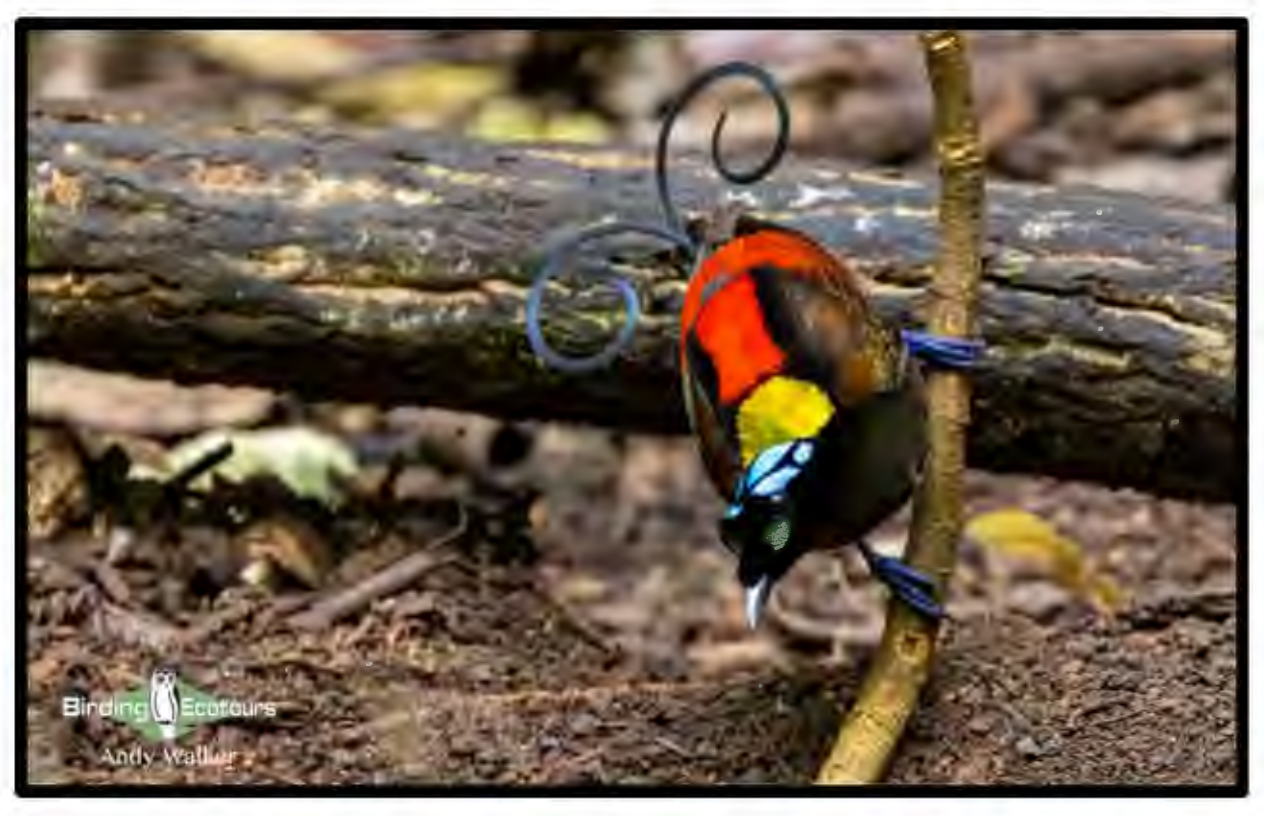
The spectacular Wilson's Bird-of-paradise put on an incredible show for us.