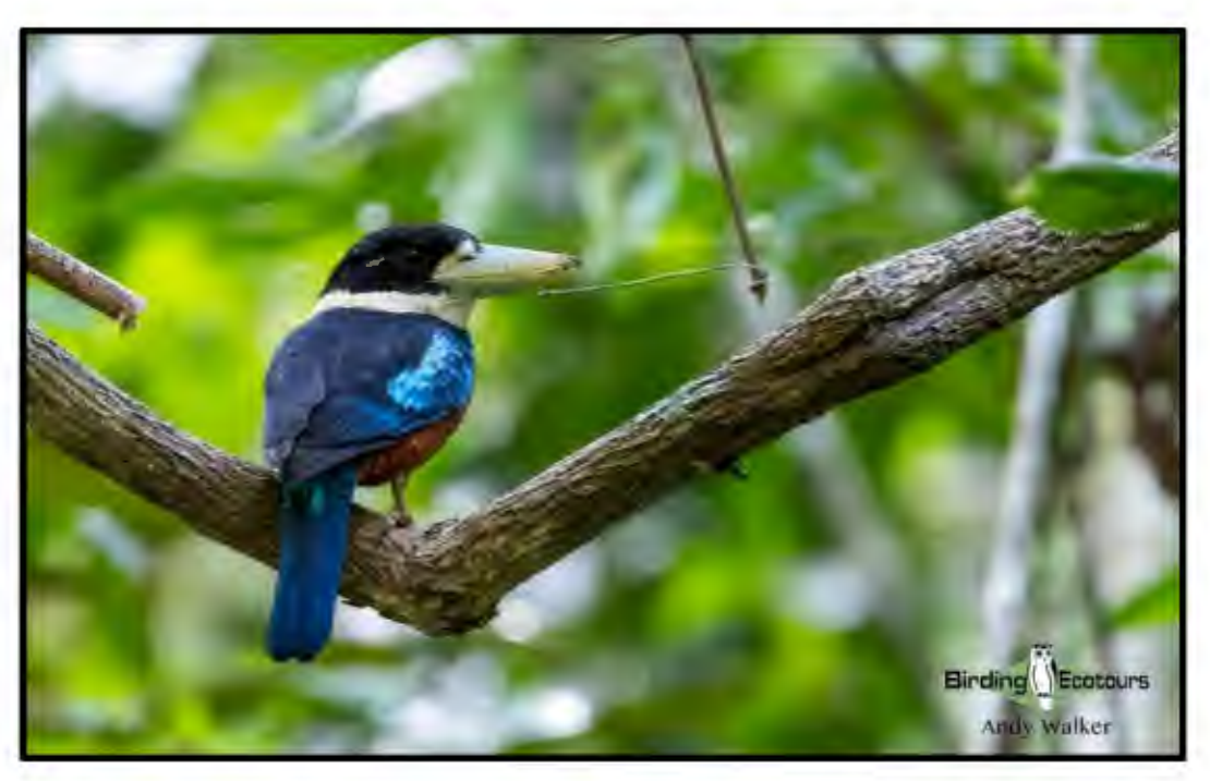
Rufous-bellied Kookaburra was a popular large kingfisher that showed nicely.