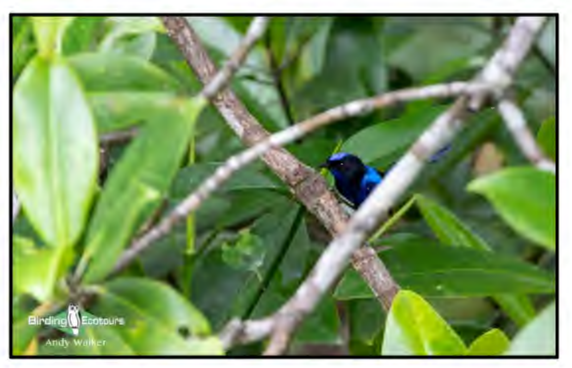
Emperor Fairywren gave fleeting views as it remained deep in the mangroves.

In the afternoon we visited some nearby mangroves where we found a few new birds, including Emperor Fairywren , Orange-fronted Fruit Dove , Intermediate Egret , Striated Heron , Sacred Kingfisher , Oriental Dollarbird , Rainbow Bee-eater , Brown-backed Honeyeater , Willie Wagtail , Torresian Crow , Singing Starling , and Scaly-breasted Munia , along with several other species we had seen before, such as Glossy Swiftlet , Uniform Swiftlet , Pacific Swallow , and Olive-backed Sunbird .