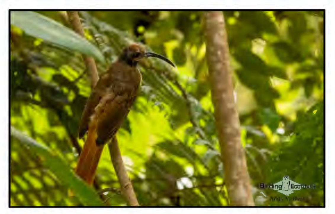
We enjoyed some amazing views of Black-billed Sicklebill , a species usually high in the canopy, this one dropped nice and low to give some eye-level views.