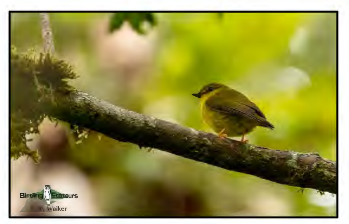
The rather cute and tiny Canary Flyrobin was seen well on many occasions in the Arfaks.

Those staying at the middle elevations enjoyed plenty of good birds too, with their highlights from the morning watching an incredible display between five Magnificent Birds-of-paradise . These birds put on quite the show. They visited Anggi Lakes in the late morning where they found the top target, the highly range-restricted Grey-banded Mannikin , along with a great record of Swamp Harrier – potentially the first record for New Guinea's "Bird's Head Peninsula" and West Papua! Other good birds included Papuan Grassbird and Tricolored Grebe .