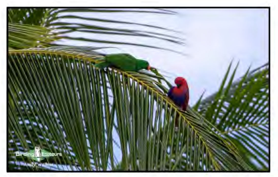
Papuan Eclectus was a popular parrot which was enjoyed daily on Waigeo.

A non-birding day with everyone departing for onward travel in the morning. A huge thank you must go out to our excellent local team of guides, porters, cooks, drivers, etc., for helping make the tour run so smoothly, we are already excited to return next year. Another huge thank you to all the tour participants for making this such an enjoyable trip!