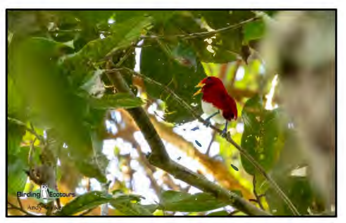
King Bird-of-paradise showed well in the mid-canopy. What a striking bird.