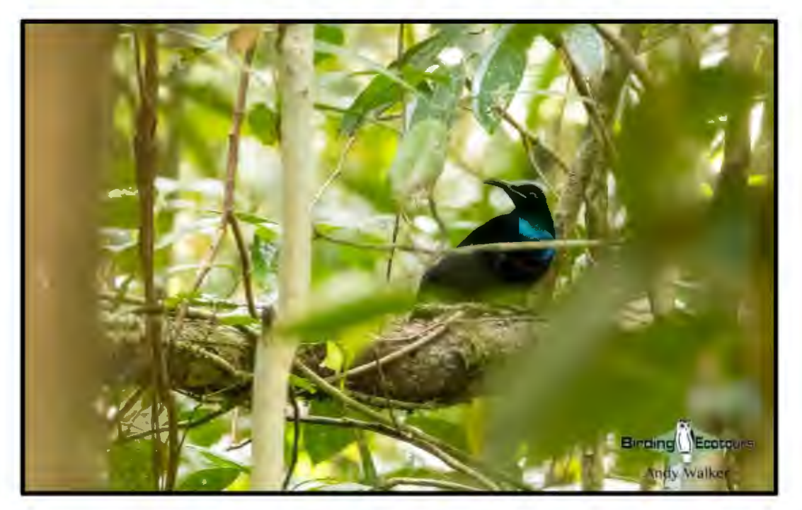
We enjoyed watching the gorgeous Magnificent Riflebird on a display perch deep in the forest.

As we entered the forest, we found plenty more birds, including Hooded Pitta, Sooty Thicket Fantail, Chestnut-bellied Fantail, Northern Fantail, Frilled Monarch, Yellow-breasted Boatbill, Olive Flyrobin, Black-sided Robin, Arafura Shrikethrush, Puff-backed