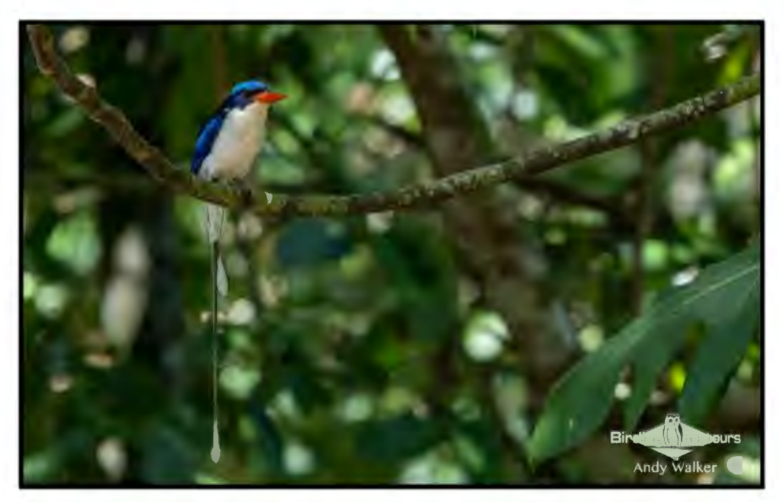
This gorgeous Common Paradise Kingfisher gave excellent close and unconcerned views.

Late in the morning we took a speedboat over some rather lumpy water to nearby Kri Island. We arrived a little wetter than when we set off but soon dried off given the heat! We took a walk around the dive resort grounds and found several exciting birds, such as Common Paradise Kingfisher , Dusky Megapode , Violet-necked Lory , Claret-breasted Fruit Dove , Shining Flycatcher , Singing Starling , Moluccan Starling , Mimic Honeyeater , and had great views of Glossy-mantled Manucode , a rather distinctive bird-of-paradise.