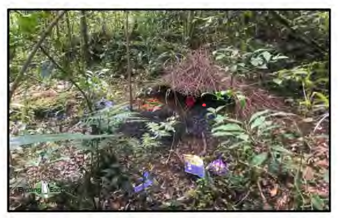
The Vogelkop Bowerbird's bower is a seriously impressive sight!

We started the tour with some birding near Manokwari in an area of degraded forest. Several doves and pigeons were noted, including Pink-spotted Fruit Dove , Papuan Mountain Pigeon , Sultan's Cuckoo-Dove , and Great Cuckoo-Dove , with several other fleetingly glimpsed birds getting away from us. Northern Variable Pitohui were vocal but, typically, did not show well. Some of us had brief views of Black Sunbird and Olive-backed Sunbird and several kingfishers were heard distantly ( Hook-billed Kingfisher , Rufous-bellied Kookaburra , and Yellow-billed Kingfisher ). A couple of male Blyth's Hornbills flew over, their heavy wingbeats giving their presence away. We also saw New Guinea Friarbird , Spangled Drongo , Northern Fantai , Tawny-breasted Honeyeater , Streak-headed Mannikin , and a perched Sulphur-crested Cockatoo . A few heard only species included Lesser Bird-of-paradise and Black Butcherbird . In terms of raptors, a Brahminy Kite soared along the road, we had a close hunting Oriental Hobby zoom through carrying some food, and Grey-headed Goshawk shot through at eye-level, it was so close that some of us could see the red bare parts! Not a bad effort in tough conditions and all before breakfast.