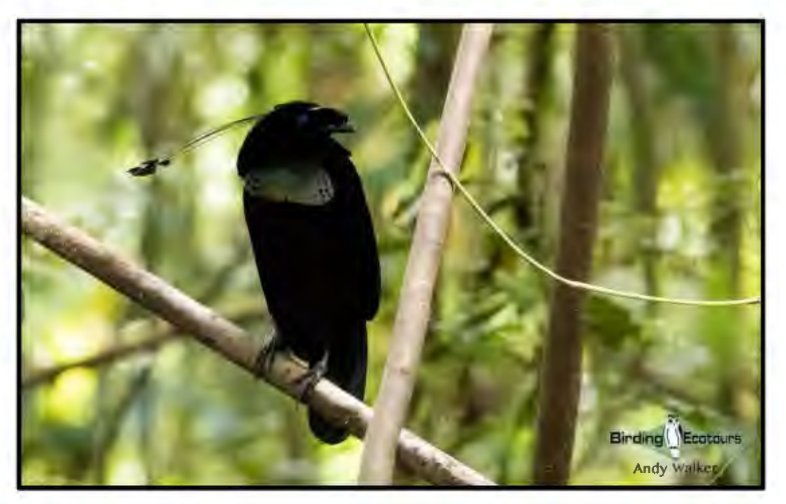
Western Parotia gave us some excellent views.

This <u>Indonesian bird tour</u> visited the West Papua and Southwest Papua provinces and started in Manokwari on the 1<sup>st</sup> of August 2023 and ended in Sorong on the 12<sup>th</sup> of August 2023. During the tour, our birding was focused on the Arfak Mountains and the island of Waigeo. Both areas are rightly world-renowned for their spectacular birds-of-paradise and endemic birds, and our attention was firmly set on finding as many of these jewels as possible. We recorded 211 species on the tour (16 of these heard only – most of these while in birds-of-paradise blinds). Trip lists follow the report. The list of highlights was very long and included 13 birds-of-paradise seen, these were: Wilson's Bird-of-paradise , Magnificent Bird-of-paradise , Red Bird-of-paradise , King Bird-of-paradise , Western Parotia , Crescent-caped Lophorina , Black Sicklebill , Black-billed Sicklebill , Magnificent Riflebird , Long-tailed Paradigalla , Arfak Astrapia , Trumpet Manucode , and Glossy-mantled Manucode .