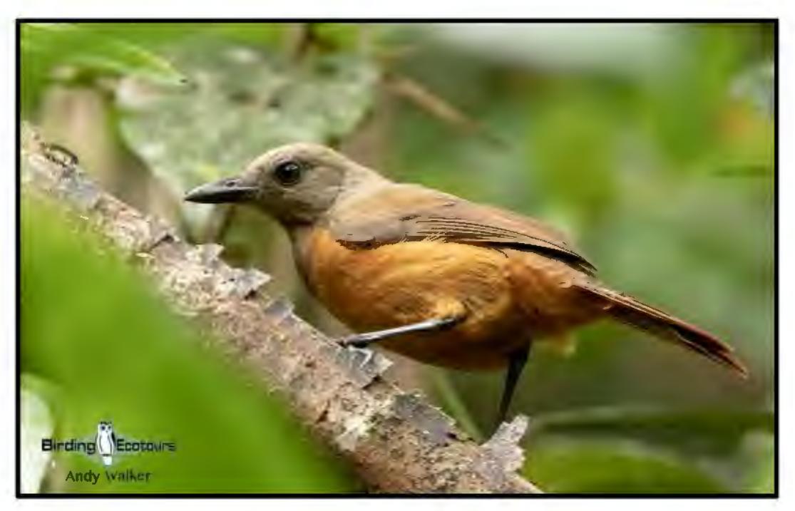
We had great looks at localized Raja Ampat Pitohui while birding on Waigeo.

Papuan Pitta , Yellow-bellied Longbill , Rusty Mouse-warbler , and Green-backed Gerygone . We also saw a couple of female Red Birds-of-paradise briefly as they were foraging (with more males heard distantly).