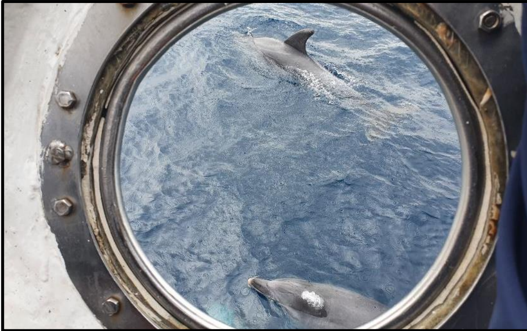
This was how close we were to Bottlenose Dolphin during our whale watching trip off Tarifa.