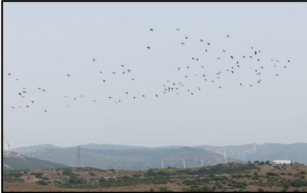
We had several flocks of White Stork flying overhead.

Next we decided to take a walk through Los Lances Nature Reserve . Here, good numbers of shorebirds (waders) roamed the coastal lagoon, mostly Dunlin and Sanderling . We also had the first sign of active migration, with a few European Honey-buzzard , Short-toed Snake-Eagle and Eurasian Sparrowhawk flying low above the beach, and more passing European Bee-eater too.