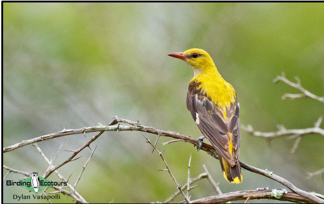
Eurasian Golden Oriole was seen around the Los Alcornocales Nature Reserve.