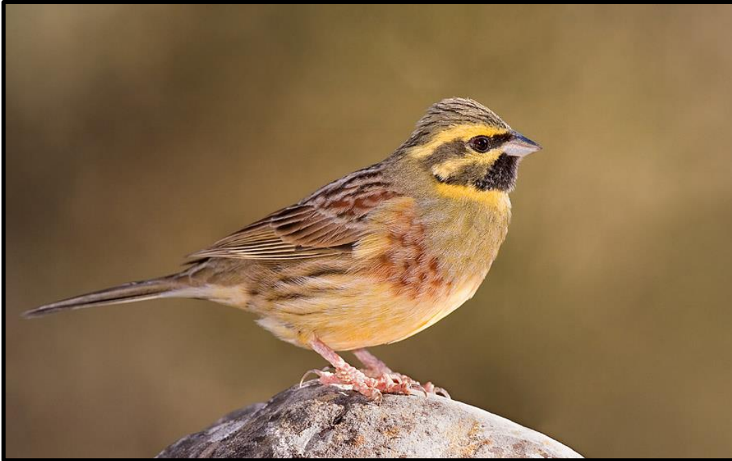
Cirl Bunting was one of the iconic species of the mountains around Ronda.

We drove back to our accommodation for a break, a dip in the pool for some, and got ready for a short drive to the lovely town of Ronda. Here we took a walk along the famous Tajo de Ronda, with phenomenal views of the surrounding peaks. We had a playful flock of Red-billed Chough entertaining us through the walk and all the way to the restaurant, where we had our last dinner of the tour with splendid views to the setting sun against the mountains.