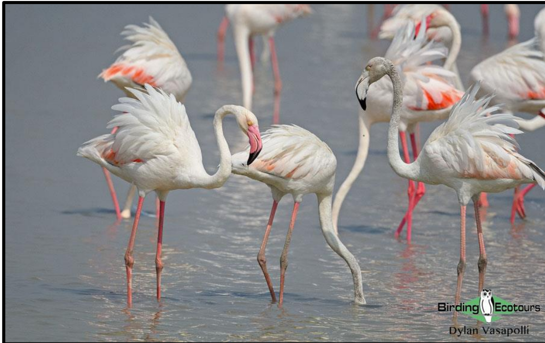
Greater Flamingo was one of the birds we definitely had to see in southern Spain!

Collared Pratincole , as they are less predictable during this time of the year while they are on migration or preparing to head to Africa . Even more exciting was to find Marbled Teal , a species that is on the Critically Endangered bird list for Spain and is Near Threatened with extinction globally (Birdlife International). In total we spotted 15 birds, including some ducklings. With less than 100 pairs in the country, this was quite an amazing total.