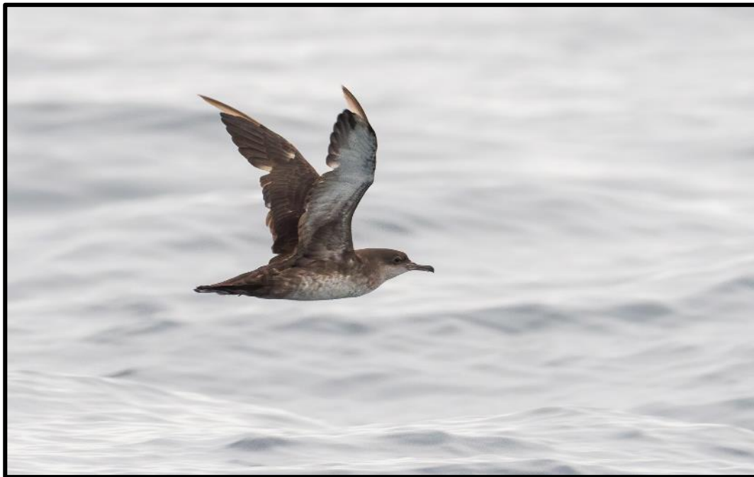
We enjoyed great views of the Critically Endangered Balearic Shearwater during our pelagic trip in the Gulf of Cadiz.

Following the pelagic we had one of the best meals of the trip, consisting of a fantastic paella and fresh fish. We then went back to the hotel to pick up our luggage and started driving to Tarifa. We had time to stop on the way and try for White-rumped Swift. We spent a bit of time at a strategic location in the Cork Forest of the Los Alcornocales Natural Park but alas the swift didn't show. However, we did bag ourselves a stunning European Roller which perched on a wire for us to see comfortably with the scope. European Roller can be very unpredictable on migration, so this was a nice addition to our list. We also enjoyed our first Alpine Swift of the trip as well as some European Honey-Buzzard , Griffon Vulture , and Booted Eagle . After this brief, but productive stop we continued to our hotel near Tarifa where we would stay for the next four days.