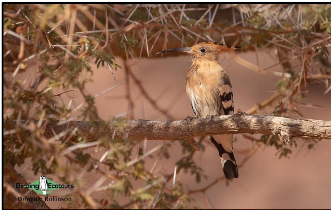
Eurasian Hoopoe, one of Europe's most striking birds, was a pleasure to see.

During our first day of birding, we visited some of the best bird-watching sites in Seville province: El Pantano and Brazo del Este . El Pantano was good for a general introduction to the birds of southern Spain. We had our first European Turtle Dove , Pallid Swift , Eurasian Hoopoe and European Bee-eater , for instance. However, the main reason for visiting this site was to look for Laughing Dove , a bird almost absent in Europe but that has been present here for the last few years. The presence of young birds accompanied by adults indicated breeding. After some short searching in the area, we had a fast view of a flying bird, and shortly afterwards we could see one more, perching briefly on a fence. Other nice birds in the area were Eurasian Penduline-Tit , Red-rumped Swallow , Western Bonelli's Warbler and European Pied Flycatcher .