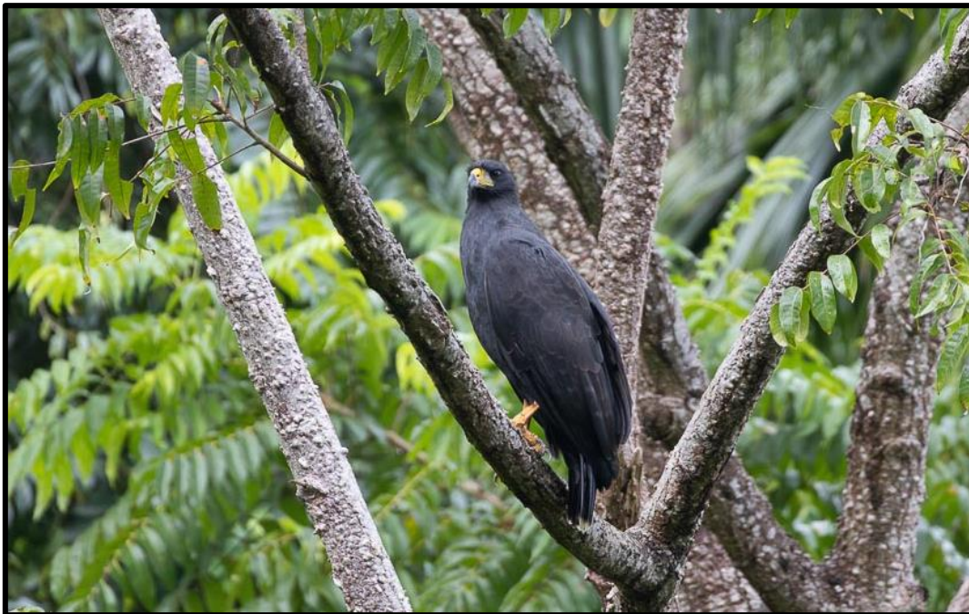
The impressive Great Black Hawk is often seen during our time in Tobago.