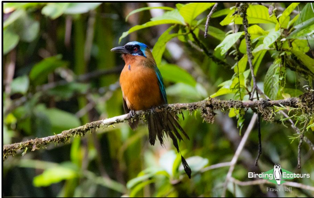
The endemic Trinidad Motmot is wonderfully common on Tobago.

Our tour starts on Tobago, which has a distinctly more Caribbean flavor and is even more picturesque than its larger neighbor, with lush, forested heights sloping gently into beautiful tropical beaches, surrounded by diverse coral reefs. Here we will seek species that are not found on Trinidad, which include the localized White-tailed Sabrewing , found only here or on the Paria Peninsula in Venezuela. Despite its name, the endemic Trinidad Motmot is much more abundant on Tobago, as is Rufous-tailed Jacamar . After taking a glass-bottom boat trip to Little Tobago Island to get up close with some spectacular seabirds which nest on the island, such as beautiful Red-billed Tropicbirds . We then bird our way across Tobago, exploring its wetlands and forests for specials such as Blue-backed Manakin and Venezuelan Flycatcher .