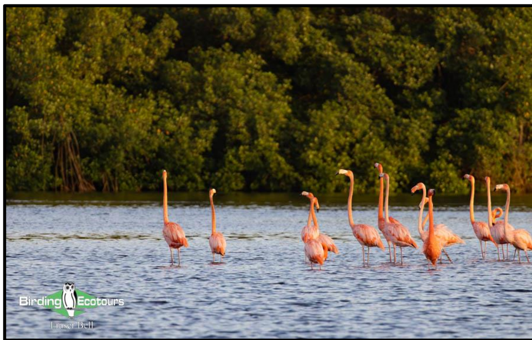
The population of American Flamingo in the Caroni Swamp is expanding.

Savanna Hawk , among many others, and if we're lucky, we may see Ruddy-breasted Seedeater , or Brown-throated Parakeet , both of which are now rare and localized in Trinidad.