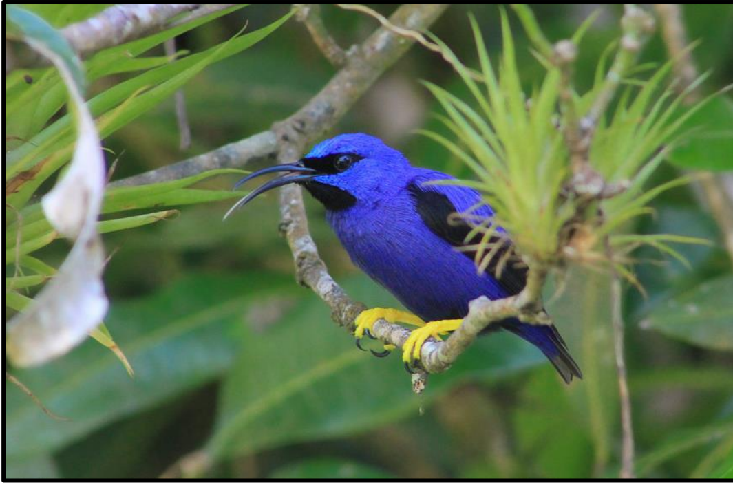
The beautiful Purple Honeycreeper can be seen from Asa Wright's veranda.