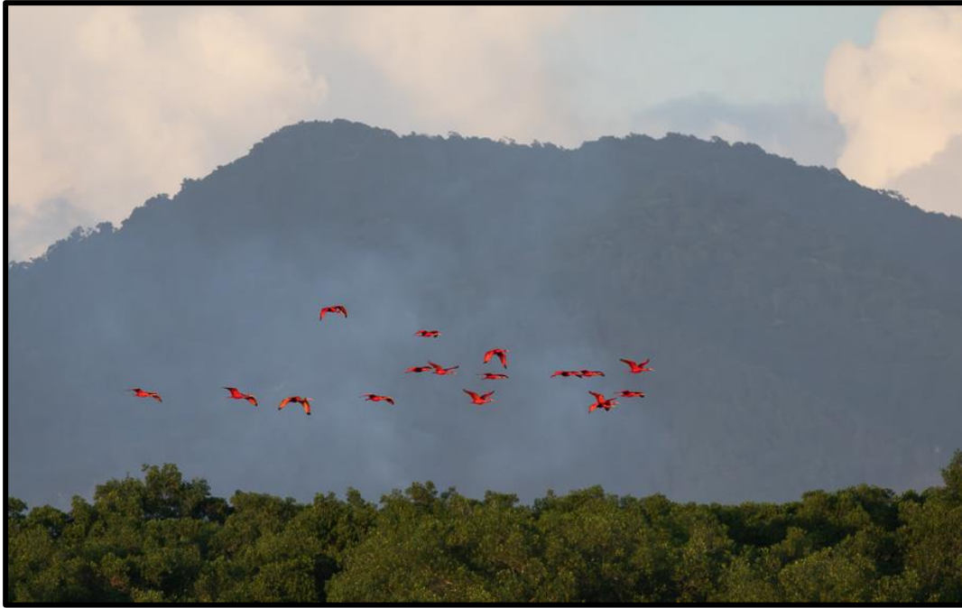
Watching the Scarlet Ibis returning to roost in the Caroni Swamp is such a memorable experience (photo Fraser Bell).

We will explore Trinidad's wetlands, savannah, forests, and coastline, using Asa Wright as our comfortable base, while we seek specials such as Black Hawk-Eagle , Masked Cardinal , Lilac-tailed Parrotlet , and Red-bellied Macaw . During a scenic boat cruise, we'll witness the breathtaking spectacle of thousands of Scarlet Ibis as they return to roost. After five nights at Asa Wright, we will end the tour with two nights in the northeast, where we target Trinidad's one true endemic, the Trinidad Piping Guan . A species once widespread across Trinidad, it is now red-listed by the International Union for Conservation of Nature (IUCN) as Critically Endangered and clings on in the remote forests of Trinidad's mountainous northern range.