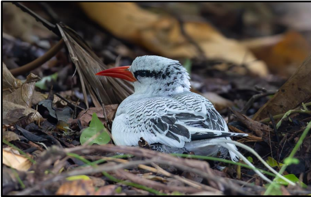
Red-billed Tropicbird nest on the cliff tops of Little Tobago Island.