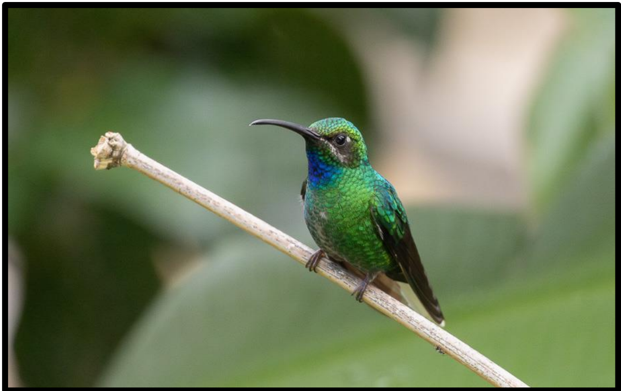
The beautiful near-endemic White-tailed Sabrewing is a major target on this tour.

We have temporarily suspended the set departure version of this tour shown here due to the continued rise in crime across the country, particularly on Trinidad. Please e-mail info@birdingecotours.com if you are interested in a private tour to Tobago