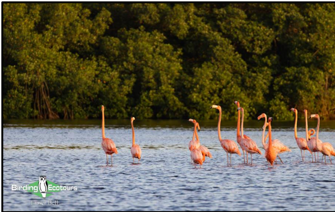
The population of American Flamingo in the Caroni Swamp is expanding.

Savanna Hawk , among many others, and if we're lucky, we may see Ruddy-breasted Seedeater , or Brown-throated Parakeet , both of which are now rare and localized in Trinidad.