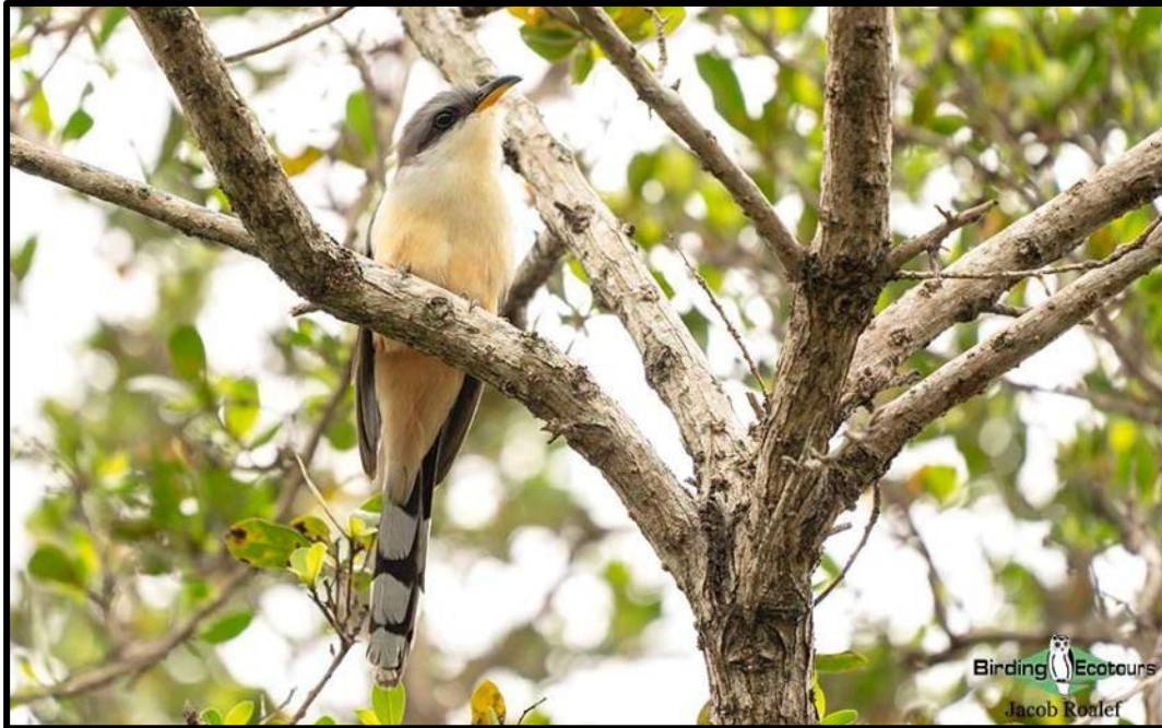
Mangrove Cuckoo is one of the mangrove specials we will seek in southern Tobago.