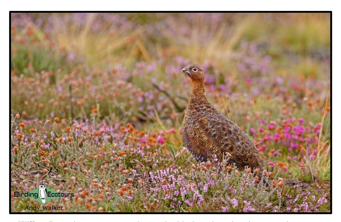
Willow Ptarmigan were one of many highlights of our brief time on the moors.

Finally, we explored the moors near <u>Langdon Beck</u> which again were busy with birds, including Black Grouse , Willow Ptarmigan (Red Grouse), Eurasian Oystercatcher , Northern Lapwing , Eurasian Curlew , Common Redshank , and Tree Pipit .