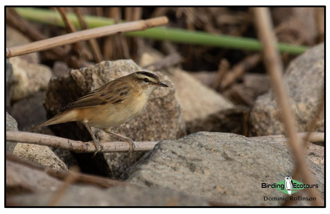
Sedge Warblers were abundant in all suitable habitat during the tour and were extremely vocal on their return to breeding sites after spending the winter in Africa.

Our final birding of the day was a spontaneous stop near the village of Ringstead. Despite the cold wind we enjoyed distant views of Eurasian Dotterel , a great surprise to end a productive birding day.