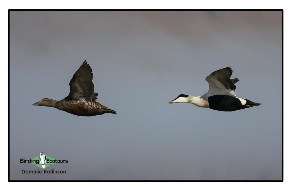
Lovely Common Eiders were yet another highlight from our enjoyable tour.