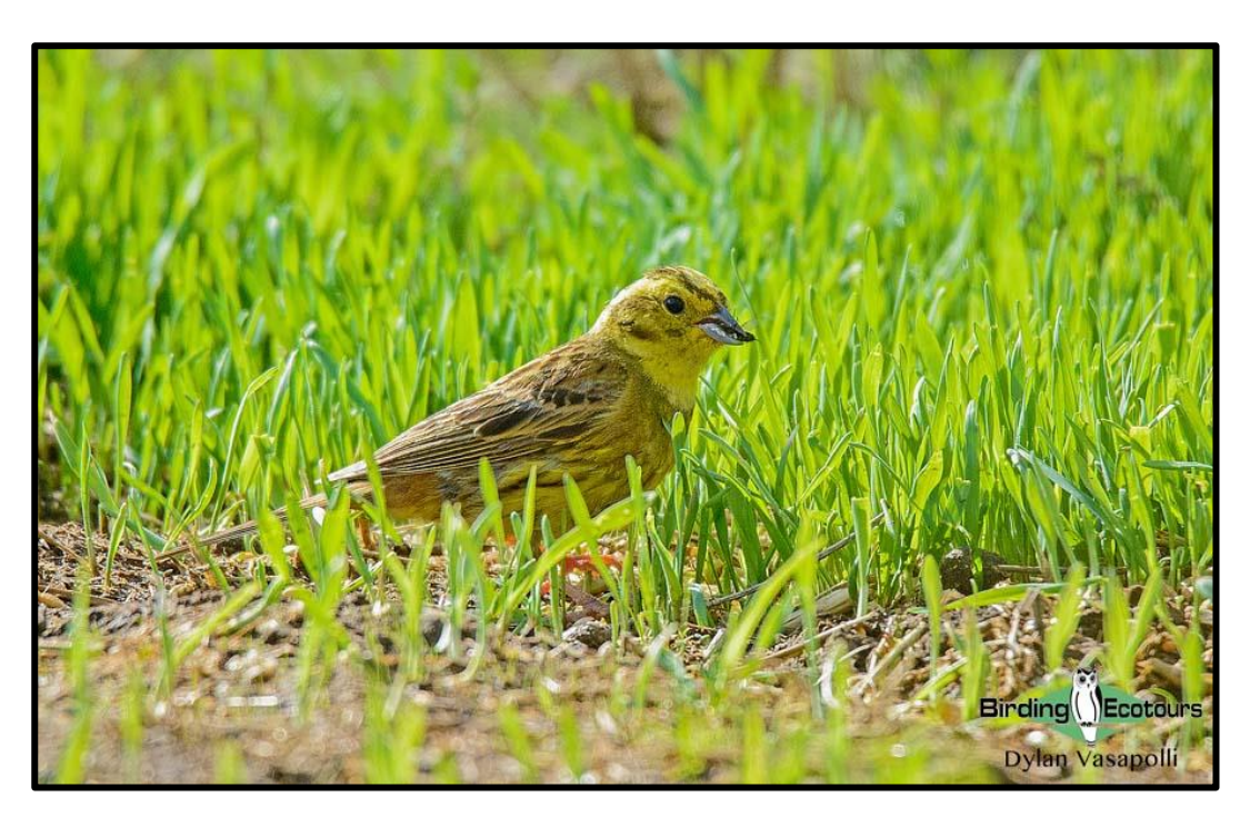
We enjoyed good views of Yellowhammer during the day.

With the weather closing in we headed onto the <u>moors</u>. To our surprise they were a hive of activity with Willow Ptarmigan (Red Grouse), European Golden Plover, Northern Lapwing, Eurasian Curlew, Common Snipe, Western Marsh Harrier, Mistle Thrush, Whinchat, Northern Wheatear, and Tree Pipit all present.