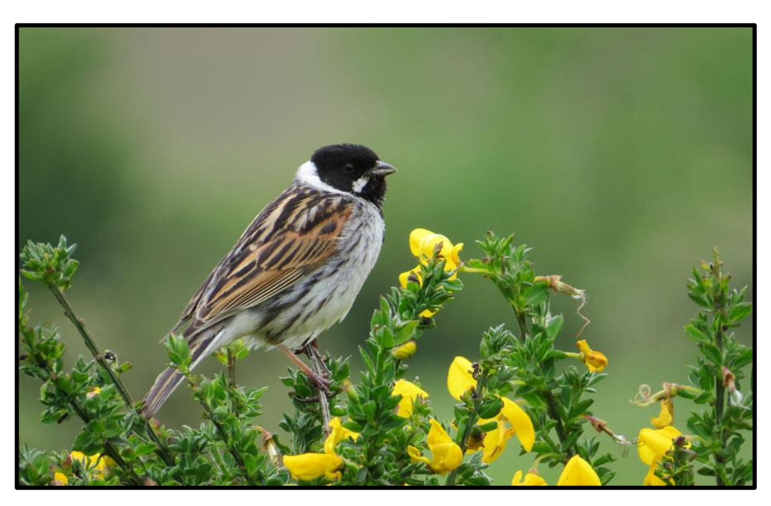
While in Norfolk we enjoyed fabulous views of Common Reed Bunting.

After lunch we visited the far lesser-known <u>Burnham Norton marsh</u>. Despite the lack of spring rain leaving the area quite dry, we were able to enjoy good views of Brant (Dark-bellied Brent) Goose , Northern Shoveler , Gadwall , Pied Avocet , Great Egret , Eurasian Spoonbill , and Bearded Reedling – an exciting monotypic family and attractive species.