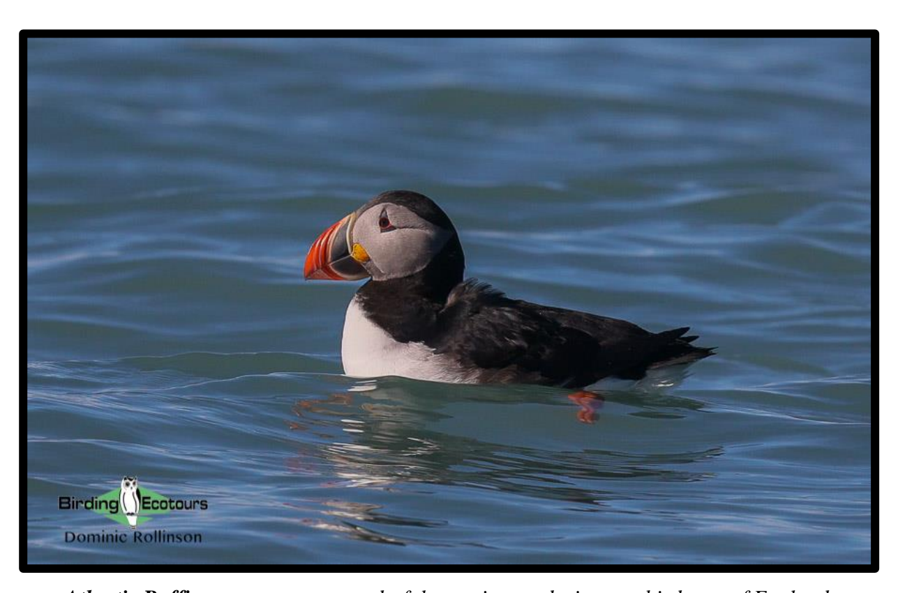
Atlantic Puffin gave us many wonderful experiences during our bird tour of England.