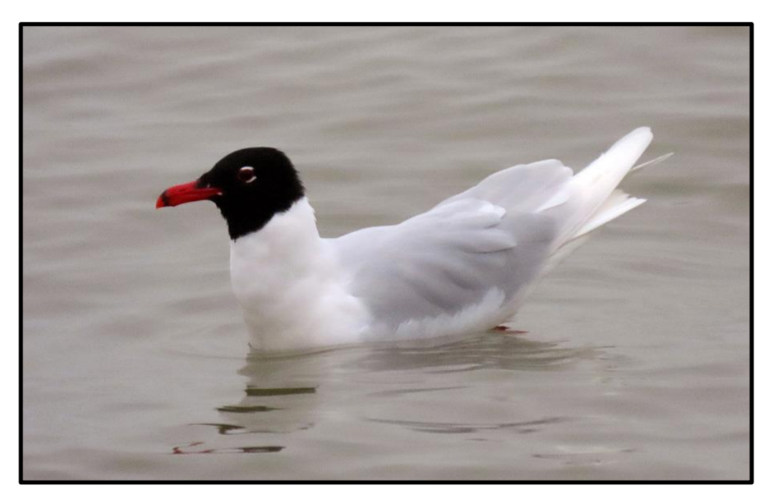
While in Suffolk we enjoyed amazing views of the striking breeding-plumaged Mediterranean Gull.

The first day of the tour was an arrival and transfer day from London Heathrow to Westleton in Suffolk. After a three-hour drive from Heathrow airport in London, we arrived in rural eastern Suffolk to relax at our hotel. In the evening we took a short drive to look for Common Nightingale and had three birds singing, however sadly none showed well, but it was good to know that they had arrived from their <u>African</u> wintering grounds and we'd be sure to look for them early the following day.