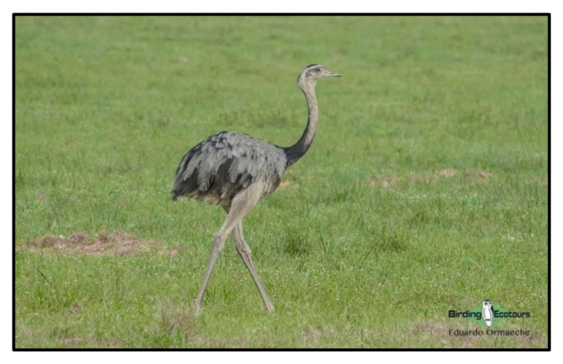
Greater Rhea, a classic southern South American species, seen on our Paraguay birding tour.

Even though most of the roads in Paraguay have improved in recent years, we still needed 4x4 vehicles to drive through the Chaco. On this particular trip with only five participants, we had two 4x4 vehicles to provide each participant with their own window seat to view the Paraguayan countryside. Our first stop took us into the humid Chaco where we had many iconic birds from southern South America such as Greater Rhea and Southern Screamer. These were followed by Brazilian Teal, Wood Stork, Cocoi and Striated Herons and the attractive-looking Whistling Heron. We then added a few water- and wetland-associated species such as Snail Kite, Black-collared Hawk, Black-backed Water Tyrant, the stunning Scarlet-headed Blackbird, Giant Wood Rail, Limpkin, and lots of Wattled Jacanas.