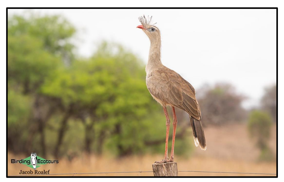
Red-legged Seriema was seen well on our trip.