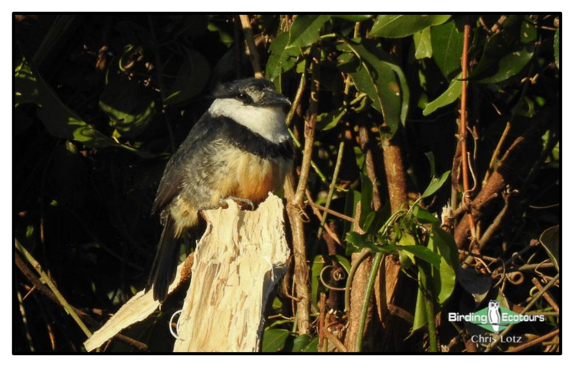
Buff-bellied Puffbird was one of the many standout species on this Paraguay birding tour.

Plumbeous Ibis, Ringed Teal, Surucua Trogon and Buff-bellied Puffbird . Early morning and night drives resulted in great views of Giant Anteater , Pampas Fox , Crab-eating Raccoon , Southern Three-banded Armadillo and several Lowland Tapirs . Furthermore, we had glimpses of Ocelot and Geoffroy's Cat and we found fresh Jaguar and Puma tracks all over the Teniente Enciso National Park.