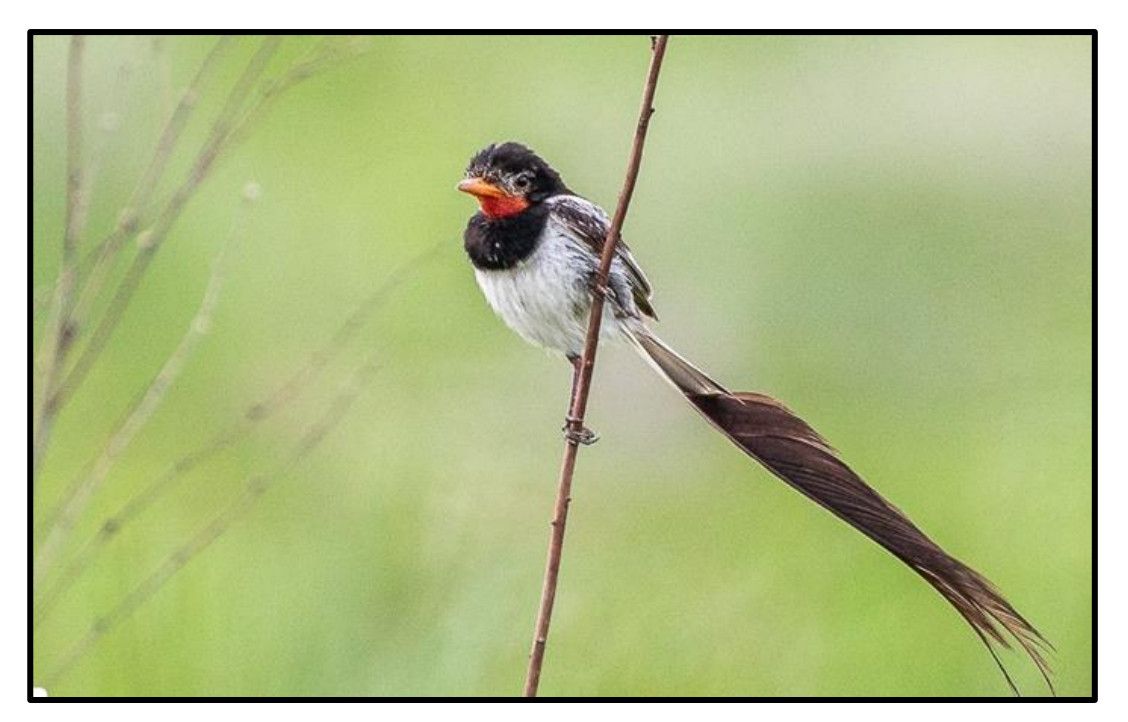
It was great to find the sought-after Strange-tailed Tyrant.

We then continued our long drive to Loma de Plata and as the day was ending, we arrived at some freshwater ponds. This stop added Giant Wood Rail, Collared Plover, Pectoral, and Solitary Sandpipers, Greater and Lesser Yellowlegs, Greyish Baywing, Great Kiskadee, Great Pampa Finch, Plain Inezia, Black-backed Water Tyrant, our first Crested Hornero and included great views of White and Checkered Woodpeckers.