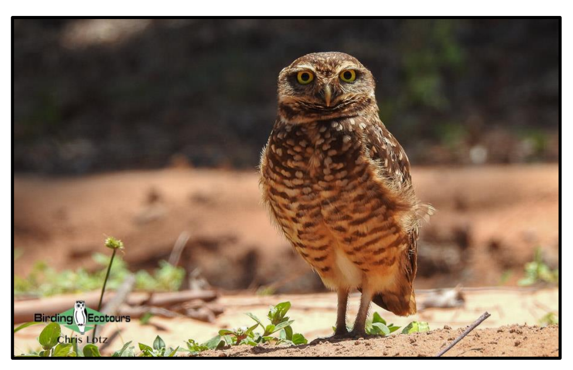
Burrowing Owl is always a crowd-favorite.