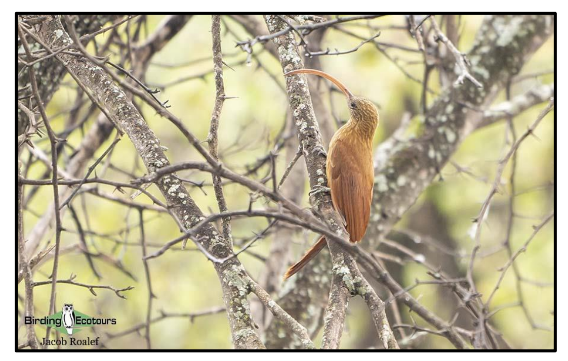
The bizarre-looking Red-billed Scythebill.

Gnatcatcher, Chestnut-capped Blackbird, Ultramarine Grosbeak, Yellow-billed Cardinal, Red Pileated Finch, Pampa Finch, Double-collared and Rusty-collared Seedeaters.