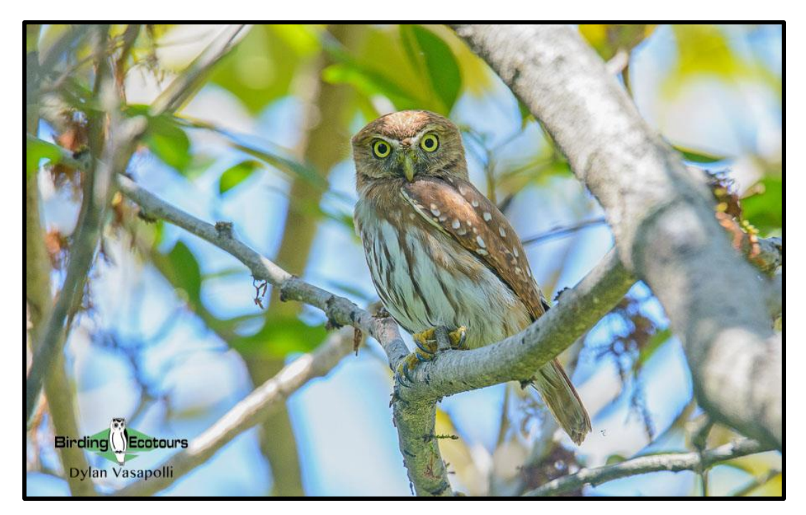
The feisty Ferruginous Pygmy Owl was seen near Loma de Plata.

At a nearby lake we saw Coscoroba Swan , Brazilian Teal , Roseate Spoonbill , Southern Lapwing , Jabiru , and Large-billed Tern . In the surroundings of the lake we found Great Horned Owl at a daytime roost and also saw our first Ferruginous Pygmy Owl of the trip.