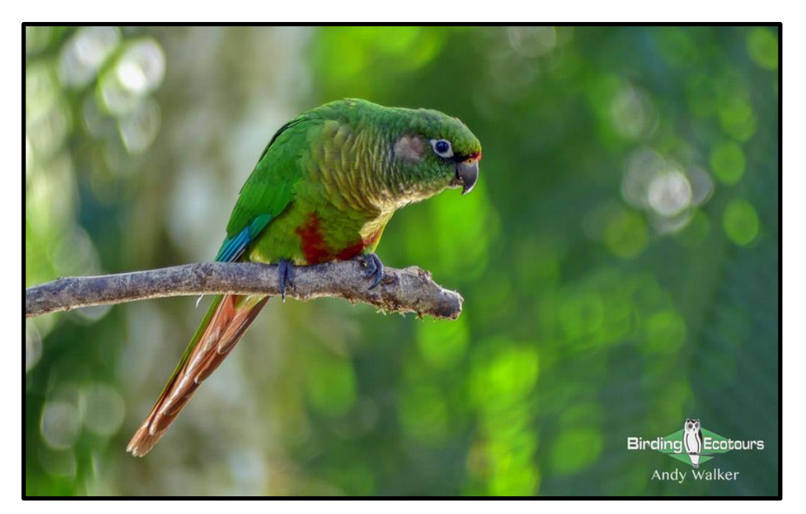
Maroon-bellied Parakeet is always a pleasure to see in the Atlantic Forest.

After dark we tried for some night birds and were rewarded with incredible views of Rufous Nightjar , Pauraque , Short-tailed Nighthawk , American Barn Owl and Black-capped Screech Owl .