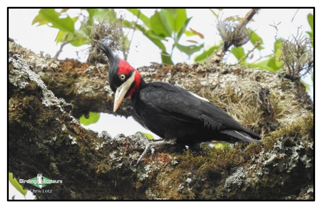
Our Paraguay birding tour was great for woodpeckers including this Cream-backed Woodpecker

The star of the day, and highlight for several participants, was the beautiful Olive-crowned Crescentchest which showed amazingly well for everybody. Other birds found this morning included species such as Plain Inezia, Chaco Earthcreeper, Fulvous-crowned Scrub Tyrant, (a recent split from Tawny-crowned Pygmy Tyrant), Crested Hornero, Many-colored Chaco Finch, Black-capped Warbling Finch, Narrow-billed and Great Rufous Woodcreeper, White-fronted, Checkered and Cream-backed Woodpeckers, Blue-crowned Parakeet, Turquoise-fronted Amazon, and some of the group managed to get glimpses of the elusive Crested Gallito.