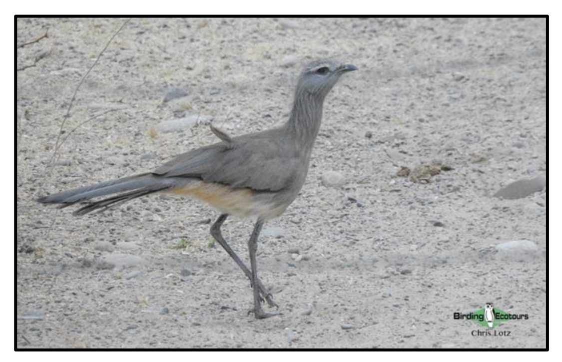
Black-legged Seriema at Teniente Enciso National Park.

We arrived at the park where we were greeted by the local park guard who escorted us along the trails of the thick and dense national park. It was still hot by 4 p.m. and although there was not much bird activity, we saw a few classic species such as Chaco Chachalaca , Picazuro Pigeon , Brown-crested Flycatcher , Brown Cacholote , and Monk Parakeet . We also added new species such as Laughing Falcon , Harris's Hawk , American Kestrel , Turquoise-fronted Amazon and Sick's Swift . We found fresh Puma tracks and some day-old Jaguar tracks. Amazingly, a Sixbanded Armadillo appeared on the trail as it had been scared by the group. Alarmed by the noise, it ran straight at me as I stood at the end of the line and came to a halt right at my feet.