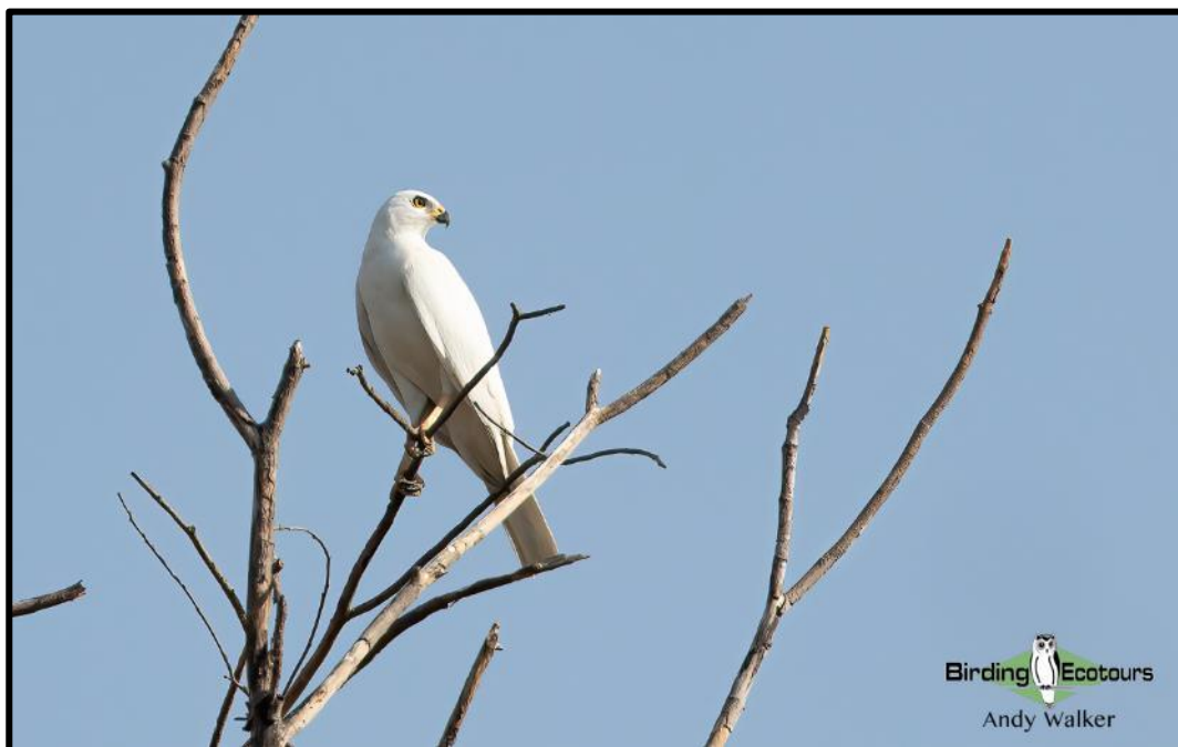
The striking white plumage of a white-morph Grey Goshawk.

We spent the morning walking around some more rocky outcrops, eventually finding our main target of the morning. We started off with sightings of several Chestnut-quilled Rock Pigeons and several other birds we had seen the previous day, such as Rainbow Bee-eater , Green Oriole , and Blue-winged Kookaburra . Walking around the rocks (which looked stunning in the early morning light), we found Short-eared Rock Wallaby , but still no sign of what we were really looking for! Pretty distractions abounded, such as Red-backed Fairywren , Crimson Finch , Double-barred Finch , and Long-tailed Finch . Finally, we heard our main target – Sandstone Shrikethrush ; however, there was no way to get to it, and it wouldn't come to us. Very frustrating. One final bit of excitement here involved a white bird sat in a bare tree along the trail, not the usual Little Corella , Sulphur-crested Cockatoo , or Torresian Imperial Pigeon that we had been seeing over the previous days, but rather a beautiful white-morph Grey Goshawk .