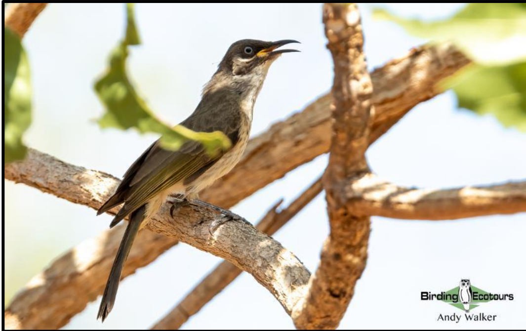
The localized White-lined Honeyeater showed well.