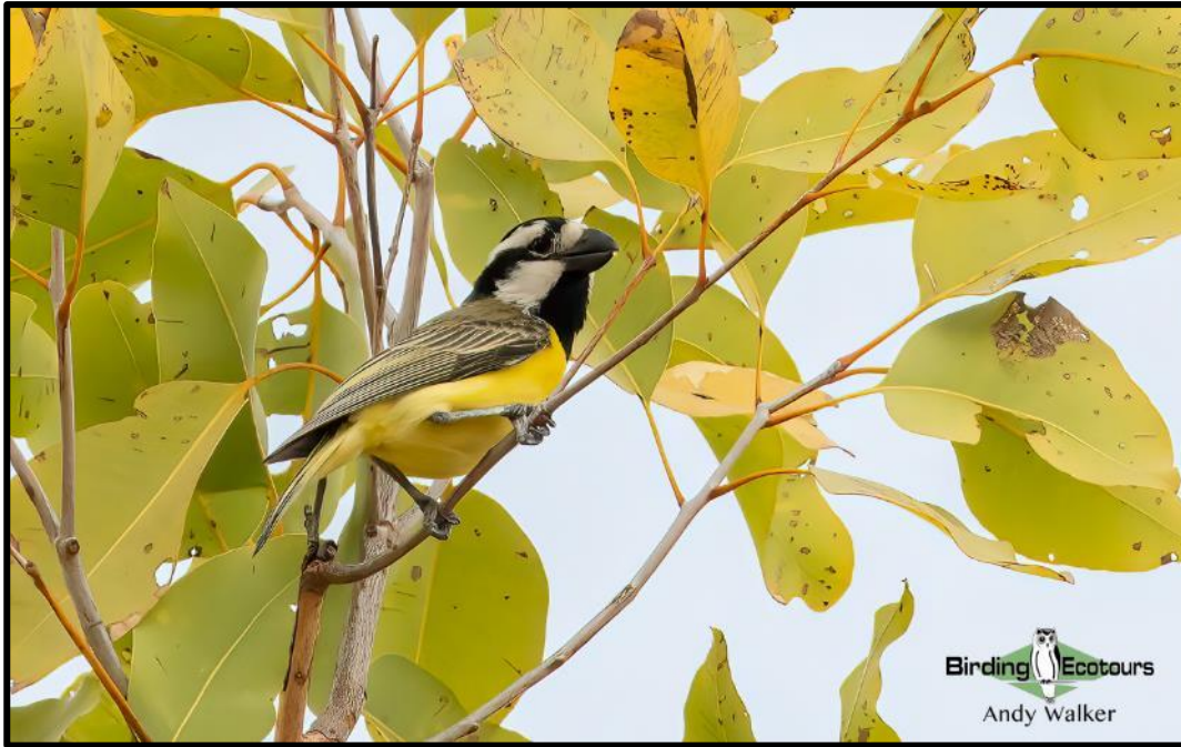
We enjoyed watching a pair of Northern Shrike-tits near Katherine.

formerly part of the Crested Shrike-tit complex. The shrike-tit took some locating in the vast area of suitable habitat, but when we heard it, we were able to locate a pair of birds, which then gave some good views. Driving around Katherine just before lunch, we picked up a pair of Red-backed Kingfishers .