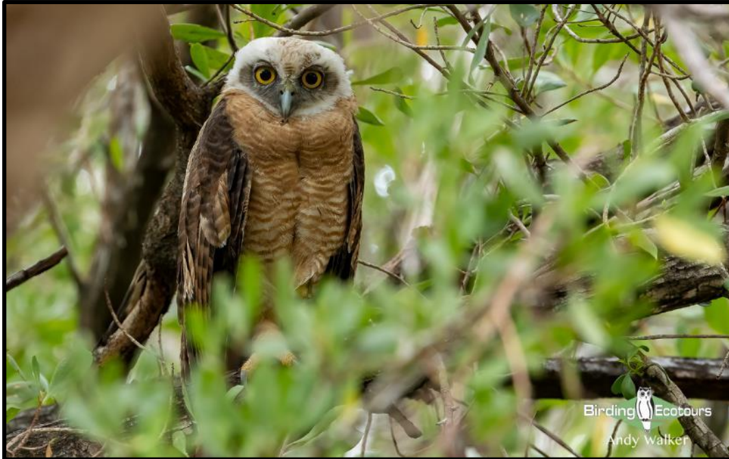
What a way to end the tour, with point-blank views of a young Rufous Owl in Darwin.