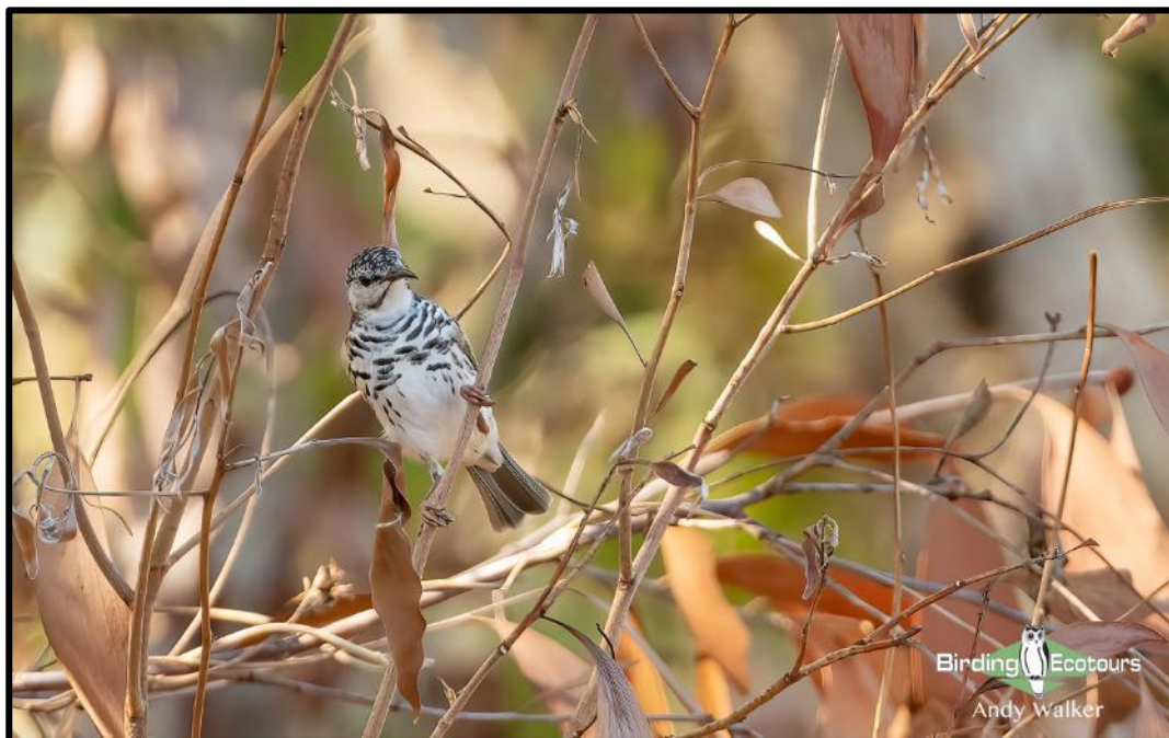
The attractive Bar-breasted Honeyeater was present in large numbers.

After our birding session, we had a welcome dinner together, catching up and discussing what we were hoping to see on this Australian birding tour of the Top End, Northern Territory.