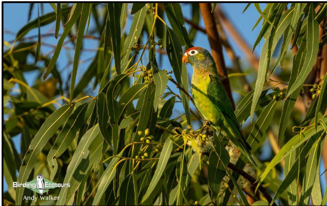
One of the special birds of the Top End, Varied Lorikeet , glowing in the early morning sunlight.

Some of the highlight birds seen on this Top End bird tour included regional specials such as Rainbow Pitta (voted “bird of the trip”), Chestnut Rail , Radjah Shelduck , Orange-footed Scrubfowl , Rufous Owl , Black-banded Fruit Dove , Chestnut-quilled Rock Pigeon , Partridge Pigeon , Chestnut-backed Buttonquail , Brolga , Black-necked Stork , Pied Heron , Hooded Parrot , Northern Rosella , Red-collared Lorikeet , Varied Lorikeet , Cockatiel , Blue-winged Kingfisher , Red-backed Kingfisher , Black-tailed Treecreeper , Great Bowerbird , Bar-breasted Honeyeater , White-lined Honeyeater , Red-headed Myzomela , Arafura Fantail , Arafura Shrikethrush , Sandstone Shrikethrush , Silver-backed Butcherbird , Northern Shriketit , Mangrove Golden Whistler , Paperbark Flycatcher , Broad-billed Flycatcher , Buff-sided Robin , Canary White-eye , Green-backed Gerygone , Mangrove Gerygone , Crimson Finch , Masked Finch , Long-tailed Finch , and Gouldian Finch .