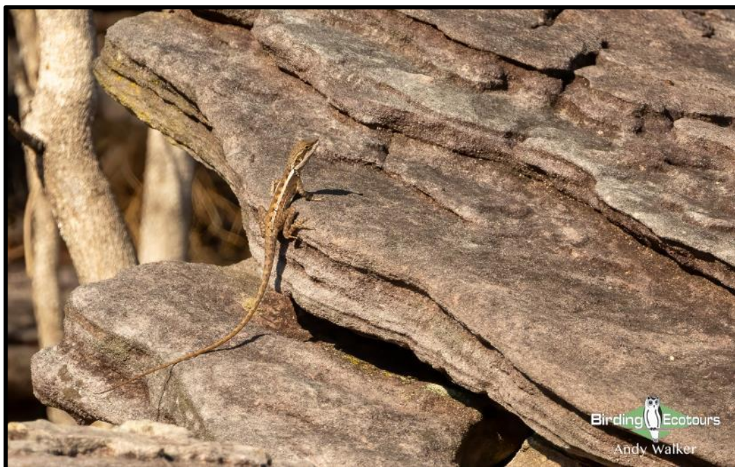
Gilbert's Dragon was seen frequently during the tour.