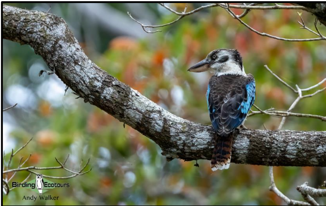
Kingfishers featured heavily on the tour, and the huge Blue-winged Kookaburra was recorded on most days, often given away by their raucous and far-carrying calls.