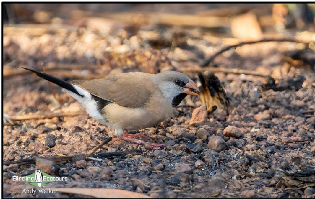
Long-tailed Finch gave us great close views.

We had a short pre-breakfast birding session near our accommodation in Darwin, where we picked up some more new species, as well as gaining more views of some we'd seen over the previous days. Some of these birds included Arafura Shrikethrush, Long-tailed Finch, Chestnut-breasted Mannikin, Forest Kingfisher, Green-backed Gerygone, Galah, Red-tailed Black Cockatoo, and Pacific Emerald Dove.