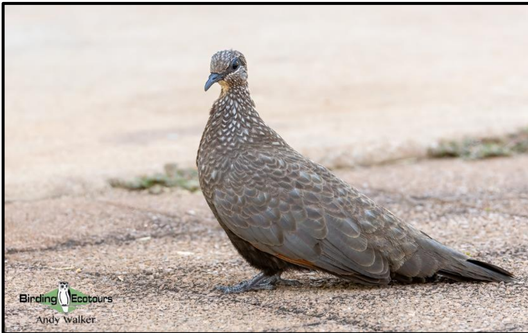
Chestnut-quilled Rock Pigeon gave us very good views as they came down to the ground to drink.

In the late afternoon, we went to a gorgeous lookout to admire the sunset and ancient rock art and saw a few more good birds too! It was a great way to end the day.