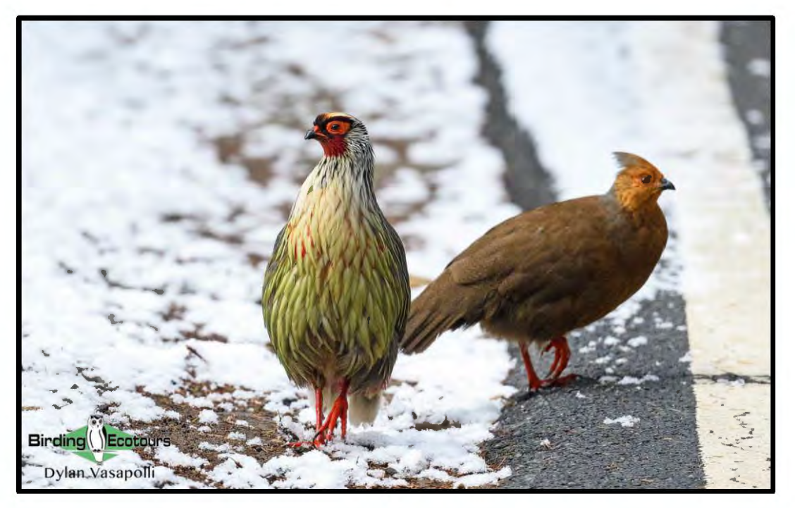
Blood Pheasants feeding in the road were an early tour highlight.

Yellow-billed Blue-Magpies roved about at our breakfast stop, while noisy Spotted Nutcrackers called from the tops of the pines. The very top of the pass still had a bit of snow, and here we enjoyed our first laughingthrush – Black-faced Laughtingthrush , as they bounced around. Careful scrutiny of the small shrubs here gave us busy White-browed Fulvettas and a large party of Rufous-vented Yuhinas , while stately Blue-fronted Redstarts were commonly seen. A large flock of Plain Mountain Finches was the last sighting of note, before we started working our way back down to Paro for a midday break. The afternoon was leisurely spent birding around the Paro Chhu (River) slightly further afield from town, and here, we did well to find a pair of the highly sought-after Ibisbills . We spent some time watching these masterfully camouflaged birds (they almost perfectly resemble the rocks they feed within) go about their business, before setting off to try for another highly desired bird, Wallcreeper. We were unsuccessful in our quest for Wallcreeper, but did find the likes of Eurasian Hoopoe, Eurasian Kestrel, Black Bulbul and the beautiful Rufous-breasted Accentor .