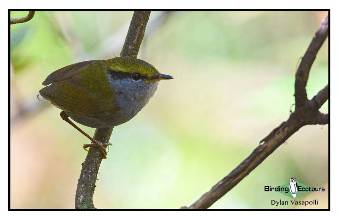
Tesias are normally ultra-shy birds, and this Grey-bellied Tesia showed uncharacteristically well for us – along with its close cousin, Chestnut-headed Tesia.