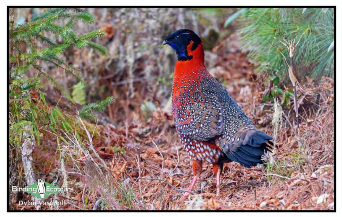
Satyr Tragopan is not only the "top-of-the-list" special for visiting birders to Bhutan, but easily one of the ultimate birds to be found anywhere in the world. We hunted high and low on this tour, and eventually had our day with this mega.

We were up pre-dawn and heading up the Yotong La Pass above Trongsa, where we would try for Satyr Tragopan . Numerous calling Hill Partridges greeted us in the early morning, but refused to show. A lovely Crested Goshawk flew over us, and a pair of Darjeerling Woodpeckers drummed from a dead tree. Before long, we heard our tragopan calling, and as it turned out, we heard many different birds calling throughout the morning. The gods weren't smiling on us sadly, as no matter what we tried or how much patience we showed, we came away empty handed. It was generally a birdy morning and we had many good sightings of species we had seen on the tour already, with tits, warblers, yuhinas, sunbirds and laughingthrushes all obliging. A Dark-sided Flycatcher showed well perched atop a spruce, as did several Olive-backed Pipits , all displaying from the tree tops with spring in the air. As the morning went on, the tragopans stopped calling, and we reluctantly carried on our journey. Fortunately, we weren't heading far – virtually over the hill to Bumthang. We birded our way down the opposite side of the pass, where we enjoyed a few Large-billed Leaf Warblers along with multiple feeding flocks that included several other warblers, yuhinas, minlas and tits.