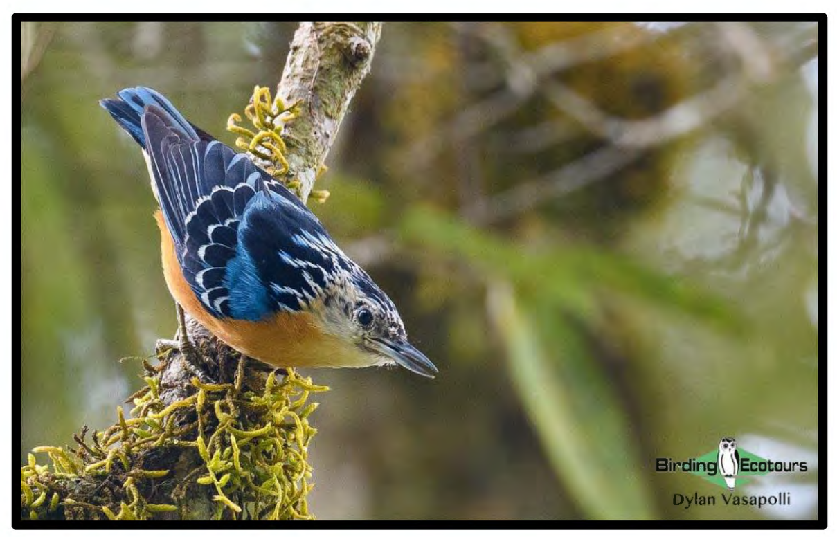
Beautiful Nuthatch is one of the many sought-after specials we found on our Bhutan tour.