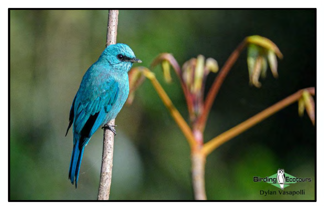
Verditer Flycatchers were commonly seen in Bhutan – but never did we tire of seeing them.

The drive down to Tingtibi from Trongsa is a long, windy road, and combined with regular birding stops, takes the bulk of the day. The higher broad-leafed forests nearer Trongsa were very birdy in the morning. A superb sighting of a Himalayan Cuckoo kicked things off, and was followed soon after by the scarce Plaintive Cuckoo . A pair of the stunning White-browed Shrike-babblers quietly went about their business, before the perhaps even more stunning Black-eared Shrike-babbler took their place. Black-throated Bushtits were seen in places, as were Streak-breasted Scimitar Babblers along with several warblers and yuhinas. A Rusty-fronted Barwing was a good find in an open patch, and here we also picked up both Himalayan and Black-throated Prinias . A roadside stream gave us a fine Spotted Forktail , and Verditer Flycatcher and both Blue-capped and Chestnut-bellied Rock Thrushes were commonly seen. We had several sightings of Mountain Hawk-Eagles flying overhead, and also added a lone Crested Bunting and a pair of very loud Rufous-necked Laughingthrushes to our list.