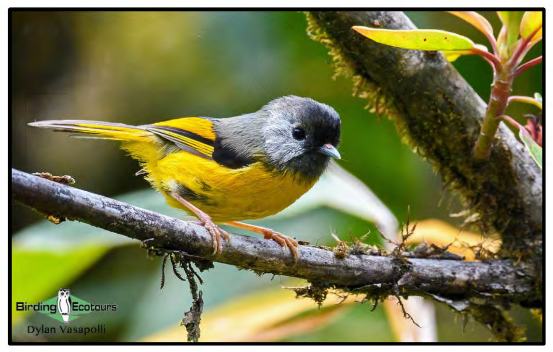
Golden-breasted Fulvetta is a beautiful denizen of bamboo stands within forests. These curious birds put on a fine show for us!