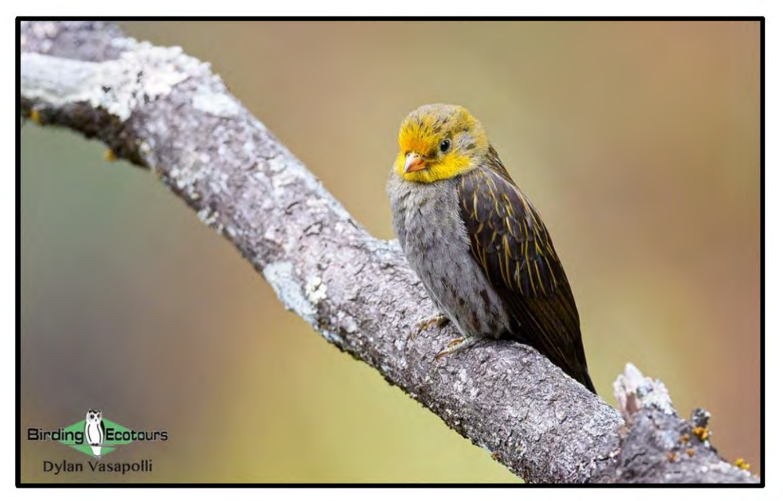
Yellow-rumped Honeyguide are often seen around colonies of rock bees.

We were up and out of Paro nice and early, bound for the country's capital city, Thimpu. We headed straight for the local sewage works where we added a head of new birds. Several Gadwall were sitting on some of the ponds, and were soon joined by a lone Common Pochard , while several Ruddy Shelduck and a Eurasian Coot frequented another pond. Numbers of both Common and Green Sandpipers were present. The surrounds gave us several stunning Black-throated Thrushes along with a lone White-browed Wagtail feeding amongst the hordes of White Wagtails . We then set off for the Cheri Valley and the lower sections of Jigme Dorji National Park. Our first stop was at a known stakeout for the rare <u>Yellow-rumped Honeyguide</u>, which after a little wait, obliged and gave us some good scope views.