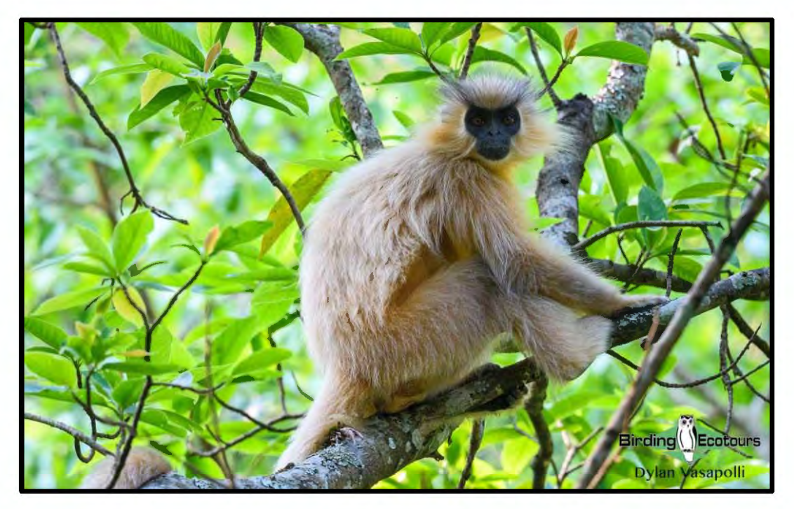
Gee's Golden Langurs were a highlight of our time around Tingtibi.

nearby river, with the likes of Fulvous-breasted Woodpecker , Scarlet Minivet , Black-crested Bulbul and Chestnut-bellied Nuthatch all showing well.