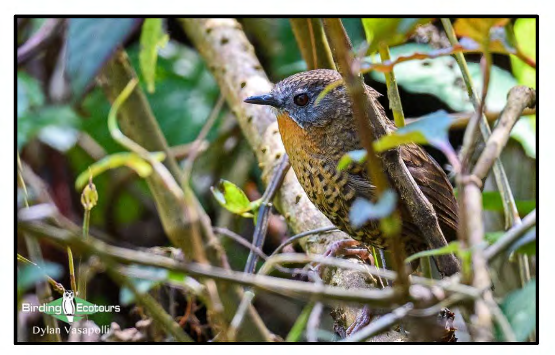
This Rufous-throated Wren-Babbler is a master skulker and rewarded us with incredible views.

Following a hearty lunch, we ventured off on the windy roads. Unfortunately, major construction was underway, which meant we had to change our plans, and we headed back to Wamrong, where we would spend the night, allowing us access to the excellent forest nearby in the early morning.