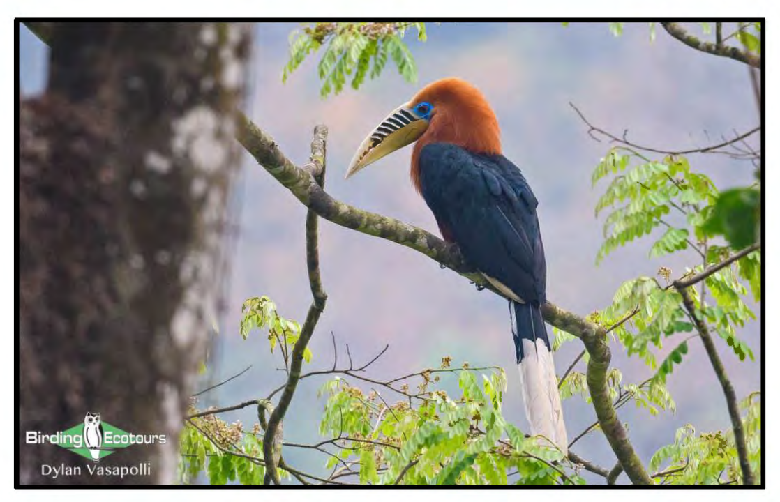
Rufous-necked Hornbill is a desirable special found in the lower altitudes in Bhutan.

latched onto the laughingthrushes, and got some good views, before they melted back into the scrub. A hawking pair of Chestnut-headed Bee-eaters put on a good show, as did several Streaked Spiderhunters . Our last sighting of note went to the enormous Black Giant Squirrel we found moving through some trees, and brought our day to a close.