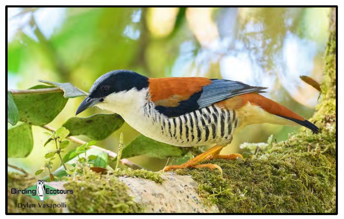
Himalayan Cutia forage amongst the mossy branches.

Bamboo patches gave us groups of White-breasted and Pale-billed Parrotbills and several Mountain Tailorbirds, while scrubby thickets delivered up Grey-cheeked Warbler, Rufouschinned Laughingthrush, Slaty-backed Flycatcher, the stunning Black-crowned (Coral-billed) Scimitar Babbler, Yellow-throated Fulvetta, Silver-eared Mesia, Red-faced Liocichla, Greythroated Babbler and White-gorgeted Flycatcher. Bright Scarlet Finches dotted some open trees, and parties of the stunning Himalayan Cutia came roving through. We enjoyed several sightings of Collared Owlets, bumping into birds perched in the open, while other favorites included Asian Emerald Cuckoo, Rufous-necked Hornbill, Sultan Tit, Blue Rock Thrush, White-crested Laughingthrush and both Greater Necklaced and Lesser Necklaced Laughingthrushes. Keeping an eye to the sky rewarded us with Himalayan Swiftlets, along with multiple Mountain Hawk-Eagles and Black Eagles. A nighttime search gave us a heard-only Mountain Scops Owl, while mammals were limited to Capped Langurs, which we saw daily. The birding here was generally excellent, and all of our daily lists exceeded 100 species.