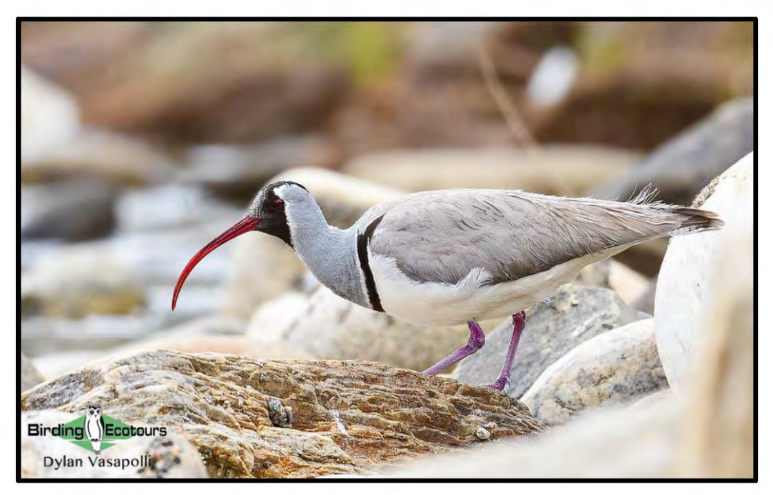
We enjoyed spending time with the sought-after Ibisbills around Paro – surely the best place in the world to see this species!

woods higher up produced numbers of Green-backed Tits , along with a party of Grey-crested Tits . Blyth's Leaf Warblers were extremely common and a small bird party right near the actual monastery delivered the stunning Mrs. Gould's Sunbirds and our first minivet – Long-tailed Minivet . A large flock of Blyth's Swifts wheeled about above the monastery, while we picked up our first Alpine Accentor on the monastery itself. Once back down from the hike, we stopped off to see our Ibisbills again, and tried once more for the Wallcreeper, which eluded us yet again, before calling it a day.