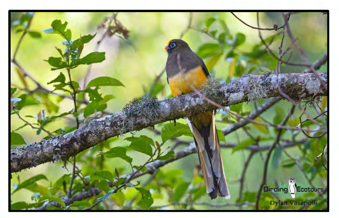
Ward's Trogon is another of the more sought-after birds occurring within Bhutan.

We concentrated the bulk of our time in the mature, moss-clad, broad-leafed forests that feature in a few places around Yongkhola. Ward's Trogon , another of Bhutan's sought-after specials was our first priority. We headed up to the region where we had it calling from on Day 15, and as if right on cue, picked up on not just a single vocal bird, but at least three. The birds were calling intermittently from all around us, and took a great deal of effort to track down. Some careful positioning paid off and we had our views of a male Ward's Trogon. We ended up spending a while with the bird, watching as it went about its business, totally oblivious to us and giving us excellent close-up views.