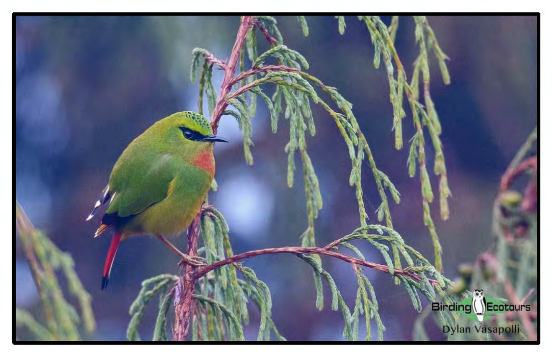
Fire-tailed Myzornis is an uncommon and scarce bird in the country. We did well with several excellent sightings on this tour.

Despite three years of isolation, and a lack of birding generally around the country during that period, the tour went along reasonably well, with only a few bumps along the way. Birding was excellent, and we netted virtually all of Bhutan's major birding targets – from the mega Satyr Tragopan and beautiful Himalayan Monal , to denizens like Ibisbill , Fire-tailed Myzornis , Beautiful Nuthatch , Ward's Trogon and the very rare White-bellied Heron . All in all, over 300 species of birds were seen on this tour. Mammals are decidedly less numerous in Bhutan, and we did well to find a Yellow-throated Marten , along with the stunning Gee's Golden Langur and enormous Black Giant Squirrel .