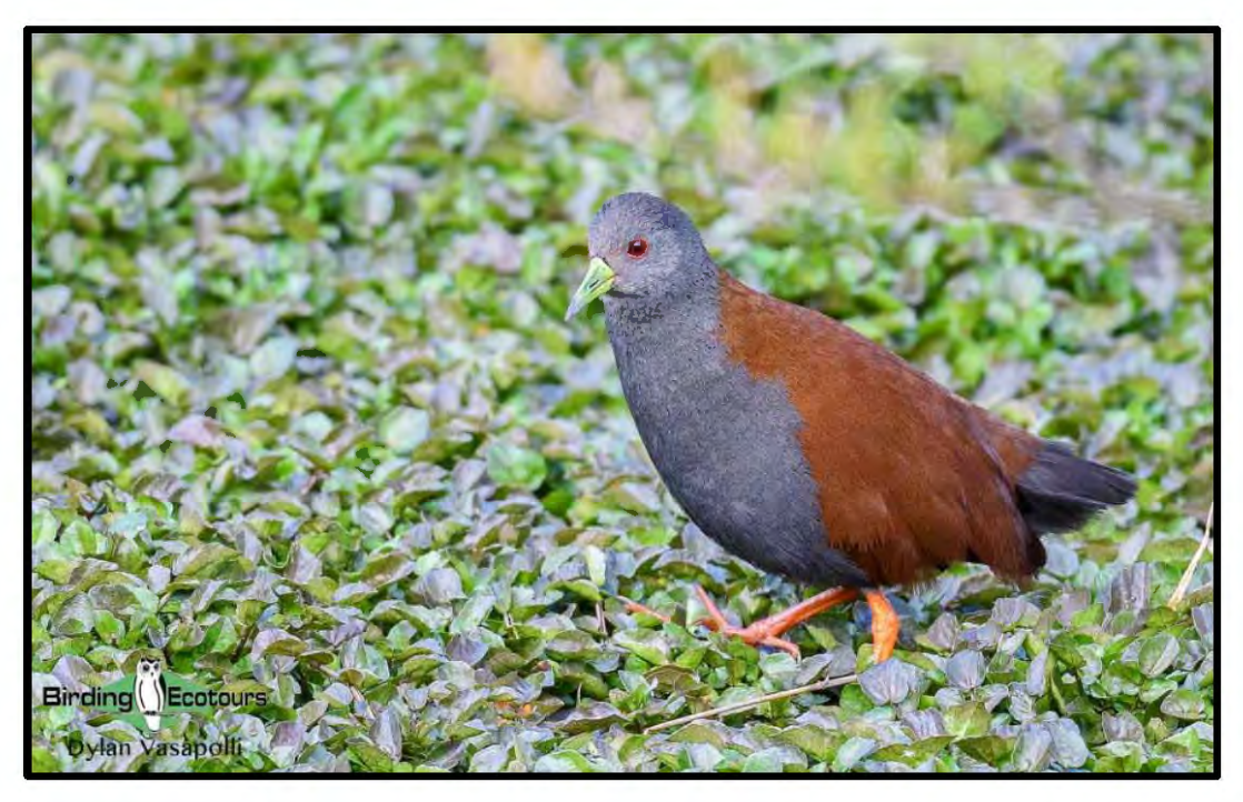
A Black-tailed Crake pops out from the dense cover for a short moment.

and Plumbeous Water Redstart . A break over the midday period followed, before we resumed with a more dedicated birding session – as we explored the Paro surrounds. Focusing on the upper reaches of the Paro Chhu (River), we did extremely well to find the scarce Solitary Snipe quietly feeding amongst the rocks, while Green Sandpiper , River Lapwing , White-capped Redstart and Rosy Pipit kept it company. A nearby marshy area delivered a stunning pair of Black-tailed Crakes that put on an excellent show, while the surrounding scrub gave up both Black-throated and Red-throated Thrushes , Hodgson's Redstart , Russet Sparrow and large numbers of Little Buntings . Content and tired, we settled in for the evening.