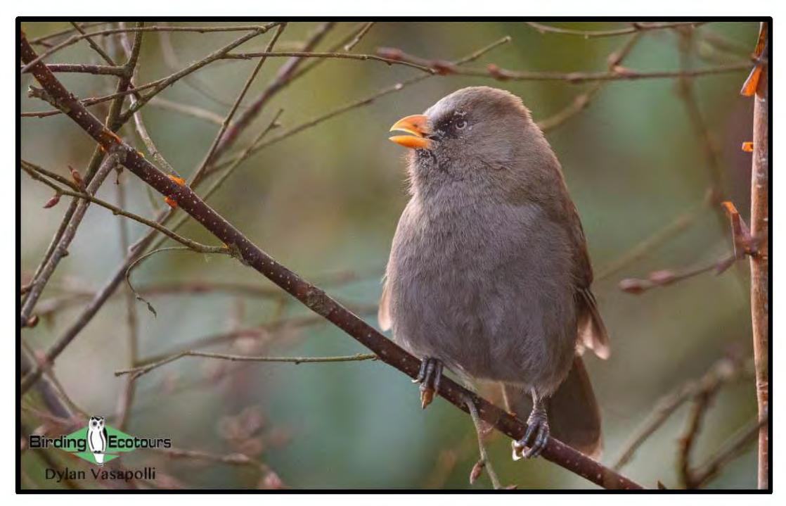
The massive Great Parrotbill was a superb bird to start the day off with.

Another early start saw us heading up to the Dochula Pass, and our first bird went to a lovely Kalij Pheasant walking in the road. We started off our birding right at the top, around the temple, just as the sun was rising. Despite us nearly freezing, the birds were up and about, and we started off with a bang, finding one of our targets, Great Parrotbill , within seconds. This is an enormous bird – easily triple the size of most other parrotbills, and it put on quite the incredible show for us, showing at arm's length. We were then whisked off to search for Fire-tailed Myzornis . We heard them easily, and after a struggle managed our first views of this sought-after bird, though our views did leave a bit to be desired. We stuck it out for a while longer, and were aptly rewarded with stunning looks at a large flock of them. We also picked up our first Stripe-throated Yuhina . We retreated for a warm cup of coffee and breakfast at the restaurant.