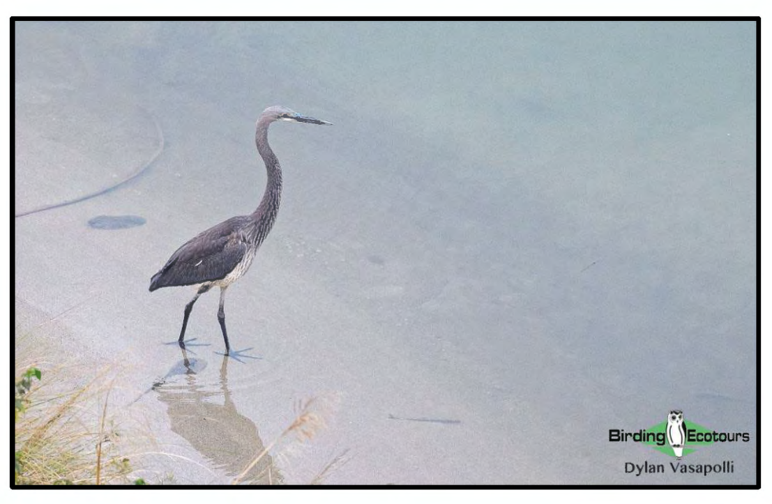
We were extremely privileged to see the now very rare White-bellied Heron.

Elachura took a bit more effort to track down, and also only gave us glimpses as it hopped through the dark undergrowth. It wasn't all bad as we tracked down a stunning Golden-throated Barbet , enjoyed the flashy Hair-crested Drongo , found a bright Small Niltava , saw several Maroon Orioles feeding in a fruiting tree and enjoyed a mixed party of Nepal Fulvetta and Black-chinned Yuhina . A Slaty-backed Forktail on the river left us wanting a bit more, though a Crested Serpent Eagle and a large flock of White-throated Needletails gave us excellent views. Our first Assam Macaques were seen as we were departing. We settled in for lunch back in the Punakha town, and following which, we headed off to what is easily the main non-birding target of Punakha – the incredible Punakha Dzong. We had a superb tour around this magnificent fortress, adding the likes of Crested Kingfisher and Bar-headed Goose from the river in front in the process. The lower altitude valley here also has several more typical lowland species, and we added the likes of the common Red-vented Bulbul , Oriental Magpie-Robin , Asian Koel , White-throated Kingfisher , Eurasian Hoopoe and Chestnut-tailed Starling . Content, we settled in for the evening following a successful day of birding.