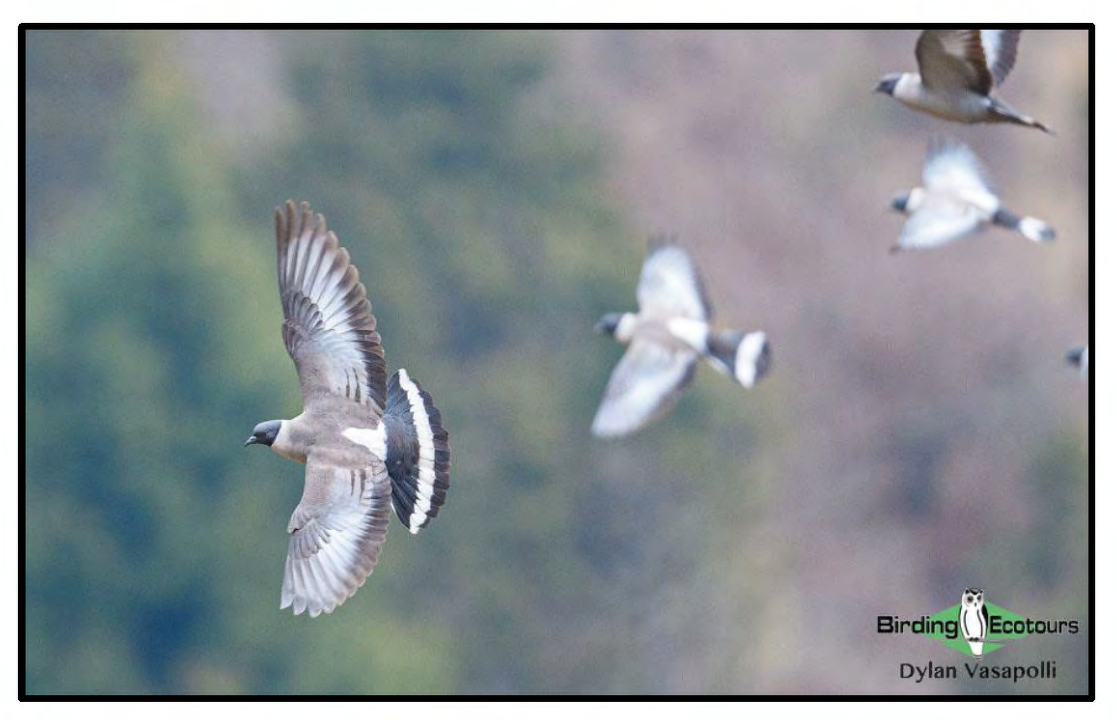
Beautiful Snow Pigeons put on a fine show for us.

Pigeons that frequent the buildings. We spent some time watching these dapper-looking birds and marveled at their beauty. Several other species we were now familiar with were seen as well. We passed over the top of Chele La Pass, taking in the spectacular views and seeing the surrounding peaks, all covered in snow from a late fall. Birding was slow up here, as it was approaching midday, and we pressed onwards down the other side of the pass into Haa. A circling Himalayan Buzzard was the only notable sighting. Following a short rest, we set out to explore the town of Haa, taking a walk along the river. A superb Ibisbill showed well early doors, as did several Brown Dippers and the expected Plumbeous Water and White-capped Redstarts . Little else was seen, though we enjoyed exploring the quaint town.