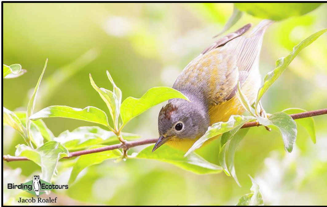
The striking white eye-ring of a Nashville Warbler really tends to stick out.

the above, one can understand why it was so difficult to leave this spot and continue venturing onwards.