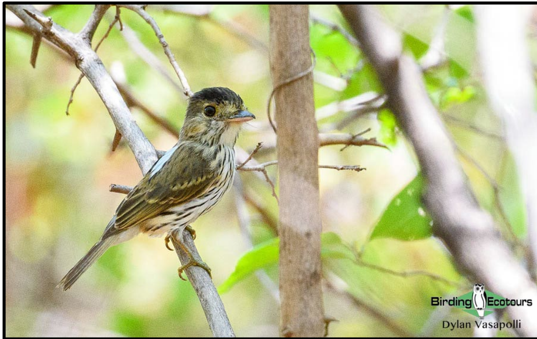
African Broadbill is another prized species occurring in the same thickets as the pitta.

Retz's Helmetshrike, Livingstone's Flycatcher, Eastern Nicator, Bearded Scrub Robin and Red-throated Twinspot , amongst others. Exploring the mosaic of mixed woodland, baobab-dominated hills, and mopane woodlands further away gave us further specials like flocks of roving Lilian's Lovebirds, Meyer's Parrot, Southern Ground Hornbill, Mottled and Böhms Spinetails, Racket-tailed and Broad-billed Rollers, Greater Honeyguide, Arnot's Chat and Meves's Starling . We also found a pair of Boulder Chats , somewhat surprisingly – beyond their known range. Several enormous colonies of Southern Carmine Bee-eaters were nesting in the area, and we spent some time enjoying the antics of the now fairly large chicks around their nesting burrows.