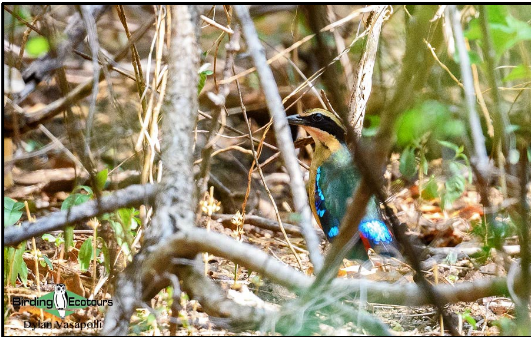
An “in-situ” photo of one of the African Pittas we found, showing its camouflage on the ground and the dense thickets they frequent.

With the pressure having come off after our superb views of African Pitta early on, we could also enjoy other parts of the reserve, and additionally explore the incredible Zambezi River floodplain . The pitta thickets held other exciting birds and gave us good views of birds like African Broadbill ,