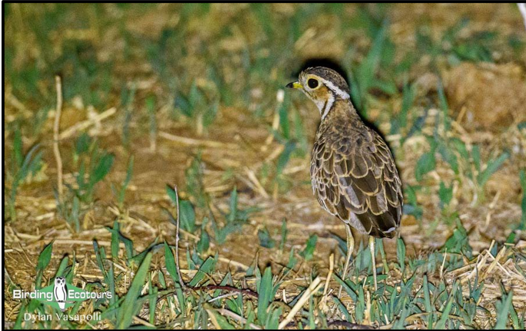
Three-banded Courser showed well during our nighttime excursions in Mana Pools.

species, but in our five days, we notched up over 200 species in the park, with a wide range of typical African species, like bee-eaters, woodpeckers, bushshrikes, flycatchers, sunbirds, weavers and waxbills all represented.