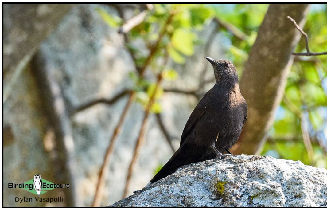
Boulder Chat showed well in the rocky miombo woodland near Harare.

The guests, Sue and John, arrived in Harare without hassle. After checking in to our comfortable guesthouse and freshening up, we headed out for a quick late afternoon birding session at the nearby Monavale Wetlands. This wetland is a famous Harare birding site for hosting secretive rails and crakes in the rainy season. It is typically very dry at this time of the year but nonetheless supports some of our target species. On arriving, we quickly picked up vast numbers of euplectes moving about and found high numbers of both Red-collared and White-winged Widowbirds , along with smaller numbers of Southern Red and Yellow Bishops and the sought-after Yellow-mantled Widowbird . A large flock of the scarce Cuckoo-finches also pitched up, giving us good views. African Yellow Warbler was our main target, and we heard several birds from the appropriate area, but it took much search and effort to locate one bird, which eventually gave us some brief views. We also got our eye in on some typical African species, like Little Bee-eater and Black-winged Kite , before calling it a day.