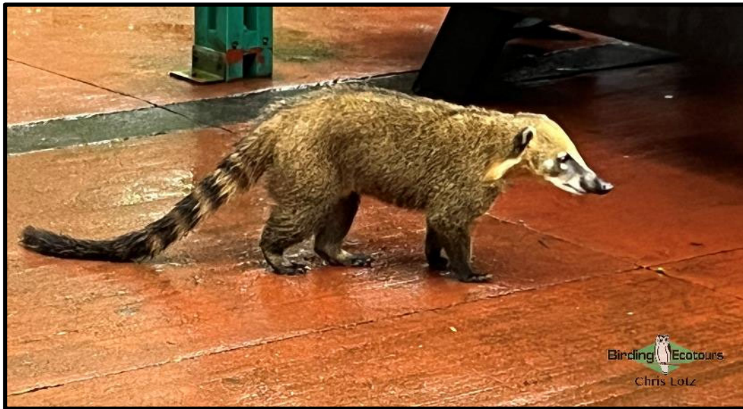
A naughty South American Coati