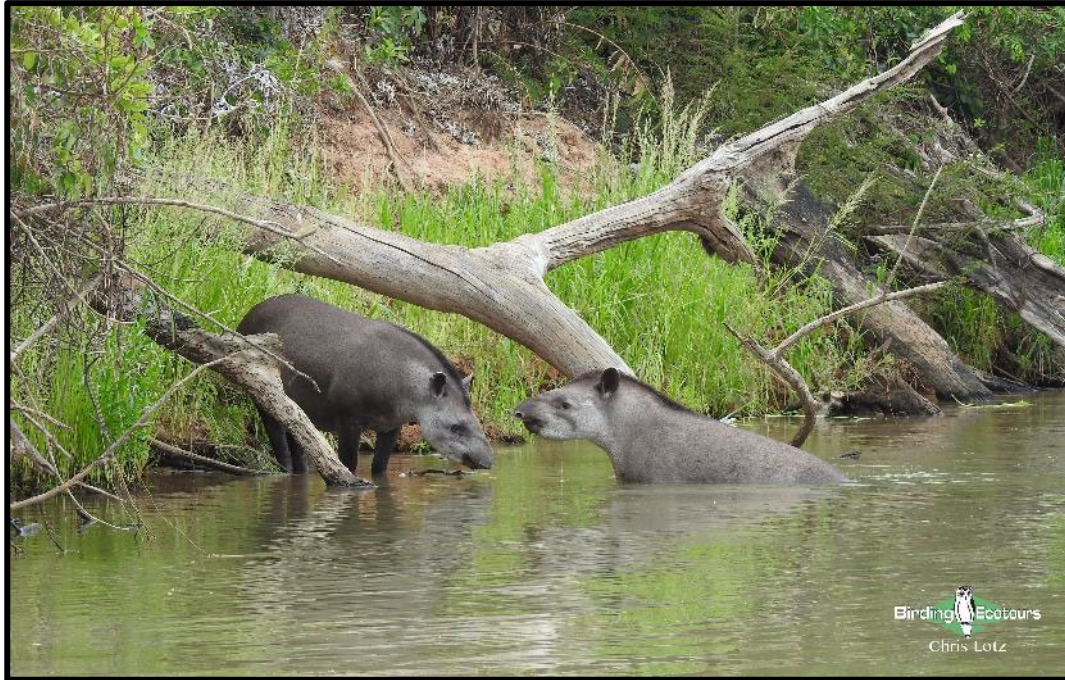
Playful Lowland Tapir

The morning and afternoon boat trips were again great not only for mammals, but also for birds. We found some excellent new additions to the trip list, like White-throated Piping Guan , Fork-tailed Woodnymph , Glittering-throated Emerald , Little Cuckoo , a close-up Pantanal Snipe on a beach, Vermilion Flycatcher , Rufous-tailed Jacamar , close-up Bat Falcon , Large-billed Antwren , Mato Grosso Antbird and others.