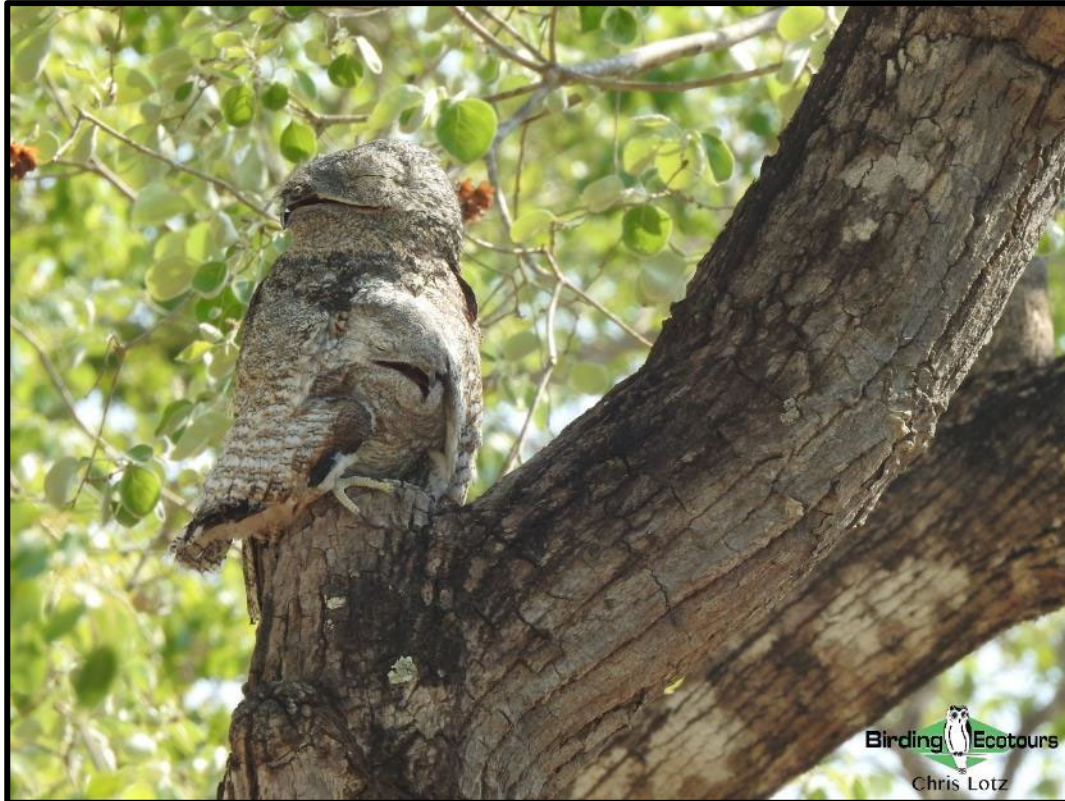
Great Potoo adult and chick.