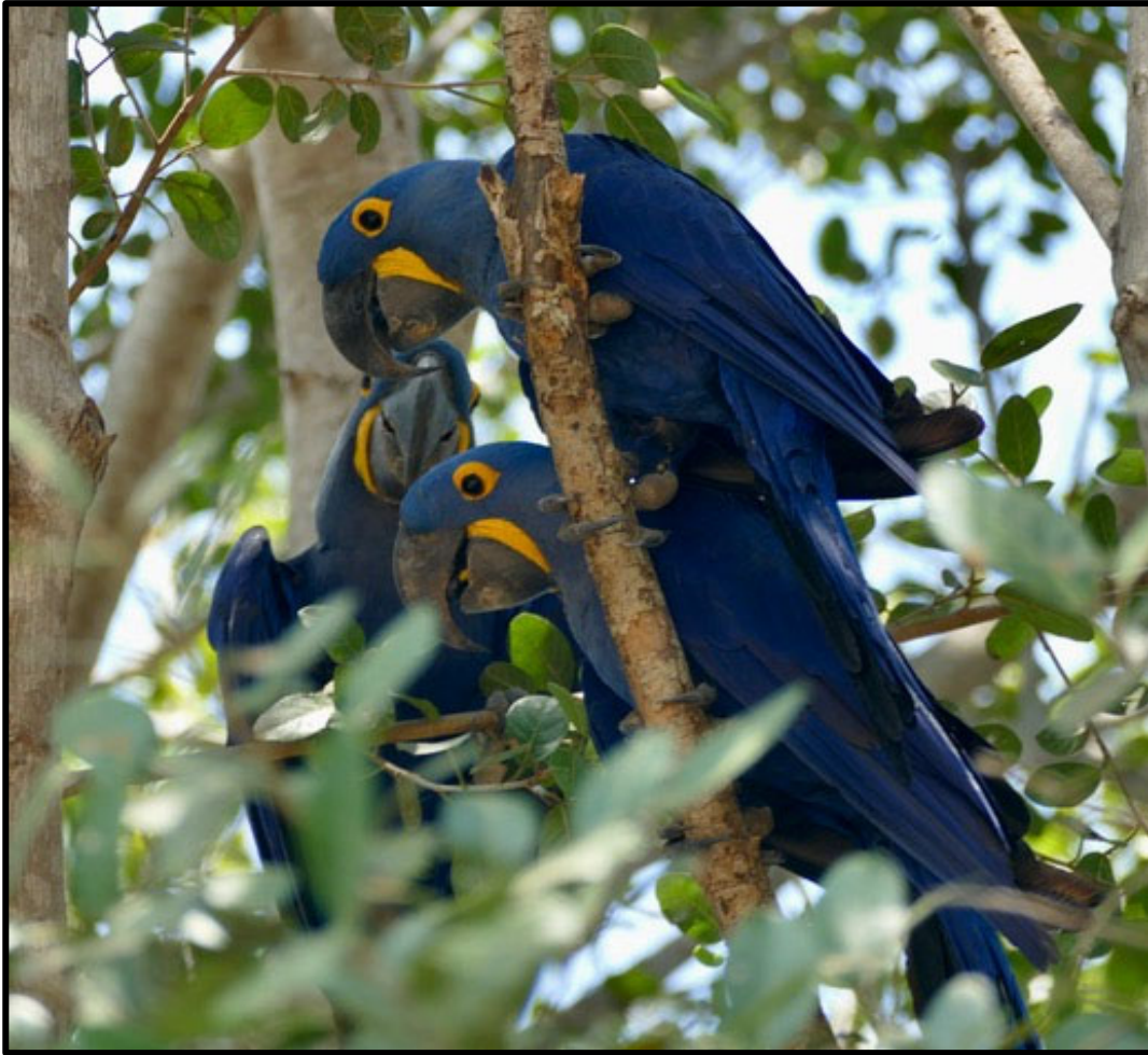
Hyacinth Macaw, an iconic bird of the Pantanal.