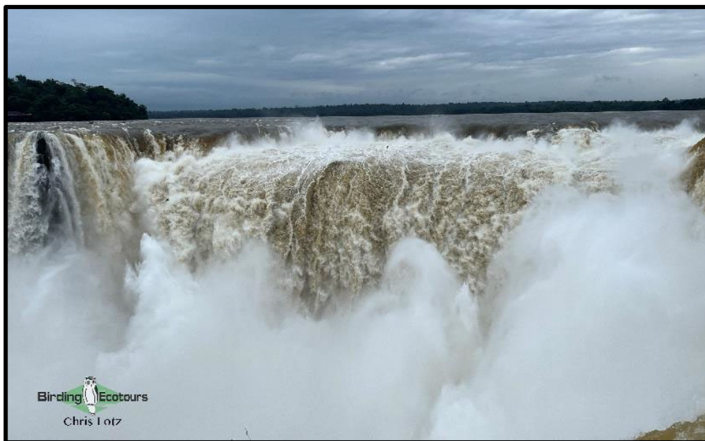
Part of the vast Iguazú Falls from one of the higher trails.