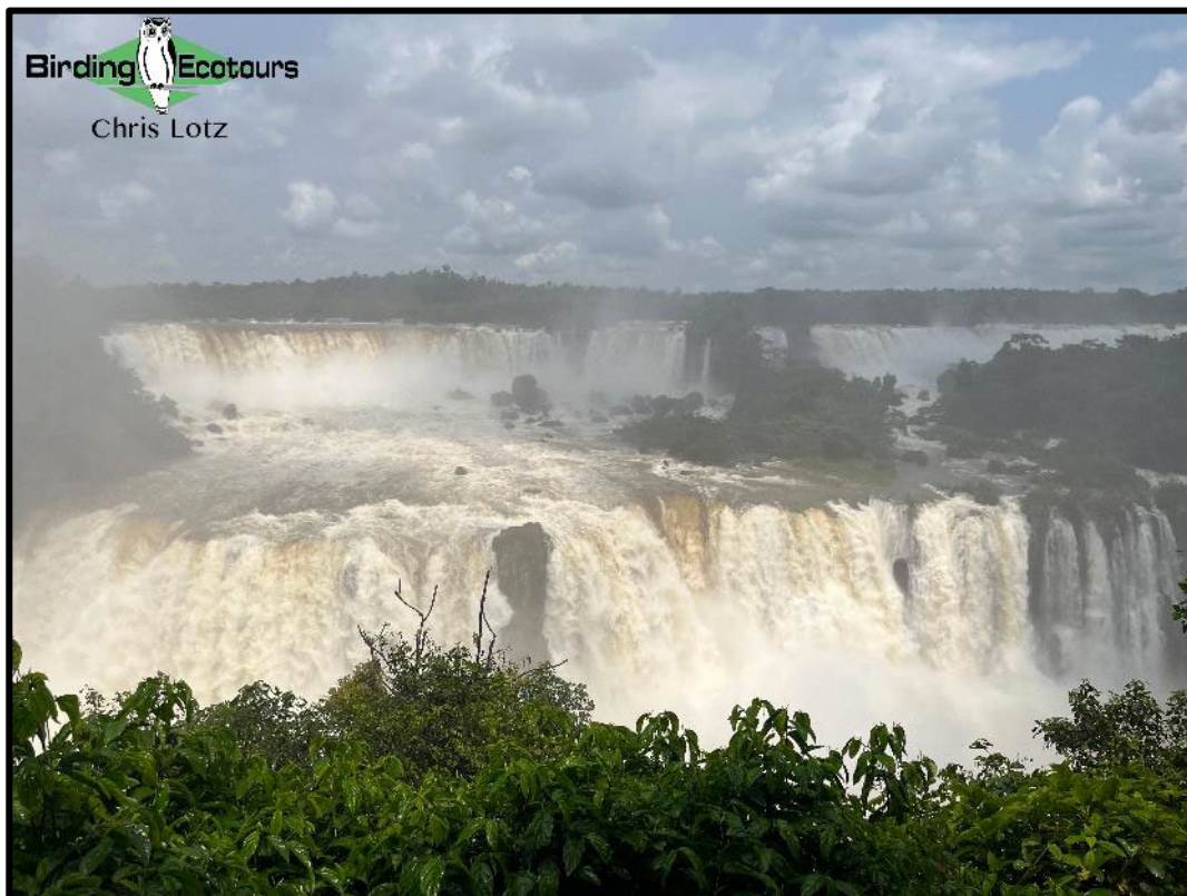
One part of the magnificent Iguazú Falls! It's vast, with stacks of different views!

Some of the many highlights of this trip were five Jaguar (two close-up pairs during boat trips and one at night from the lodge), three Giant (River) Otter , good views of a Giant Anteater , playful Lowland (Brazilian) Tapir , the planet's largest parrot, Hyacinth Macaw and five parakeet species, a day-roosting Great Potoo with its baby, eleven hummingbird species, many of them close-up at a hummingbird garden, Sungrebe , Sunbittern , a great many waterbirds including some charismatic ones like Boat-billed Heron (mini shoebill!), some close-up owls, all five kingfisher species, numerous woodpeckers, Toco Toucan , Red-legged Seriema , close-up Bat Falcon , confiding Sharp-tailed Streamcreeper , Plush-crested Jay , luminously dazzling Orange-backed Troupial , numerous spectacular tanagers, and lots more.