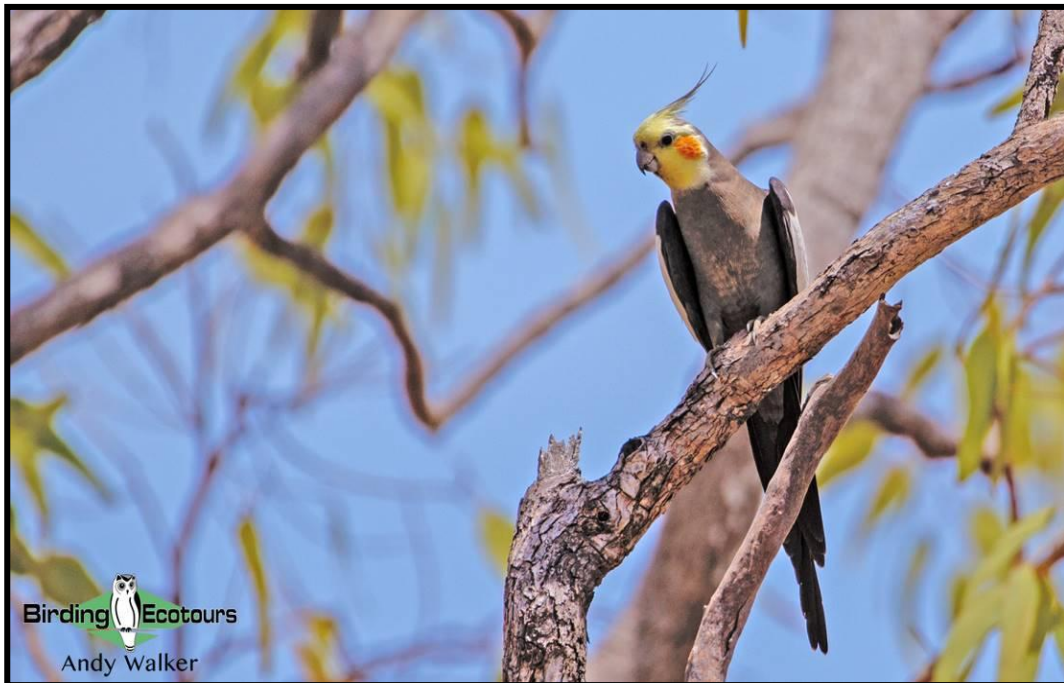
We will look for Cockatiel as we traverse through the drier woodlands of this part of the Northern Territory. These highly popular cage birds, native and wild to Australia, are an important target for many visiting birders.