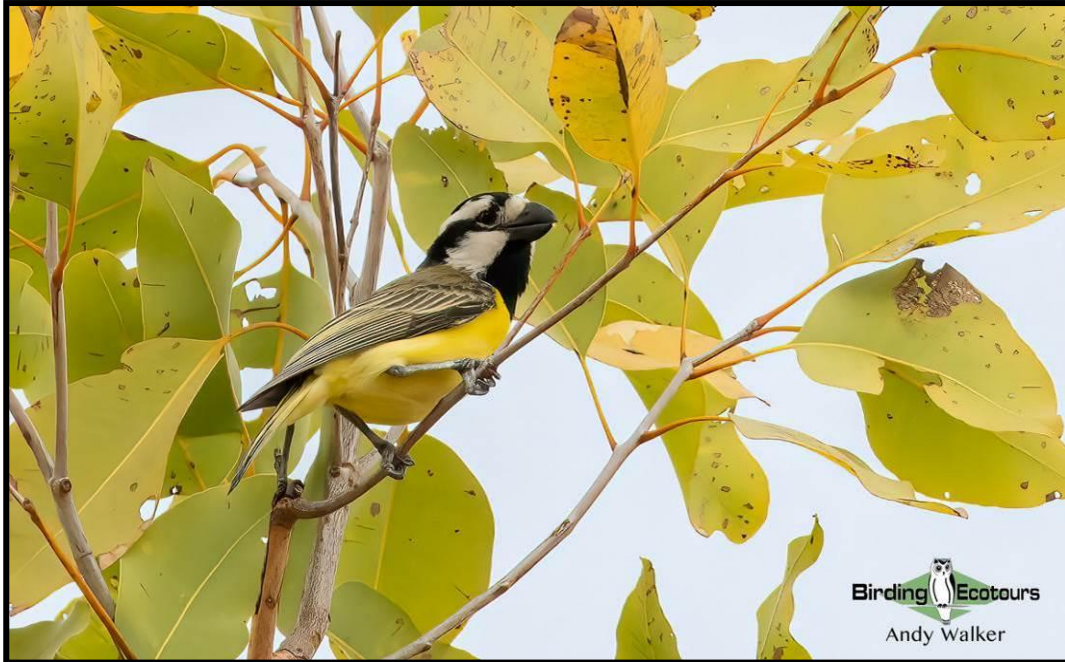
The tough Northern Shriketit , a recent split, will be a target during this tour.