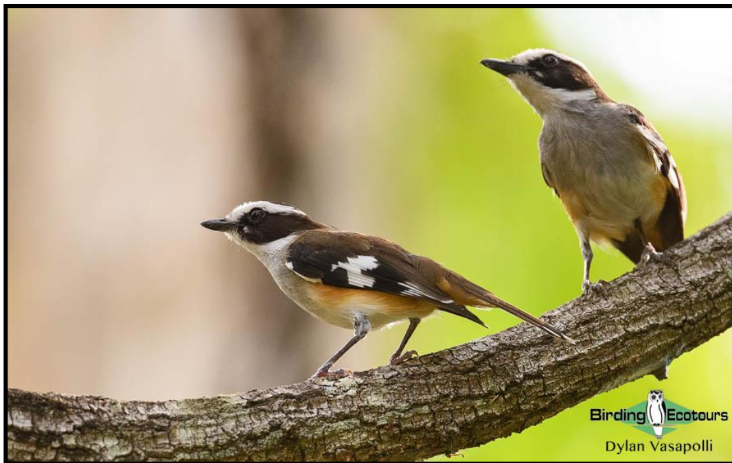
The shy Buff-sided Robin can be found in wooded river valleys in the area.