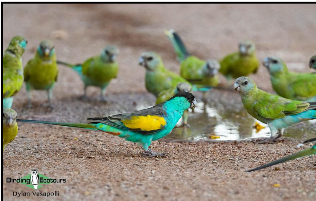
The gorgeous Hooded Parrot is a target during the second half of this tour.

Please note that the itinerary cannot be guaranteed as it is only a rough guide and can be changed (usually slightly) due to factors such as availability of accommodation, updated information on the state of accommodation, roads, or birding sites, the discretion of the guides and other factors. In addition, we sometimes have to use a different international guide from the one advertised due to tour scheduling.