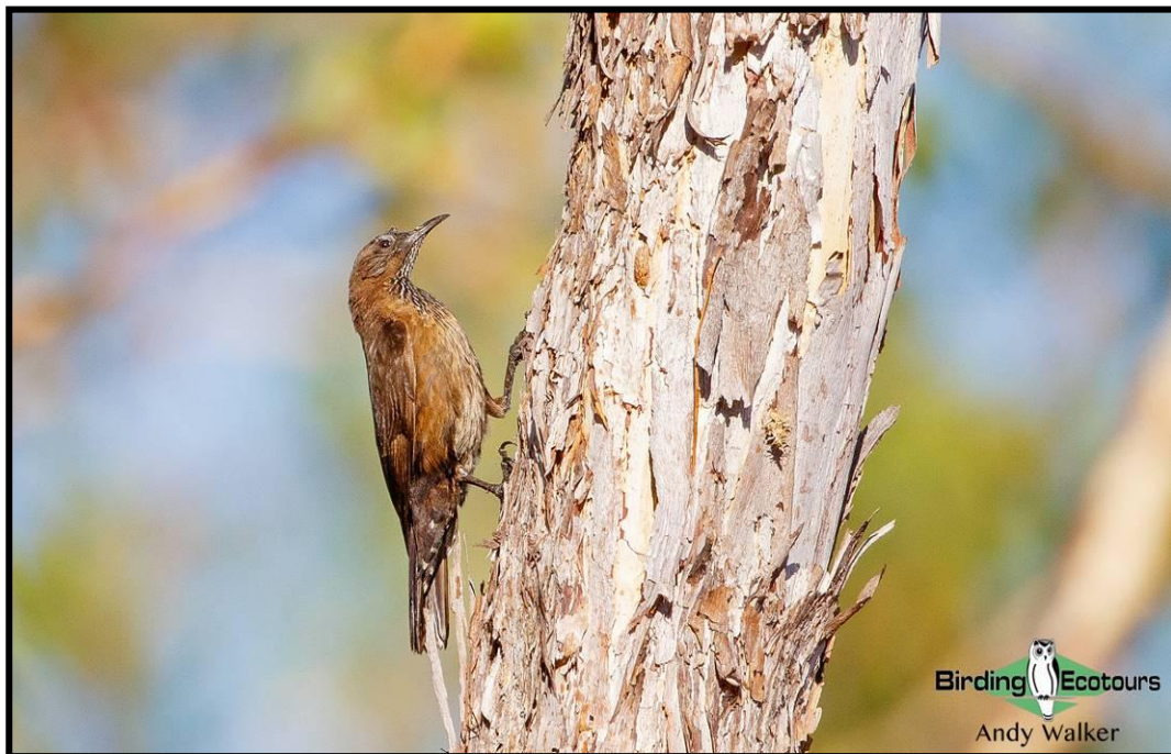
Another localized species that we will be looking for on this tour, Black-tailed Treecreeper .

The monsoon forest and forest edge along the floodplain here is also great for plenty of species as well, including Blue-winged Kookaburra , Forest Kingfisher , Pheasant Coucal , Arafura Fantail , Rainbow Pitta , Paperbark Flycatcher , Leaden Flycatcher , Lemon-bellied Flyrobin , Hooded Robin , Jacky Winter , Green-backed Gerygone , and Mangrove Golden Whistler .