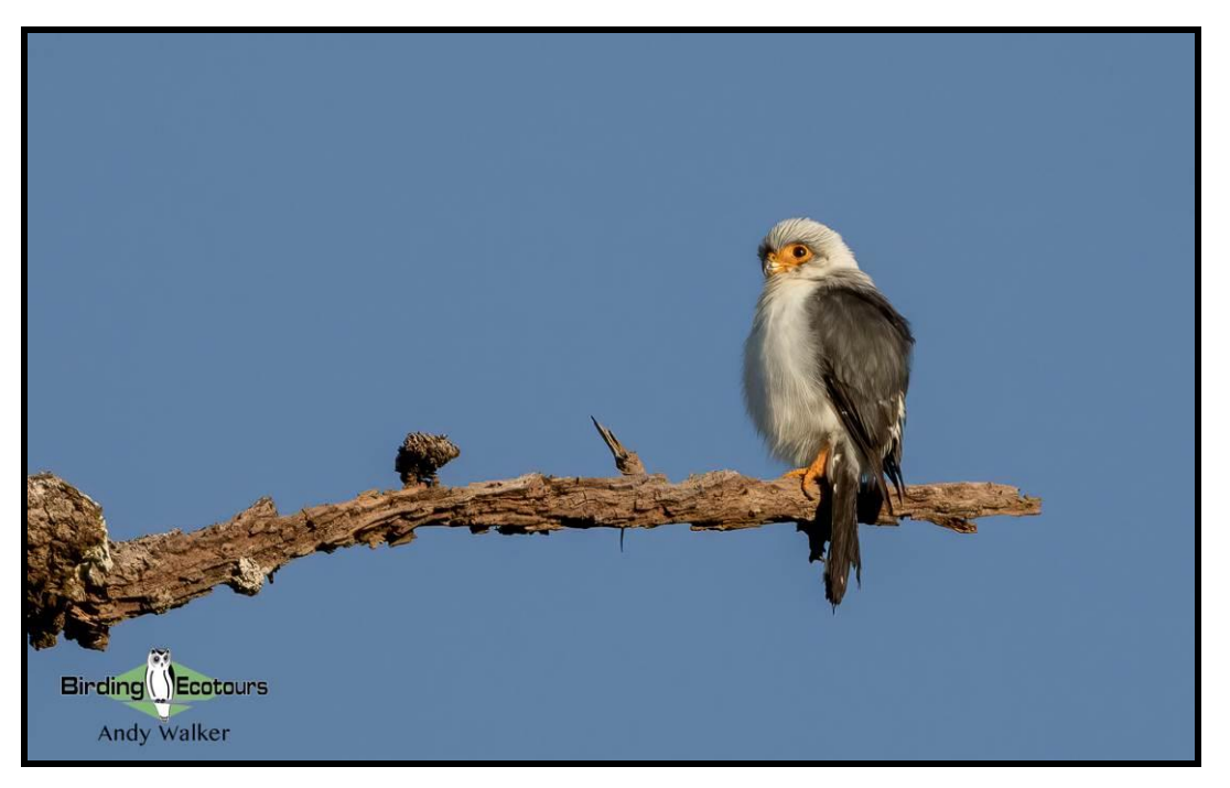
As we drive between the florican grasslands and Tmatboey, we will keep our eyes peeled for White-rumped Falcon . Again, Cambodia represents the best place in the world to see this attractive small falcon.