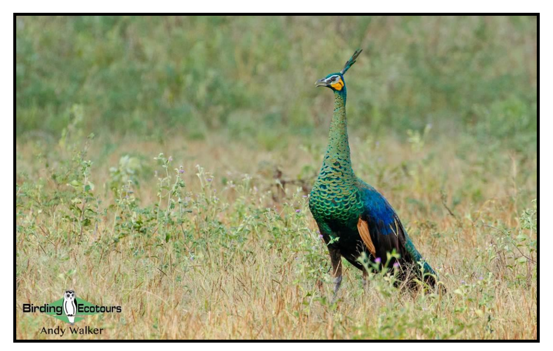
A gorgeous, but often shy species, we will look for Green Peafowl while birding in eastern Cambodia.