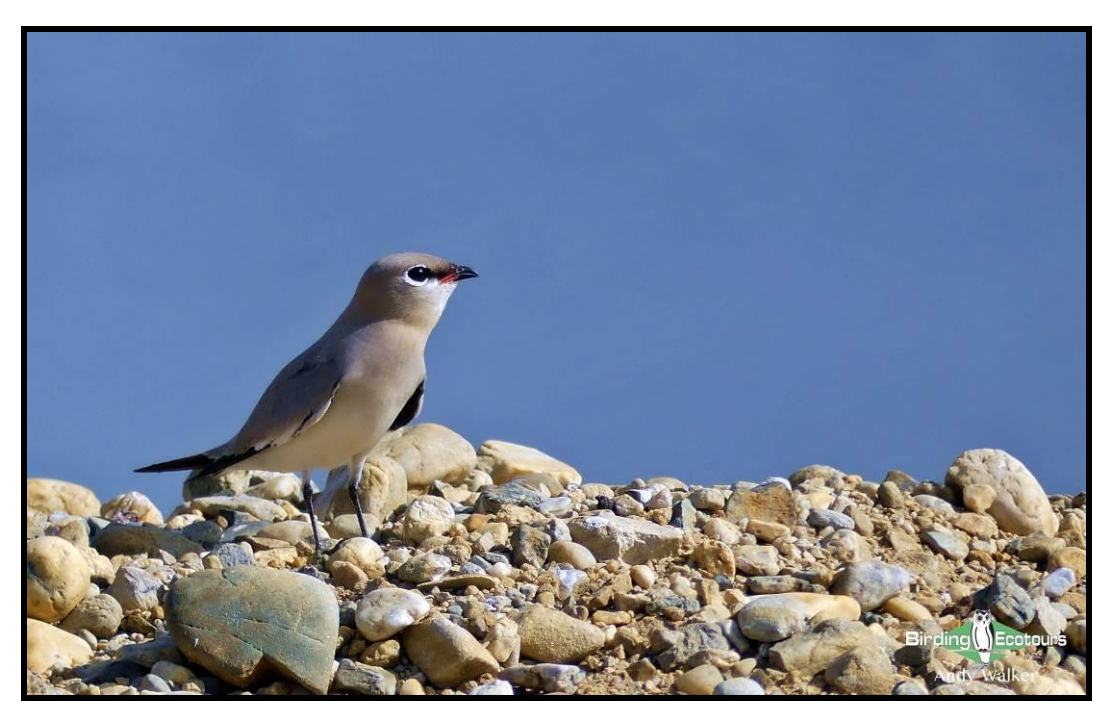
There is definitely a cute factor about the rather pretty Small Pratincole , they are always a highlight.

We will take a morning boat trip on the Mekong River, where we will be seeking Mekong Wagtail and the Endangered (<u>ICUN</u>) Irrawaddy Dolphin . We might also spot the increasingly localized Grey-throated Martin , along with more widespread species like Pied Kingfisher , Indian Spot-billed Duck , and Indian Cormorant .