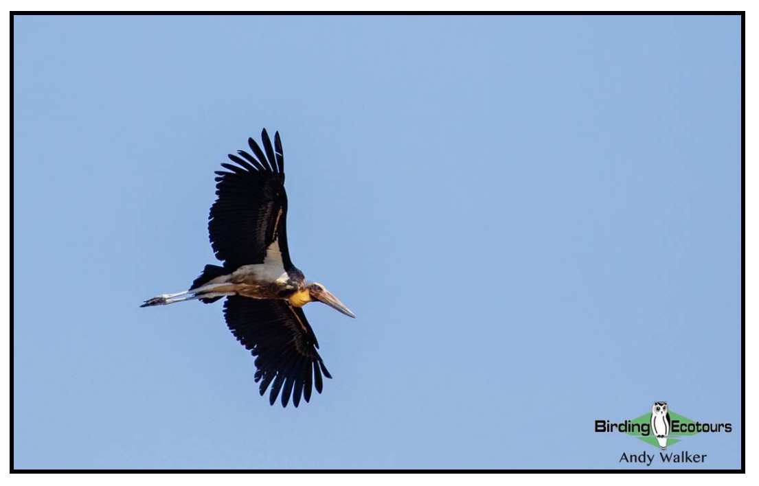
Lesser Adjutant, one of several key birds possible at Tonle Sap Lake.