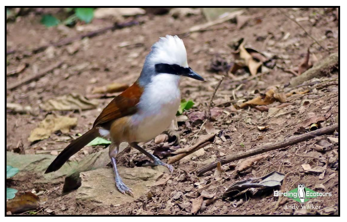
White-crested Laughingthrush is a rather striking bird!