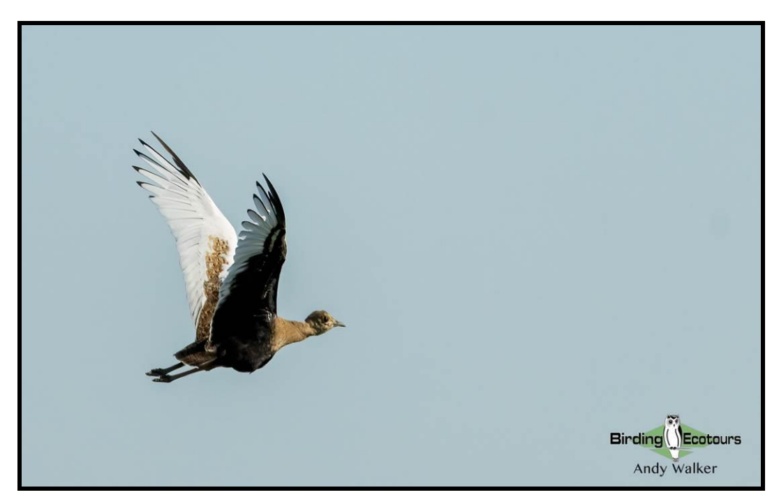
Bengal Florican is tough to see anywhere outside of Cambodia, and we will be putting a lot of effort into seeing the species on this tour.