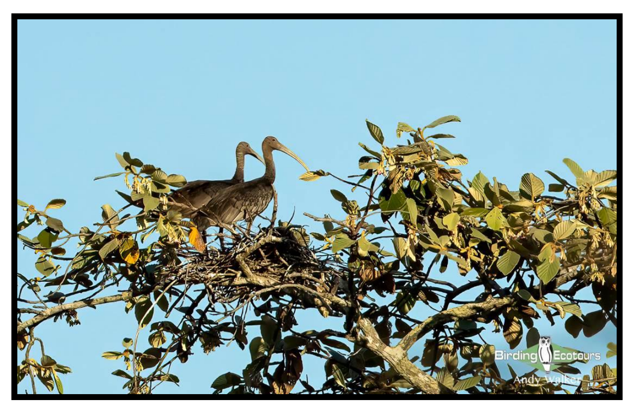
Giant Ibis (here a pair on a nest), are one of the top targets in Cambodia, where the majority of the global population exists.

05 – 18 JANUARY 2026 4 – 17 DECEMBER 2026