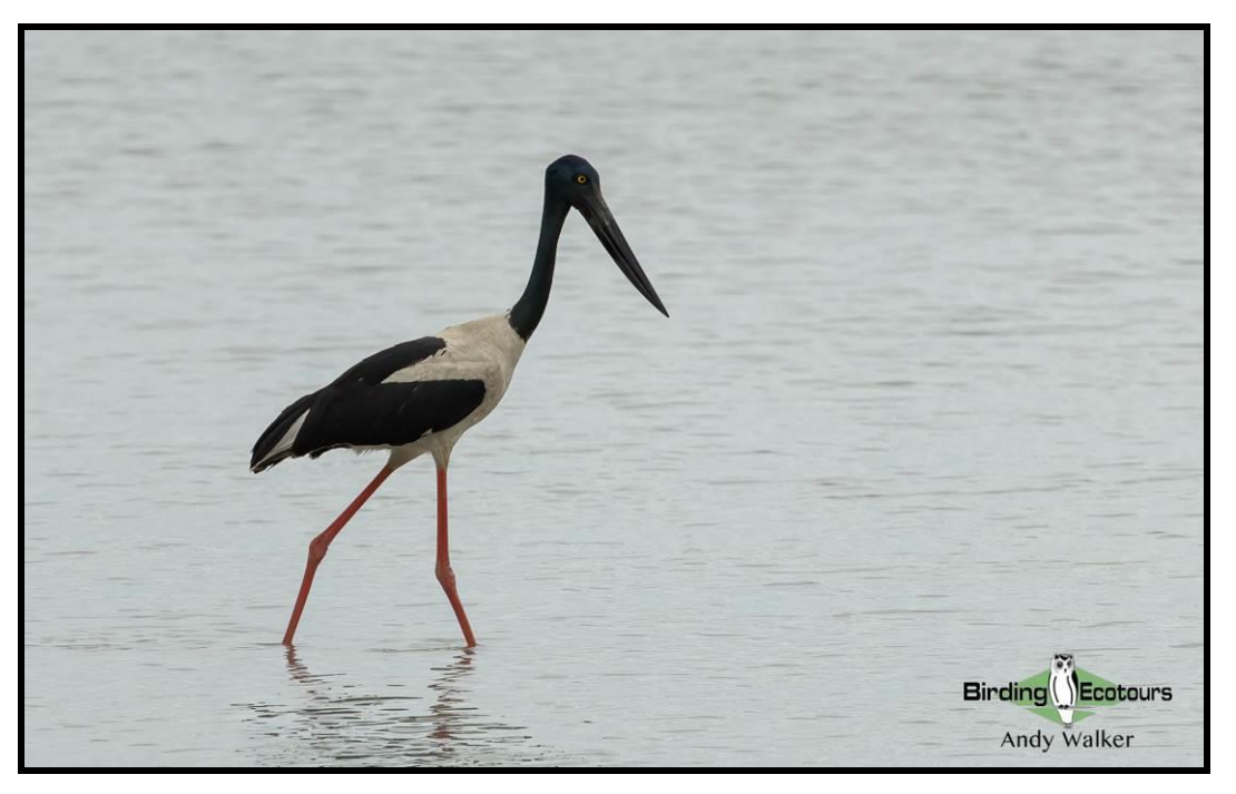
Black-necked Stork has an interesting and patchy distribution across Asia and Australasia.