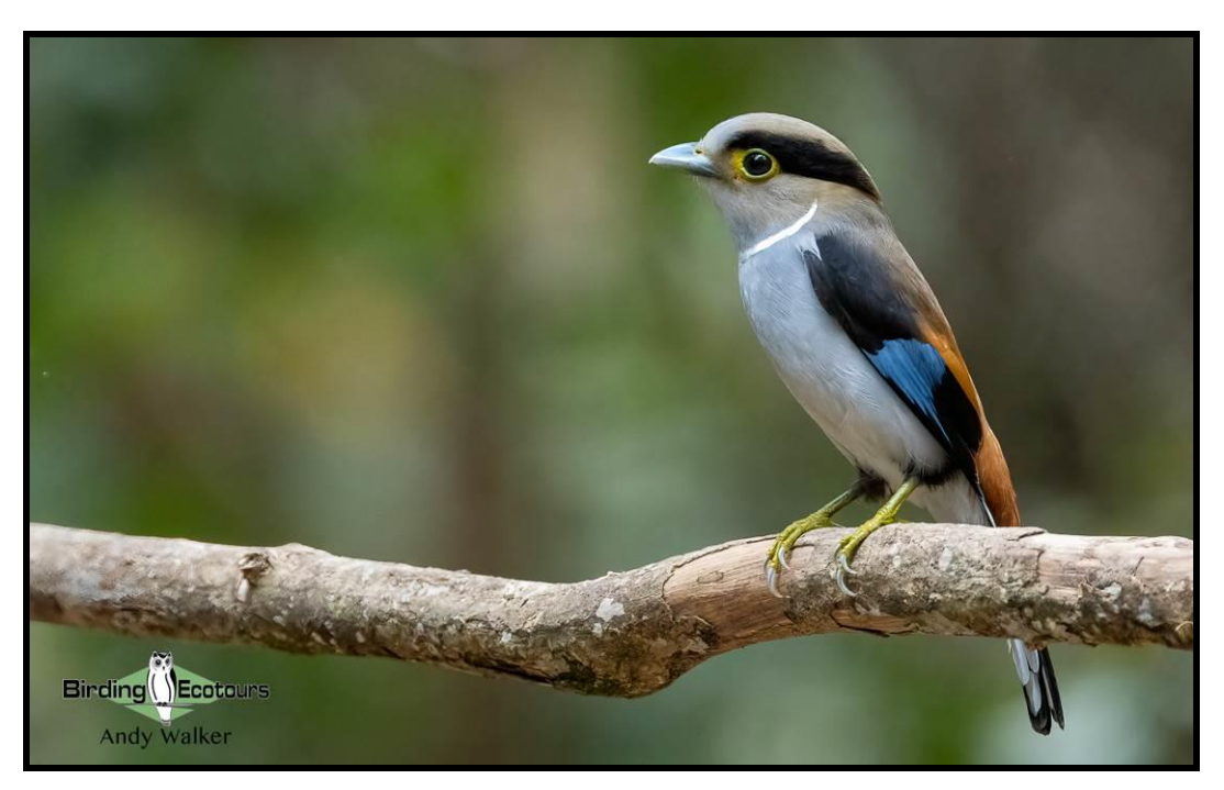
Silver-breasted Broadbill is another attractive species we will look for during the tour.