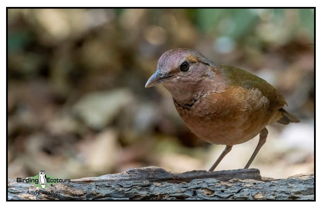
Blue-rumped Pitta is localized in Cambodia and Keo Seima Wildlife Sanctuary is one location where it can be found, with some luck and patience.