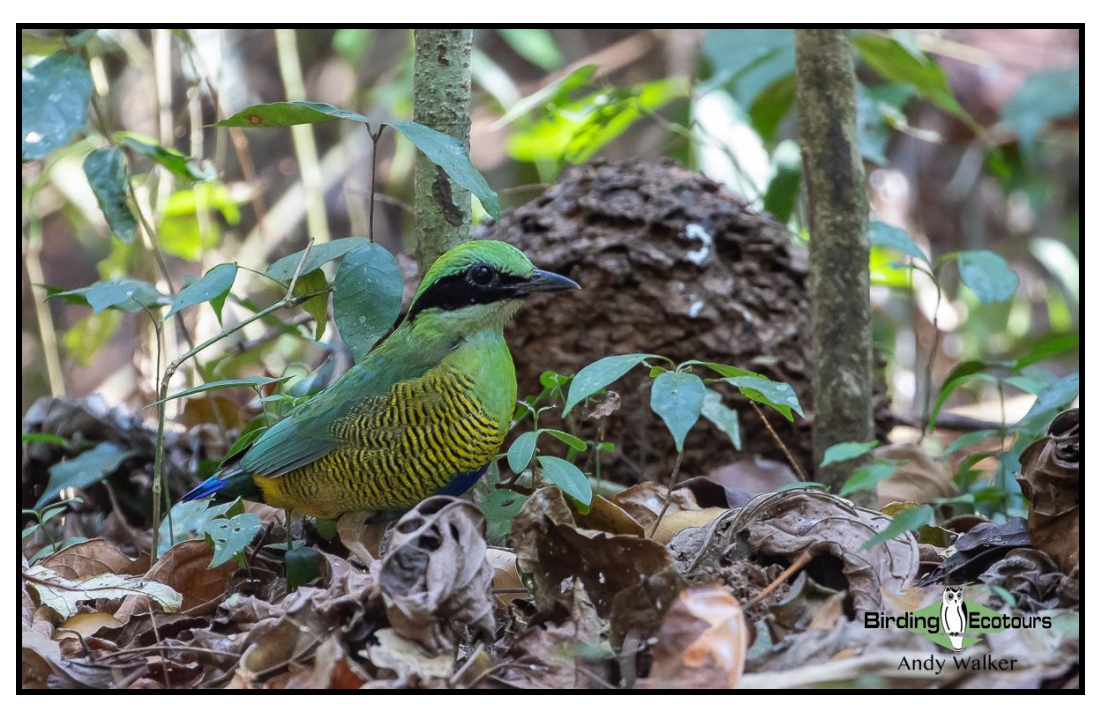
The gorgeous Bar-bellied Pitta can be found while birding in Cambodia.

This tour will also be supporting local communities and wildlife conservation through responsible ecotourism.