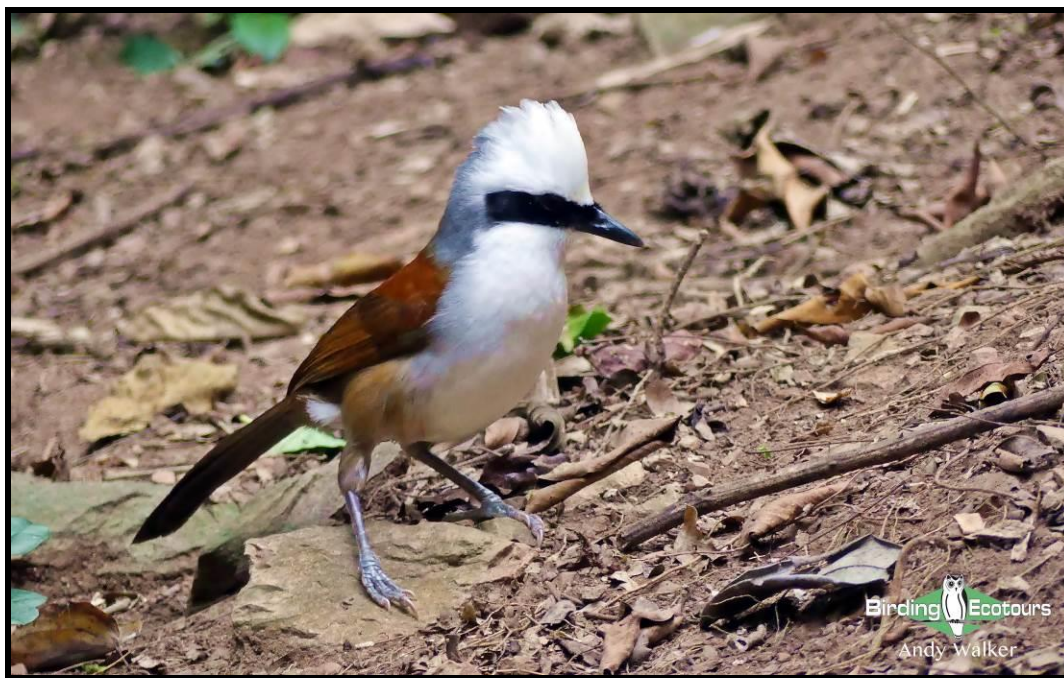
White-crested Laughingthrush is a rather striking bird!