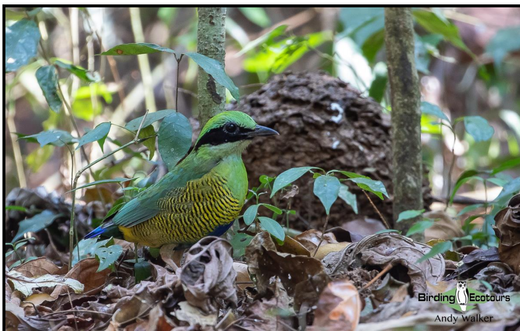
The gorgeous Bar-bellied Pitta can be found while birding in Cambodia.

This tour will also be supporting local communities and wildlife conservation through responsible ecotourism.