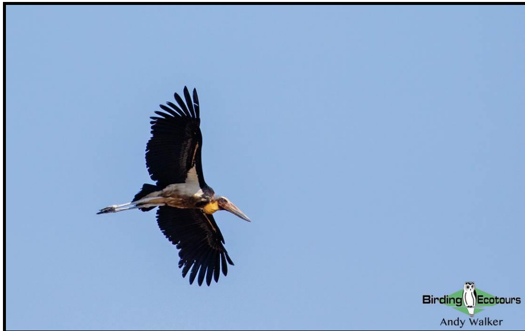
Lesser Adjutant, one of several key birds possible at Tonle Sap Lake.