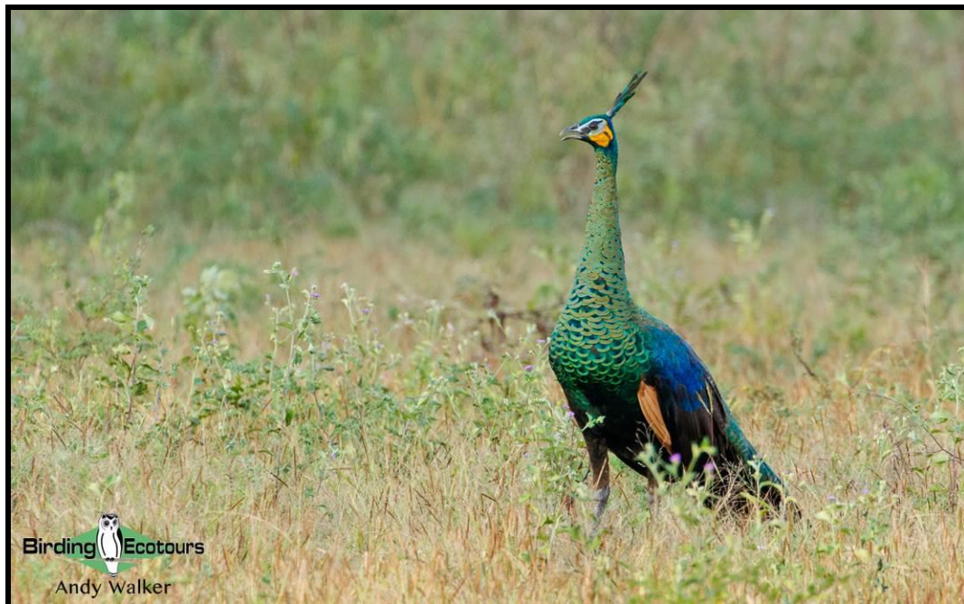
A gorgeous, but often shy species, we will look for Green Peafowl while birding in eastern Cambodia.