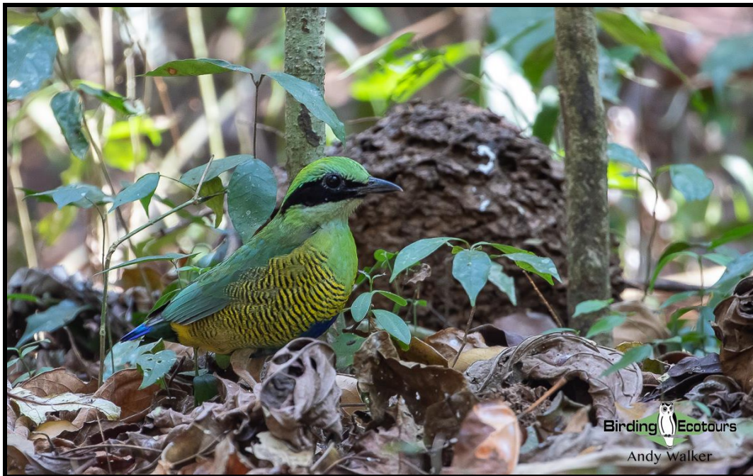
The gorgeous Bar-bellied Pitta can be found while birding in Cambodia.

This tour will also be supporting local communities and wildlife conservation through responsible ecotourism.