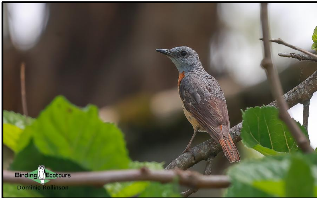
Miombo Rock Thrush were seen in miombo patches while in Zimbabwe.

With several important miombo specials still missing, we decided to leave the city early and spend a couple of hours birding the miombo woodlands of Gosho Park , about 70 km southeast of Harare. The woodlands proved much livelier, compared to the last two days, and by again working through feeding parties, we soon ticked off the likes of Green-capped Eremomela (a classic feeding party starter!), Chinspot Batis , Tropical Boubou , Miombo Tit , Pale Flycatcher , Miombo Rock Thrush , Green-backed Honeybird , Wood Pipit , Violet-backed Starling , Black-eared Seedeater and Golden-breasted Bunting . There were also good numbers of Whyte's Barbets around too – always a great bird to see!