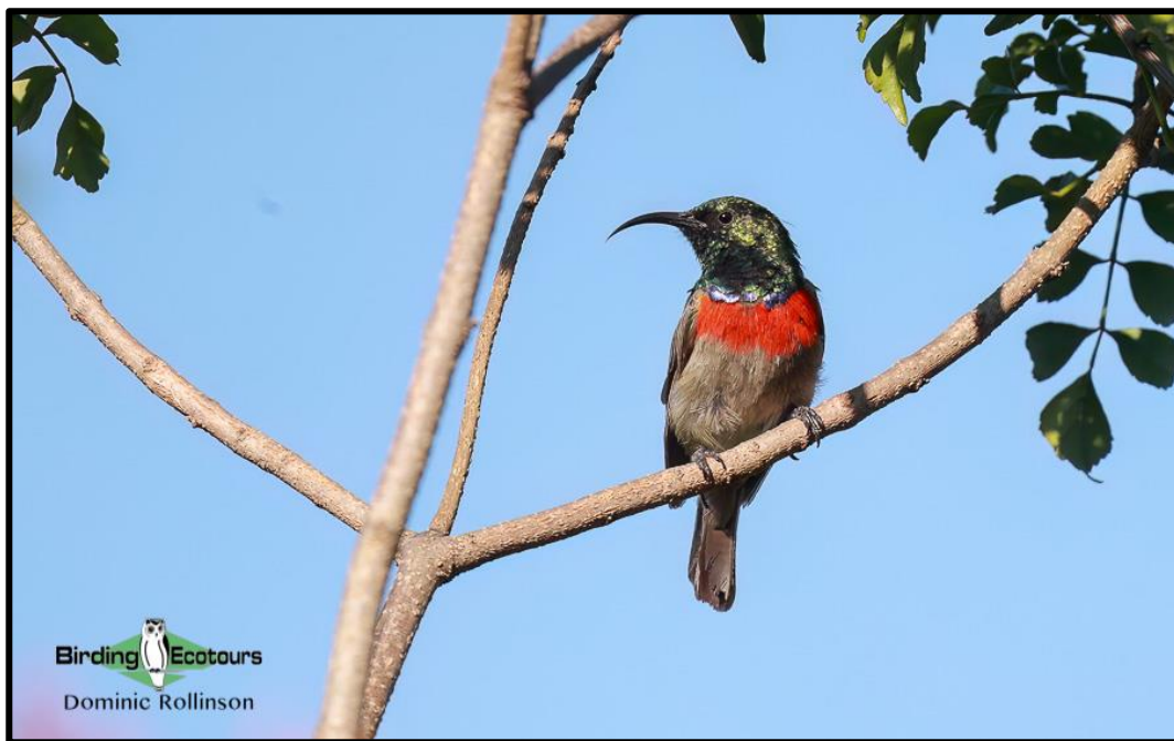
Eastern Miombo Sunbirds were common and conspicuous across Zimbabwe.

billed Crombec, Southern Yellow White-eye, White-throated Robin-Chat, Eastern Miombo Sunbird and Streaky-headed Seedeater.