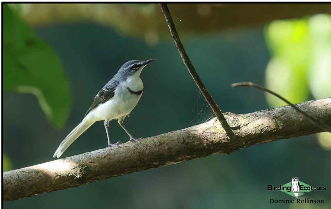
Mountain Wagtails were seen in the stream near Aberfoyle Lodge.

are set right in prime highland forest, with some great birding right on our doorstep. In the late afternoon we took a stroll around the forest, where we were soon acquainted with some of the area's common forest species, such as Livingstone's Turaco , Cape Batis , Black-fronted Bushshrike , White-tailed Crested Flycatcher , Roberts's Warbler , Chirinda Apalis , Barratt's Warbler (heard only), Stripe-cheeked Greenbul , White-starred Robin and Cape Canary . We heard Swynnerton's Robin calling nearby, however, despite a dedicated search, we were unable to find this forest skulker. That evening we enjoyed a beautiful sunset and, while we sat outside enjoying a drink, we were lucky enough to find a lovely male Bronzy Sunbird which posed well for us in the dying light.