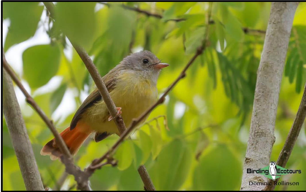
Cute and energetic Livingstone's Flycatchers were common in the lowlands of central Mozambique.

Eagle, Brown-necked Parrot, Pale Batis, Red-winged Prinia, Mosque Swallow, Retz's Helmetshrike, Little Sparrowhawk and Purple-crested Turaco. Non-birding highlights in the woodlands and lowland forests included many Suni and Natal Red Duiker which were regularly seen diving off the road into thick bush.