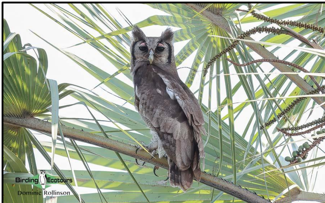
This huge Verreaux's Eagle-Owl was seen in Gorongosa National Park.

The woodlands and savanna areas further added Palm-nut, White-headed, Hooded and White-backed Vultures, Bateleur, Crowned, Martial and Wahlberg's Eagles, Ovambo Sparrowhawk, Verreaux's Eagle-Owl, Southern Ground Hornbill, Broad-billed Roller, Red-winged Prinia, Collared Palm Thrush and Lemon-breasted Canary . Some of the mammalian highlights for the morning included African Elephant, Common Warthog, Hippopotamus, Greater Kudu, Southern Reedbuck, Oribi, Nyala, Cape Bushbuck and Impala , with massive herds of Waterbuck littered across the Urema Floodplain. The large troops of both Vervet Monkeys and Chacma Baboons further kept us entertained, as we enjoyed watching them getting up to mischief.