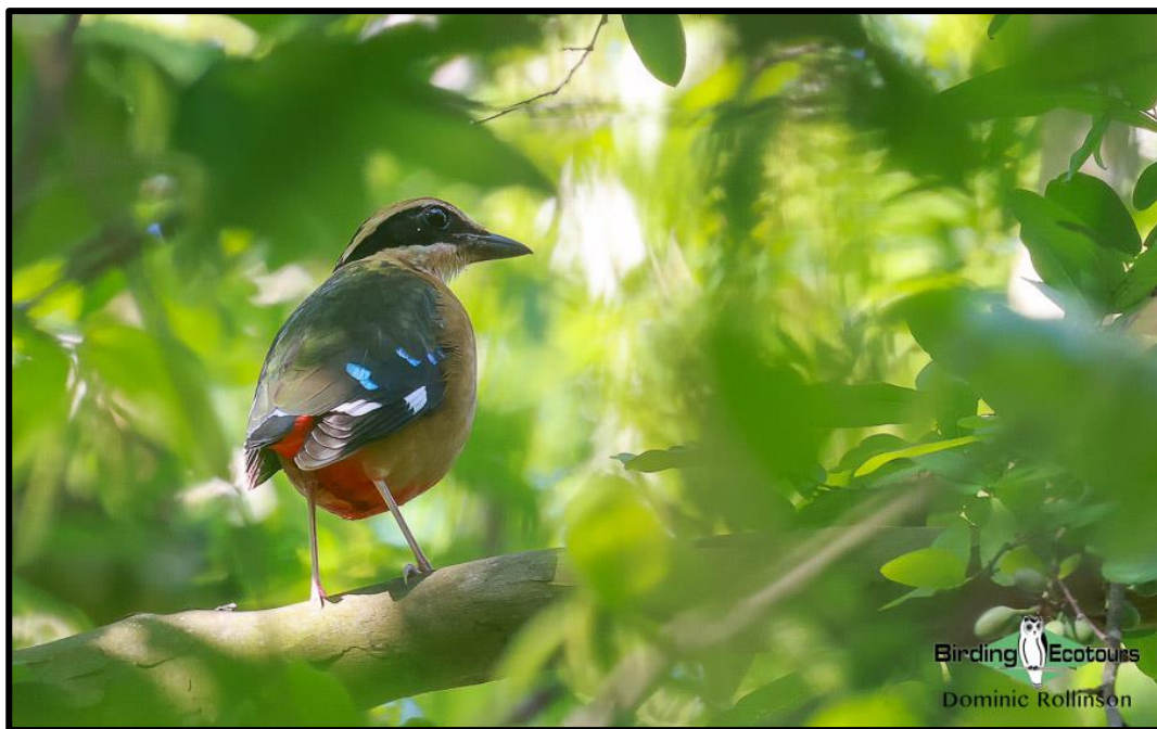
We were overjoyed with our views of African Pitta.

During our time up north, we spent a lot of time birding the lowland forests of the coutadas (concessions) where we mostly concentrated on finding African Pitta and other forest specials. Some of our highlights deep in the lowland forests included Southern Crested Guinea fowl , Green Malkoha , African Broadbill , Woodwards' Batis , Chestnut-fronted Helmetshrike , Eastern Nicator , Black-headed Apalis , Lowland Tiny Greenbul , East Coast Akalat , White-chested Alethe and Red-throated Twinspot . The undoubted highlight of our time in the deep dense lowland forests was our fantastic views of a displaying African Pitta . We were beginning to get anxious about our prospects of seeing the elusive pitta when we hadn't even heard a bird calling but, thankfully, on our final morning in the coutadas , a showy bird obliged!