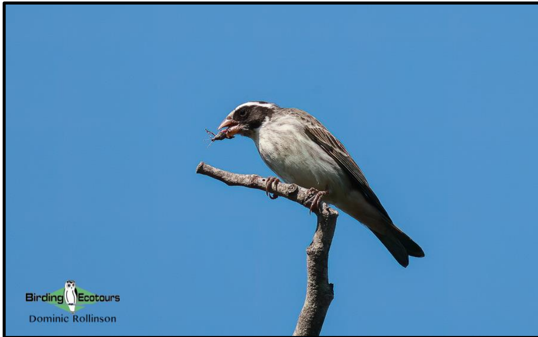
Black-eared Seedeater tucking into a juicy insect.

did, however, find African Olive Pigeon , Mottled and African Black Swifts , Red-faced Crombec , Green-capped Eremomela , Stierling's Wren-Warbler , Striped Pipit , Black-eared Seedeater and Cabanis's Bunting .