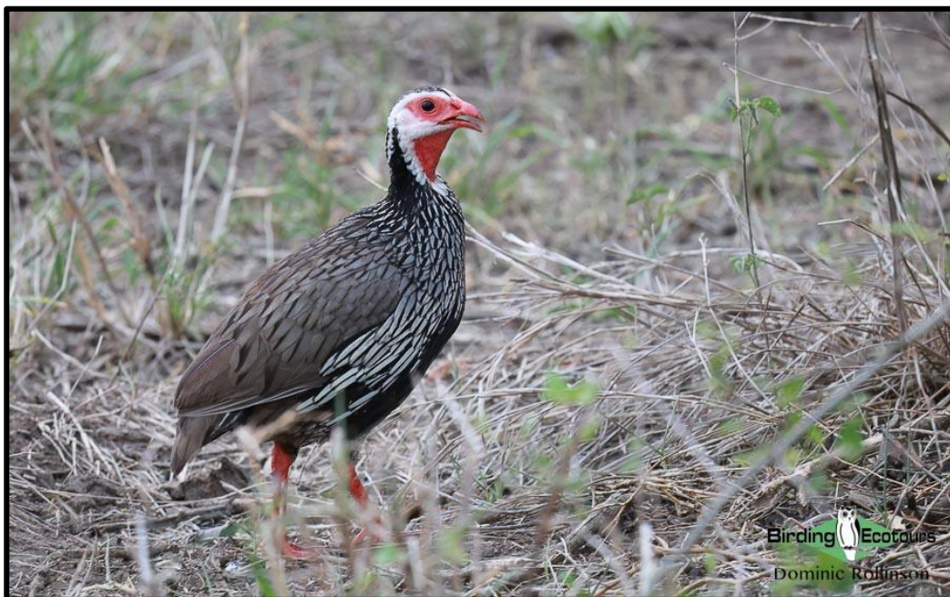
Attractive Red-necked Spurfowl were common in Gorongosa National Park.

Gorongosa National Park has been restocked with megafauna since the end of the civil war and nowadays has vast herds of antelope with good numbers of predators too, making it on par with some of Africa's top wildlife havens. This morning, we had a private game drive on an open-top safari vehicle with a highly experienced ranger, which was a thoroughly enjoyable way to see the park and its amazing wildlife and birdlife. The birding was wildly productive and, while traversing the vast Urema Floodplain, we added the likes of Knob-billed Duck , Blue-billed Teal , Red-necked Spurfowl , Grey Crowned Crane , Long-toed Lapwing , Collared Pratincole , African Skimmer , African Openbill , Saddle-billed and African Woolly-necked Storks , Goliath Heron , Blue-cheeked Bee-eater , White-winged Widowbird and Black-winged Bishop .