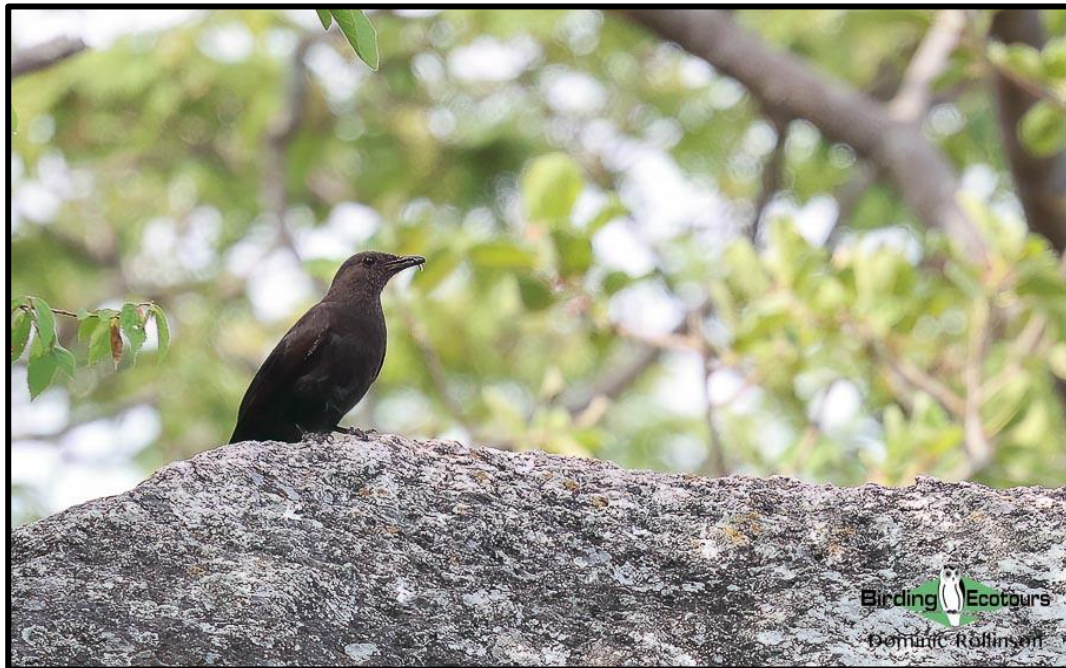
Boulder Chat was seen well at Christon Bank, near Harare.