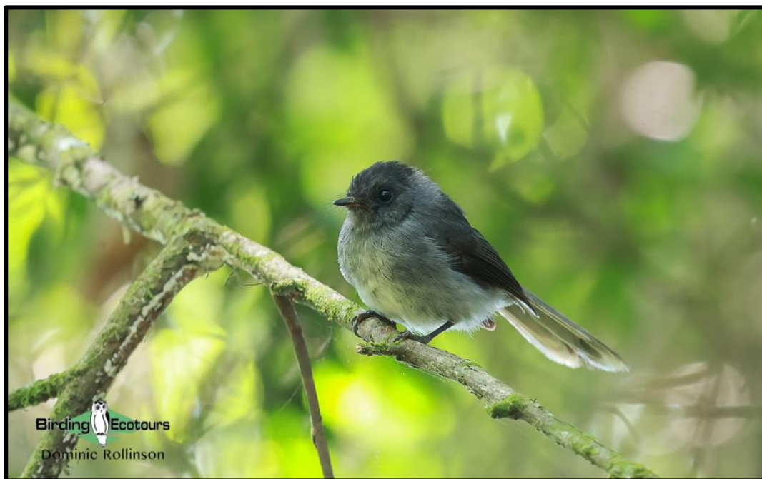
White-tailed Crested Flycatchers were common and confiding in the Mbumba Mountains.

For our afternoon birding we headed to the nearby Bvumba Botanical Garden, which is a lovely birding spot with open lawns interspersed with forest patches. We mostly concentrated on the forest patches, where the highlight was a confiding Swynnerton's Robin , which showed beautifully for us. Other notable species here included Eastern Bronze-naped Pigeon , Cape Batis , White-tailed Crested Flycatcher , Chirinda Apalis , Yellow-throated Woodland Warbler , Holub's Golden Weaver and Cape Canary . We searched the garden's lawns for the migratory Tree Pipit, however, with the area as dry as it was, we speculated that this species was yet to arrive in the area in good numbers. Thus concluded another wonderful day's birding, with just about all the area's highland forest specials having made their way onto our list.