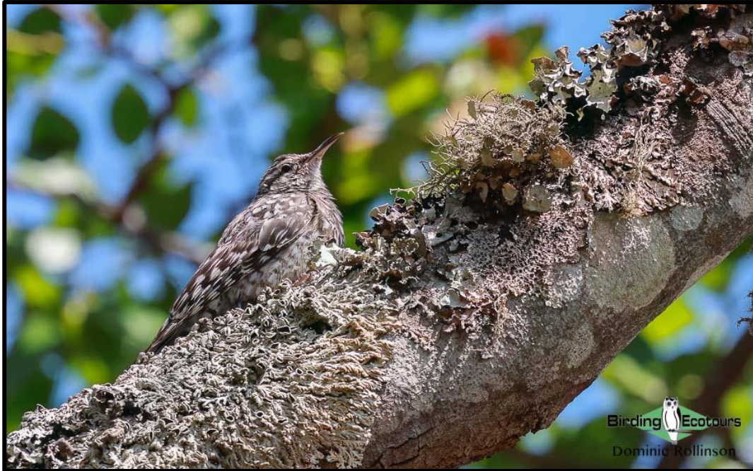
African Spotted Creeper was an early trip highlight.

In the mid-afternoon we started our descent into the Honde Valley (adding Singing Cisticola en route) and, after negotiating the long windy road, we eventually arrived at the beautiful Aberfoyle Lodge. After a long day on the road, we decided to take it easy for the remainder of the afternoon and simply took in the beauty of the area while enjoying a glass of wine, with the early evening serenity only broken by the squeals and squabbles of the local Blue Monkeys coming from the nearby forests.