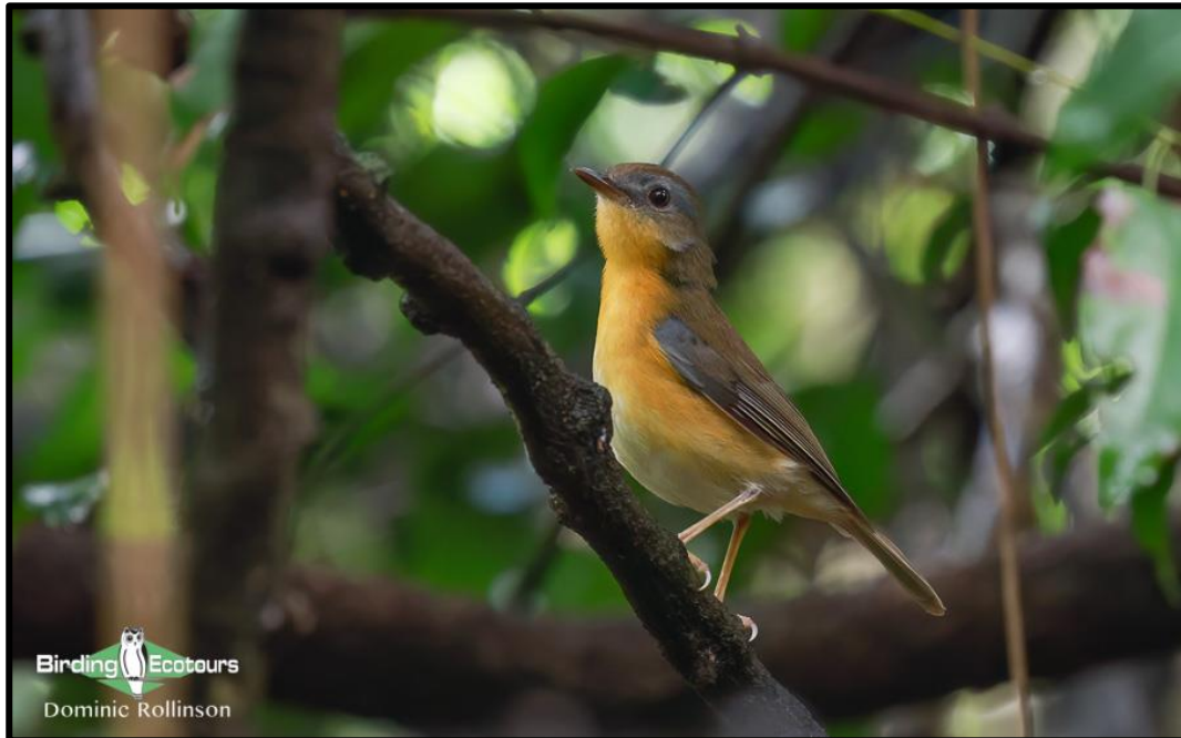
East Coast Akalats were rather confiding in the coutadas of Mozambique.

as well as some classy birds such as African Skimmer , Long-toed Lapwing , White-headed Vulture , Bateleur and Collared Palm Thrush . We then excitedly transitioned to the lowland forests near the Zambezi delta where, after extensive searching, we eventually found African Pitta , as well as some other specials such as White-chested Alethe , East Coast Akalat , Chestnut-fronted Helmetshrike , African Broadbill , Black-and-white Shrike-flycatcher , Barred Long-tailed Cuckoo , Livingstone's Flycatcher and Lowland Tiny Greenbul . The trip finished as we birded the coastal grassland and mudflats near to Beira, which further added Rufous-bellied Heron and several interesting shorebird species.