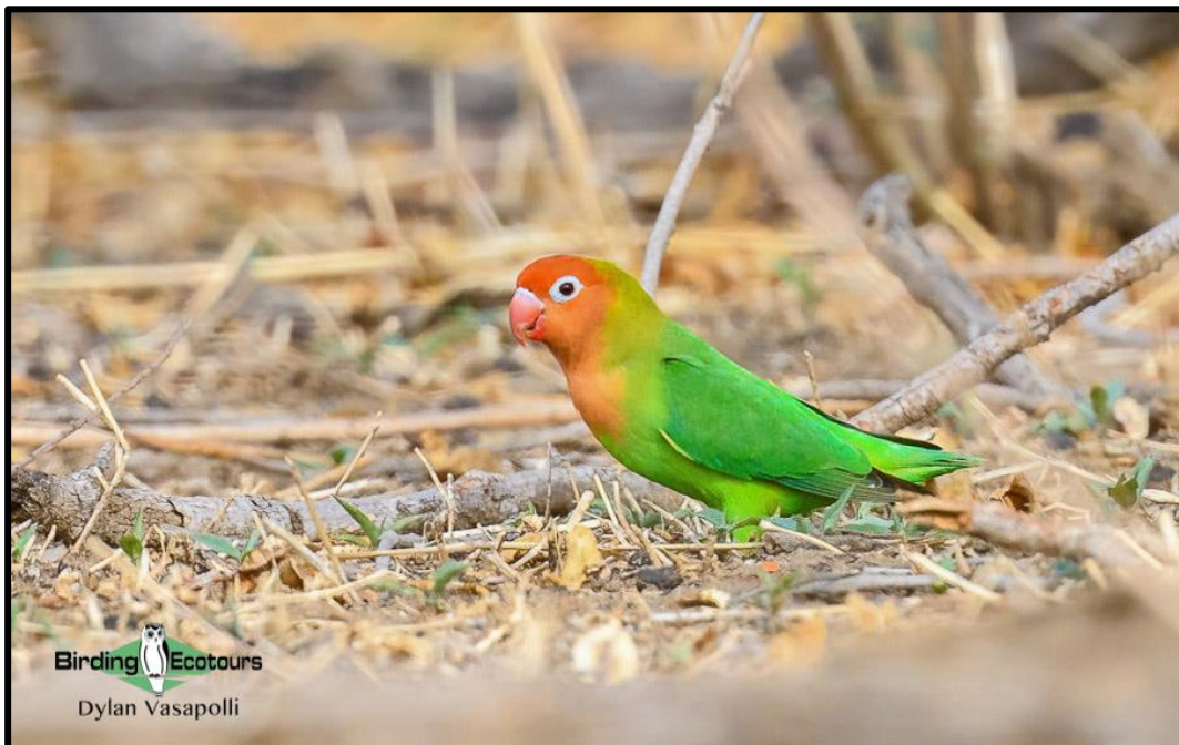
The localized Lillian's Lovebird will be looked for in the woodlands of Mana Pools.

Mana Pools is another of Africa's great game parks , and it is one of the continent's premier wildlife-viewing areas! Like their mammal counterparts, the birdlife within the area is nothing short of outstanding – with an incredibly diverse array of species, including some very special birds, all awaiting us! We will spend four nights in the area, and our time will be taken up with a mix of birding/wildlife drives as we navigate through the area. We will also undertake short walks through the wilderness – mostly in our pursuit of African Pitta . Our focus will be on the birds and mammals alike in this area, and we find that the two work in perfect harmony with each other. A wide range of habitat is covered, from mixed bushveld on rocky slopes covered in baobab trees, sections of tall, gallery mopane woodland, through to dense riverine thickets, dry riverbeds, and large areas of open riverine woodland, with scattered pans and wetlands dotted throughout the region. The mighty Zambezi River flows through the park and is the primary reason for the incredible diversity here.