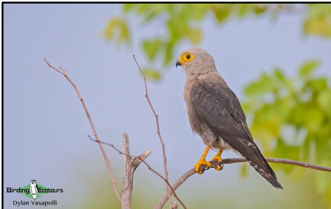
Dickinson's Kestrel is one of many raptor species we may see around Mana Pools.

Today, we will have a long transfer (roughly five hours of travel time) to reach our next destination of the trip – Mana Pools National Park, and thus we will be keen to get going early. While the trip to Mana Pools will likely be uneventful, stops en-route, such as around Lion's Den, may provide us with species such as Black-chested Snake Eagle , Red-faced Cisticola , Copper Sunbird and the highly prized Racket-tailed Roller . Eventually, we will descend sharply into the verdant Zambezi Valley, and proceed onwards to our comfortable and well-appointed exclusive lodge, in time for our late afternoon birding.