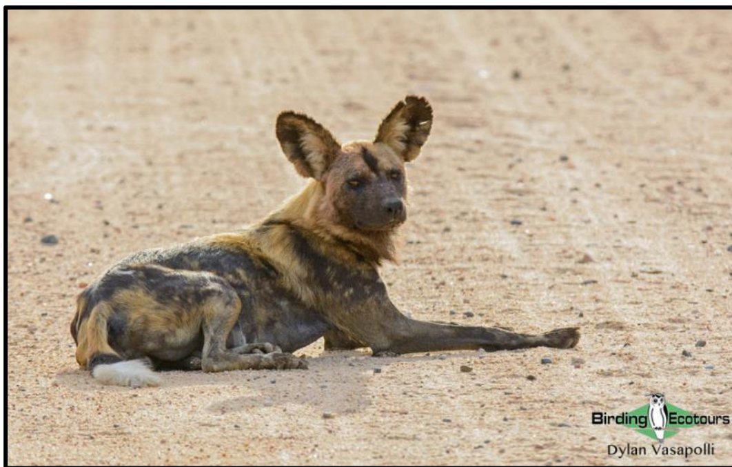
African Wild Dog is a major target whilst at Mana Pools.

This tour starts in the country's capital city, Harare, before we soon transition to the famous Mana Pools National Park , a lush reserve at the bottom of the breathtaking Zambezi River Valley (here, the Middle/Lower Zambezi, one of Africa's biggest rivers, is bounded by steep and immense escarpments on either side) and full of excellent birds. Some of our early highlights are likely to include the highly desired African Pitta (for which this tour is specifically timed), the localized Lilian's Lovebird and a wide spectrum of mammals. Indeed, Mana Pools is a famous predator viewing area, with high concentrations of Lion , Leopard and the rare African Wild Dog , all serving as a precursor to the wonders that await.