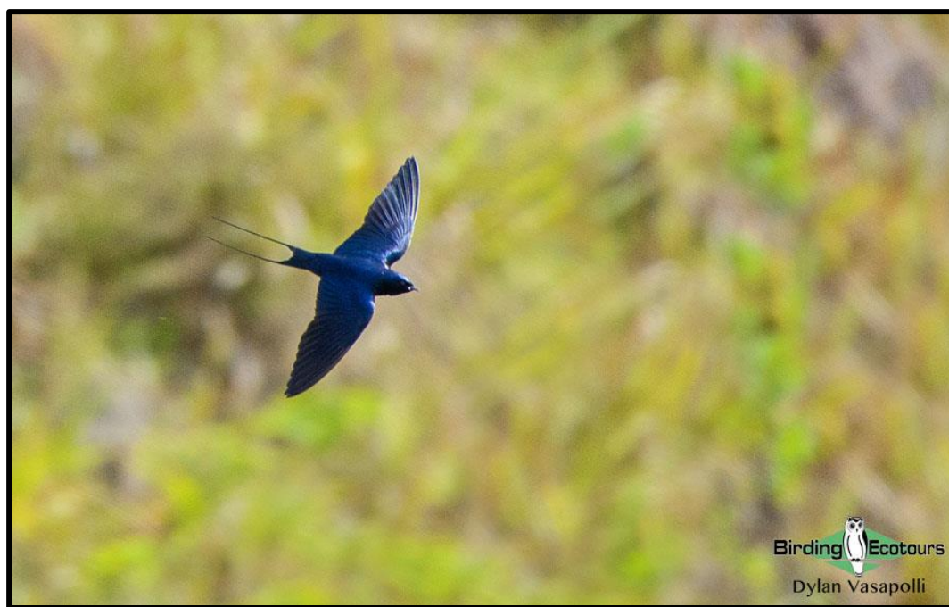
The Vulnerable and declining Blue Swallow is still relatively common at Inyanga.

Overnight: Seldomseen Cottages, Bvumba Highlands