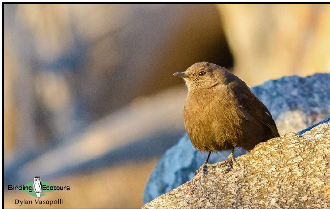
The localized Boulder Chat is virtually endemic to Zimbabwe, and is a major birding target.

For those who would like to target several range-restricted and tricky-to-find Mozambique specials, you can join our Mozambique Birding Tour: Crab-plover and Lowland Forests which immediately follows this Zimbabwe bird watching tour. On this trip we spend time in the lowland forests of central Mozambique looking for White-chested Alethe , East Coast Akalat , Chestnut-fronted Helmetshrike and other desirable specials. We then move south to the coast where we search for Crab-plover , Saunders's Tern and many other coastal birds.