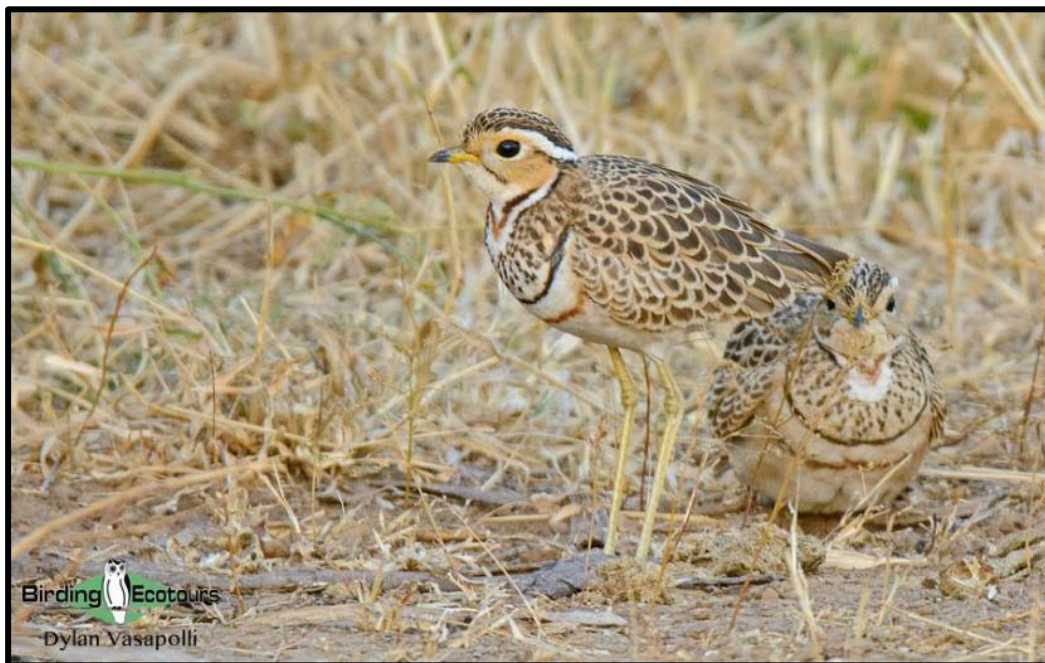
The scarce Three-banded Courser can be reliably seen in Mana Pools.

A day trip from our lodge to visit the many wetlands and pans, along with the Zambezi River itself, should produce a wide array of waterbirds, and we're sure to find a number of ducks, plovers, storks, herons and egrets here. Some of the more important species we'll be targeting include Long-toed and White-crowned Lapwings, Greater Painted-snipe, Collared Pratincole, Saddle-billed Stork and Goliath Heron . Western Banded Snake Eagle can often be found in the trees surrounding these water bodies, and we may also stumble upon the highly prized Pel's Fishing Owl if we're very lucky. Nocturnal birding can also be rewarding here, and the bulk of our focus will be on finding the scarce Three-banded Courser . Other species such as African Barred Owlet, Verreaux's Eagle-Owl and African Wood Owl are usually around, along with Fiery-necked Nightjar and even the spectacular Pennant-winged Nightjar .