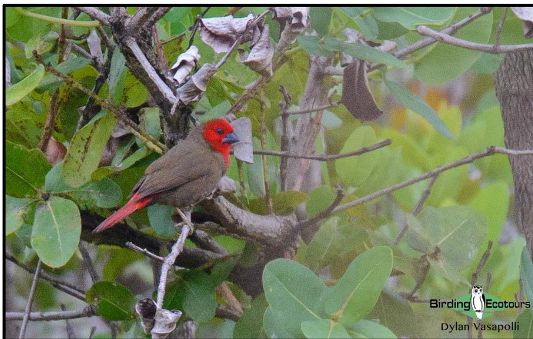
The beautiful and rare Lesser Seedcracker.