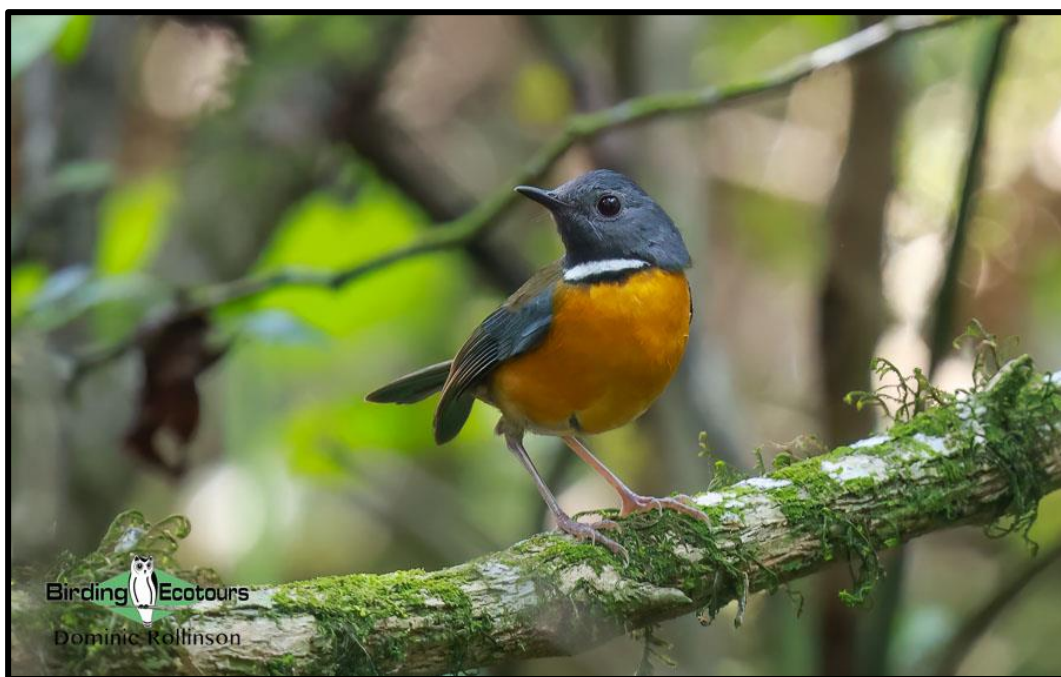
The attractive Swynnerton's Robin occurs in the forest of the Bvumba Mountains.

Overnight: Seldomseen Cottages, Bvumba Highlands