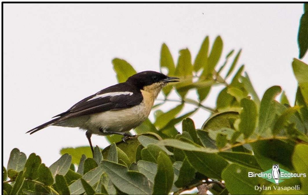
Miombo woodlands near Harare should produce sightings of Southern Hyliota .

Harare is a birdy city, with the lush gardens and woodlands allowing birdlife to thrive. Additionally, the city and some of the surrounding areas on the Mashonaland Plateau host some of the finest tracts of the unique miombo woodland in the country. Dominated by Brachystegia trees, covered in lichen and moss, this woodland hosts several species virtually confined to these patches. We have a full day at our disposal to explore some of the birding sites in and around Harare, specifically targeting the miombo specials.