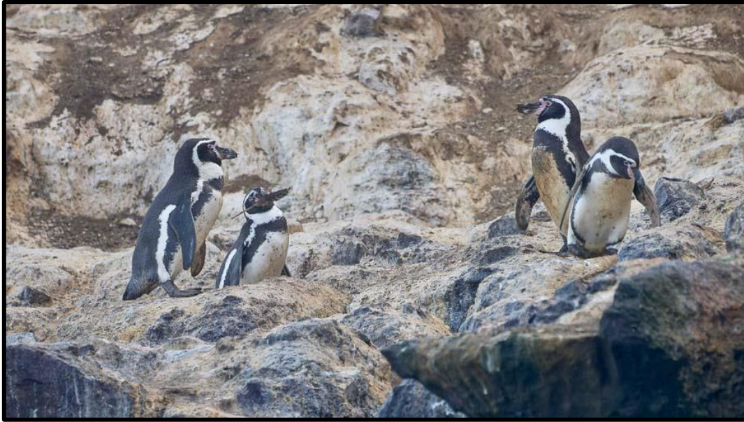
As the name suggests, Humboldt Penguin is another target of the cold waters of the Humboldt Current.

We left Pucusana and headed towards the town of Chilca. On the way, we explored the small wetlands along the shores of the Playa Yaya, where we were hoping for Peruvian Thick-knee and Peruvian Martin, both seen earlier this year on a Birding Ecotours day tour . Sadly, none were around, however, we entertained ourselves with great views of common species such as Cinnamon Teal , White-cheeked Pintail , Grey-headed and Franklin's Gulls , Puna Ibis , and Black-necked Stilt . We even saw some of the last-remaining shorebirds before their winter departure, such as Kildeer , Snowy Plover , Wilson's Phalarope , Hudsonian Whimbrel , Marbled Godwit , Willet , Lesser and Greater Yellowlegs , Stilt Sandpiper , and Pectoral Sandpiper . While enjoying Black Skimmers , we spotted Peruvian Pipit , Least Seedsnipe , and Coastal Miner .