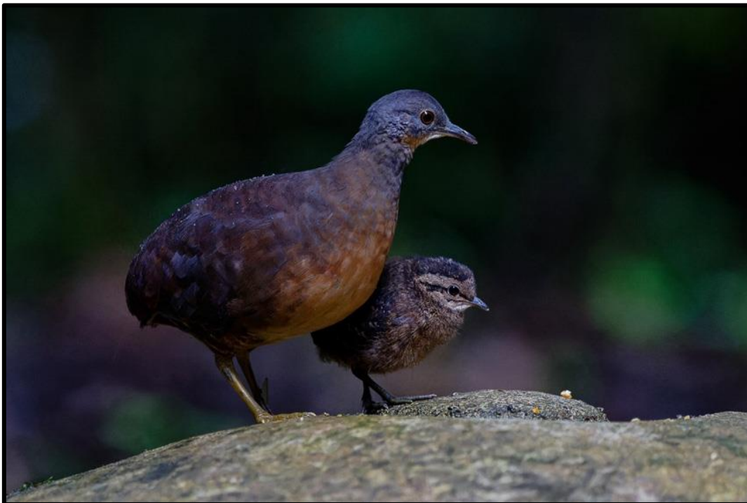
Little Tinamou also with a tiny chick, what a morning! (photo Dr Uwe Speck).