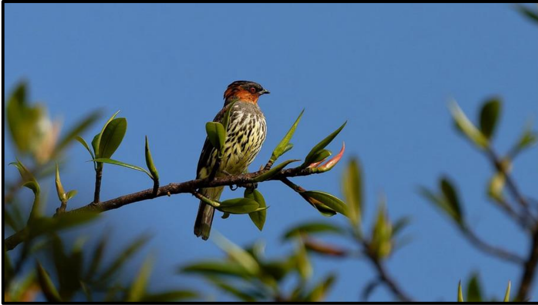
The striking Chestnut-crested Cotinga at Owlet Lodge.