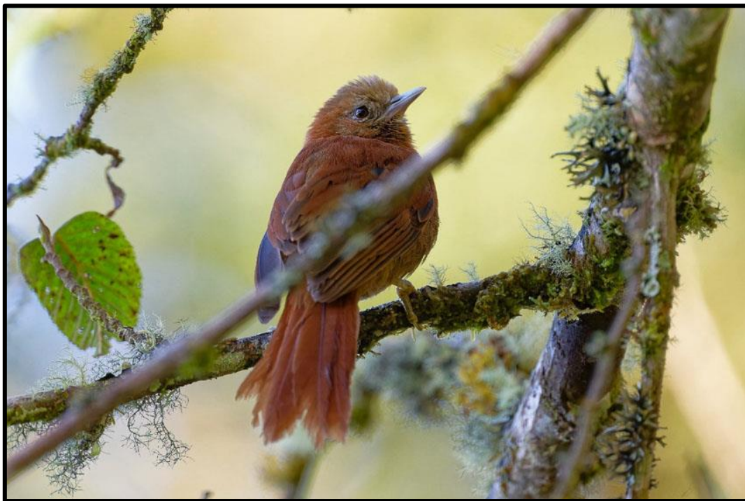
The endemic Russet-mantled Softtail at Abra Barro Negro.