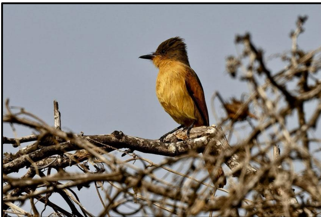
Rufous Flycatcher, yet another endemic.

We started walking along trails, and we found Chinchipe Spinetail , Amazilia Hummingbird , Fasciated Wren , Scarlet-backed Woodpecker , Streak-headed Woodcreeper , Pacific Parrotlet (wild population), White-edged Oriole , and the handsome Tumbes Tyrant (Tumbes Chat-Tyrant). We were also treated to views of Guayaquil Squirrel and the first of the endemics: Rufous Flycatcher .