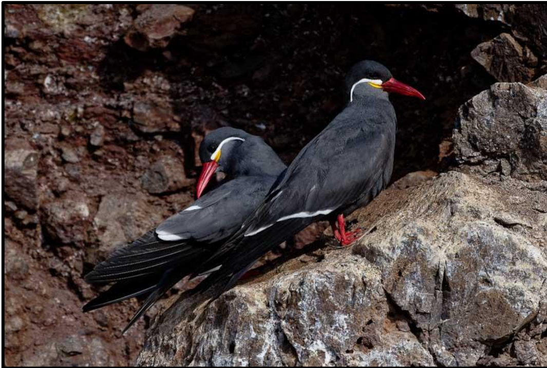
Inca Tern is one of the best-looking birds along the coast of Lima.

Our Comprehensive Northern Peru tour is an excellent overlanding birding adventure that covers five Peruvian states, with a focus on country endemics and regional specials shared with adjacent Ecuador and some neighboring countries. We started our trip by visiting the coast of Lima in search of Humboldt Current specials such as Inca Tern , Humboldt Penguin , Peruvian Pelican , Peruvian Booby , and Red-legged Cormorant . We then explored the desert and arid coastal valleys, where we had wonderful encounters with Rufescent Flycatcher , Pied-crested Tit-Tyrant , Parrot-billed and Drab Seedeaters , Pacific Pygmy Owl , West Peruvian Dove , Croaking Ground Dove , Coastal , Greyish and Thick-billed Miners , Amazilia Hummingbird , and Dark-faced Ground Tyrant . The coastal freshwater lagoons delivered other species, including Great Grebe and Many-colored Rush Tyrant .