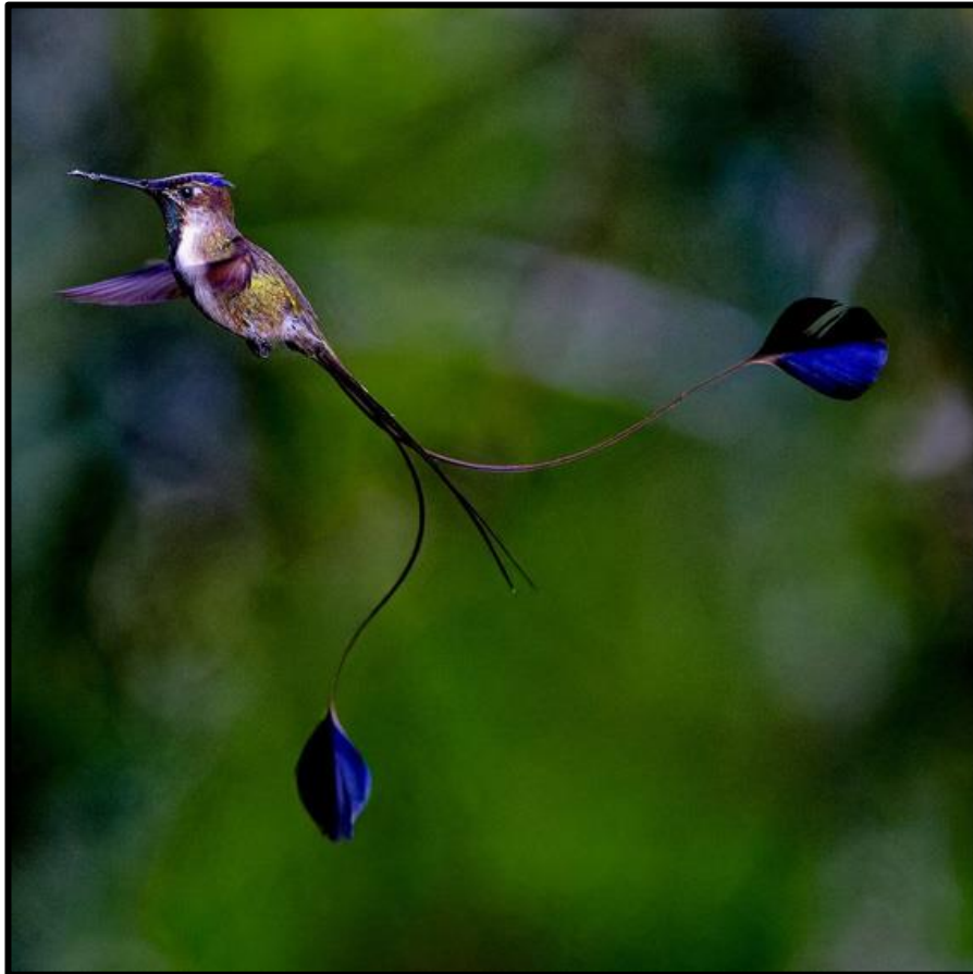
Marvelous Spatuletail put on a show for us!.

We crossed the Marañón River in Corral Quemado and entered the state of Amazonas. Here, we followed the course of the Utcubamba River towards the semi-humid montane forest in the Bongara province to stay at the Huembo Reserve, the site for Marvelous Spatuletail . We arrived late in the afternoon, but we still managed to see Little and White-bellied Woodstars , Lesser Violetear , White-bellied Hummingbird , Andean Emerald , Chestnut-breasted Coronet , and Green-tailed Trainbearer .