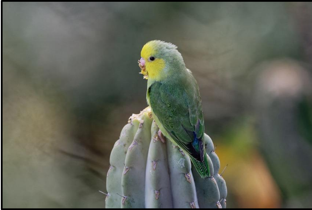
Yellow-faced Parrotlet - jewel of the Marañon.

We rushed to continue driving up to Hacienda El Limon, where we had great views of the endemic Grey-winged Inca Finch and fly-by views of the secretive and endemic Chestnut-backed Thornbird near its nest. With the big five of the Marañon in the bag, we continued our journey towards Cajamarca. It is possible to break the long journey by staying in the town of Celendin. However, there were several complications, including road construction projects and community tension regarding mining in the area, so we decided to push through to Cajamarca. On the way, we manage to see Black-billed Shrike-Tyrant , Andean Flicker , Puna Ibis , Andean Lapwing , and American Kestrel .