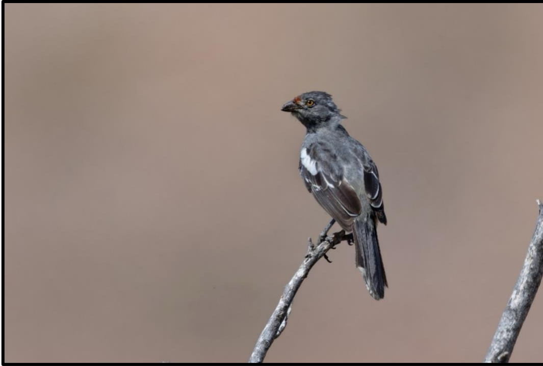
Peruvian Plantcutter – a Peruvian endemic.

The lush tropical humid montane forest of the Amazonas State in Huembo and the famous Abra Patricia did not disappoint. Despite many rainy days, we managed great looks at the striking Marvelous Spatuletail – an endemic of the Utcubamba Valley, restricted to the Amazonas State! This bird is often regarded as the most spectacular hummingbird in the world and is a major drawcard of this tour. We also managed to feast our eyes with great views of the enigmatic Long-whiskered Owlet , Chestnut , Rusty-tinged and Ochre-fronted Antpittas , Lulu's Tody-Flycatcher , Bar-winged Wood Wren , White-capped Tanager , Yellow-scarfed Tanager , Red-ruffed Fruiterow , Crested Quetzal , Torrent Duck , and White-capped Dippers , among many others.