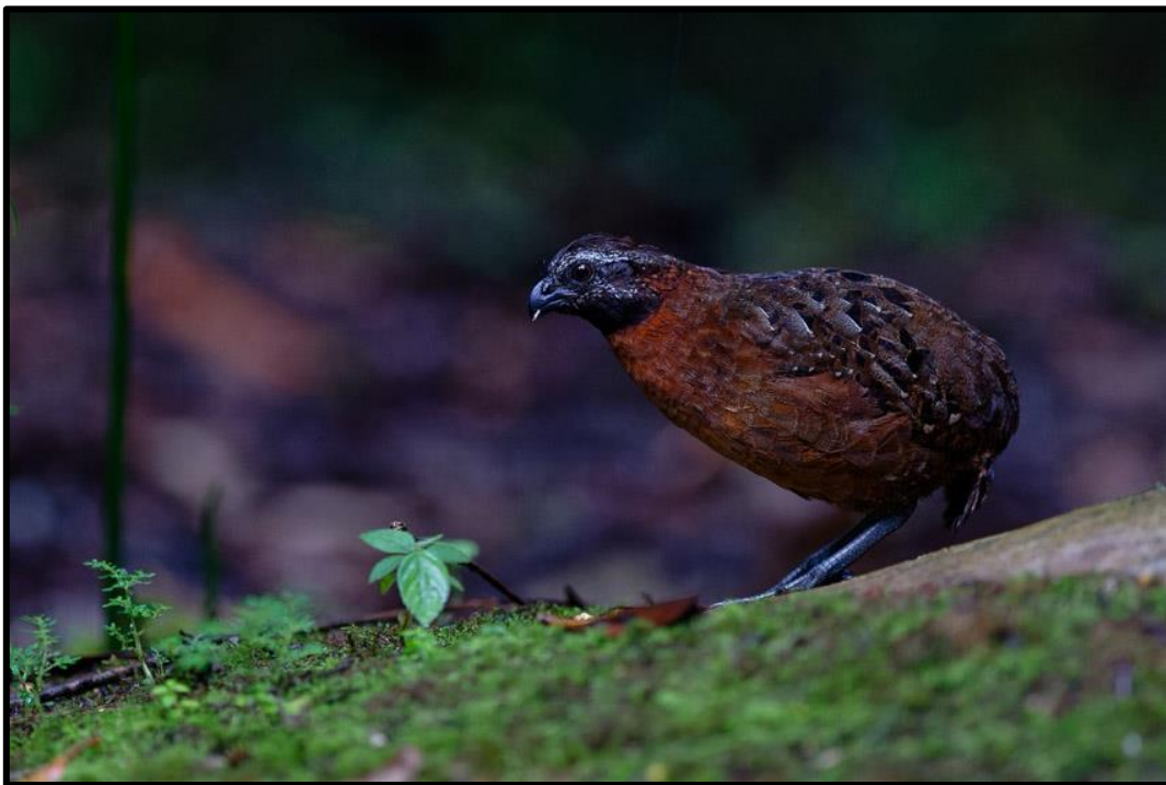
The incredibly cute Rufous-breasted Wood Quail.

We had a predawn start so that we could be at the Arena Blanca Reserve before 06.30 am to try for Little and Cinereous Tinamous and Rufous-breasted Wood Quail that had been visiting the feeding station. The landowner informed us that the Little Tinamou had not been coming for several days, but the other two were attending normally. The rain had set in again, so we started with the hide, followed by breakfast, hummingbird feeders, and the gardens, which sounded like a plan considering the inclement weather.