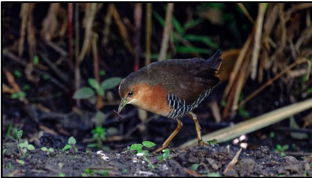
Rufous-sided Crane put on an excellent performance.

Today, we had another early start to explore the Morro de Calzada south of Moyobamba. This time, we had the chance to visit a new private reserve that has a feeding station for Rufous-sided Crane . I have to say that watching "Tito and Tita" feeding out in the open of the swampy pond was a really unexpected treat for both me and the participants.