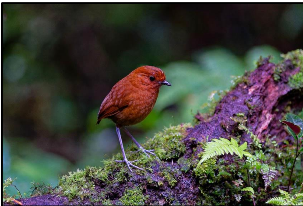
Chestnut Antpitta is always a treat to see !

We left the reserve and headed to Owlet Lodge in the Abra Patricia Mountains. Due to the exceptional avian diversity, the humid montane forest here has long been on the radars of visiting birders. We arrived at the lodge and spent the day birding the lodge grounds and enjoying the hummingbird feeders. The feeders were busy, and we saw Emerald-bellied Puffleg , Collared Inca , Long-tailed Sylph , Speckled Hummingbird , and Fawn-breasted Brilliant – all new additions to the trip list. The day was quiet for a while, and we heard several birds, including Rufous-vented Tapaculo , Russet-crowned Warbler , Green-and-black Fruiteater , and Rufous Spinetail . Later, on the way down to the gate, we heard the distant call of a flock of White-capped Tanagers . After some playback, we had walk-away views of these stunning birds. Immediately after the tanagers, our first mixed species flock passed by the lodge, producing Yellow-scarfed Tanager , Lacrimose Mountain Tanager , Grass-green Tanager , Spectacled Whitestart , Blue-capped Tanager , Olivaceous Siskin , Hooded Mountain Tanager , and Montane Woodcreeper . We concluded the day with a Bat Falcon perched in the lodge grounds.