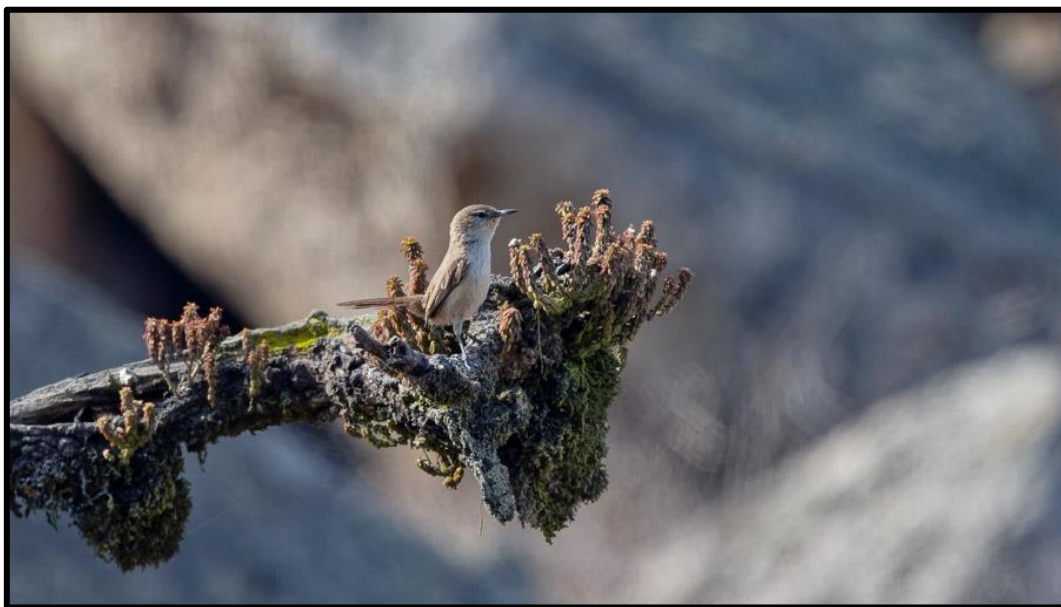
The endemic Cactus Canastero in Lomas de Asia.

We left and were transferred to the airport for our flight to Chiclayo, where we landed in the afternoon and made our way to our lovely hotel for the night.