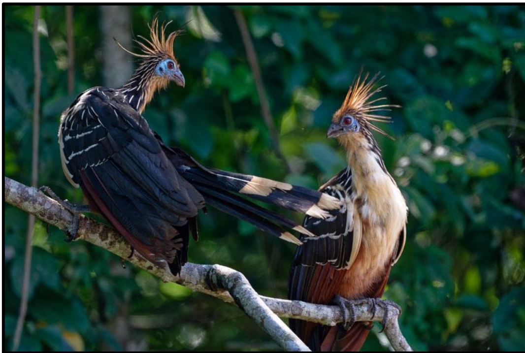
Hoatzin in the Huallaga River.

We left the reserve and made our way back to Tarapoto, where we had lunch at a local restaurant and enjoyed traditional Amazon cuisine. Our plan for the afternoon was to focus on exploring the lower parts of the road to Aconavit. However, our plans were unfortunately cut short due to ongoing road construction.