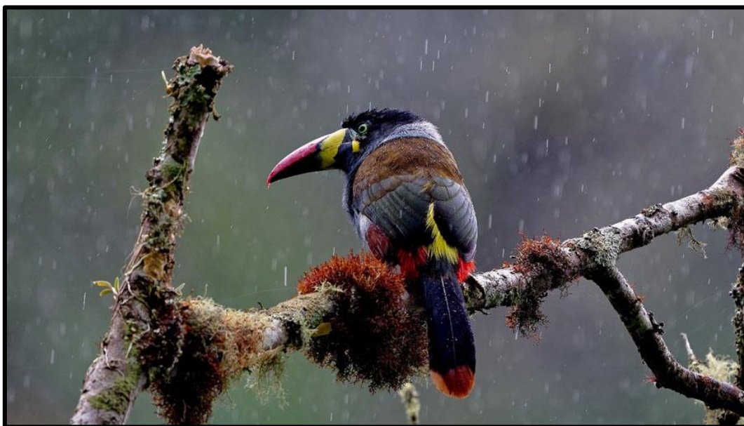
Grey-breasted Mountain Toucan in the never-ending drizzle.

We continued along the road and entered the drier section at 5,900 feet (1,800 meters) elevation, where we had fantastic views of Golden-rumped Euphonia , Buff-bellied Tanager , Line-cheeked and Azara's Spinetail , Barred Becard , a juvenile Black-capped Sparrow ( nigriceps race), Streaked Xenops , Maranon Tyrannulet , Yellow-bellied Elaenia , Chivi Vireo , Inca Jay , White-lined Tanager , Silver-backed Tanager , and Slate-throated Whitestart .