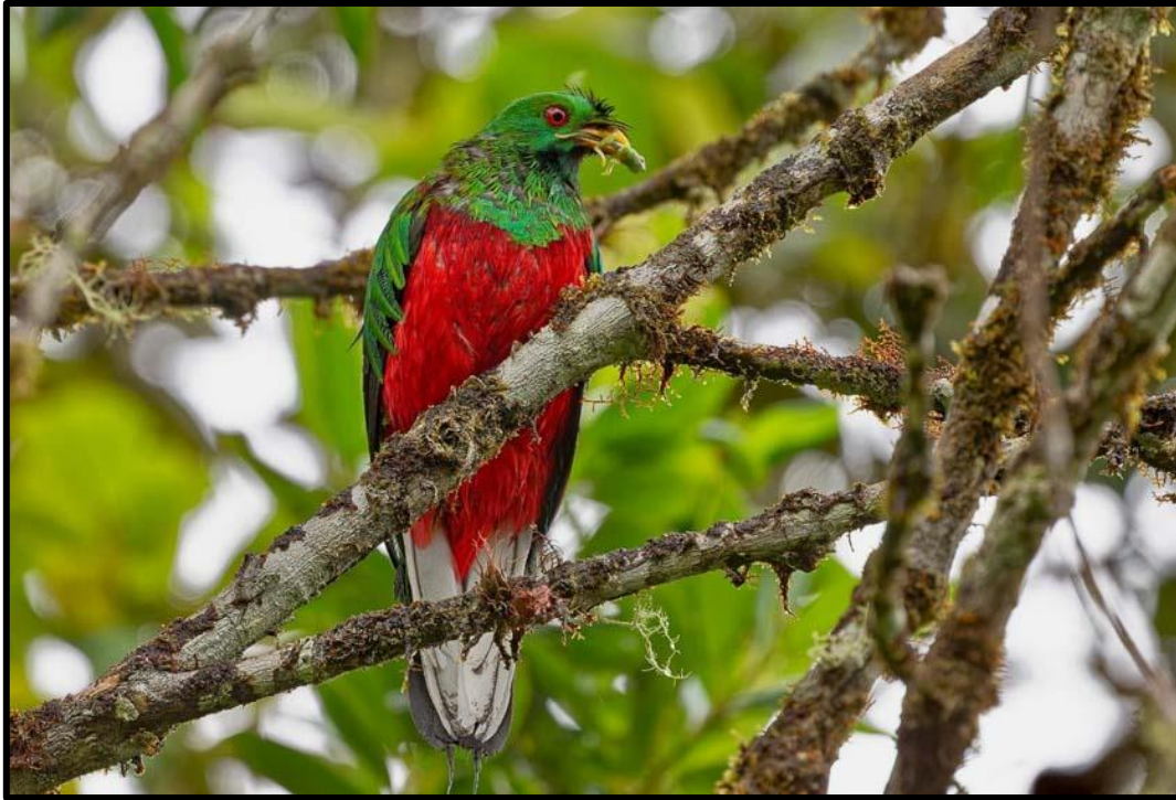
Crested Quetzal with protein supply at Nieva.