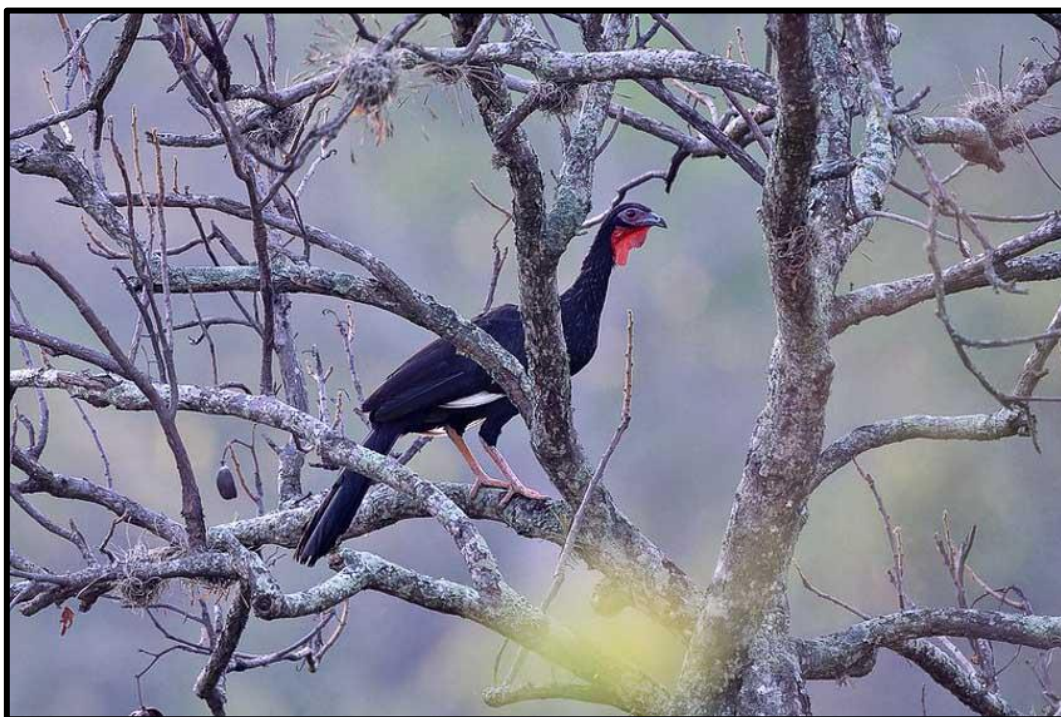
The critically endangered White-winged Guan was rediscovered in 1977 at Quebrada Frejolillo.

We arrived at dawn, and after checking in with the members of the community to organize our visit permits, we started our morning exploring the foothills of the dry Tumbesian zone. To our delight, the first species we saw was the Critically Endangered White-winged Guan and not just one but 20 individuals! I have visited this place for over 20 years and have never seen this many individuals close to the village. Later, we saw two more individuals who posed for a photo.