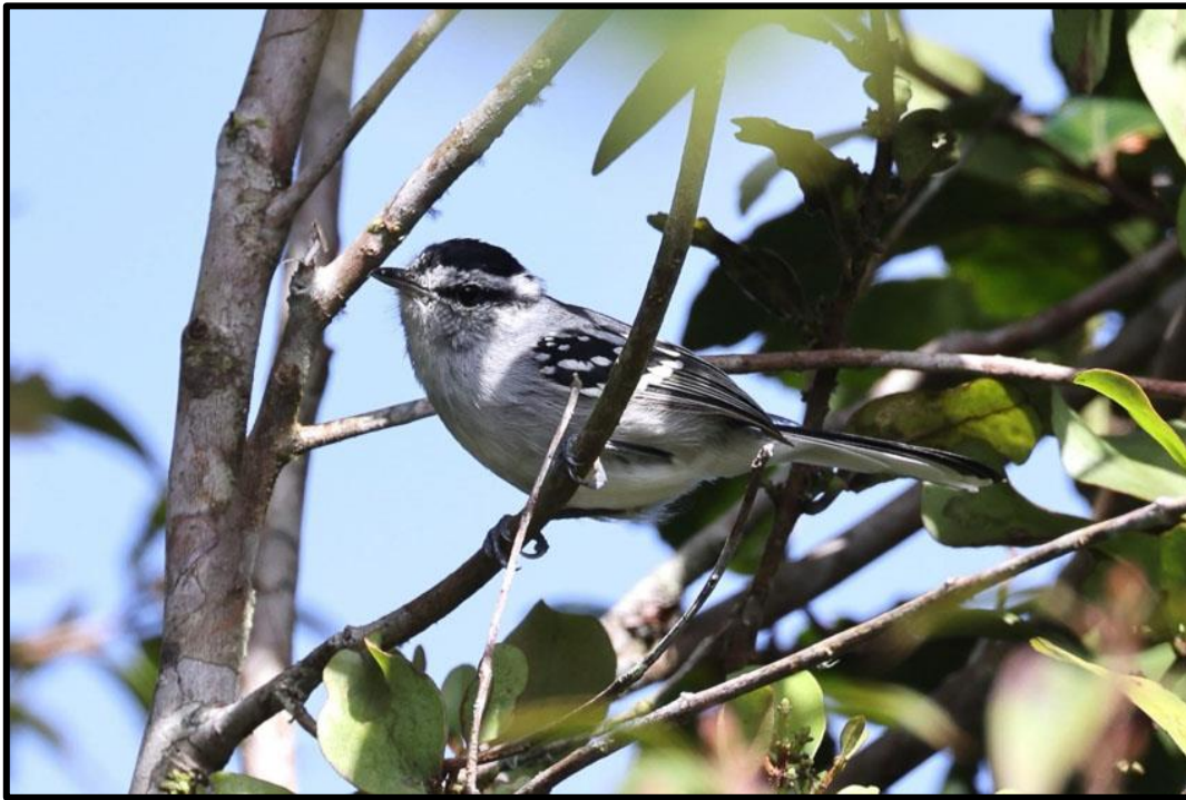
The mega endemic Ash-throated Antwren was seen nicely on our tour.

We left Moyobamba and headed north to Tarapoto. Along the route, we stopped at the famous Quisquirumi bridge, where we got good views of dozens of monotypic Oilbirds , flocks of White-eyed Parakeets and a single Short-tailed Hawk . We arrived at our hotel in Tarapoto and enjoyed a few hours off before heading to a lovely pasta restaurant in town.