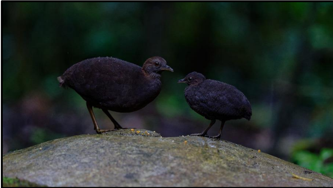
Cinereous Tinamou with a chick.

before the Little Tinamou showed up, too, with a chick! What an unforgettable experience! We waited for some usual suspects here, such as Grey-cowled Wood Rail, Ruddy Quail-Dove and Orange-billed Sparrow, but they were not around this morning. We then got our breakfast and enjoyed birds at the feeders.