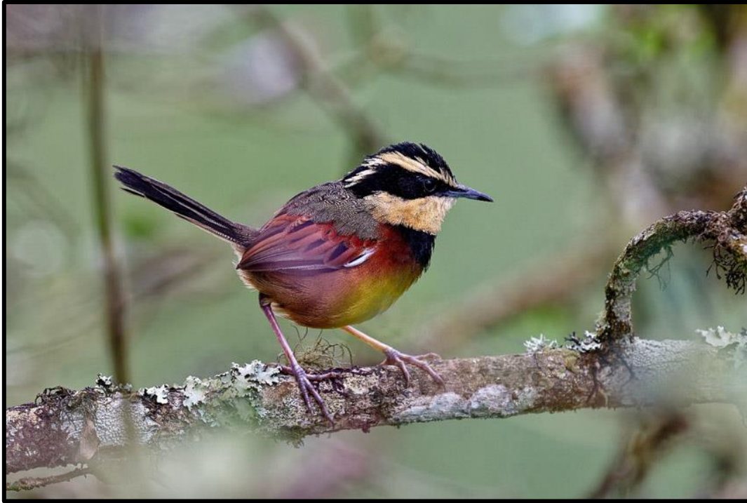
Elegant Crescentchest at Abra Porculla.

During our descent from the Andes, we saw our first Bare-faced Ground Dove , and along the rice fields of the Chamaya River, we had great views of Comb Duck and Scrub Blackbird . We then arrived at our comfortable hotel in Jaen and had the last hours of the afternoon free to shower and relax until dinnertime.