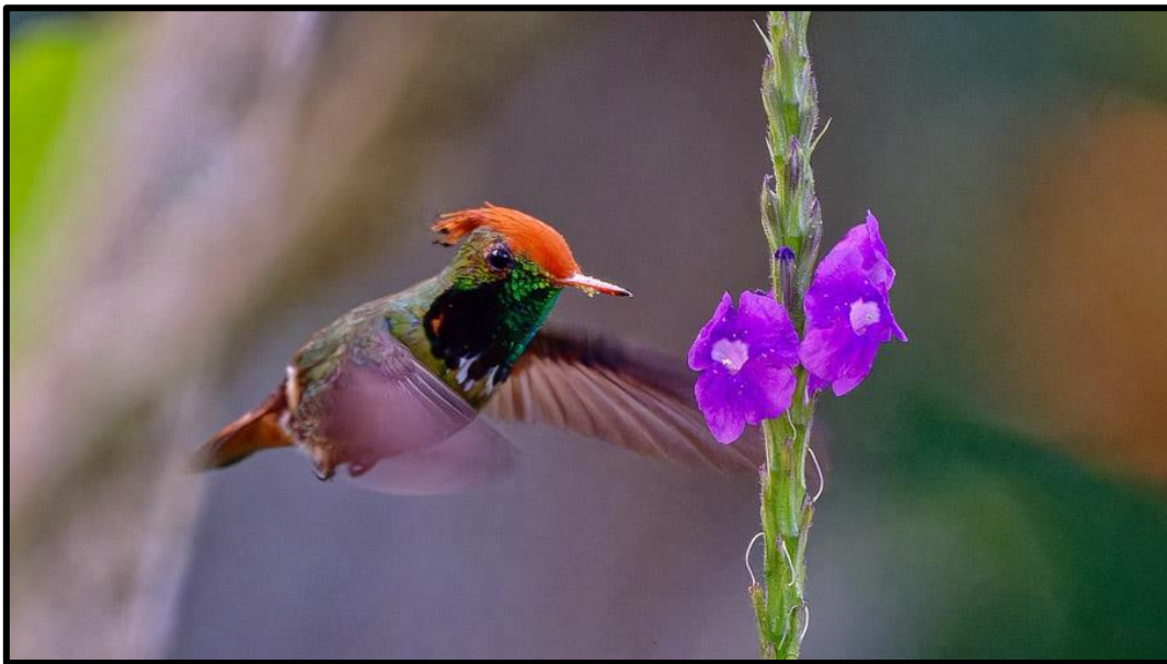
Rufous-crested Coquette at its best.