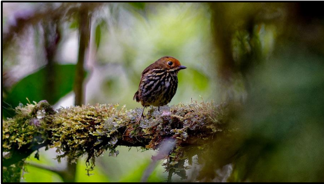
Ochre-fronted Antpitta found at Owlet Lodge.

Another predawn cup of coffee, and we were ready to start our day looking for the endemic Ochre-fronted Antpitta . Within our first hour of birding, we had a male along one of the trails, success! Later, we moved on to a feeding station where the lodge feeds the endemic Rusty-tinged Antpitta, but it wasn't to be today. We explored the trail and had Uniform Antshrike , Russet-crowned Warbler , Inca Flycatcher , Green-and-black Fruiteater , Mottle-cheeked Tyrannulet , White-collared Jay , Olive-backed Woodcreeper , Masked Trogon , Spotted Barbtail , Rufous Spinetail , and Rufous-vented Tapaculo .