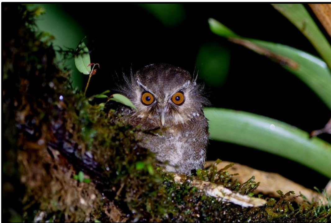
Long-whiskered Owlet at Abra Patricia.

With an overcast sky and a drizzle, we decided to walk down the trail searching for Long-whiskered Owlet . We did not bird too much on the way down except in a well-preserved patch of bamboo where we saw the endemic Lulu's Tody-Flycatcher . Despite the excellent condition of the trail, we still had to walk some distance and cross a few fast-flowing streams. However, our group was determined to give it their best, and we were rewarded with views of this most-wanted and poorly known owlet. On the way back, we managed to get a glimpse of the endemic Andean Night Monkey . There was no loop, so we had to return the same way; predictably, the walk was far more manageable with Long-whiskered Owlet in the bag.