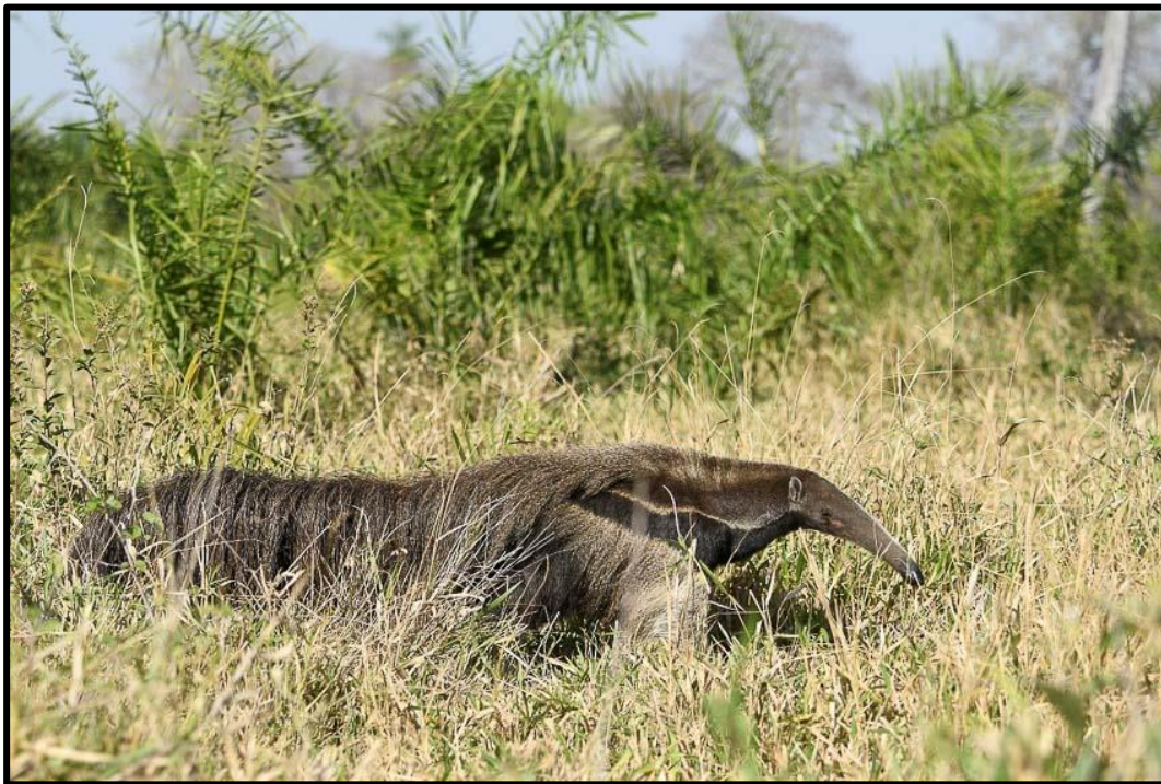
Piuval Lodge is a great place to see Giant Anteater.

In addition to birds, many mammal species call the Pantanal home. It is perhaps South America's greatest wildlife refuge, and we should enjoy daily sightings of Capybara (the largest rodent in the world), primates such as Black-tailed Marmoset , Bearded Capuchin and Black-and-gold Howler Monkeys . With luck, we might encounter Marsh Deer , Crab-eating Raccoon , South American Coati , Yellow Armadillo , Lowland (Brazilian) Tapir and Giant Anteater .