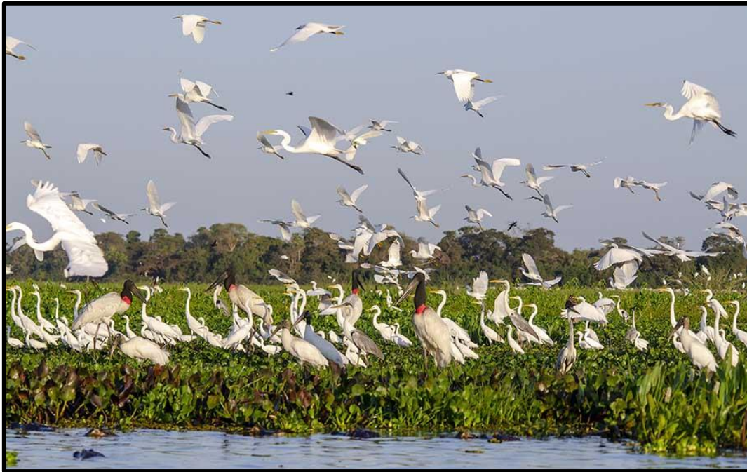
A feast for the eyes in the Pantanal.

During this part of the tour, we will have adequate time to admire the waterfalls and look for the area’s special birds. Target species include the impressive Great Dusky Swift , which roost on the waterfall cliffs, Red-rumped Cacique , Toco Toucan , Chestnut-eared Aracari , Blond-crested and Yellow-fronted Woodpeckers , Ochre-collared Piculet , Blue (Swallow-tailed) Manakin , Southern Antpiper , Eared Pygmy Tyrant , Chestnut-bellied Euphonia , Green-headed Tanager , Streak-capped Antwren , Surucua Trogon , Rufous-capped Motmot , Greenish Schiffornis , Rufous Gnateater , Dusky-tailed Antbird , and the most-wanted Black-fronted Piping Guan .