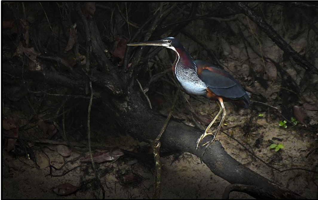
The elusive Agami Heron may be seen in the Pantanal.