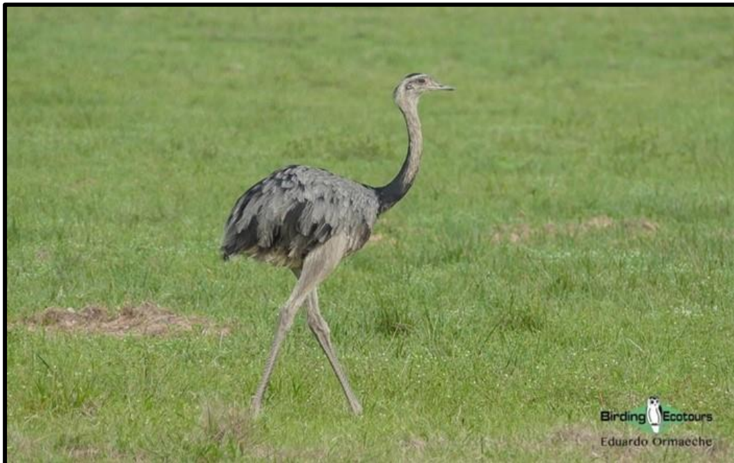
Greater Rhea may be seen along the road to Poconé.