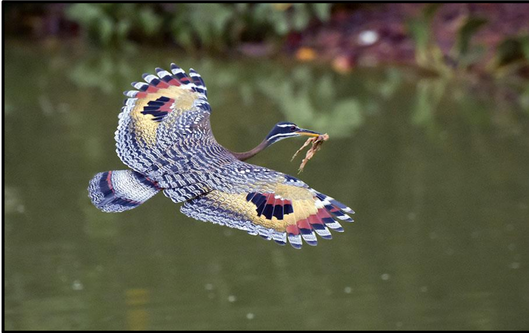
Sunbittern is high on the list of the neotropic's most wanted birds

We will spend the full day exploring Pousada Piuval. Our first activity will be a predawn search for Giant Anteater , if we haven't yet seen it. Later we will explore the expansive areas of this huge property to look for Pale-crested Woodpecker , Greater Thornbird , Chaco Chachalaca , White-throated Piping Guan , Bare-faced Curassow , Picui Ground Dove , Grey-cowled Wood Rail , Sunbittern , Savanna Hawk , Turquoise-fronted Amazon , Red-billed Scythebill , White-lored Spinetail , Orange-backed Troupial , and Greyish Baywing .