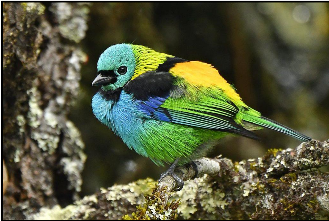
The stunning Green-headed Tanager can be found around Iguazu (photo Ricardo Boschetti).