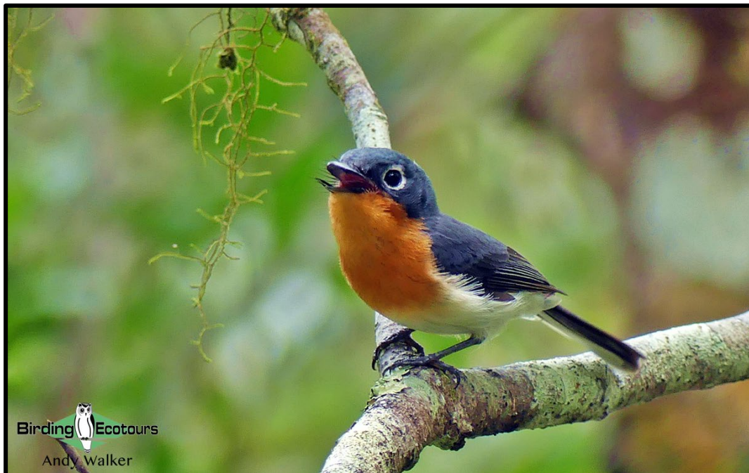
The near endemic Melanesian Flycatcher (this is the female) adds a splash of color to the forests and looks very different to the male bird, shown on the itinerary front cover.