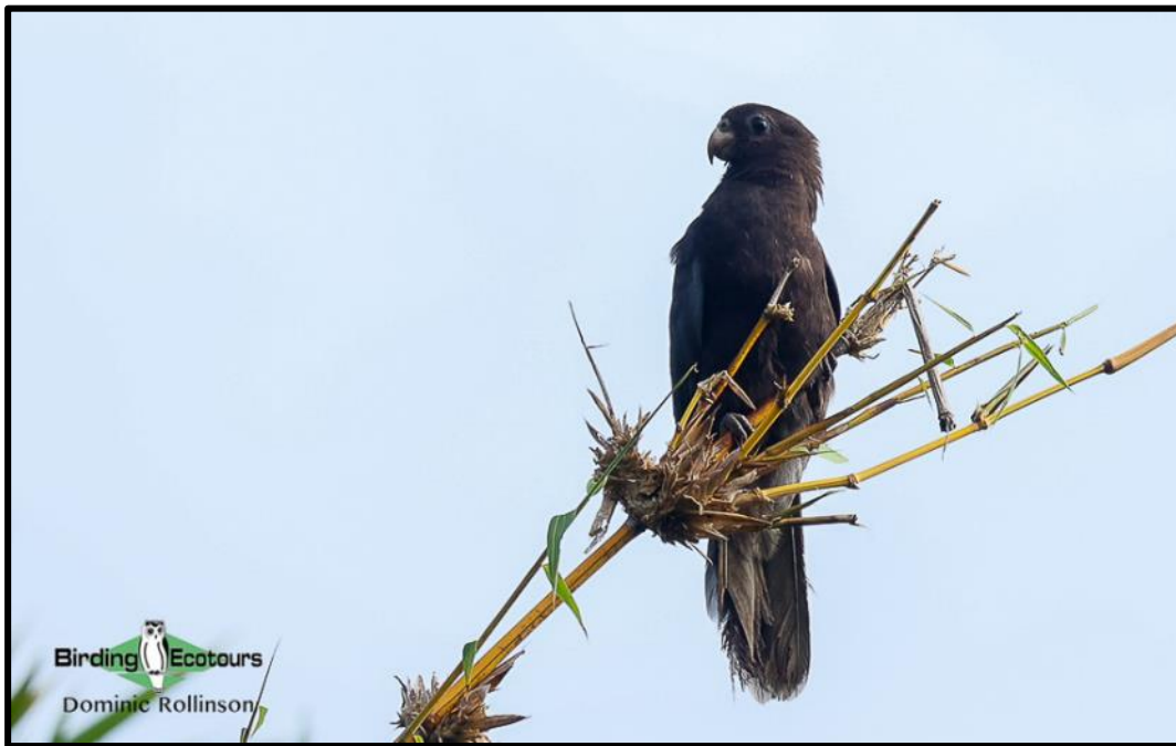
Lesser Vasa Parrots should be a regular feature of this tour.

The drive to Bekopaka will not be without its adventures, as it involves two ferry crossings! After a long day on the road, we will arrive at our accommodation and get an early night in anticipation of an exciting few days in this area.