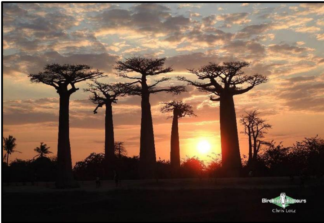
Sunsets at the "Avenue of the Baobabs" are out of this world!

Overnight: Palissandre Cote Ouest , Morondava