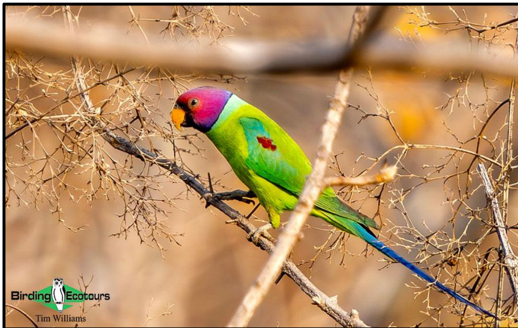
Plum-headed Parakeet showed well.

This year, we ran this three day extension trip to the Tansa Wildlife Sanctuary in the Indian state of Maharashtra , as a private tour for one person. We fitted this in between a private version of our Gujarat birding tour, and a Rajasthan custom tour. The trip was nicely successful, and we got to spend two wonderful sessions with our main target bird, the rare Forest Owlet . During this short tour, we also saw three other owl species, Savanna Nightjar , White-eyed Buzzard , three parakeet species including the gorgeously colorful Plum-headed Parakeet and the Western Ghats endemic Blue-winged (Malabar) Parakeet , Orange Minivet , Black-headed and Indian Cuckooshrikes , the Indian endemic Vigor's Sunbird , many Cotton Pygmy Geese and other wildfowl, and lots of other star birds (there are too many to mention here but do consult the bird list below for comprehensive details).