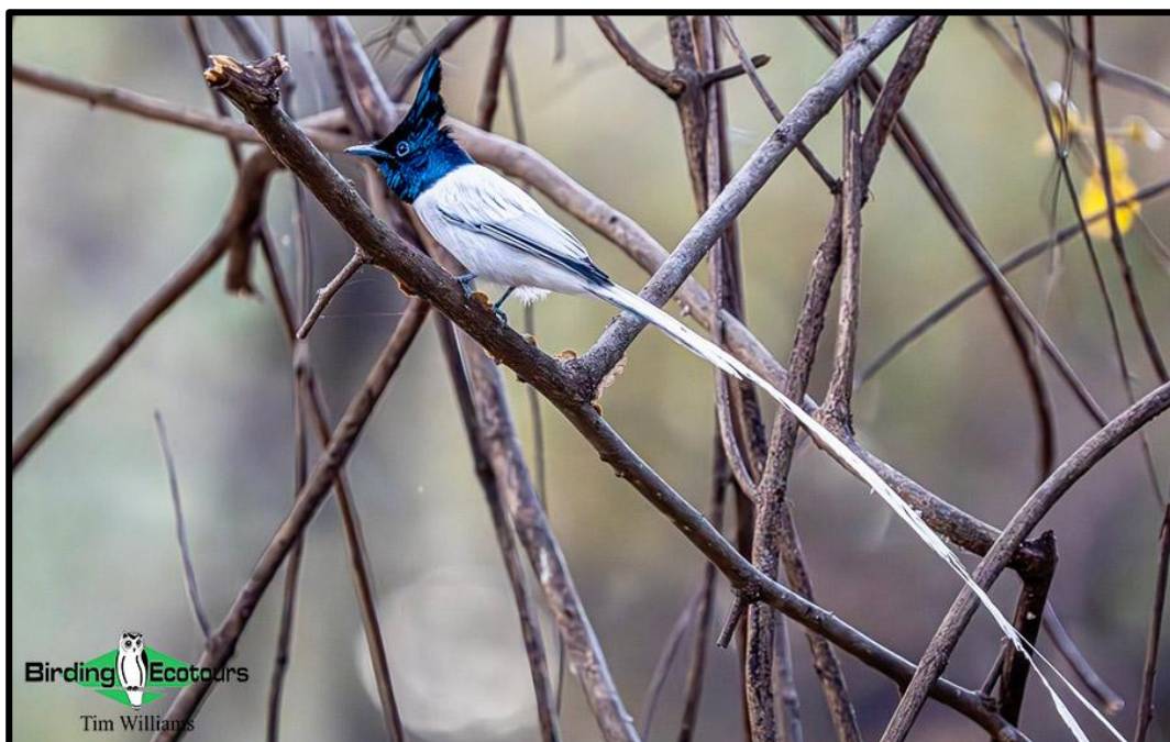
Indian Paradise Flycatcher showed well!

We then headed back to the hotel, packed up, had lunch and drove to Mumbai where the tour ended. All in all, the trip was very successful; we chose to spend two sessions with our main target, Forest Owlet , but also enjoyed seeing a good number of other great bird species.