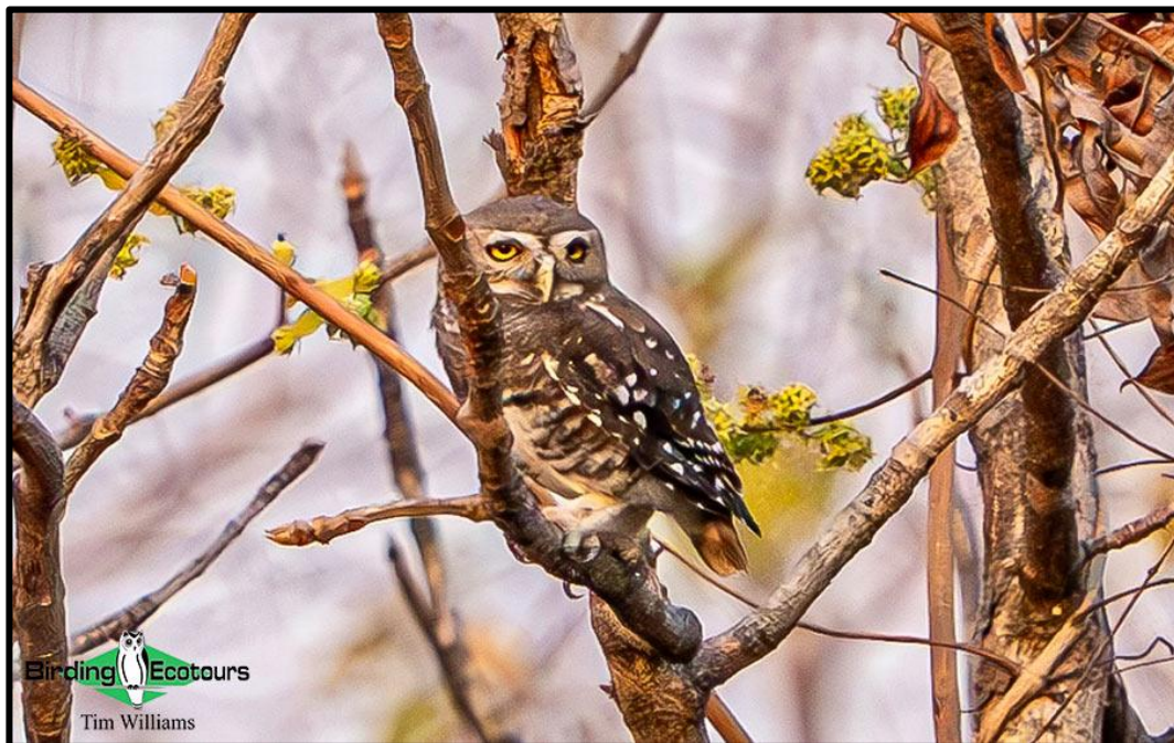
We enjoyed second views of Forest Owlet .

Today also proved a good day for reptiles. We saw a large Russell's Viper (highly venomous), a Common Bronzeback Tree Snake (non-venomous), and a Giri's Geckoella .