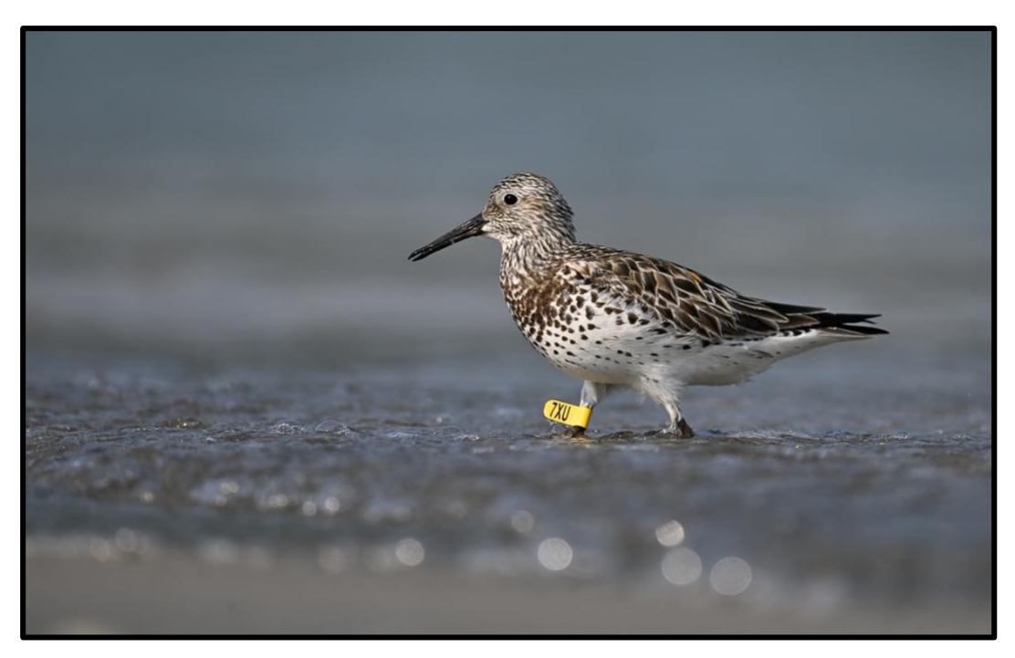
Great Knot 7XU on Man Thai Beach, Da Nang.

A brief stop along Man Thai Beach, Da Nang gave us close sightings of a breeding plumaged Greater Sand Plover and a small flock of Great Knots . Interestingly, one of the knots was sporting a leg-flag (7XU), from the shorebird banding scheme at <u>Eighty Mile Beach</u>, in Western Australia, where it was originally banded on the 16<sup>th</sup> February 2024. It had first been resighted in Da Nang on the 4<sup>th</sup> April 2025 (unbeknownst to us). This was the first resighting of the bird since it was originally banded, and it was present here until we lucked into seeing it today. Spoiler alert, this bird was still present to at least the 8<sup>th</sup> of April 2025 (resighting information per <u>Australasian</u> <u>Wader Studies Group</u>). This bird was on its return migration north to breeding grounds in Siberia.