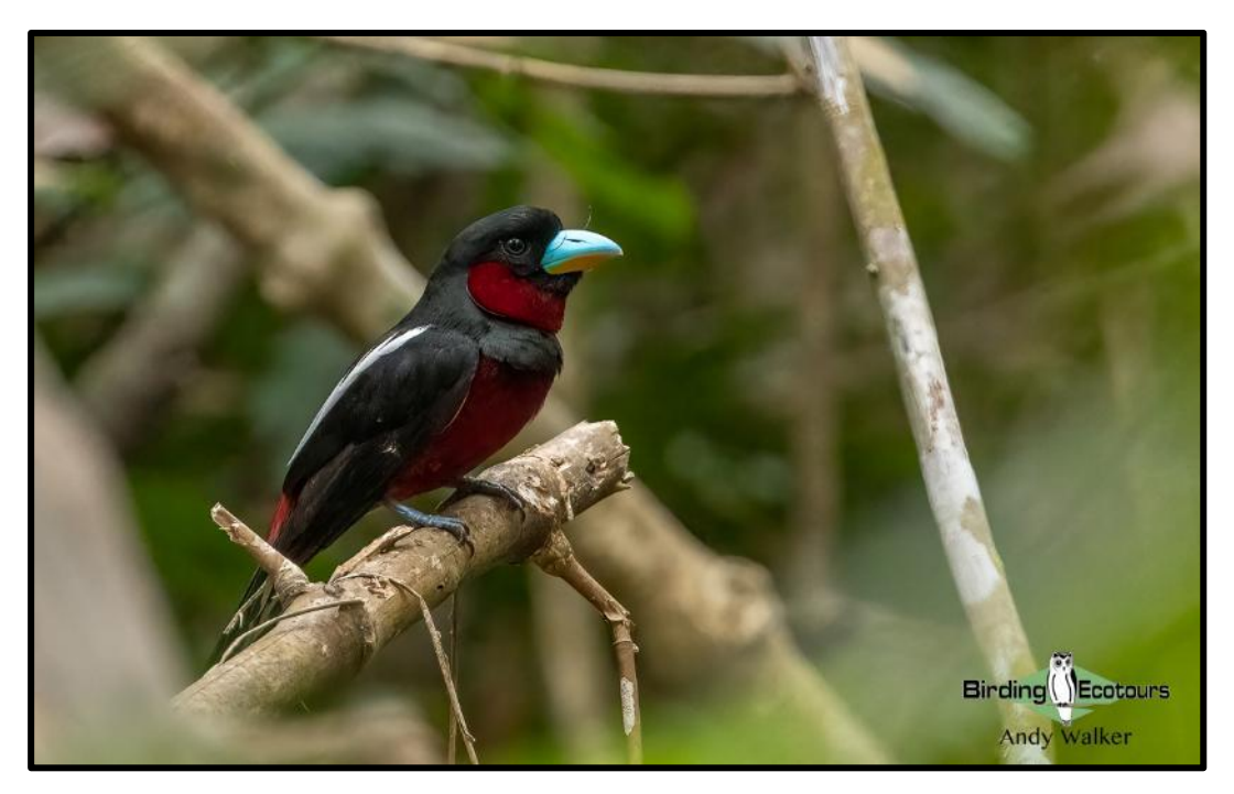
Eye-level views of Black-and-red Broadbill provided a highlight at Cat Tien National Park.

headed Bulbul , and many other species seen during our time in the blinds on previous sessions. The big highlight, however, was a family group of four Black-and-red Broadbills showing to a matter of feet at eye-level or below. On our drive back to our accommodation for dinner we spotted another Collared Falconet in some glorious late afternoon sunlight.