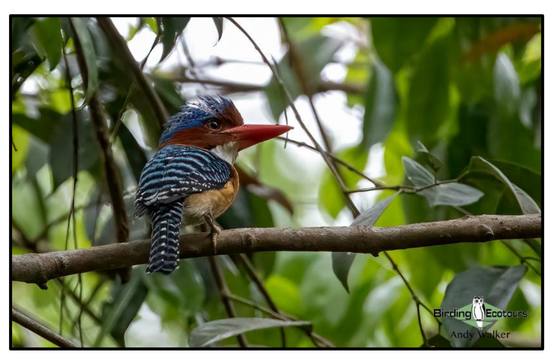
A pair of Banded Kingfisher gave prolonged views (this is the male).

We then went to a bird blind (bird hide) in Ma Da Forest, where we waited in anticipation to see what came into view. We didn't need to wait too long, with several great birds in very quickly. The highlights were a pair of Blue-rumped Pittas and a pair of Banded Kingfishers (the former present for around five minutes and the latter present for around two hours!).