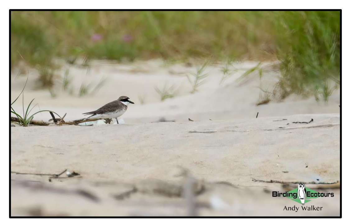
The Siberian Sand Plover discovered at Hoi An.

on and around the beach included Dusky Warblers , a flock of over 20 Red-whiskered Bulbuls , and several Paddyfield Pipits .