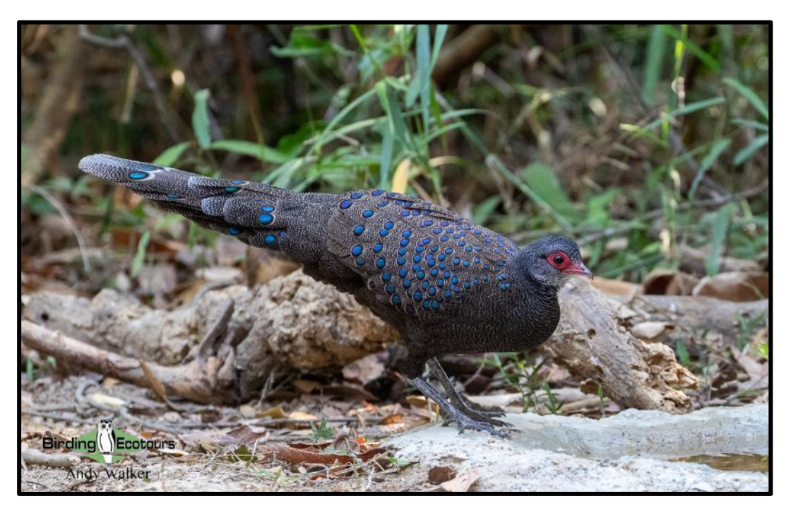
Germain's Peacock-Pheasant was a much hoped for target that indeed showed very well.

We recorded 320 bird species (11 heard only), including many endemic and near-endemic species, the trip list follows the report (you can also <u>click here</u> for the <u>eBird</u> trip report). Some non-passerine tour highlights seen included Germain's Peacock-Pheasant, Green Peafowl, Silver Pheasant, Lesser Adjutant, White-faced Plover, Oriental Plover, Great Eared Nightjar, Orange-breasted Green Pigeon, Banded Kingfisher, Blue-bearded Bee-eater, Orange-breasted Trogon, Pale-headed Woodpecker, Heart-spotted Woodpecker, Great Slaty Woodpecker, Indochinese Barbet, Necklaced Barbet, and Collared Falconet. We also apparently found Vietnam's first confirmed (documented) record of Siberian Sand Plover (see Day 15 account)!