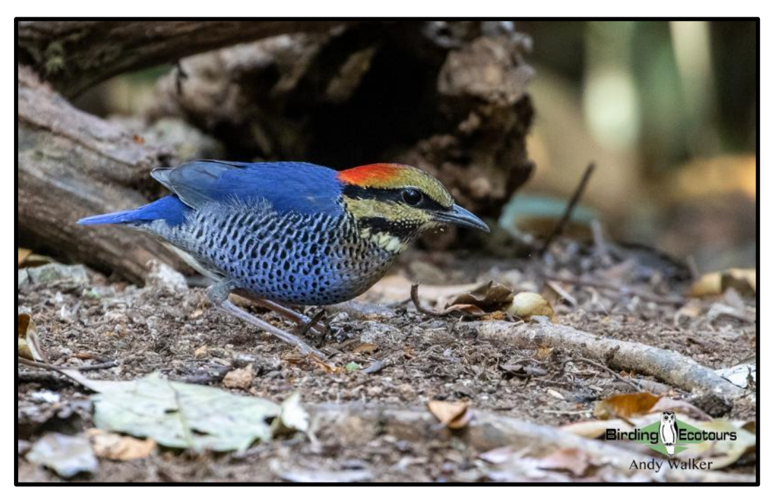
We had a pair of Blue Pittas visit a blind near Di Linh while birding the Deo Nui San Pass.

We awoke to a wet and wild morning in Di Linh and attempted some birding around our accommodation. Given the conditions it was tough going, but we saw a pair of Black-winged Kites (goodness knows what they were doing out in that weather!), five species of starling (White-shouldered Starling, Chestnut-tailed Starling, Black-collared Starling, Vinous-breasted Myna, and Common Myna), several bulbuls (including Yellow-vented Bulbul, Sooty-headed Bulbul, and Stripe-throated Bulbul), a pair of often showy Blue-and-white Flycatchers, a skulking Lanceolated Warbler, a pair of Chestnut-capped Babblers out in the open, a couple of Burmese Shrikes, along with singles of Eurasian Hoopoe, White-throated Kingfisher, Asian Green Bee-eater, Coppersmith Barbet, and overflying vocal Indian Cuckoo.