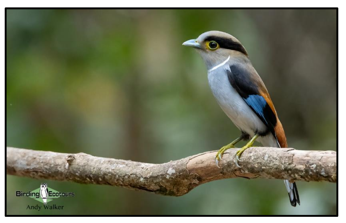
Silver-breasted Broadbills gave unparalleled and extremely close views during the tour.