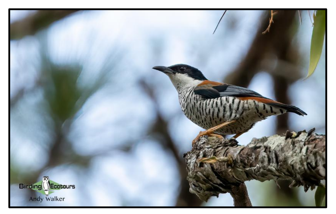
Vietnamese Cutia was a highlight and we enjoyed watching a family group of four birds.

headed Parrotbill, (Black-crested) Sultan Tit, Black-throated (Grey-crowned) Bushtit, Spotted Forktail, Dalat Bush Warbler, Annam Prinia, Mrs. Gould's (Annam) Sunbird, Black-throated (Langbian) Sunbird, Vietnamese Greenfinch, and Red (Dalat) Crossbill.