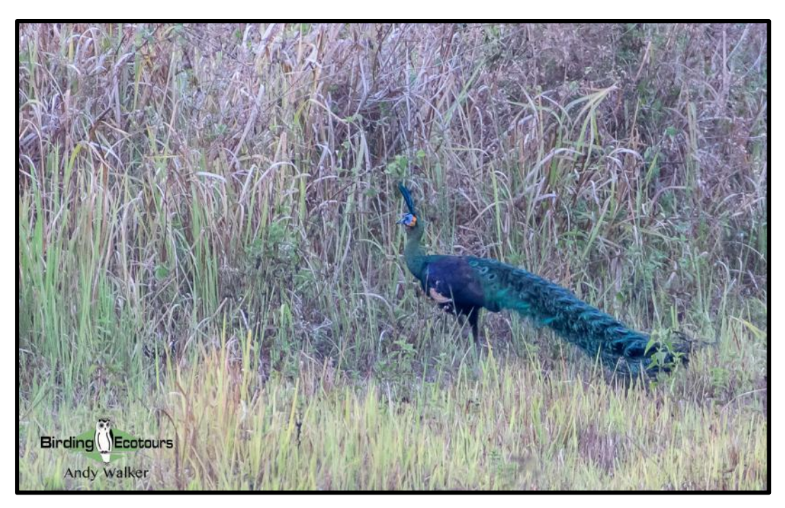
We saw a pair of Green Peafowls with three chicks on our afternoon drive.