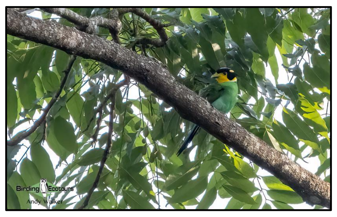
We had some nice views of a gorgeous pair of Long-tailed Broadbills tending to their nest.

We spent a couple of hours at a forest patch near Da Lat City, where we enjoyed some pre-breakfast birding and a few new species for our trip, this despite the disturbance from people with leafblowers, construction work, tourists, and feral cats! The highlights included wonderful views of nesting Long-tailed Broadbill, along with White-cheeked Laughingthrush (a pair feeding young), Lesser Necklaced Laughingthrush, (Yellow-billed) Blue Whistling Thrush, nest building Orange-headed (Orange-headed) Thrush, Indochinese Barbet, Grey-headed Canaryflycatcher, Kloss's Leaf Warbler, Blyth's Leaf Warbler, Yellow-browed Warbler, Blackthroated (Grey-crowned) Bushtit, Fire-breasted Flowerpecker, and Streaked Spiderhunter.