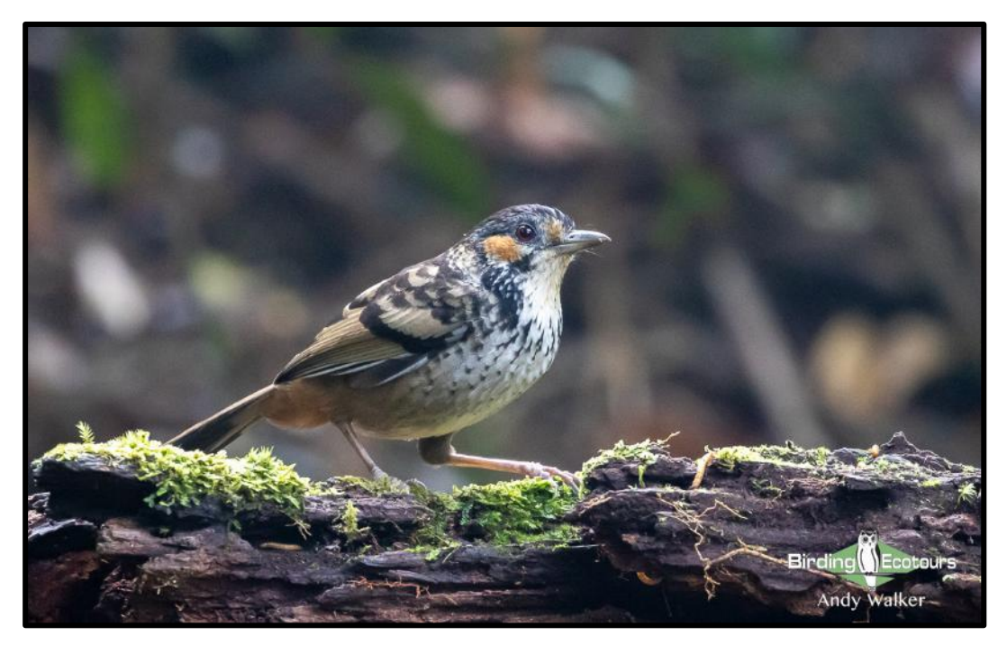
Well worth the wait! The stunning and incredibly tough to see, and unpredictable, Chestnut eared Laughingthrush was a clear highlight of our day birding at Mang Den.

As we drove back to our hotel we made a brief stop at some rice paddies which proved quite a bonus, giving us sightings of Cinnamon Bittern, Oriental Turtle Dove, Common Kingfisher, White-throated Needletail (a big flock), Pacific Swift, Eastern Jungle Crow, and Long-tailed Shrike.