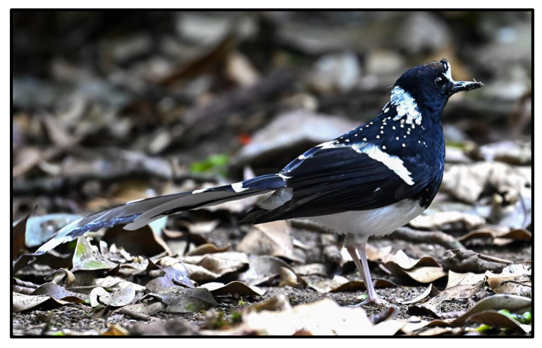
A stunning Spotted Forktail showed well.

Our first blind started in sensational style before we'd even got settled, with a stunning Spotted Forktail parading around out in the open right in front of us while we watched in awe, at the same time as a pair of Short-tailed Scimitar Babblers (Indochinese Wren-Babblers) were also out in the open feeding, what a start! Later during our watch session, a second forktail even came in and joined the first bird, which was a real treat. Forktails are well renowned for being shy, so being a few feet from them was so exhilarating. As we focused on the feeders, we enjoyed close views of many other species, which included White-browed Scimitar Babbler , Grey-throated Babbler , Mountain Fulvetta , Black-headed (White-spectacled) Sibia , Little Pied Flycatcher , Snowy browed Flycatcher , Large Niltava , Verditer Flycatcher , Grey-bellied Tesia , Lesser (Langbian) Shortwing , and White-tailed Robin .