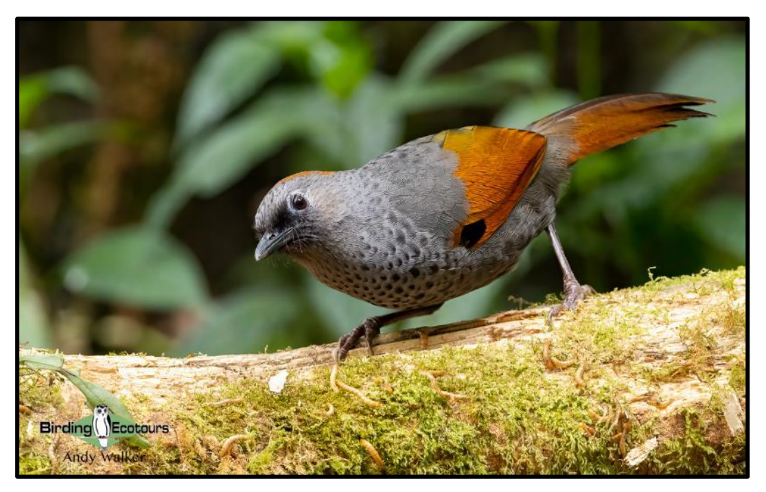
The top target for the day was the near-endemic Golden-winged Laughingthrush. Ngoc Linh Nature Reserve offers the only realistic chance of seeing this bird anywhere in the world.

Sunbird. Both Crested Serpent Eagle and Crested Goshawk were seen overhead, the latter rather than the former with a snake!