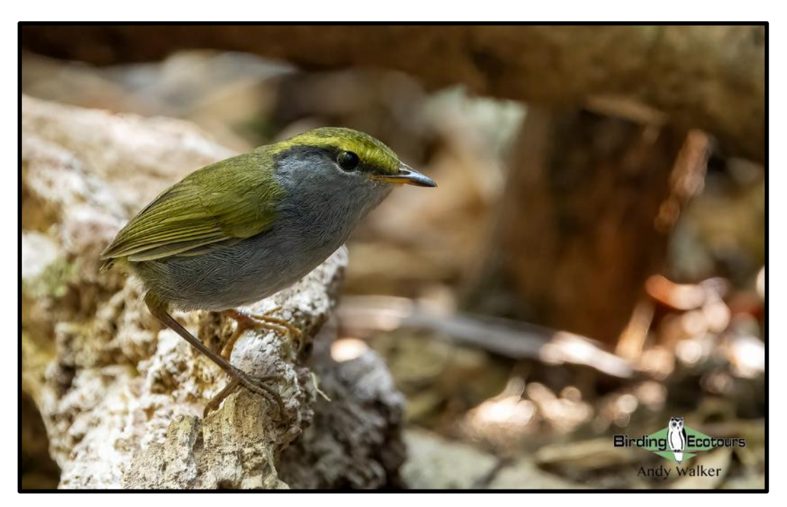
The tiny Grey-bellied Tesia was bouncing around like a ping-pong ball!

In the late morning we visited a different area near the city to target the localized endemic, Dalat Bush Warbler , which we found, though they remained typically tough to see, giving only brief views. A flurry of activity gave us close up sightings of Speckled Piculet , Green-backed (Langbian) Tit , Eurasian (White-faced) Jay , Hill Prinia , Black Bulbul , Black-throated (Greycrowned) Bushtit , Kloss's Leaf Warbler , Black-headed Parrotbill , Swinhoe's White-eye , Rufous-capped Babbler , and Chestnut-vented Nuthatch . A huge Black Eagle also flew low overhead. It was a great end to our morning's birding, with a flurry of new birds and good sightings.