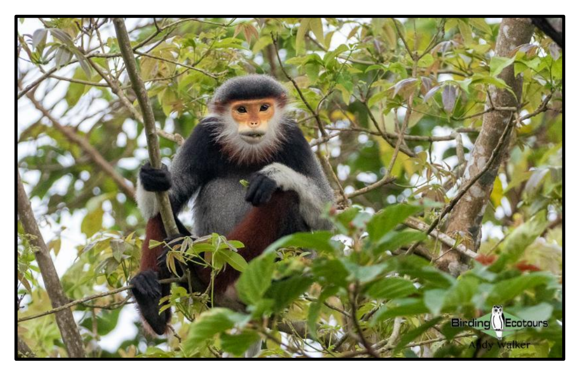
The rare Red-shanked Douc Langur was a highlight of our time on the Son Tra Peninsula.

After the shorebird excitement, we went straight out to the <u>Son Tra Nature Reserve</u> on the edge of the city. Here we searched for and found our main target – Red-shanked Douc Langur . We saw a family group of langurs feeding, which allowed great and lengthy views and excellent photo opportunities. We also saw several Rhesus Macaques that showed very well too, though they were not quite as spectacular!