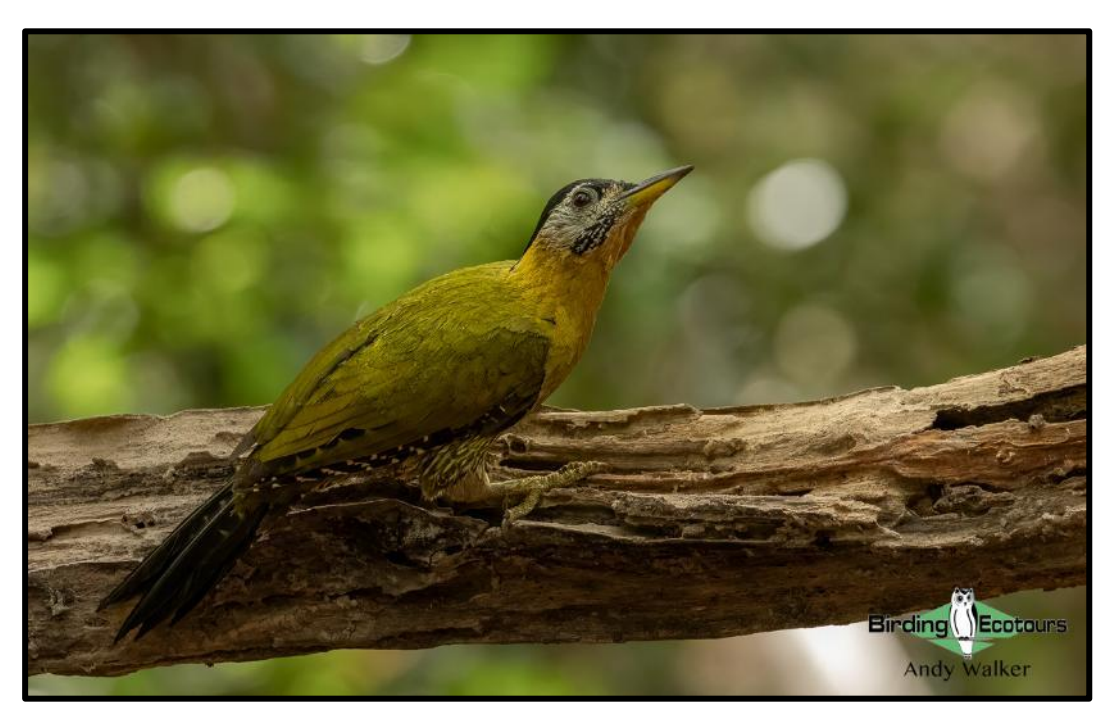
Laced Woodpeckers were fond of the free food provided at the blinds!

After enjoying our peacock-pheasant sighting, we also noted Common Emerald Dove , Pale legged Leaf Warbler , and Indochinese Blue Flycatcher coming to the food. A pair of Green legged (Scaly-breasted) Partridges walked into view briefly before melting away into the undergrowth. Numerous species were heard from the blind, but were not able to be seen as we focused our attention on the birds in front of us. Some of the heard only species that we'd have to look for later included Black-and-red Broadbill , Banded Broadbill , Blue-bearded Bee-eater , Violet Cuckoo , Grey-faced Tit-Babbler , Pin-striped Tit-Babbler , and Crested Serpent Eagle . While driving back to our accommodation for lunch and a siesta during the heat of the day we picked up a Collared Falconet busily eating a large-winged insect (a dragonfly or cicada).