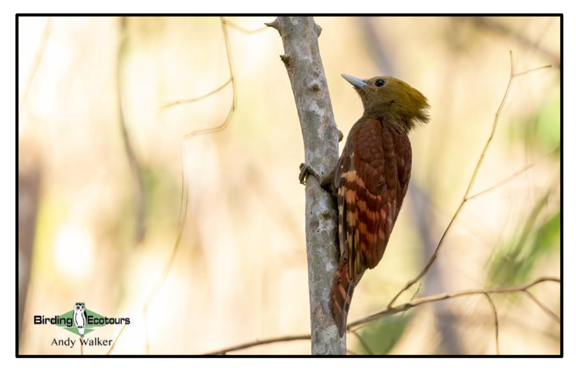
The tough Pale-headed Woodpecker was one of eight woodpecker species seen on our morning walk in Cat Tien National Park.

in addition to the two aforementioned species, we also found several other great species, these being Pale-headed Woodpecker, Heart-spotted Woodpecker, Grey-headed (Black-naped) Woodpecker, Laced Woodpecker, Greater Flameback, and Common Flameback.