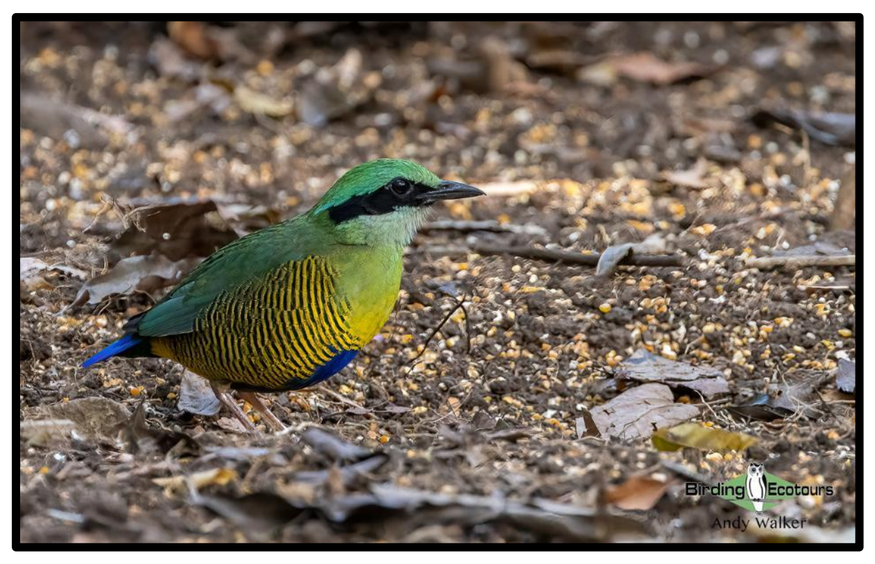
Bar-bellied Pitta gave excellent views while we were birding in Vietnam.