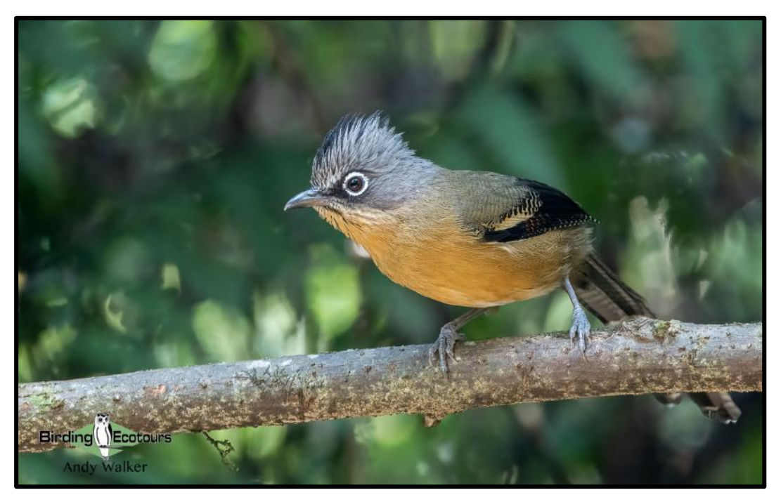
The charismatic Black-crowned Barwing was one of the most popular birds of the day.