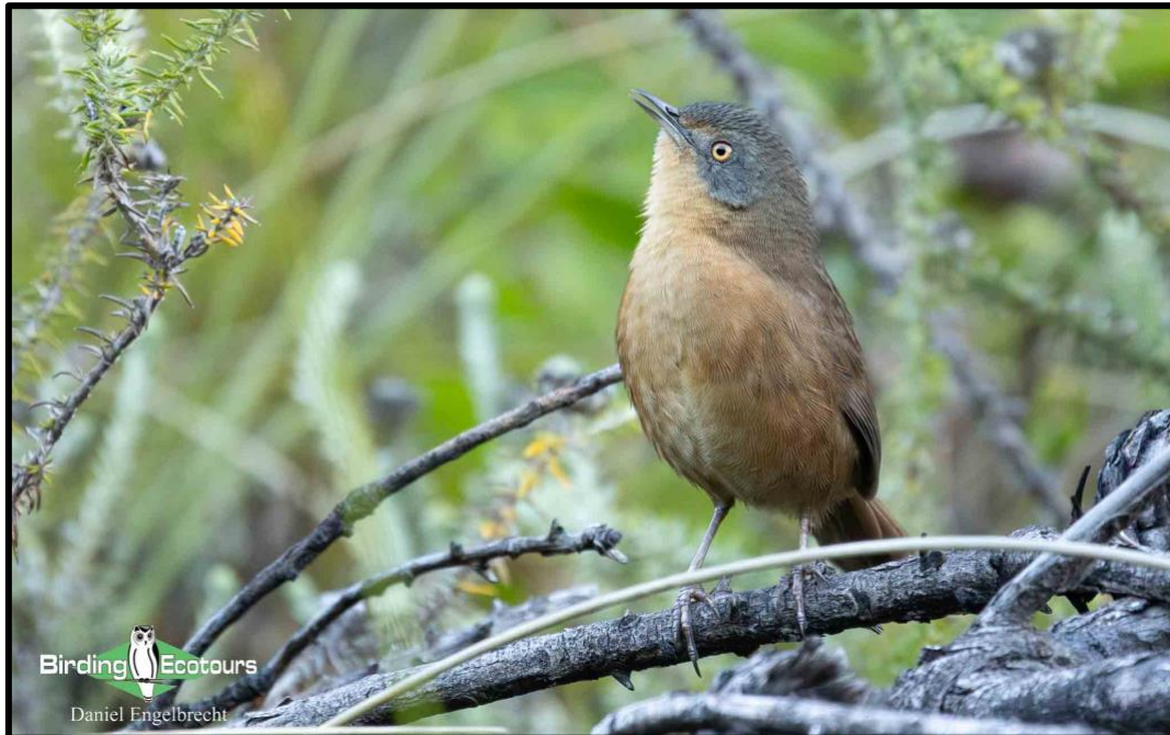
Victorin's Warbler is a super-skulker that requires patience to see well.

Dusky and Blue-mantled Crested Flycatchers , Brimstone Canary , Black Saw-wing , and Victorin's Warbler , in addition to many other species characteristic of the southwestern Cape. We will pop in at Stony Point Nature Reserve, famous for its African Penguin colony. These Critically Endangered birds (BirdLife International) have experienced a 97% decline in population size; however, recent conservation efforts are a hopeful step in the right direction for this iconic species. The reserve also has large numbers of breeding cormorants, and we should see Great, Crowned, Cape , and Endangered (BirdLife International) Bank Cormorants with their bizarre bi-colored eyes.