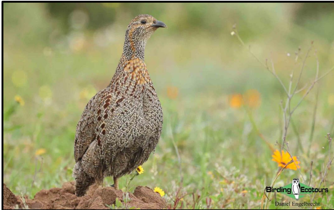
The intricately patterned Grey-winged Francolin is one of our targets on the West Coast.

Today, we will make our way north of Cape Town, along the West Coast. The habitat here superficially resembles the scrubby fynbos vegetation from yesterday; however, the strandveld (translated as “beach scrub”) is botanically very distinct and grows on white-dune sands. The avifaunal complex is different too, and at our first stop, we hope to connect with Grey-winged Francolin , Cape Clapper Lark , Karoo Scrub Robin , Chestnut-vented and Layard’s Warblers , Bokmakierie , Grey Tit , White-backed Mousebird , Long-billed Crombec , Cape Penduline Tit , White-throated Canary , and more.