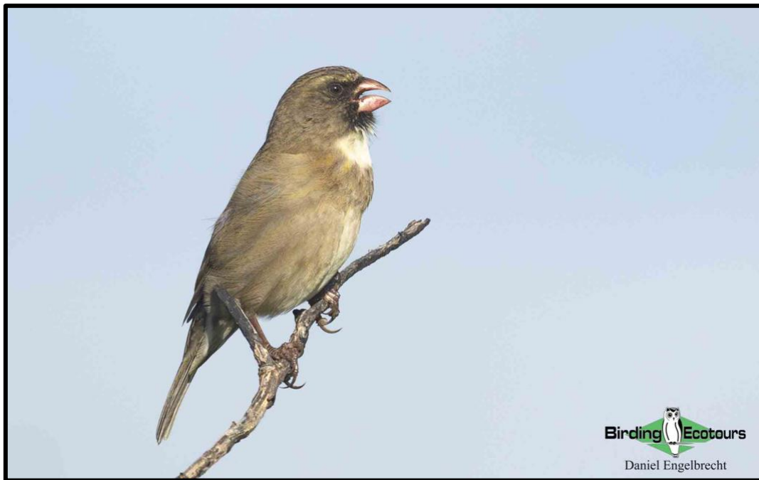
Protea Canary is one of the trickier fynbos endemics.

After our time in Paarl, we will make our way in the direction of Cape Town, stopping at the spectacular Kirstenbosch Botanical Gardens on the slopes of Table Mountain. We will spend some time strolling around these wonderful gardens, where we will try to see Forest Canary , Olive Woodpecker , Lemon Dove , Sweet Waxbill , Southern Boubou , and several of the species mentioned earlier in the itinerary.