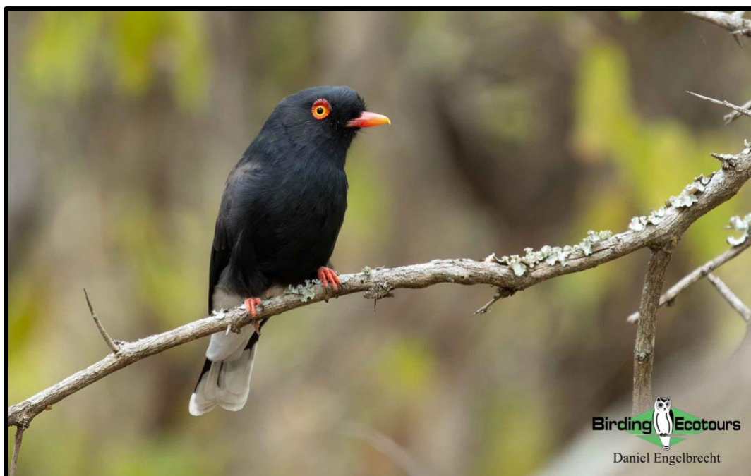
The characterful Retz's Helmetshrike can be seen during our time in the Lowveld.