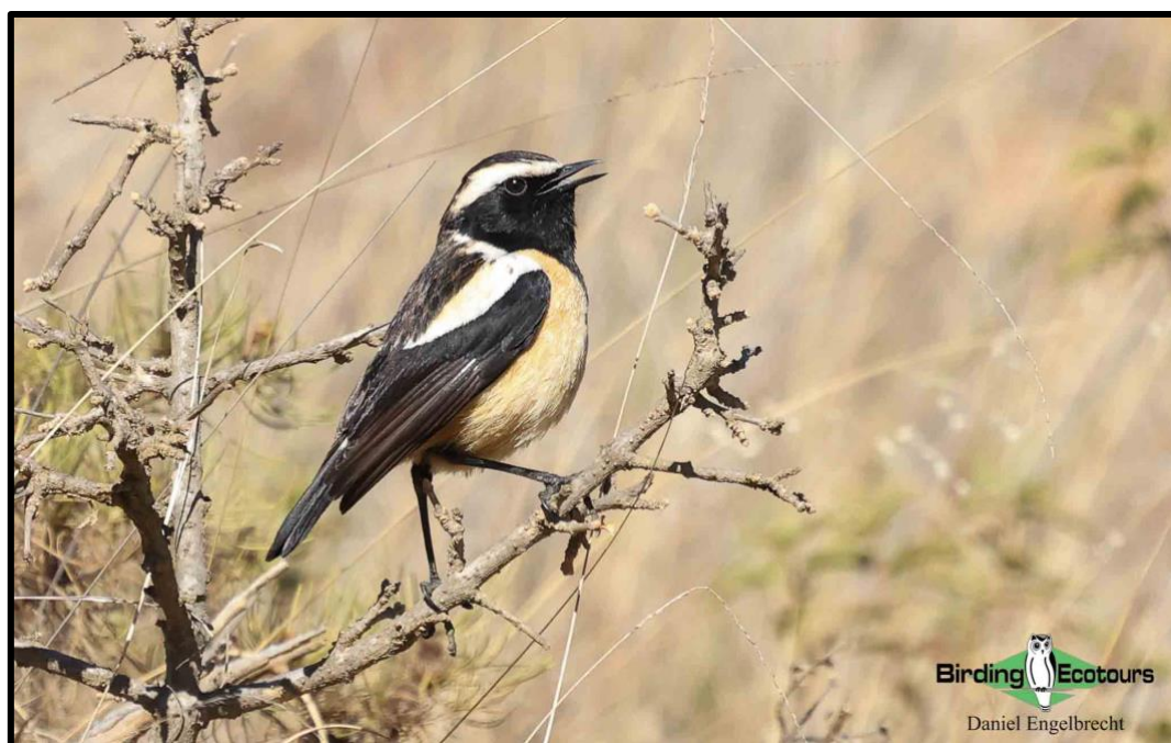
The characterful Buff-streaked Chat is an attractive endemic of South Africa's highlands.

Once we reach the higher reaches of the Wolkberg Mountains, we will bird the montane grasslands and Protea stands for species like the endemic Gurney's Sugarbird (Cape Sugarbird, the only other member of this southern African endemic family, can be seen on our Budget South Africa Birding Tour: Cape Town's Fynbos Endemics ), Malachite and Greater Double-collared Sunbirds , Wailing Cisticola , the endemic Buff-streaked Chat , Cape Bunting , and Nicholson's Pipit . We will also keep an eye skywards for Verreaux's Eagle , which breeds on the cliffs in the area.