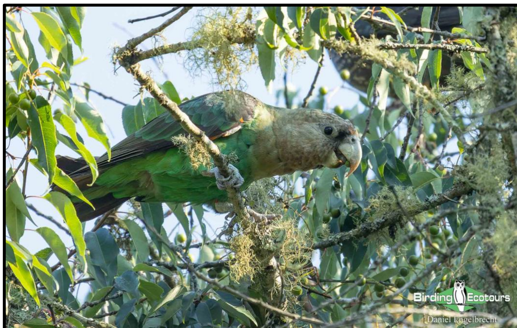
The endemic Cape Parrot occurs in the forests of Magoebaskloof.