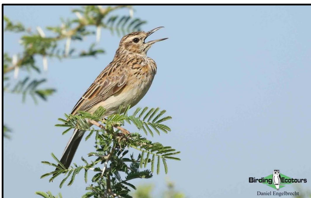
The range-restricted Short-clawed Lark is one of our primary targets at Chebeng.

We will have an early start this morning and make our way west of Polokwane to the Chebeng Grasslands. These seemingly overgrazed grasslands between the villages are home to several localized and scarce species. Our main target is Short-clawed Lark , and we should connect with this species after listening out for its distinctive whistling call. Remarkably, no fewer than ten lark species have been recorded from this area, and we will likely see a number of species, including Spike-heeled (an isolated population occurs here), Pink-billed , Sabota , Rufous-naped , Red-capped , and Grey-backed Sparrow-Larks . Melodious Lark is rare here, but we do occasionally connect with this special species. Other birds to look out for in these short grasslands include White-bellied Bustard , Northern Black Korhaan , Greater Kestrel , Temminck's Courser , Capped Wheatear , Ant-eating Chat , Cloud Cisticola , Cape Longclaw , and the stunning Long-tailed Widowbird .