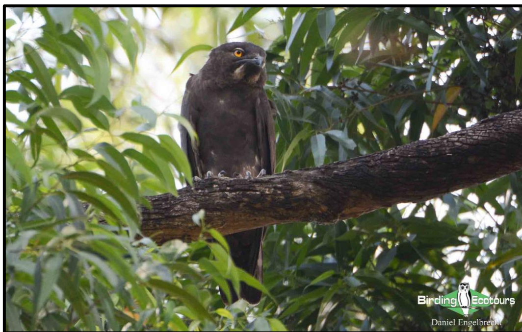
We will look for the scarce Bat Hawk around Tzaneen.