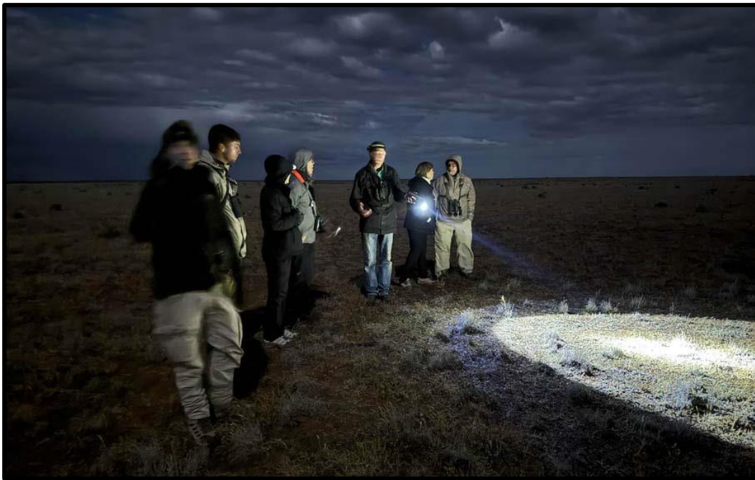
A great in-situ photo taken late at night, whilst we're out and about on the plains looking at our hoped-for Plains-wanderer (in the torch beam).

When we finished dinner, and with it now properly dark, we loaded up into the vehicles and headed out. As if by some good fortune, the storm system passed and, before we knew it, we were looking up at a starry night sky. The recent rain meant the gravel tracks were extremely slippery and treacherous to drive, and it was almost better off the road. Stops were made when we found Banded Lapwing and several Brown Songlarks , then we pulled up at the designated paddock where we would be on foot looking for the Plains-wanderer . We had just gotten going when we found our first male Plains-wanderer . Fantastic! These birds sit tight up against a grass tuft, usually showing well. We then spent quite a while walking around looking for a female wanderer (larger and more brightly colored than the males). We split up into different groups to cover more ground and enjoyed another male Plains-wanderer – this bird looking like it was on a nest!