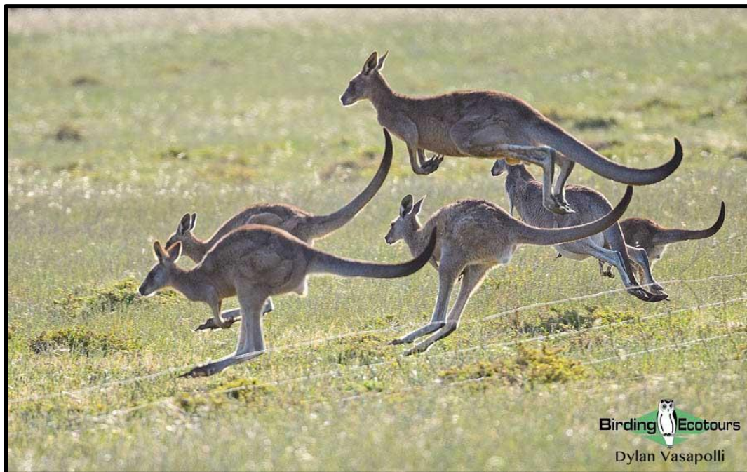
A mob of Eastern Grey Kangaroos sprang over the fields (and fences) with ease. This iconic Australian mammal (and family) is one of many reasons that make this country so exciting!

A detailed daily account can be read below, and the various species lists are located at the end of the report.