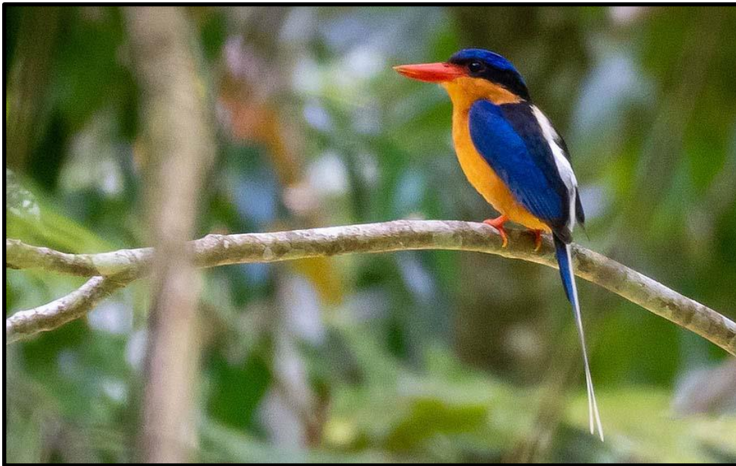
A glorious Buff-breasted Paradise Kingfisher . We had an incredible run with many seen throughout the day – we started calling them “chooks”.

Who could believe it – our last full birding day was here, and it was another busy (and excellent) day. We started off early on with a visit to the vast Lake Mitchell. The water level was quite low, which meant the birds were distant. Vast numbers of waterbirds were again present here, and amongst all the many more regular species were our first Radjah Shelduck , and large numbers of Green Pygmy Goose . A pair of stately Black-necked Storks were hard to miss as they towered above everything else, whilst Brolgas strolled through the surrounds, and masses of Comb-crested Jacanas roamed about the edges. We then visited a nearby woodland site where some blossoming Eucalyptus were pulling in numbers of birds. We spent a while watching the comings and goings, with seven honeyeater species seen. We finally got our wanted Banded Honeyeater here, and improved on our views of Brown-backed Honeyeater . We also lucked into a fine group of beautiful Black-throated Finches feeding in the area.