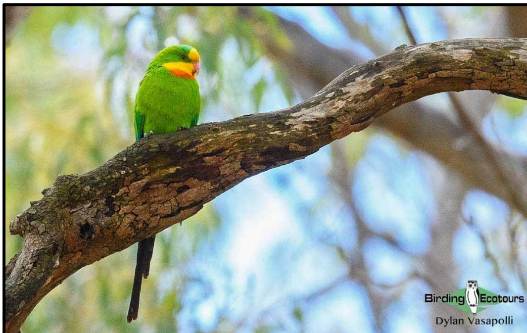
A fine parrot day started off with this localized Superb Parrot in Deniliquin.

We had a leisurely (and late) start to the day, considering the hour we got back, and kicked off our birding with a walk through the excellent Island Sanctuary in town. The woods here are always alive with parrots and cockatoos and today was no different. We had to wade through numbers of very showy Eastern Rosellas , Rainbow Lorikeets , Red-rumped Parrots , Galahs , yellow Crimson Rosellas and Long-billed Corellas to eventually find our main target, Superb Parrot . Many other confiding birds, like Brown Treecreeper , Superb Fairywren , Noisy Miner , White-browed Scrubwren , Dusky Woodswallow and our first Noisy Friarbirds , all showed well. We visited a nearby site to look for a nesting Square-tailed Kite – and had to dodge a rain shower that passed through. It took a little while to track down the nest, eventually we found it, and one of the adults on the nest, but the view did leave us wanting more. A bird party here gave us a pair of Western Geryones and Buff-rumped Thornbills , while several Red-browed Finches showed well, feeding on the grasses.