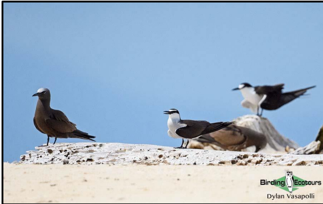
Michaelmas Cay, on the Great Barrier Reef, is home to many nesting Sooty Terns (back right) and Common Noddies (left front). One of the scarcer specials is Bridled Tern (center).

Once back on land, we had a relaxed afternoon, and had a final group dinner, reminiscing about the exciting trip and all the many excellent birds (and mammals) we had come across during the last few weeks.