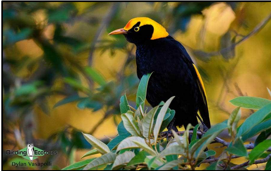
This colorful male Regent Bowerbird is one of O'Reilly's famous residents.

party when both Crimson Rosellas and Australian King Parrots flew in and landed on our heads! As we were marveling at these birds, several male, ridiculously bright, Regent Bowerbirds stole our attention and, try as we might, we couldn't quite ignore a Wonga Pigeon that came walking through. We enjoyed dinner and settled down for the evening, excited for the days that lay ahead as we birded through Queensland.