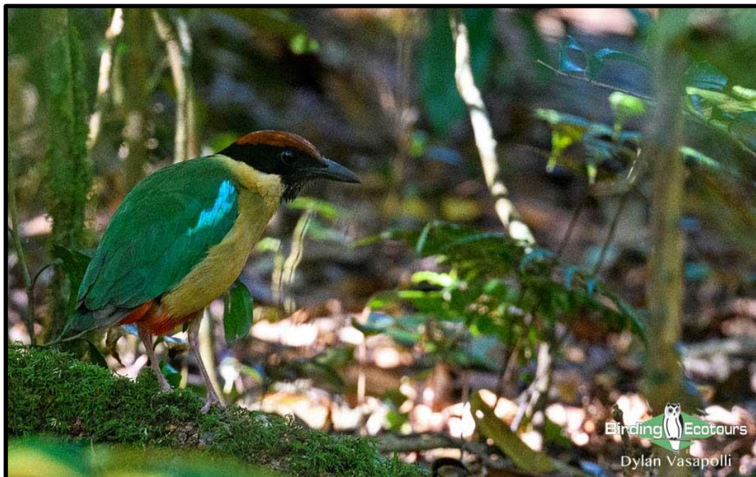
This Noisy Pitta was a big target of ours at O'Reilly's. We successfully managed to find several birds and enjoyed good views on a few occasions.

Before we knew it, it was time for lunch, which was interrupted by several flyby groups of Topknot Pigeons and a fine Grey Goshawk . Following a short rest over the midday period we resumed in the mid-afternoon for another bash at the trails, hoping for our one big missing target – Albert's Lyrebird. We got off to a good start, improving our views of Noisy Pittas as we enjoyed some close views as a pair of these spectacular birds bounded around. We also enjoyed a few Russet-tailed Thrushes foraging around, then picked up on the tell-tale call of lyrebird. Notably, the male that resides close to the lodge is known for imitating a dog bark, and we all grinned when the bird began 'barking'. It was a way off, down the slope, and so the waiting game began. Fortunately, we didn't wait for too long before the bird moved up towards us and, soon enough, an Albert's Lyrebird walked into view, followed by a second bird, a female. We stayed still and watched as these birds walked by and settled into foraging, using their massive legs and feet to scratch around in the leaf litter. We were blown away as the birds basically walked between us. Content, we called it a day and rested briefly before dinner. Sadly, our evening owling (and 'mammaling') plans after dinner had to be abandoned as rain settled in for the evening.