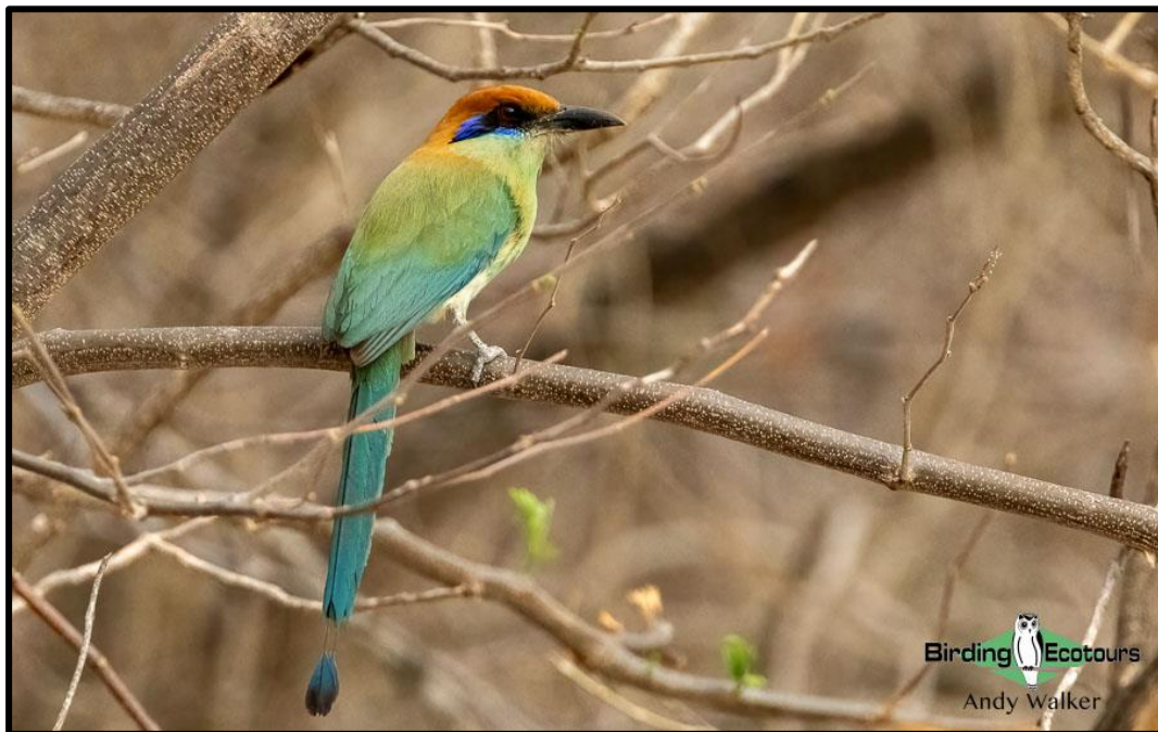
Russet-crowned Motmot is one of several motmot species possible on the tour.

Overnight: Hotel Casa Del Agua , or similar, Tuxtla Gutiérrez