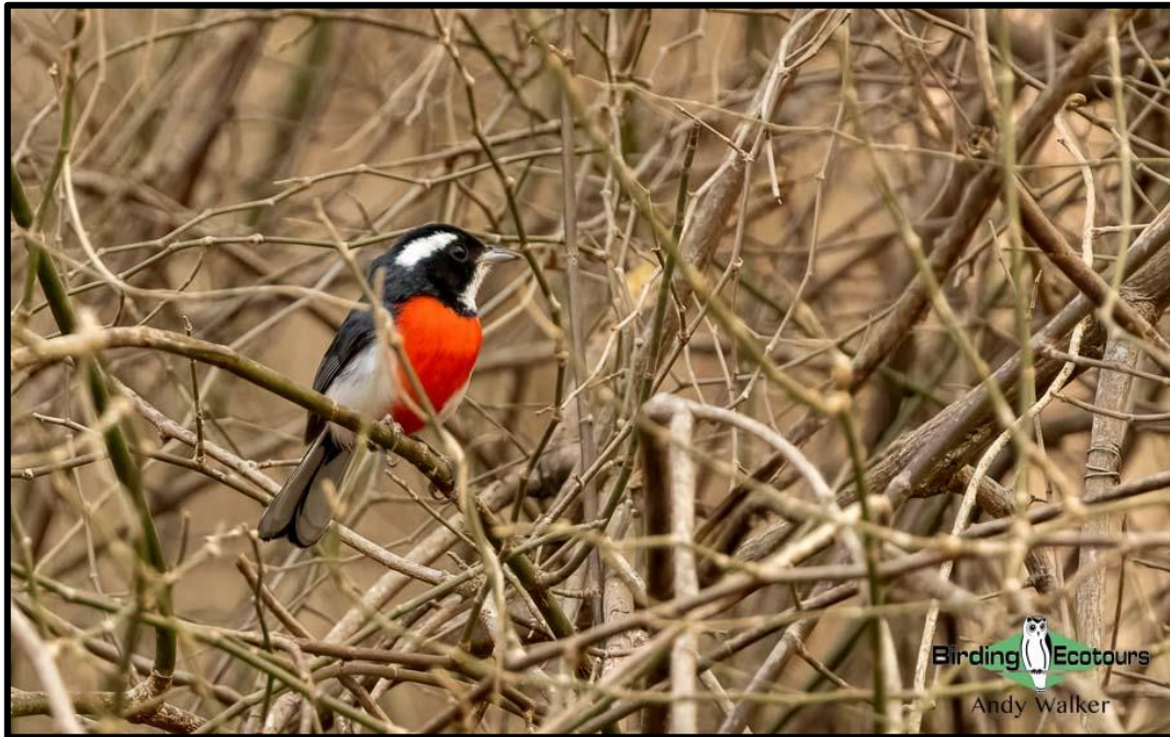
Red-breasted Chat is a secretive yet stunning Mexican endemic.

Orange-breasted Bunting. We will also focus on localized endemics such as Turquoise-crowned Hummingbird and Russet-naped Wren , along with more widespread Mexican endemics, including West Mexican Chachalaca , Citreoline Trogon , Golden-cheeked Woodpecker , Flammulated Flycatcher , Golden Vireo , Happy Wren , Rufous-backed Thrush , and Cinnamon-rumped Seedeater .