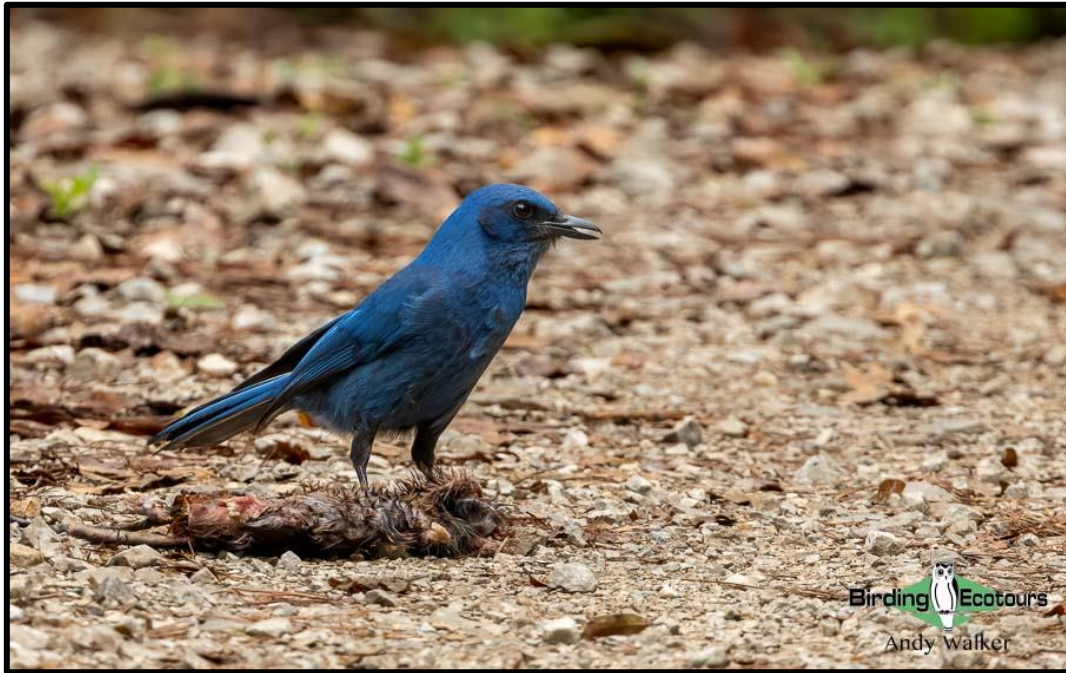
Spectacular jays will feature heavily on the tour, such as this Unicolored Jay .

Overnight: Hotel Parador Margarita , or similar, San Cristóbal de las Casas