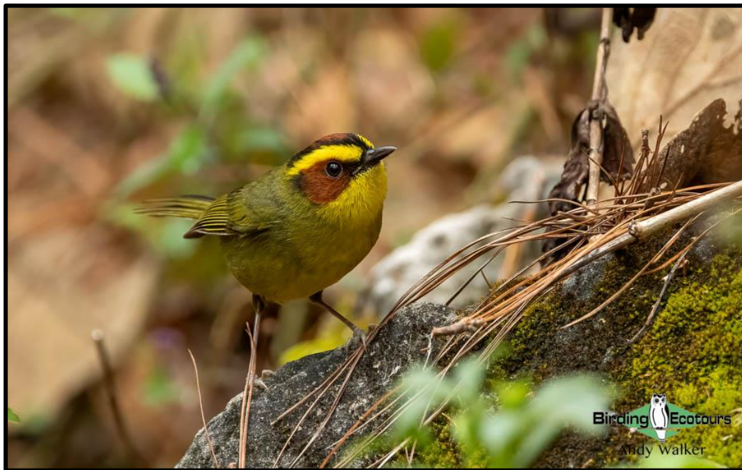
Many birds we look for are colorful and interesting, such as the Golden-browed Warbler .

Overnight: Cabañas Puesta del Sol , or similar, San José del Pacífico