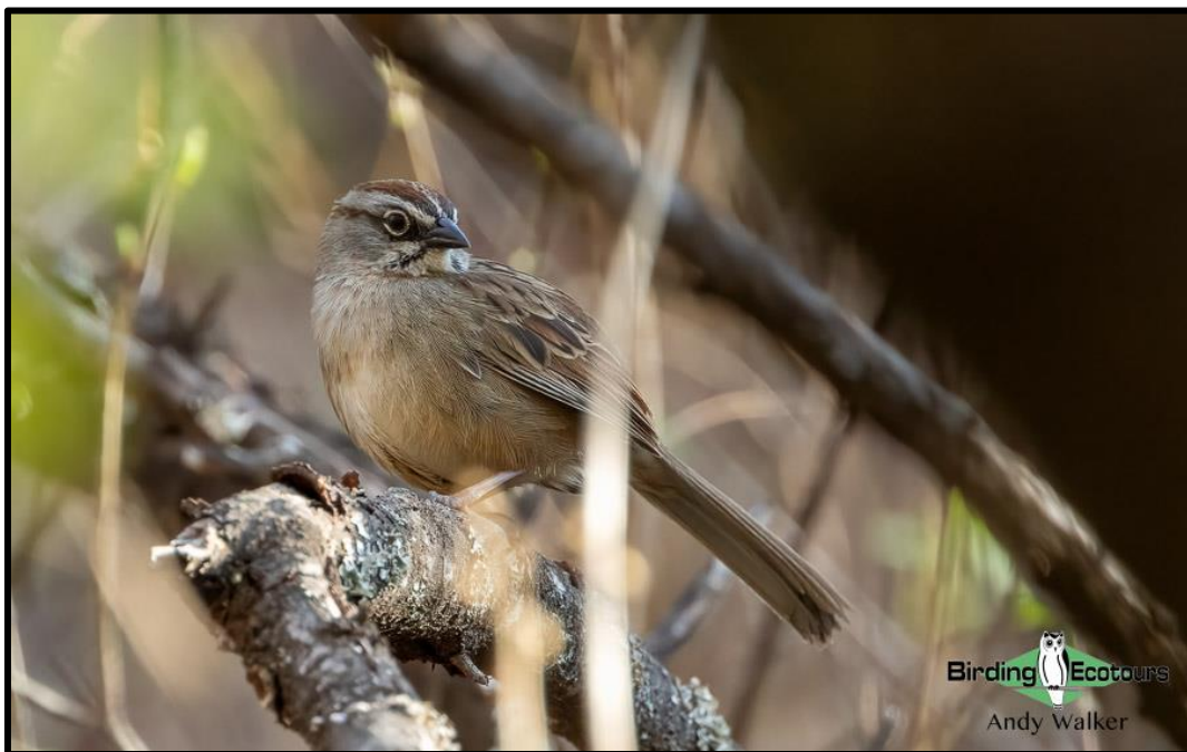
We will search for the endemic but shy Oaxaca Sparrow near Oaxaca city.

Our main targets include southern Mexican endemics such as Dusky Hummingbird , the aptly named Beautiful Sheartail , Grey-breasted Woodpecker , Pileated Flycatcher , Boucard's Wren , the gorgeous Ocellated Thrasher , and Mexican endemics including the stunning Grey Silky-flycatcher , Rufous-backed Thrush , and Cinnamon-rumped Seed eater . We will also hope to find Bridled Titmouse and the iconic Red-faced Warbler in the higher-elevation oak scrub. This area supports a high diversity of sparrows, with Lark Sparrow , Chipping Sparrow , Clay-colored Sparrow , Vesper Sparrow , Savannah Sparrow , Botteri's Sparrow , and Lincoln's Sparrow all possible, along with three important endemics, Bridled Sparrow , Oaxaca Sparrow , and White-throated Towhee , each largely restricted to Oaxaca state.