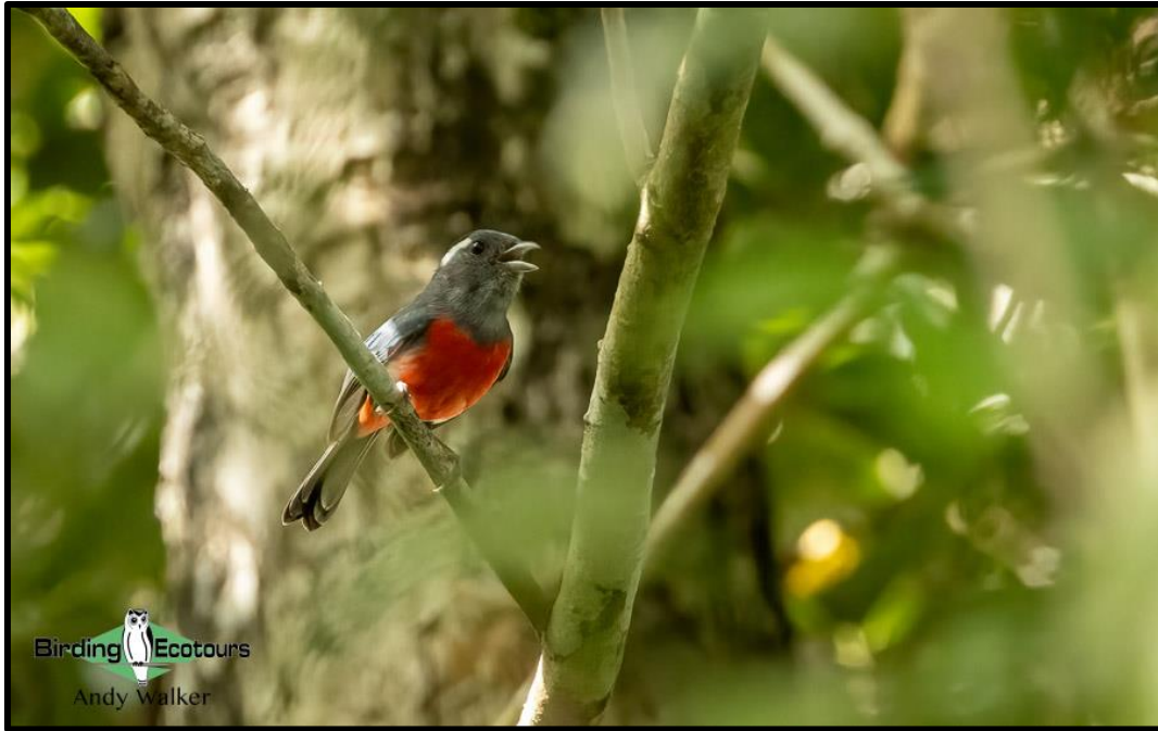
The characterful and localized Grey-throated Chat is a top tour target.

Yucatan Wren , brilliant Orange Oriole , and at night, the elusive Yucatan Nightjar . In the surrounding arid woodland and scrub, we target the striking Lesser Roadrunner , coveys of Yucatan Bobwhite , the brilliant Mexican Sheartail , and with luck, the elusive Yucatan Gnatcatcher .