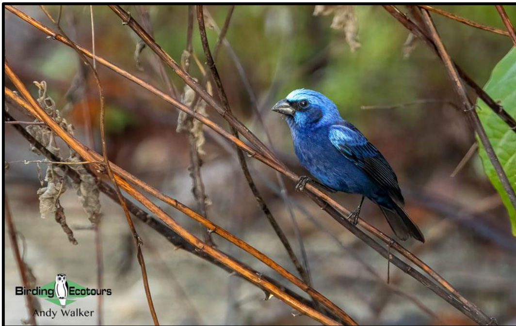
Blue Buntings will dazzle us as they forage in roadside vegetation!

The Yucatán Peninsula offers a wonderful introduction to birding in Mexico, with a high diversity of species, including many endemics, all found within a compact and easily traveled region, rich in culture and natural beauty. Beginning in Puerto Morelos, we travel northwest to Rio Lagartos , where tropical beaches give way to vast mangroves, coastal wetlands, and open forest. From there, we loop south through areas of arid scrub and dry woodland, then continue into lush jungle surrounding ancient Mayan ruins , and finish on the idyllic island of Cozumel , renowned for its white sand beaches and colorful coral reefs just offshore. Along this route we will target many species endemic to the Yucatán Peninsula, as well as a trio of Cozumel Island endemics, together with beautiful Central American specials and wintering migrants from North America. Many of these birds are brightly colored , striking , or impressive , and several have tiny global ranges . From mangrove boat trips and ancient ruins to tropical forest and Caribbean island birding, this tour showcases the best of the Yucatán. Well-developed and welcoming to travelers, the Yucatán Peninsula combines outstanding food, interesting culture, comfortable accommodations, and amazing wildlife encounters with a sense of fun and discovery, making this a beautiful, exciting, and rewarding Mexican birding adventure.