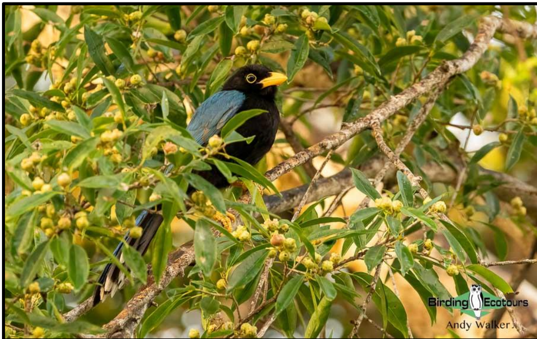
Vibrant Yucatan Jays are a fantastic endemic of the Yucatán Peninsula.

Overnight: Corales Suites , or similar, Puerto Morelos