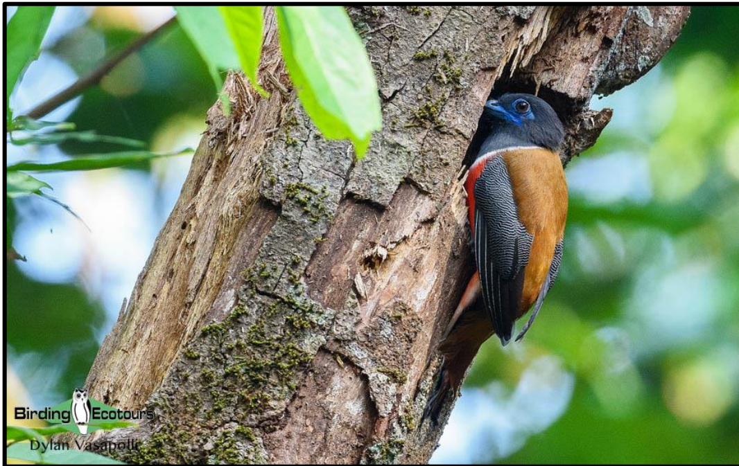
The male Malabar Trogon about to take a turn excavating the nest hole – the female having just completed her turn.

With our morning spent, we retired back to our lodge for a lunch break in the midday period. For our afternoon, we ventured to another site where we tried for some thicket species, like the tricky