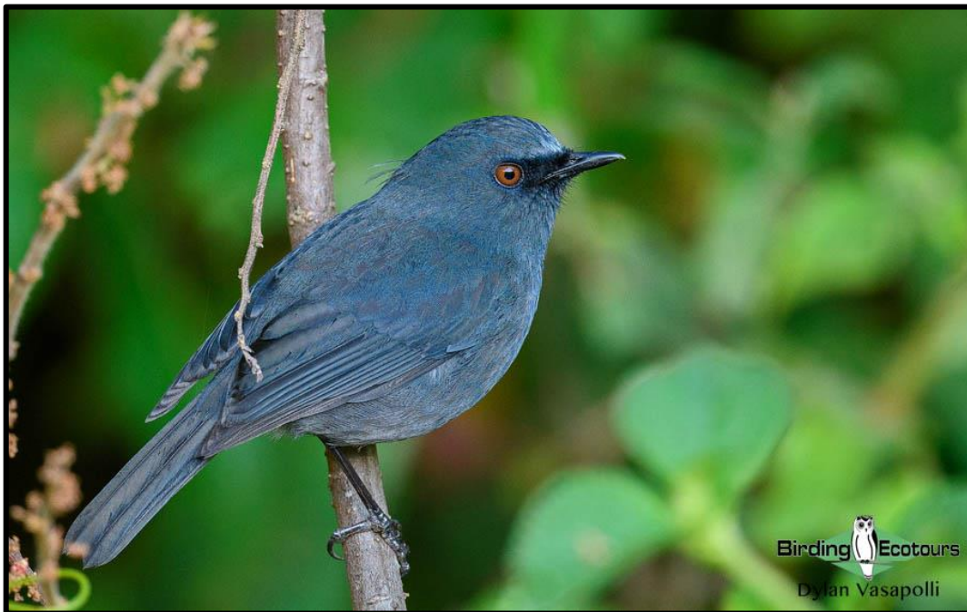
White-bellied Blue Robin (like the cover image species, Nilgiri Blue Robin) is another highly range-restricted species essentially confined to the wider Munnar area.

We had an early start once more as we tried for some of our missing species. Nilgiri Thrush played hard ball and went unseen, despite a few attempts at tracking it down. On the plus side, we found an extremely cooperative White-bellied Blue Robin (Sholakili), which gave us outstanding views. We also enjoyed more good birds like Palani Laughingthrush , Black-and-orange Flycatcher , Indian Black-lored Tit and Velvet-fronted Nuthatch , amongst other more common species. We then devoted our attention to finding Painted Bush Quail and sadly came up empty-handed once more. With the sun beating down, and bird activity having all but dried up, we called it for the morning and returned for a break. We opted for an afternoon break, allowing the group a bit of rest.