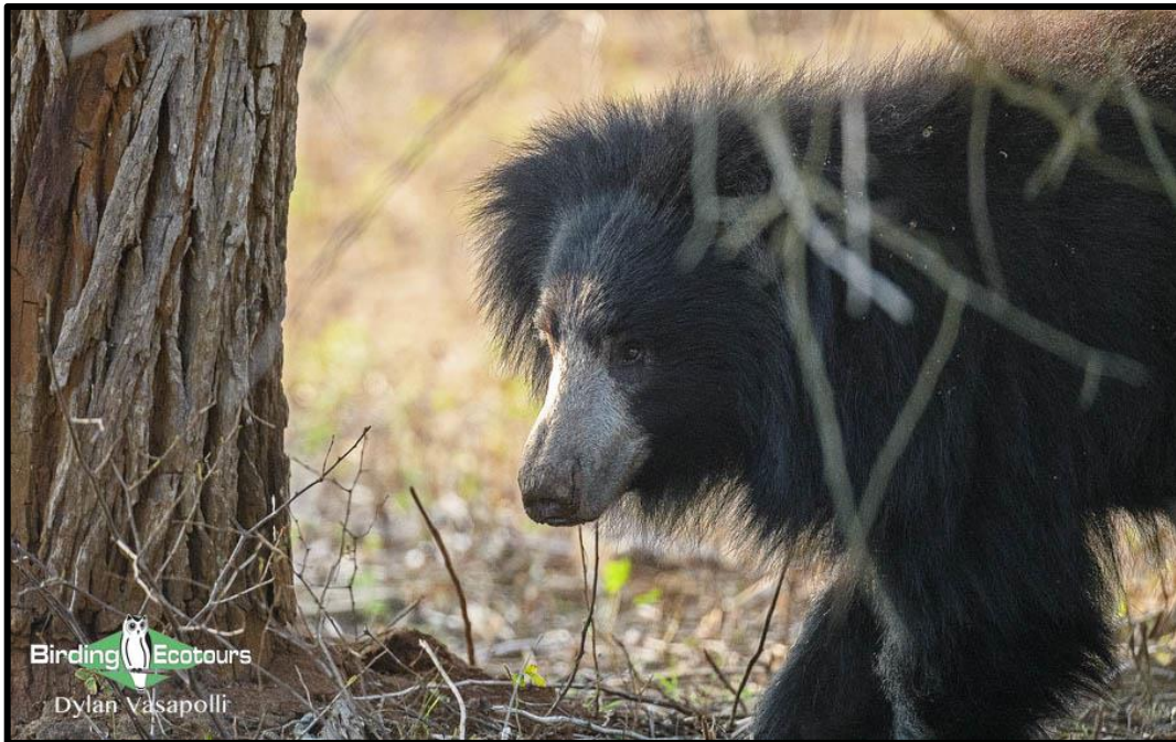
Mammals like this Sloth Bear were a welcome addition to the birding.

A detailed daily account can be read below, and the various species lists are located at the end of the report. You can also access our eBird trip report here .