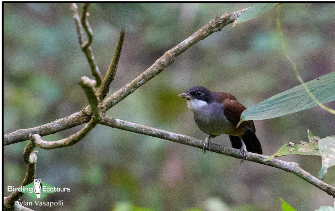
Wayanad Laughingthrush is a shy bird, and the main reason for venturing to Periyar.

Following our excellent success with virtually all of the lowland specials possible around Thattekad, we opted to have the morning off, meeting for a later breakfast before gathering our things and loading up. We had a bit of a drive to get down south to Thekaddy, on the edge of the Periyar Tiger Reserve . We arrived in time for lunch and had a quick rest at our comfortable hotel before meeting for our afternoon excursion into the park.