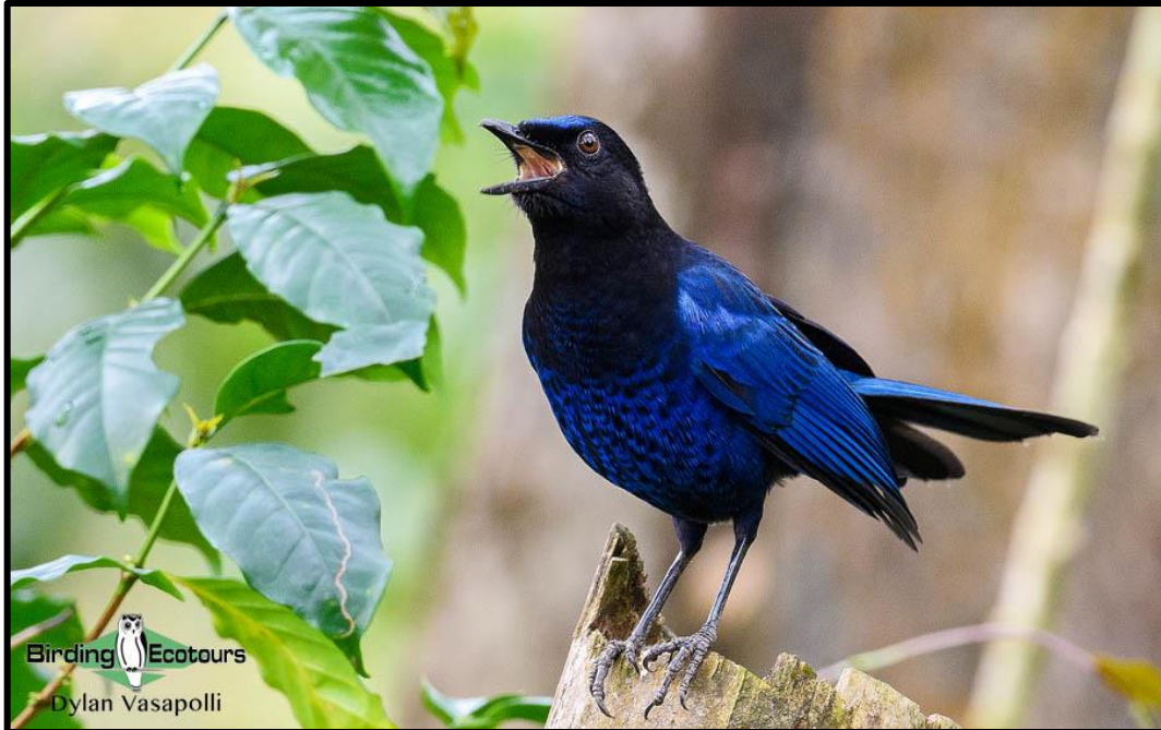
The beautiful Malabar Whistling Thrush is a common species in more montane areas.