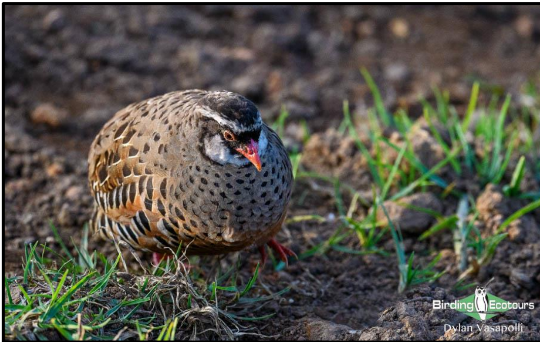
A male Painted Bush Quail strolled right past us near to Ooty.