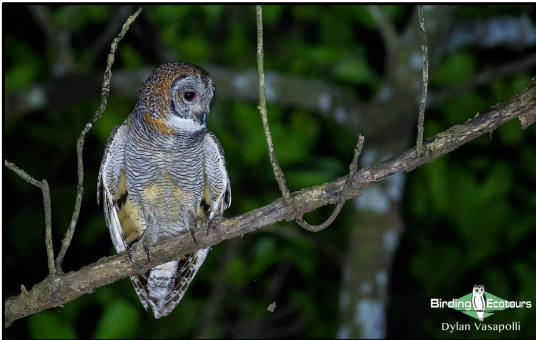
This excellent Mottled Wood Owl sighting rounded off an exciting first day of birding.