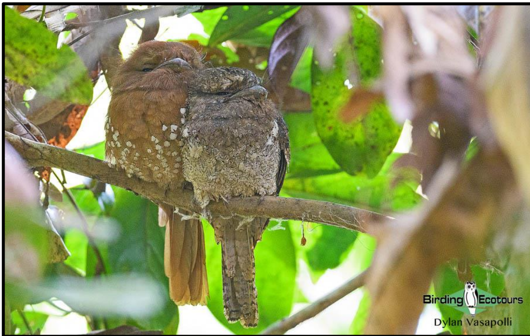
A pair of Sri Lanka Frogmouths perched quietly – these strange birds are a top tour target and showed well to us early on in the tour around Thattekad.

The tour ran mostly smoothly throughout, with logistics flowing well despite several longer transfer days and busy holiday traffic around Republic Day . Even where minor access changes occurred, these were taken in our stride and did not materially affect the birds seen. Importantly, the weather had no negative impact on the birding. While we encountered fog in the highlands and warm conditions in the lowlands, bird activity remained consistently good and allowed us to connect with nearly all of our major targets. The diversity of landscapes and consistency of sightings all combined to make this an exciting and highly successful journey through one of India's most rewarding natural regions.