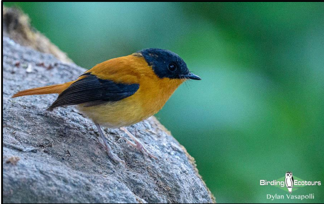
The endemic Black-and-orange Flycatcher is a stunning special of the Western Ghats.

White-cheeked Barbet and some comical Velvet-fronted Nuthatches running on the road right up towards us. With the sun setting, we eventually retired back to our guesthouse, smiling from ear to ear after our superb afternoon!