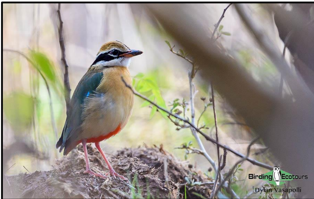
Indian Pittas showed well on several occasions during the trip.

We reconvened in the afternoon for a last walk through the surrounding area. It was hot and sunny when we first got going, and little was out and about, though we did track down a cute pair of Spotted Owlets . We were primarily after the difficult White-naped Woodpecker, and spent time exploring all of their favored haunts, sadly without any success. We did find other woodpeckers like Streak-throated and Brown-capped Pygmy Woodpeckers , and Black-rumped Flameback , but not the one we were after. Thickets in the area also produced a few new birds for us like Spot-breasted Fantail and Asian Koel (both at long last), while several Indian Pittas showed extremely well for us. We were also treated to a flyby from a group of eagles and picked out both Indian Spotted and Greater Spotted Eagles . We retired back to our lodge and settled in for the evening after a good day of birding.