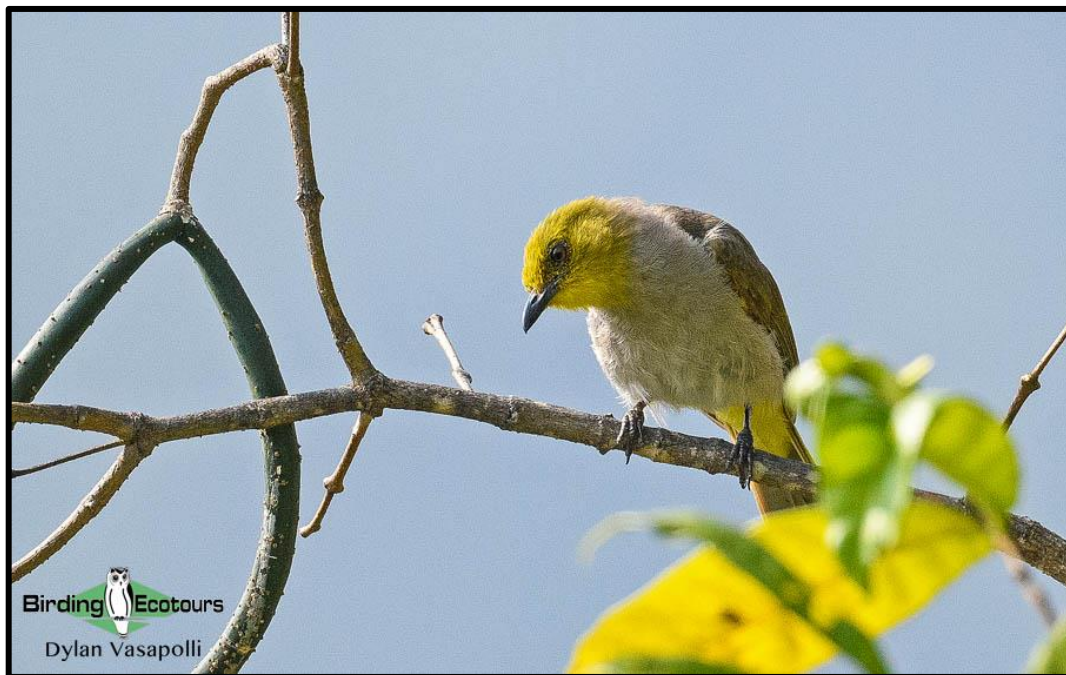
Yellow-throated Bulbul is another target along this routing.

In the afternoon, we found ourselves down in the mixed woodlands in the company of our park ranger, as we set off on our walk through the reserve. Things were a bit quiet early on, as it was still pretty hot, but we enjoyed our first White-rumped Shamas and Tufted Grey Langurs . A calling Grey-headed Bulbul took a while to be coaxed from its thickets but showed well in the end (we had tried earlier on the trip around Thattekad). We also enjoyed repeat views of some of our new birds for today, with excellent Coppersmith Barbets showing well multiple times, along with White-bellied Drongo and Small Minivet . As it started cooling down, the bird activity increased dramatically, and we quickly started adding new birds with the likes of Indian Robin , Common Woodshrike , White-browed Fantail and the stunning Bay-backed Shrike . A fine Black Eagle passed right overhead, and as we made our way into a new area, we quickly added Grey-bellied Cuckoo , Asian Green Bee-eater , comical Yellow-billed Babblers and a Yellow-crowned Woodpecker . Birds were coming in thick and fast, and before we knew it, we were up over 60 species for our afternoon walk. We eventually called it and made our way back to our hotel. We were distracted by many Indian Peafowls crossing the road, along with a massive Gaur .