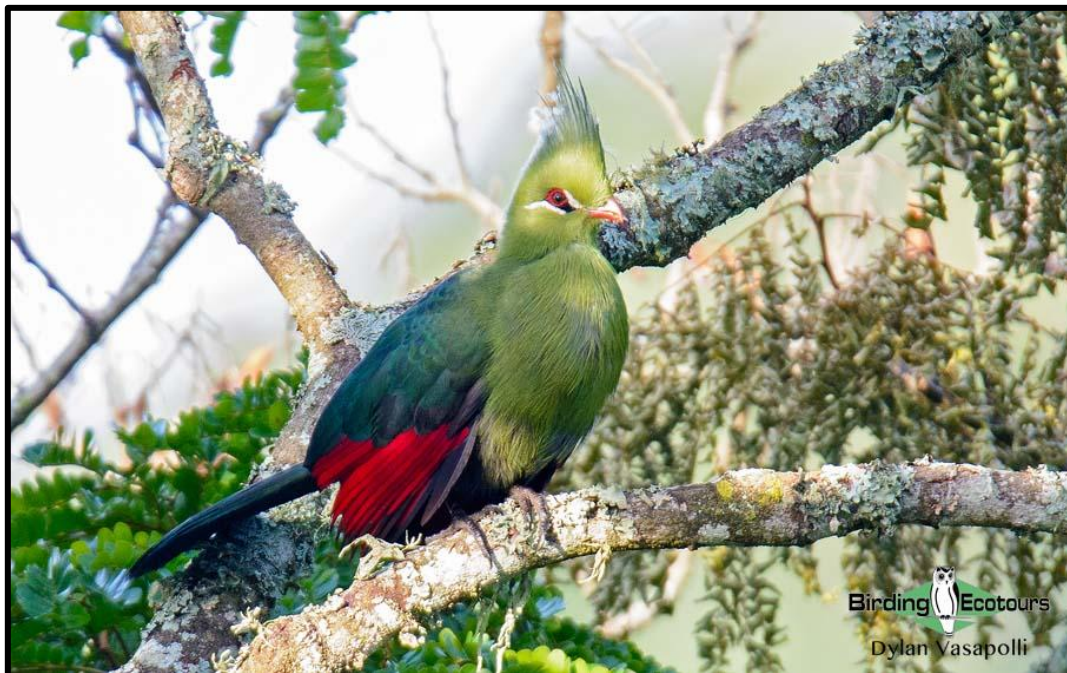
Livingstone's Turaco is one of the many iconic specials we will search for in St Lucia.