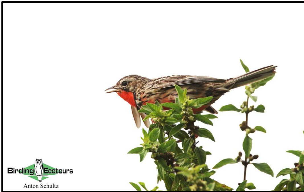
Rosy-throated Longclaw is tied to seasonally flooded plains and damp grasslands.