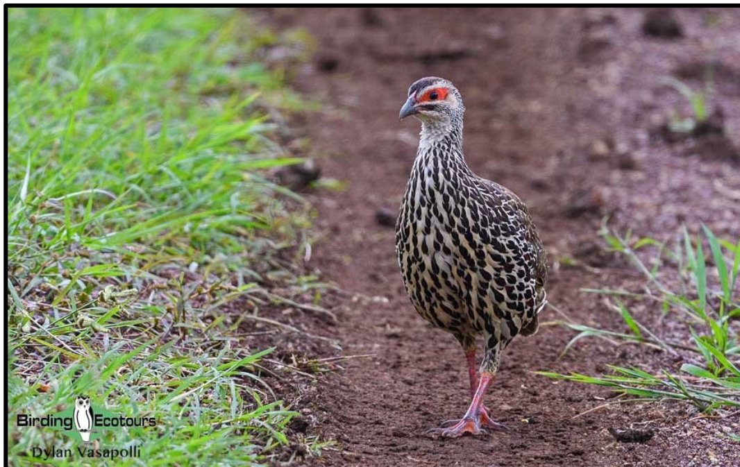
The intricately patterned Clapperton's Spurfowl can be seen at several sites in eastern Uganda.

We have a full day at our disposal to explore Pian Upe Wildlife Reserve in search of our target species. Rocky outcrops in the reserve are likely to yield vocal Stone Partridges , a species of great taxonomic interest, as it is one of only two African members of the New World Quail family (Odontophoridae), the other being Nahan's Partridge, which we will try for later in the trip. We should tally up an impressive day list while exploring the savanna habitats in this reserve, with opportunities for species like Clapperton's Spurfowl, Bruce's Green Pigeon, Fox Kestrel, Black Coucal, Nubian and African Grey Woodpeckers , the splendid Abyssinian Roller, White-headed and Black-billed Barbets, Fan-tailed Raven, Western Black-headed Batis, Northern White-crowned Shrike, White-bellied Tit, Green-backed Eremomela, Pale Prinia, Red-faced Crombec, Flappet Lark, and Chestnut Sparrow , to name a few. We will also get our eye in with a variety of cisticolas, including Croaking, Red-pate, Boran, Rattling, Foxy, Zitting, Black-backed, and Wing-snapping Cisticolas .