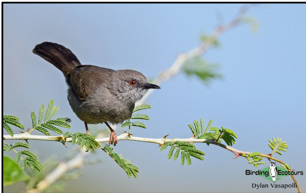
Grey Wren-Warbler is relatively common in northeastern Uganda.

Today will be a long day in the car as we make our way to Kidepo Valley National Park in Uganda's northeastern corner, on the border with South Sudan. Despite the long drive, we hope to squeeze in a substantial amount of birding along the way, especially in the thornveld habitats around Matheniko Reserve. We will have another shot at some of the species mentioned under Day 3, and new additions may include Yellow-necked Spurfowl , White-bellied Bustard , Pygmy Falcon , Abyssinian Scimitarbill , Grey Wren-Warbler , Straw-tailed and Steel-blue Whydahs , Speckle-fronted Weaver , Black-cheeked Waxbill , Parrot-billed Sparrow , Purple Grenadier , and White-bellied Canary . Open areas in this part of the country often support species like Black-headed Lapwing , Heuglin's Wheatear , and White-throated Bee-eater .