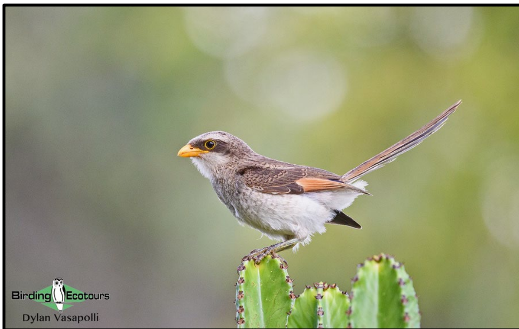
The odd-looking Yellow-billed Shrike can be seen in Kidepo Valley National Park.

We will have two full days to explore this spectacular and seldom-visited national park. First on our agenda will be the sought-after and exceptionally localized Black-breasted Barbet . Kidepo is undoubtedly the best place in the world to see this massive barbet with its giant ivory bill, and we will dedicate a considerable amount of time to finding this bird around the rocky outcrops that it inhabits. Another big target at Kidepo will be the scarce Ring-necked Francolin , which, despite being easy to hear, will require a good dose of patience and luck to see. While driving around the park, we hope to rack up a sizeable species list with birds like Black-billed Wood Dove , Rüppell's Vulture , Crested Francolin , Black-bellied Bustard , Four-banded Sandgrouse , Rose-ringed Parakeet , Eastern Plantain-eater , Mosque Swallow , Red-necked Falcon , Grey Kestrel , Abyssinian Ground Hornbill , Yellow-billed Shrike , Black Scimitarbill , Yellow-bellied Hyliota , the recently split and localized Kidepo Lark , White-fronted Black Chat , and Brown-rumped Bunting , among many others.