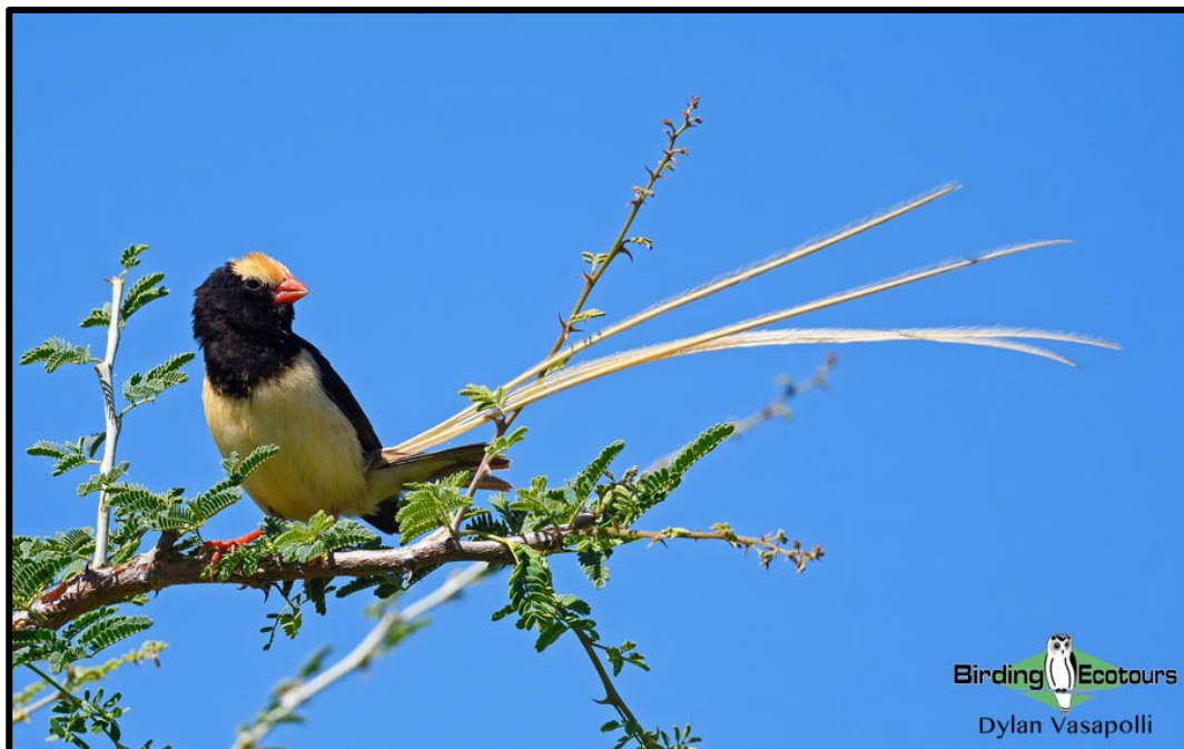
The attractive Straw-tailed Whydah is always a pleasure to see.

After breakfast and perhaps a final early morning birding session at Pian Upe, we will start the drive north towards Mount Moroto. As we make our way north, the landscape becomes ever drier, and the change in habitat brings with it a new suite of birds. We plan to make several roadside stops, and we expect to start seeing arid country species like Jackson's Hornbill , White-bellied Go-away-bird , D'Arnaud's Barbet , Red-fronted Barbet , Northern Red-fronted Tinkerbird , White-headed and White-billed Buffalo Weavers , White-browed Sparrow-Weaver , Marico Sunbird , Eastern Violet-backed Sunbird , Slate-colored Boubou , Three-streaked Tchagra , Rufous Chatterer , Northern Red-billed Hornbill , and African Grey Flycatcher .