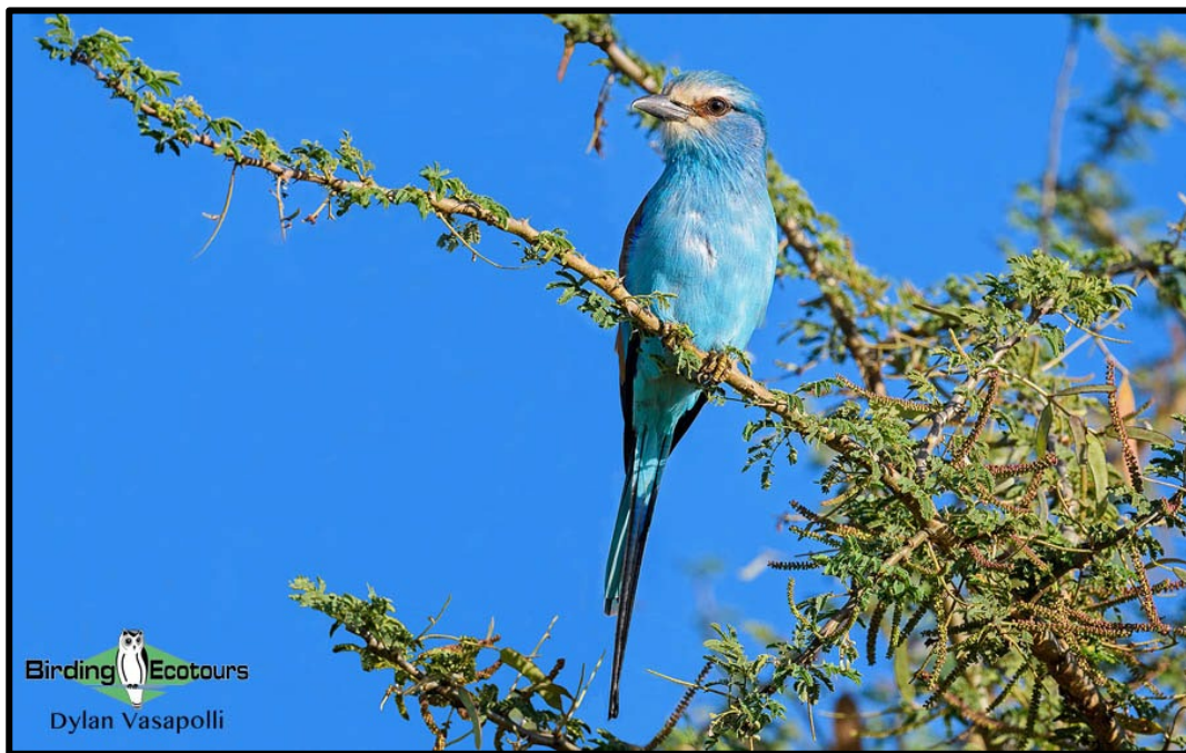
Colorful Abyssinian Rollers are a regular sight on this tour!

This tour follows directly on from our Ultimate Uganda – Shoebill, Albertine Rift Endemics and Great Apes Tour , making it easy to combine the two into one comprehensive Uganda birding adventure.