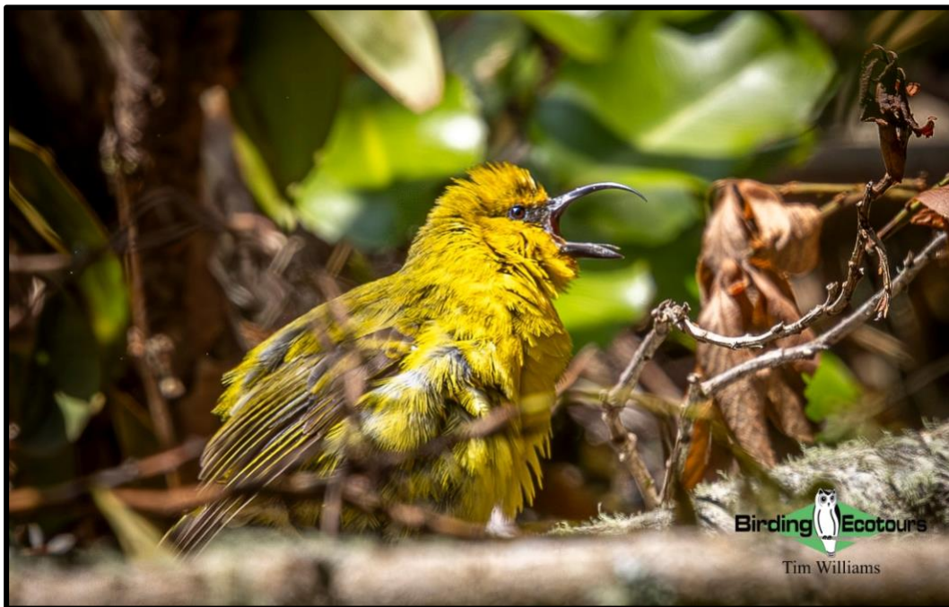
Akiapola'au, the weirdest-billed Hawaiian honeycreeper of all!

This was arguably the best day of this amazing birding tour of Hawaii, with the biggest endemics haul of the trip, at the magically beautiful Hakalau Forest. On the way up to this site we found Eurasian Skylark , Wild Turkey , Kalij Pheasant , and various other introduced bird species. Once we arrived at Hakalau Forest NWR we slowly but surely found all our targets. These were the gorgeous red and black Iiwi (including ones drinking from giant lobelia flowers shaped perfectly for this species' long, curved bill, which happens to be pink in color), a bright orange male Hawaii Akepa , Hawaii Creeper , the bizarre Akiapolaau (these last three species are all classified as Endangered by the IUCN), Hawaii Amakihi , and an endemic thrush, Omao . We also saw the introduced (from Asia) Red-billed Leiothrix well.