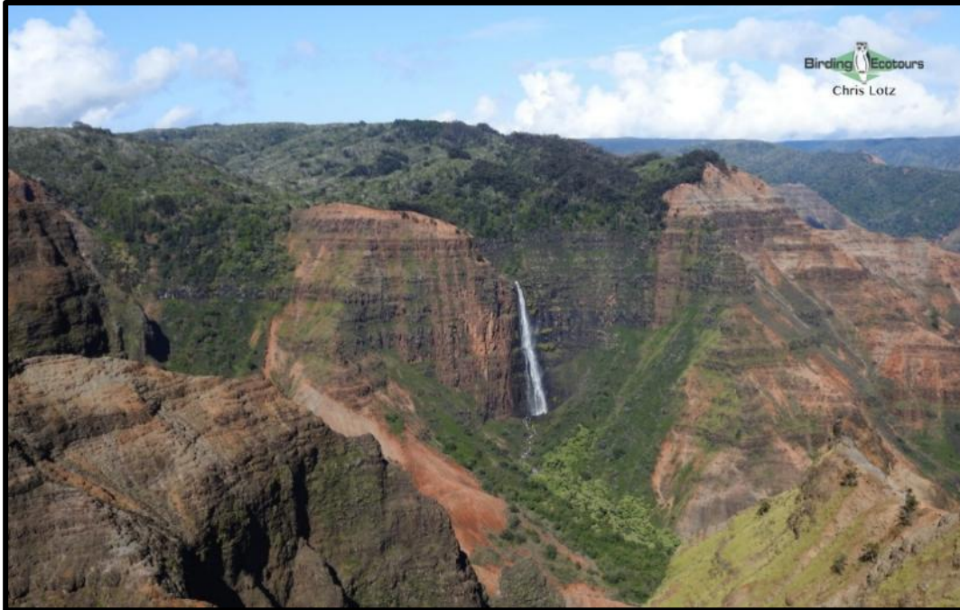
Waipo'o Falls from the Waimea Canyon lookout – we saw White-tailed Tropicbird here.