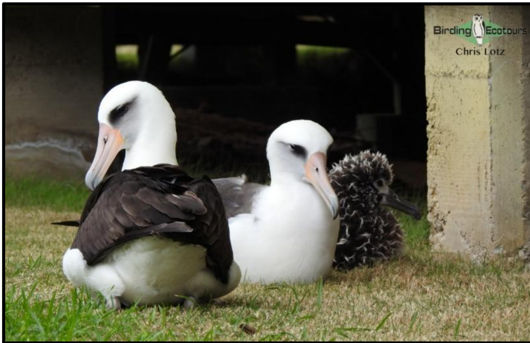
A pair of close-up Laysan Albatrosses with a chick!

The nearby Princeville Makai Golf Course was our next stop and we managed to find three Snow Geese with several Nenes here. In nearby gardens, we admired really close-up Laysan Albatrosses with their cute big chicks!