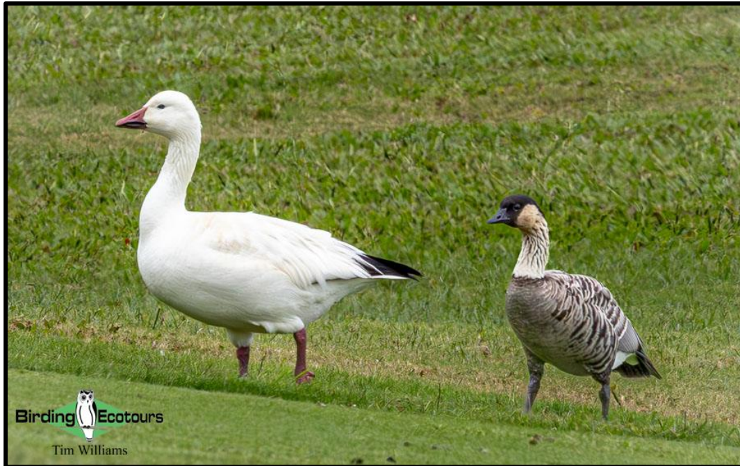
Nene and Snow Goose buddies!