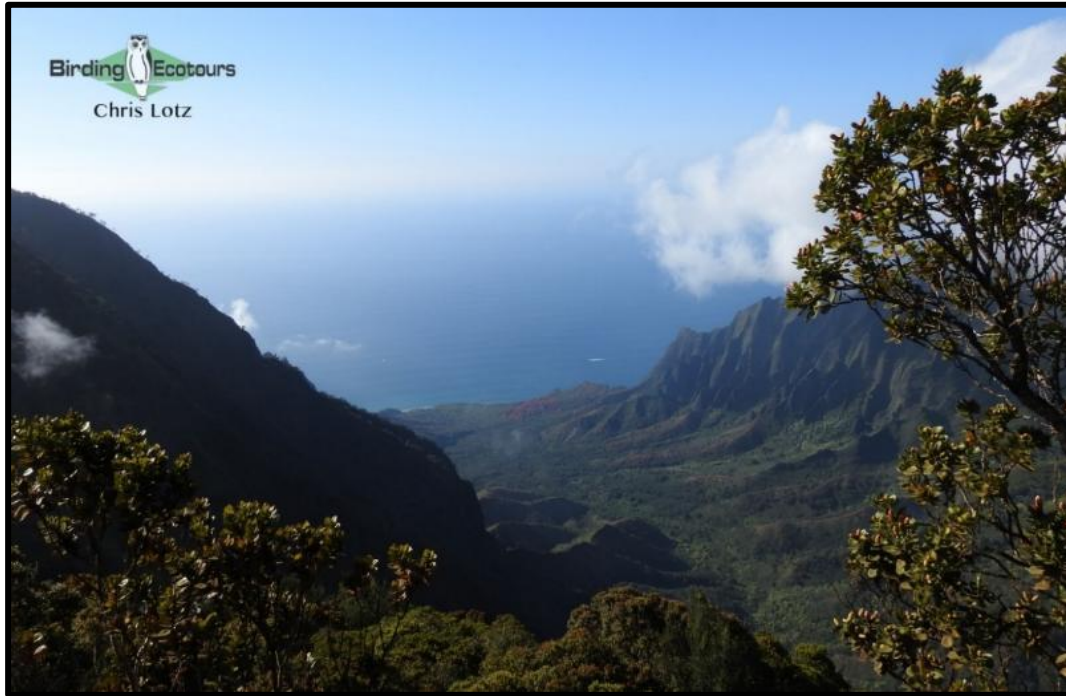
The Kalalau Valley – Apapanes were all around the viewpoint here and Anianiau was below.

Island endemic birds! We also found a number of introduced species, including Japanese Bush Warbler , Erckel's Spurfowl , a great many Warbling (Japanese) White-eyes and various other birds. We heard Chinese Hwamei and White-rumped Shama , birds we'd see very well the next day. By the time we'd finished our birding, the sun had come out and we were able to enjoy spectacular views of the incomparable Kalalau Valley .