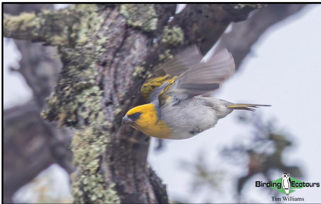
Tim managed to photograph the Palila as it flew (it landed in a tree closer to us!).

After a celebratory picnic lunch (although it's bittersweet to see one of the world's rarest birds that might go extinct soon), we headed back towards Kona looking for various birds, the main target being Hawaiian Hawk (Io), but didn't have success, yet.