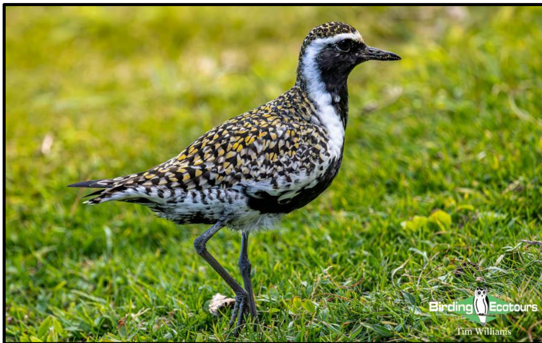
Confiding Pacific Golden Plovers, some in breeding plumage, were all over the place.

This was our official arrival day in Kauai, and we had time to bird the hotel grounds in the afternoon. Here, we enjoyed seeing close-up Pacific Golden-Plovers , some in splendid full breeding plumage, some in non-breeding plumage, and some inbetween, in various stages of molt. There were many Chestnut Munias , Western Cattle Egrets , Zebra Doves , Warbling White-eyes and Red-crested Cardinals around, and a couple of Brown Boobies flew past.