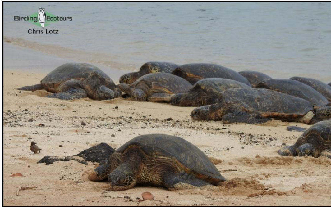
Green Sea Turtles at Poipu Beach Park. There was a Hawaiian Monk Seal here as well.

We ended the day with a seawatch at Makahuena Point to enjoy closer views of seabirds such as boobies and Wedge-tailed Shearwaters . A close-up Humpback Whale and some Pantropical Spotted Dolphins added to the excitement – wow!