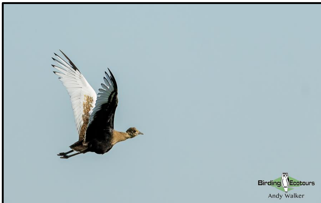
Another major target in Cambodia, the Critically Endangered Bengal Florican

We ended the day with some early evening birding before dinner, seeing an Eastern Barn Owl and hearing a couple of Savanna Nightjars .