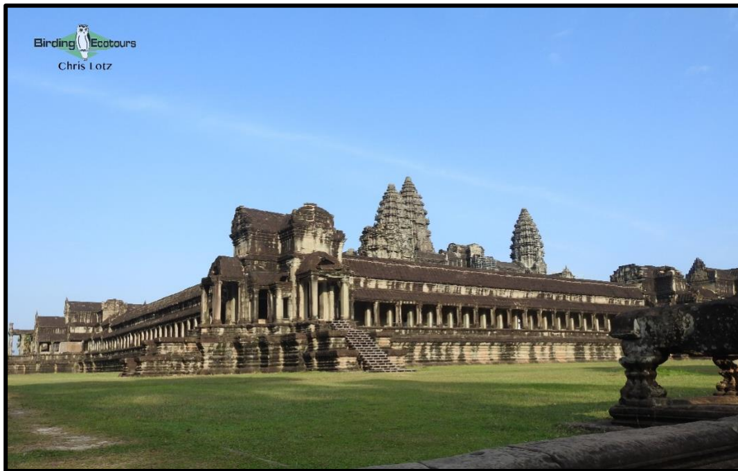
The forest around the impressive Angkor Wat temple complex is great for birding

In addition to the birds we saw today, there were also some good mammals around: Cambodian Striped Squirrel , Finlayson's Squirrel , Northern Pig-tailed Macaque , and Long-tailed Macaque .