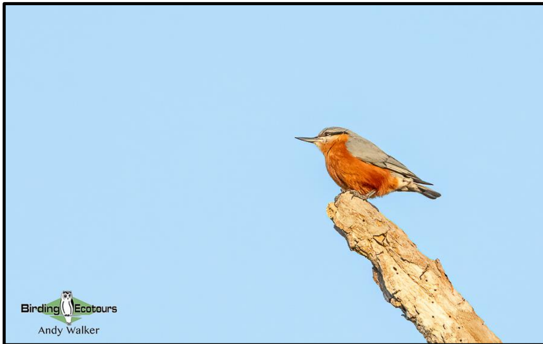
The attractive and personality-filled Burmese Nuthatch is quite easy to find here.

We then drove to the mighty Mekong River , where we stayed at a hotel overlooking the river, greatly anticipating the next day.