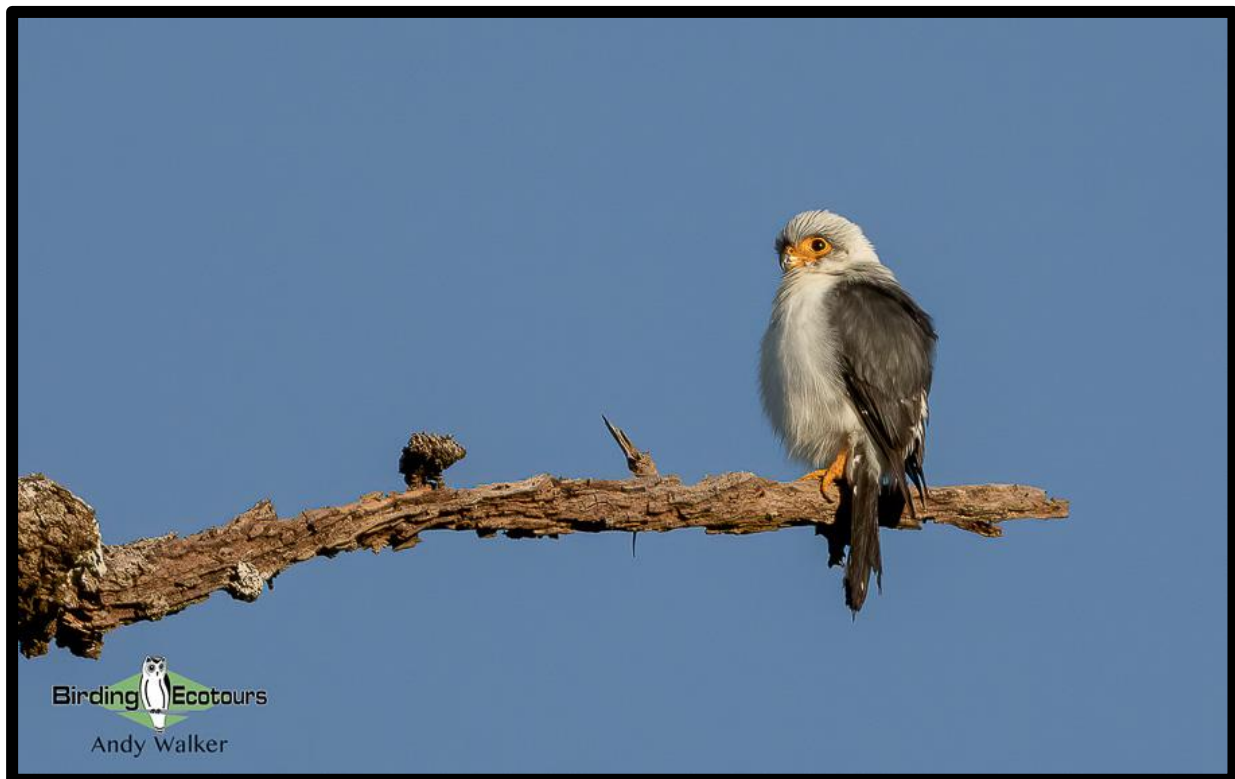
White-rumped Falcon, one of the major targets of any Cambodia birding tour.