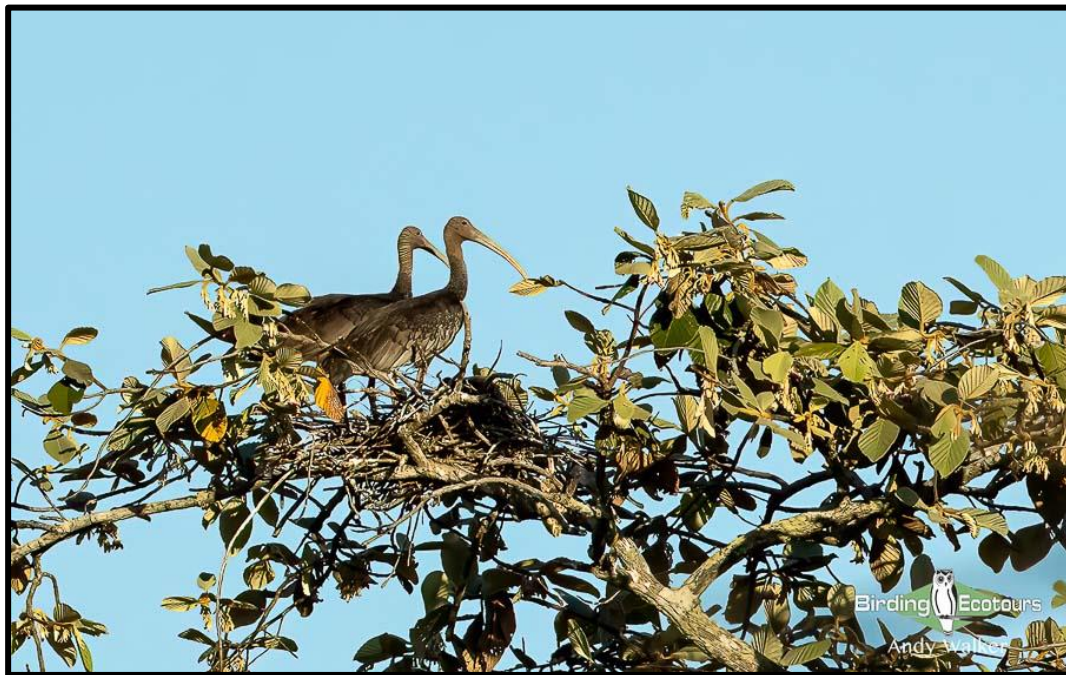
Giant Ibis is one of six Critically Endangered bird species we saw on this tour.

We then checked into our very comfortable hotel (where we started the trip a week ago) for 24 hours of relaxing before our flight to Vietnam to start our set departure tour there.