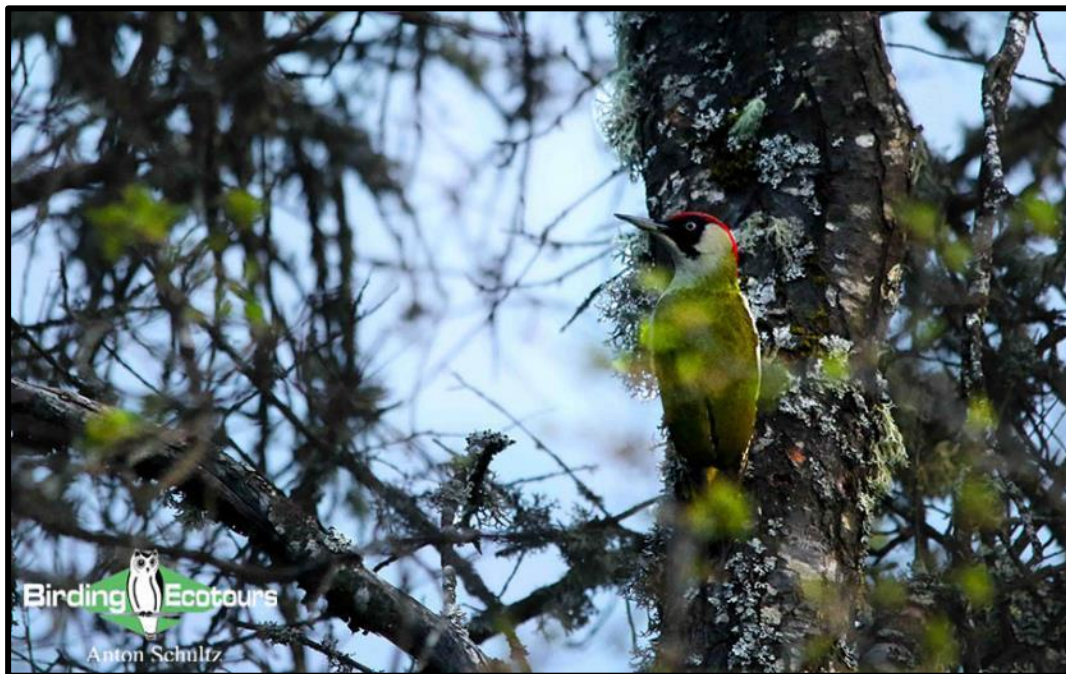
European Green Woodpecker is widespread in Europe but nonetheless tricky at times.

A bit later we made another memorable stop where; after investing a considerable amount of energy and patience, we finally connected with a European Green Woodpecker . While certainly not an especially rare species in these parts, they can be remarkably elusive, and this individual proved no exception. Out along the nearby beach we paused to enjoy the coastal scenery, where several Gull-billed Terns made graceful flybys over the shoreline to round off the stop nicely.