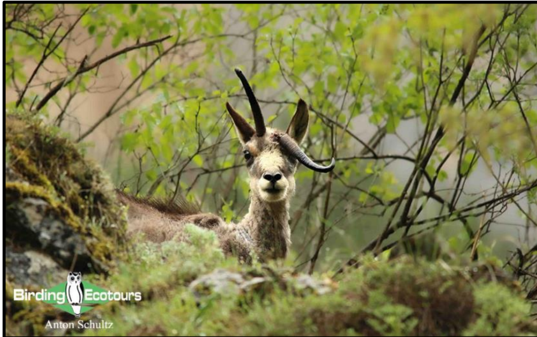
This Northern Chamois looked like it was going through its emo phase with that broken horn.

After a quick breakfast, we slowly made our way out through yet another spectacular river gorge as we departed the high mountains and began our journey toward the Eastern Rhodopes. Along the way we encountered a particularly unusual-looking Northern Chamois , while the riversides once again produced several White-throated Dippers among the rushing mountain streams.