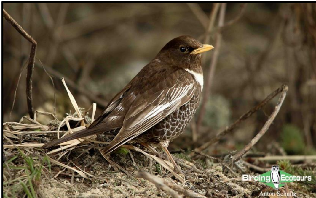
The handsome Ring Ouzel is a fairly common denizen on top of Vitosha Mountain.

As we descended, the pine specialists gradually gave way to a suite of widespread but still delightful oak forest species. Coal Tit and Song Thrush featured prominently, accompanying us back down the slopes. Eventually, however, we had to turn our attention toward reaching our accommodation in Osina before nightfall.