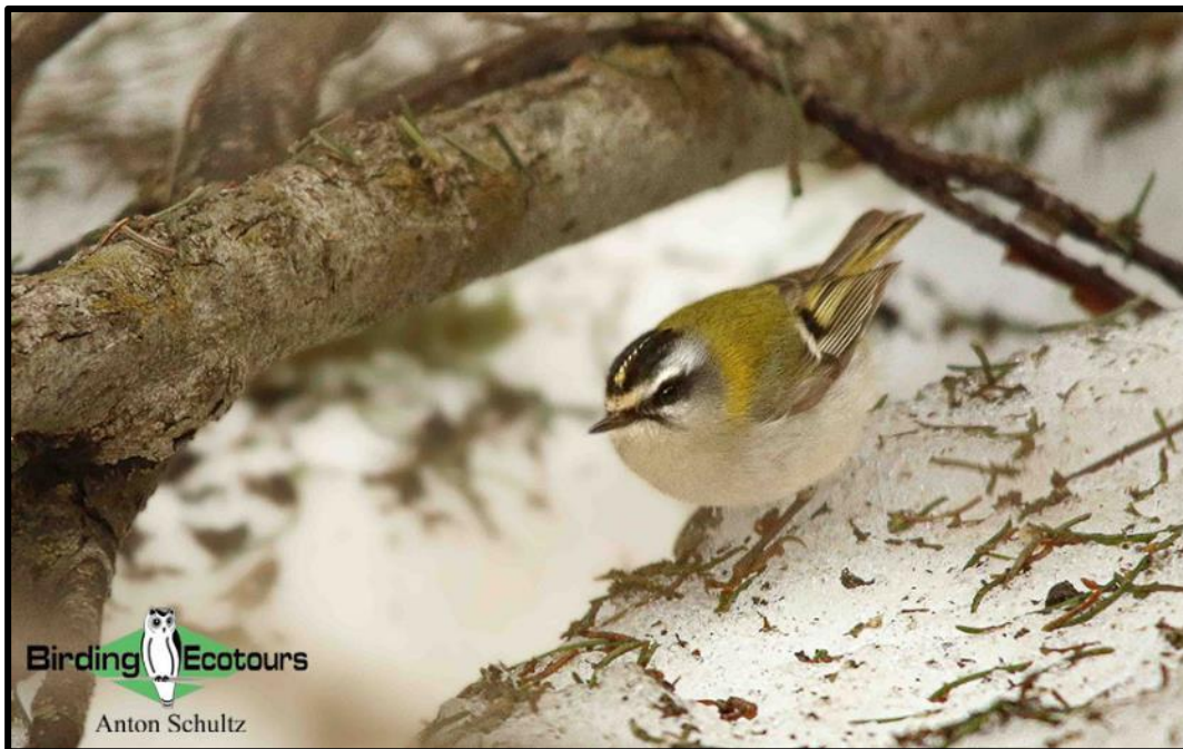
The minuscule Common Firecrest was seen foraging in snow before the summer melt.

Into the Eastern Rhodopes, we focused on the incredible raptors and the impressive assortment of migratory warblers of the region. Highlights included Griffon , Egyptian and Cinereous Vulture (and the incredible group of people trying to save them), Eurasian Scops Owl , Blue Rock Thrush , Rock Bunting , Western Rock Nuthatch , Sombre Tit , Chukar Partridge , Eastern Subalpine , Eastern Orphean , Sardinian , Barred and Olive-tree Warblers .