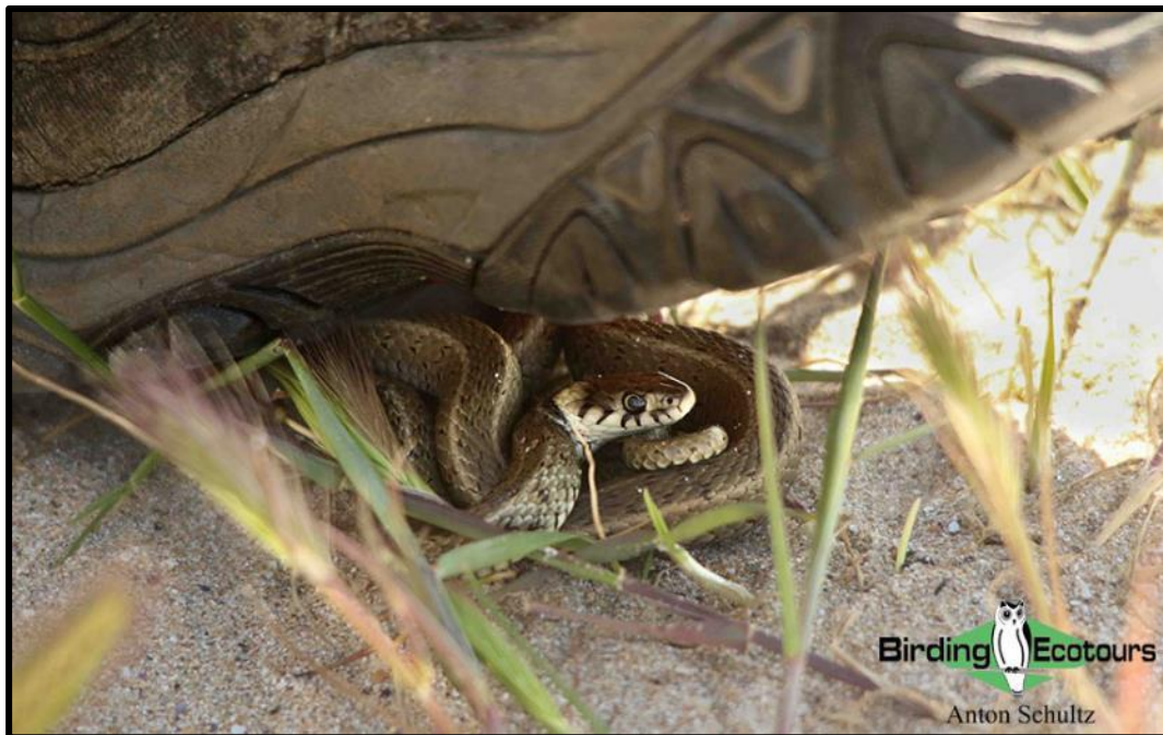
This European Grass Snake thought the underside of Mike's foot was the best place to seek shelter, luckily Mike was understanding of its plight.

We spent the full day birding a variety of sites across north-eastern Bulgaria, beginning at the legendary Durankulak Lake area where the birding was exceptional despite strong winds throughout the morning. Highlights came thick and fast and included Ferruginous Duck (pew), Dalmatian Pelican , Glossy Ibis , Black-necked Grebe , Common Ringed Plover , Little Ringed Plover , Curlew Sandpiper , Collared Pratincole , Black Tern , White-winged Tern , Red-footed Falcon , Sand Martin , Common Redstart , Common Linnet , and Ortolan Bunting . Another unusual encounter here was a European Grass Snake which sought shade shelter in the strangest of places.